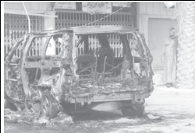
Iraqis gather at the scene of a suicide car bomb which detonated near a passing police patrol in the Zaafaraniyah District of southern Baghdad, on 15 June, 2005.