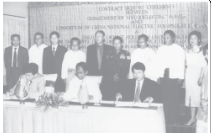
An official of Hydro-electric Power Department (centre) signs a contract with officials of Chinese consortium at the Ministry of Electric Power. MNA

(South). Three 18-megawatt generators will be installed at the project and it is expected that the hydel power station will produce an average of 472 million kwh a year. On completion, the hydel-power station will supply electricity to the townships in Loilem and Langkho districts in Shan State (South). Moreover, it will send surplus electricity to other areas via national grid. MNA