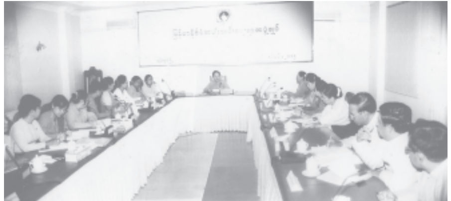
Work coordination meeting on holding of Myanmar Women's Day in progress at Myanmar Women's Affairs Federation on Thanlwin Road in Bahan Township.

YANGON, 16 June— The coordination meeting of the working committee for holding Myanmar Women's Day which falls on 3 July, 2005 was held at the meeting hall of Myanmar Women's Affairs Federation at Thanlwin road, Bahan