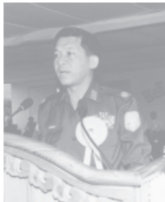
Commander Brig-Gen Min Aung Hlaing.