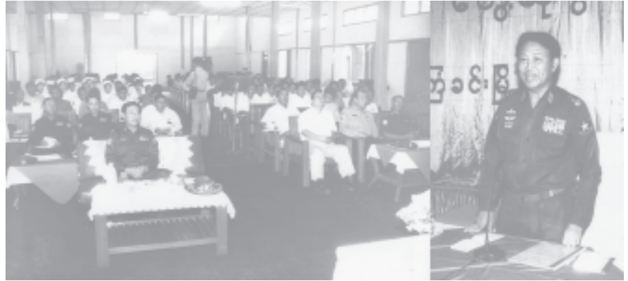
Lt-Gen Khin Maung Than meets with departmental personnel in Kyangin.

In Kyangin, Lt-Gen Khin Maung Than met with township level departmental officials and heard reports on progress in agriculture, education and health sectors in the township. Speaking on the occasion, he said that Kyangin Township has food sufficiency and good business. To make more progress, it is necessary to extend agriculture and livestock breeding and to grow suitable crops out of 10 main crops, three new items of crop and three species of perennial crops