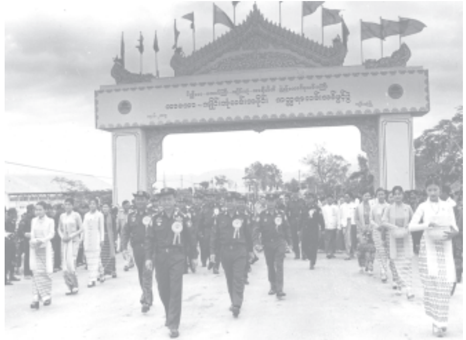
Secretary-1 Lt-Gen Thein Sein and party inspect Tarkaw-Kengtung Road Section.

As a result of building the road section from Meiktila to Kengtung, over 900,000 local people can travel from their regions to the mainland any time. Therefore, the road will contribute to development