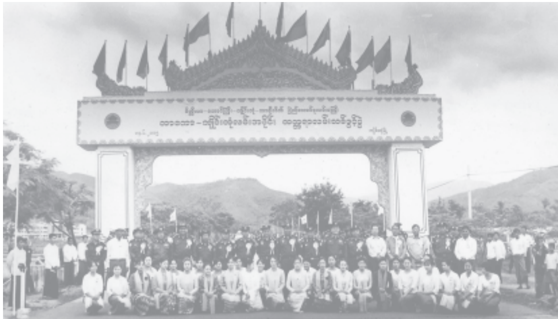
Secretary-1 Lt-Gen Thein Sein and party pose for documentary photo at the opening ceremony of Tarkaw-Kengtung Road section of Meiktila-Taunggyi-Kengtung-Tachilek Union Highway.

Minister for Construction Maj-Gen Saw Tun explained matters related to Tarkaw-Kengtung road section. He said that according to the directives of the State Peace and Development Council, the Ministry of Construction carries out construction of new roads, maintenance and upgrading of existing ones, building of new bridges and maintenance of the existing ones, for (See page 9)