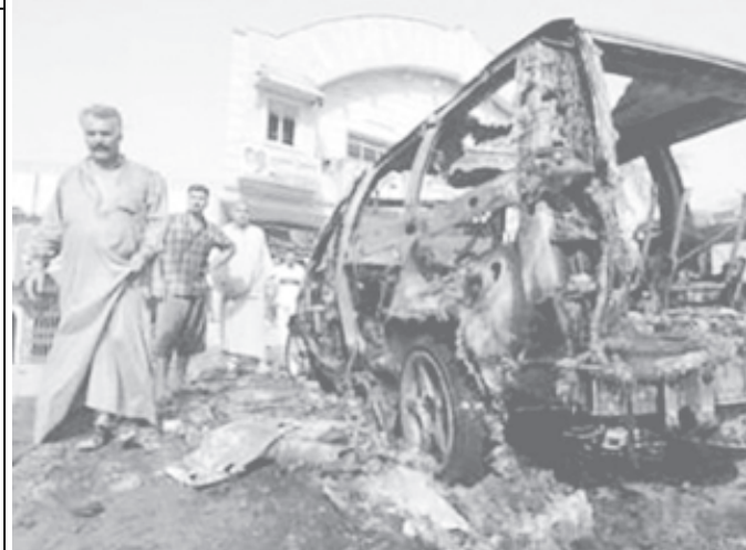
An Iraqi walks past a vehicle destroyed by a car bomb attack in Baghdad, on 15 June, 2005.