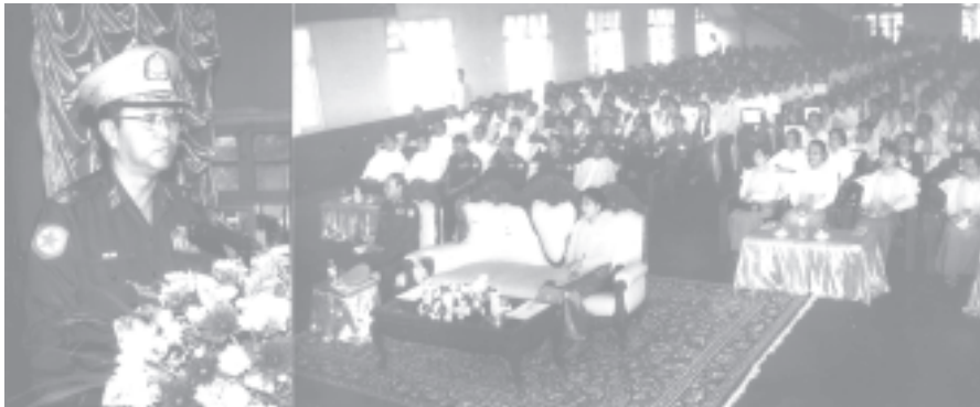
Commander Maj-Gen Myint Swe speaking at the ceremony to launch Mass Campaign on prevention and control of dengue haemorrhagic fever.

YANGON, 16 June — In an effort to control the dengue haemorrhagic fever, Yangon Health Committee and Yangon Division Maternal and Child Welfare Association launched today Mass Campaign on prevention and control of dengue haemorrhagic fever (DHF).