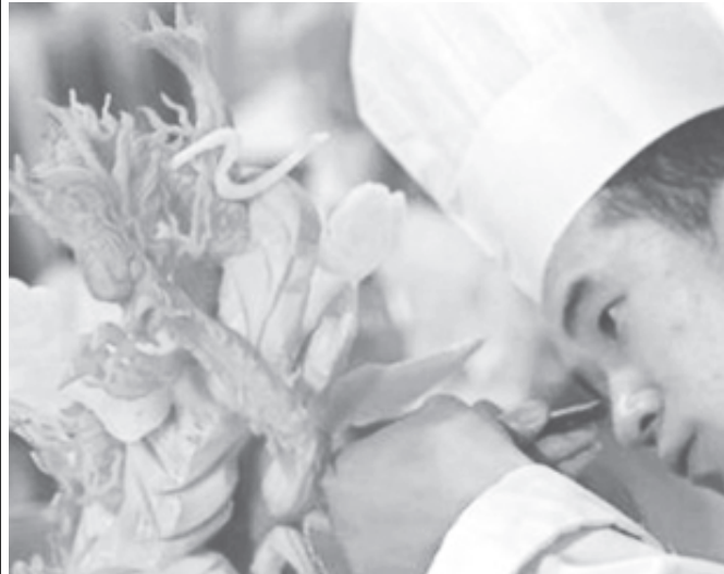
A Chinese chef carves a dragon design made of pumpkin, carrot and radish during a national hotel food sculpture competition at the China International Hospitality Industry Expo 2005 in Beijing on 15 June, 2005.