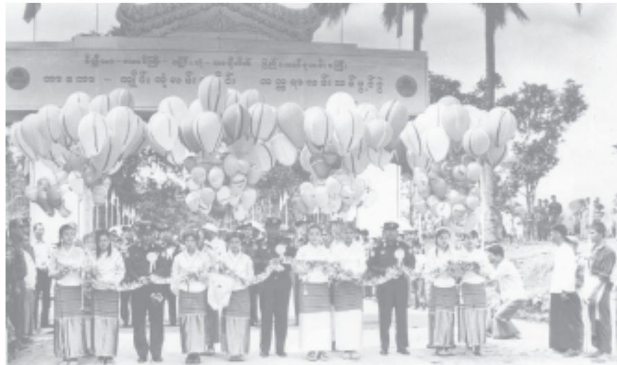
Lt-Gen Aung Htwe, Commander Brig-Gen Min Aung Hlaing and Minister for Construction Maj-Gen Saw Tun formally open Tarkaw-Kengtung Road (Tarkaw Section).

areas. In the past, vehicles took 15 to 30 days to reach the destination due to difficulties and dangers. Sometimes, the road was