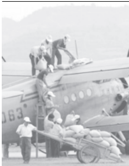
Chinese workers load bags of tree seeds onto a plane that will conduct air seeding at Lushi, central China's Henan Province, on 16 June, 2005.