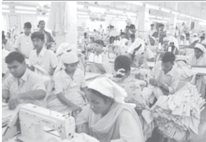
Workers sew at a garment factory in Gazipur near the Bangladeshi capital Dhaka on 15 June, 2005. — INTERNET

Currently, five weekly cargo flights shuttle between the two cities. The flights are made by Boeing 737s with a departure at 4:35 pm from Shanghai and an arrival at 6:55 pm at Hong Kong International Airport. The same planes leave Hong Kong for Shanghai at 8:25 pm.— MNA/Xinhua