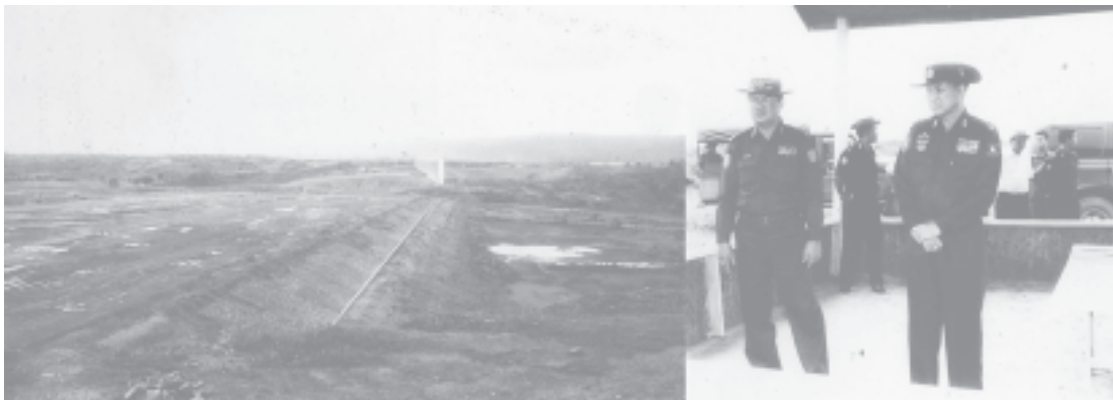
Lt-Gen Khin Maung Than inspects construction of Ma Mya Dam Project in Myanaung Township.