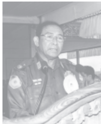
Minister for Construction Maj-Gen Saw Tun.

Tarkaw-Kengtung road section lies 79 miles in Mongpyin Township and 35 miles in Kengtung Township.