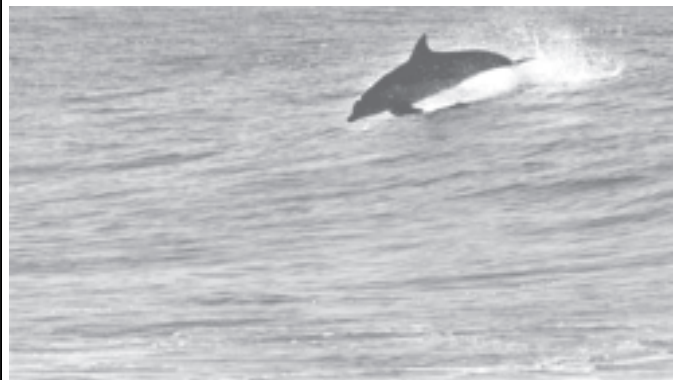
A dolphin is airborne as it dives out of a wave as a surfer paddles by in the foreground at Crescent Head on the New South Wales mid-north coast of Australia, on 16 June, 2005. Surfers and dolphins were enjoying perfect winter conditions at the famous surf point.—INTERNET

Annan also affirmed to continue to plea for rich countries' pledge in favour of an increased aid, debt relief and market opening, referring to the G-8 summit to start next month in Scotland and the UN summit in September in New York. The two meetings are expected to decide new measures to finance the poor countries' development. —MNA/Xinhua