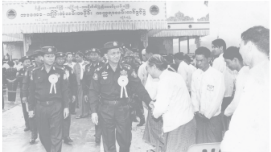
Secretary-1 Lt-Gen Thein Sein cordially greets local people attending the opening ceremony of Tarkaw-Kengtung section of Meiktila-Taunggyi-Kengtung-Tachilek Union Highway.—MNA

At the same time, the government has been establishing such socio-economic foundations as