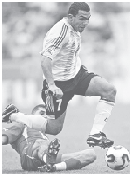
Argentina's forward Carlos Tevez (R) beats the tackle of a Tunisian defender during their Confederations Cup clash in Cologne. Argentina won 2-1.