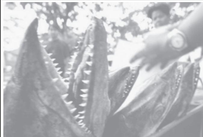
Street vendor selling dried fish in Bangkok on 15 June, 2005. More tourists are learning to navigate the tastes of Thai cuisine with help from chefs who offer increasingly popular cooking holidays for everyone from backpackers to jet setters. — INTERNET

lationship with LCI. The first relevant organization in China is Guangdong Lions Club, which was founded in 2002. Set up in 1917, LCI has a membership of more than 1.4 million in 193 countries around the world. — MNA/Xinhua