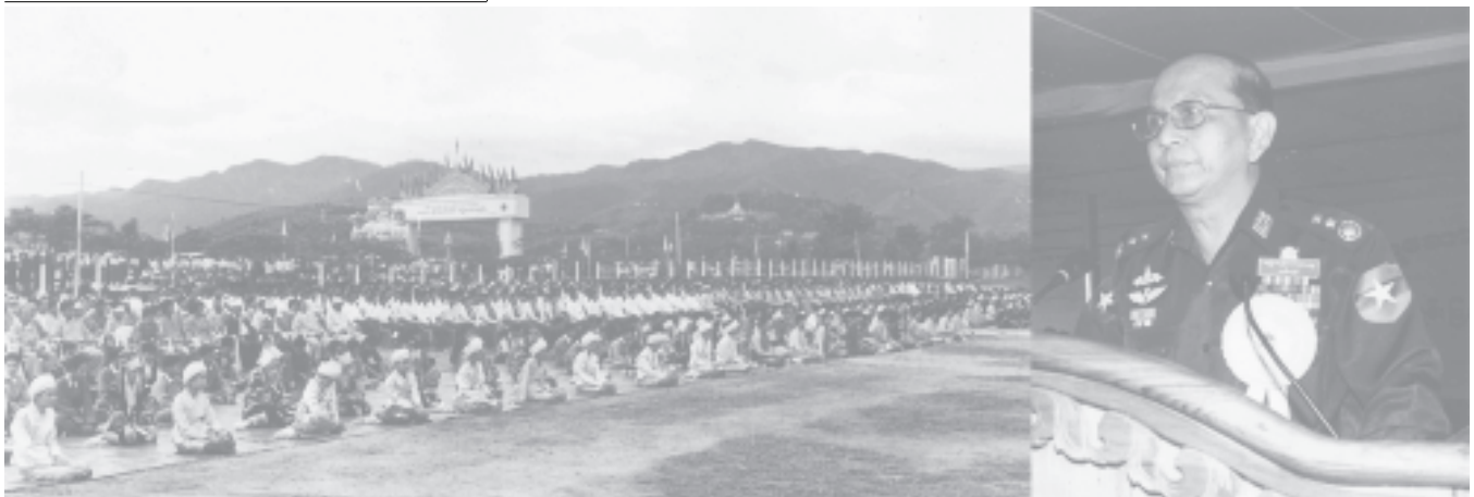
Secretary-1 Lt-Gen Thein Sein makes an address at the opening ceremony of Tarkaw-Kengtung Road Section of Meiktila-Taunggyi-Kengtung-Tachilek Union Highway. — MNA

Emergence of the State Constitution is the duty of all citizens of Myanmar Naing-Ngan.