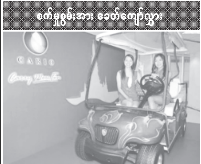
Thai models pose for photographs in Thailand's first electric car 'Cario', produced by Thai Summit Group, during a news conference in Bangkok, on 15 June, 2005.