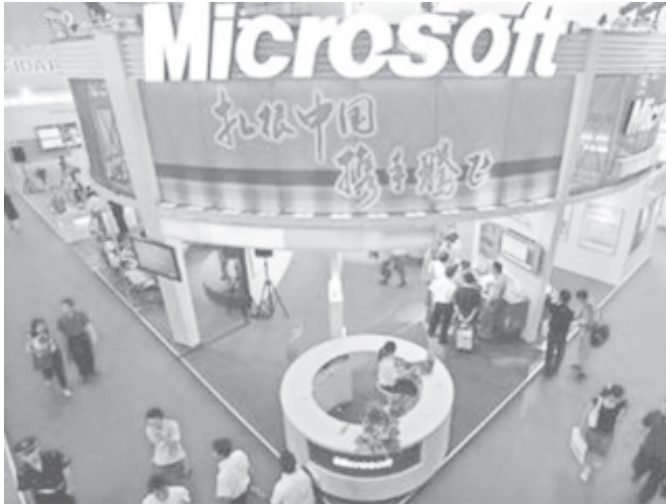
Chinese visitors walk past the Microsoft booth at the China International Software Expo 2005 in Beijing on 15 June, 2005.