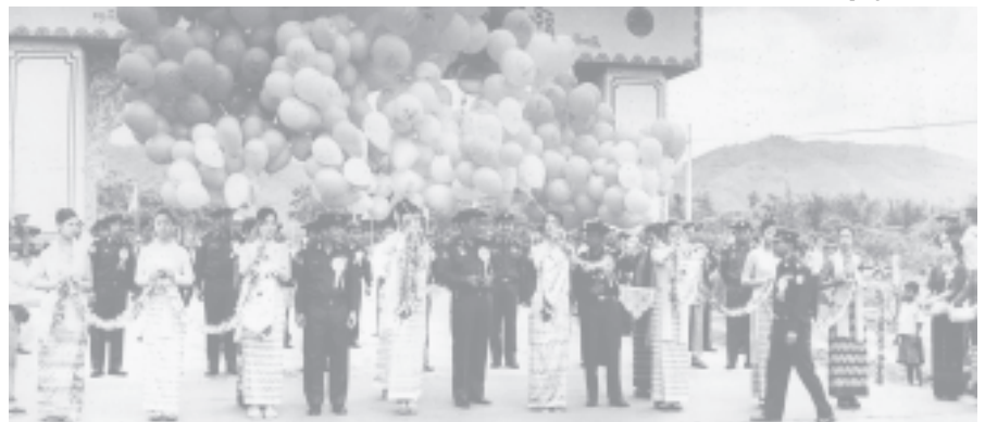
Lt-Gen Aung Htwe, Commander Brig-Gen Min Aung Hlaing and Minister for Construction Maj-Gen Saw Tun cut the ribbon to open Tarkaw-Kengtung Road section of Meiktila-Taunggyi-Kengtung-Tachilek Union Highway.

Thanks to the better transport, about one million of national races such as Shan, Akha, Lahu, Wa, Palaung and Bamar living in Shan State (East) will be able to enjoy fruitful results in greater trade, border trade, and tourism industry as well as education, health and social development.