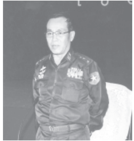
Prime Minister Lt-Gen Soe Win meets with service personnel, USDA members and townselders in Homalin. — MNA

Member of the Panel of Patrons of USDA Prime Minister Lt-Gen Soe Win held