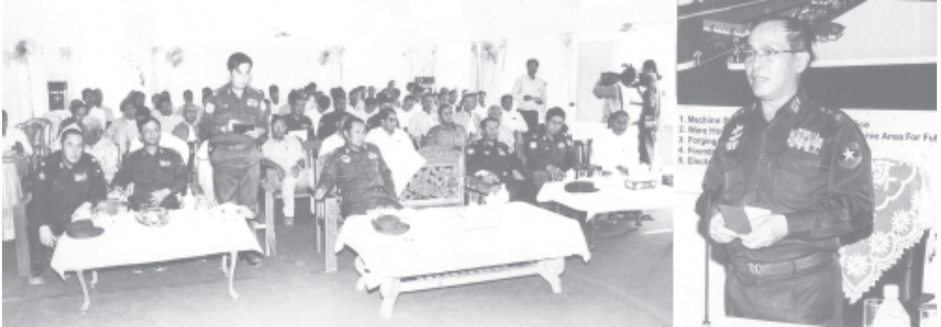
Prime Minister Lt-Gen Soe Win meeting with industrialists and members of supervisory committee of Monywa Industrial Zone. — MNA