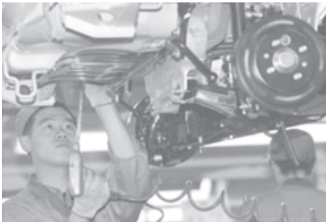
A Chinese worker works at an assembly line for the Lobo automobiles made by Hafei Motor Co at a factory in Harbin, northeastern China recently.