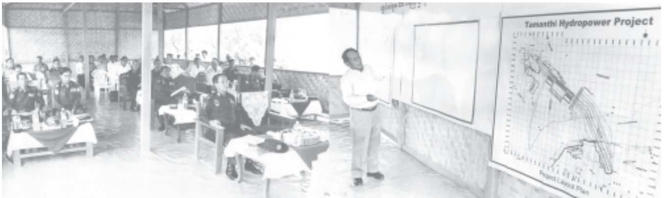
Prime Minister Lt-Gen Soe Win hears report by Deputy Minister U Myo Myint on Htamanthi Hydropower Project.

From now on, they should also train the workers to run the machines skilfully. Arrangements should be made