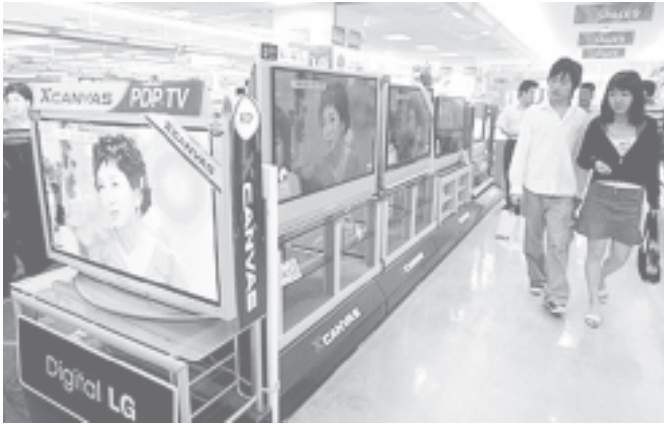
South Korean shoppers look around PDP and LCD TVs at an electronics district in Seoul on 5 June, 2005. South Korea is the world's largest supplier of two most popular types of flat-panel screens — plasma display panels (PDPs) and liquid crystal displays (LCDs).