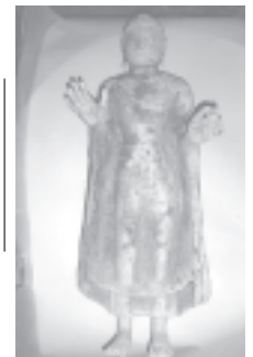
25-inch-high Buddha statue with Civarahattha/Abhaya posture.— CULTURE