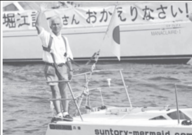
Japan's yachtsman Kenichi Horie waves to Press as he approaches at the final leg of his round-the-world non-stop solo trip on a yacht Suntory-Mermaid off Nishinomiya port, western Japan, on 7 June, 2005.