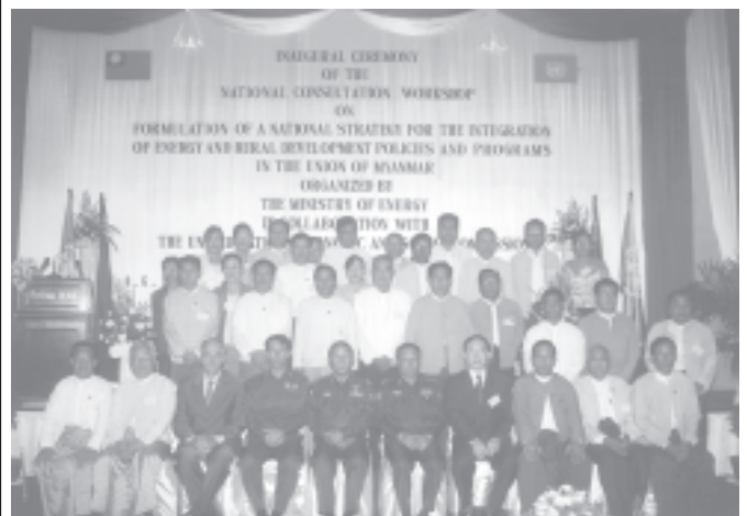
Dignitaries at the workshop pose for a documentary photo.