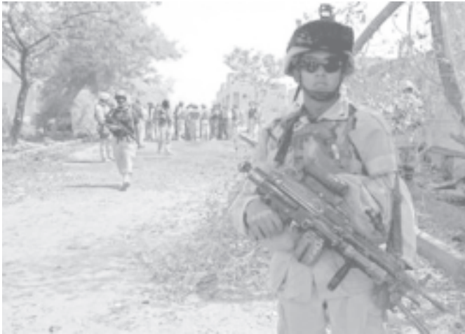
A US soldier stands guard at the scene of a suicide car bomb attack in Baghdad on 7 June, 2005.