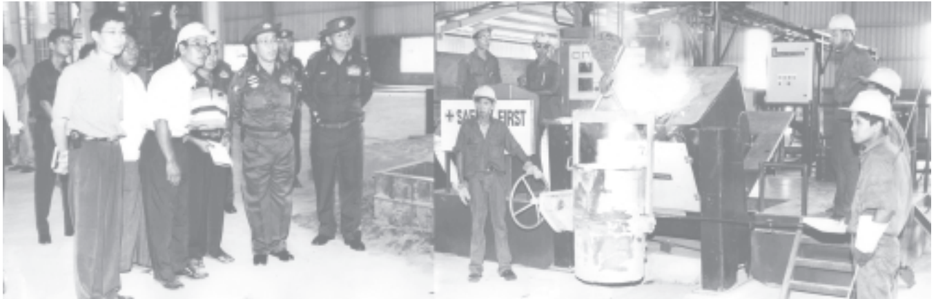
Prime Minister Lt-Gen Soe Win views functions of Foundry Shop-2 at Mandalay Industrial Zone.

Afterwards, the Prime Minister and party (See page 16)