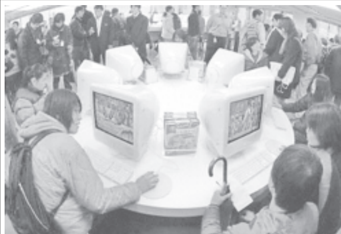
Apple customers try out products at a shop in Tokyo on 8 June, 2005.

About 20,000 HIV-positive were reported in the state whose population stands at 20.8 million.