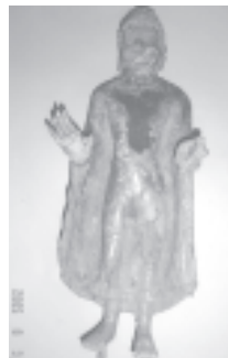
16.5-inch-high Buddha statue with Civarahattha/Abhaya posture.— CULTURE