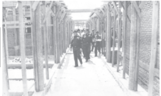
Prime Minister Lt-Gen Soe Win inspects progress of building Homalin People's Hospital (100-bed).