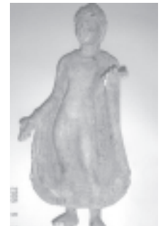
13.5-inch-high Buddha statue with Civarahattha/Varada posture.— CULTURE