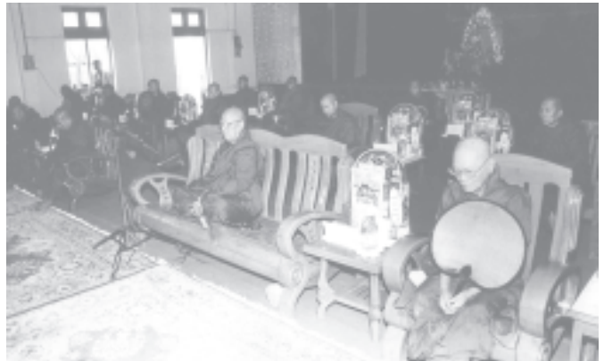
Prime Minister Lt-Gen Soe Win and party share merits gained for offering rice and edible oil to Pariyatti monasteries in Monywa. — MNA

At the briefing hall, the Prime Minister met with officials and industrialists, saying, the Government has already provided necessary assist-