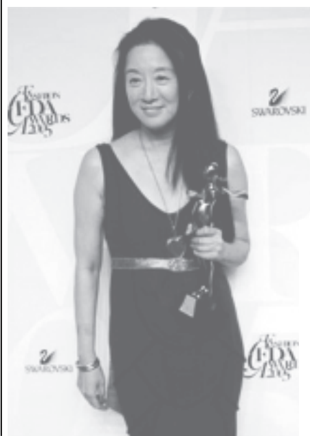
Vera Wang holds the award she received for Womenswear Designer of the Year at the 2005 CFDA Fashion Awards in New York, on 6 June, 2005.