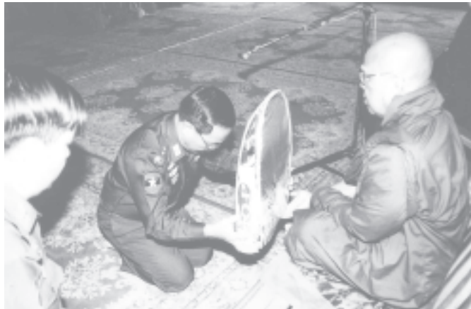
Prime Minister Lt-Gen Soe Win offers alms to Sayadaw Bhaddanta Kavinda.

vate sector. Officials and (see page 10)