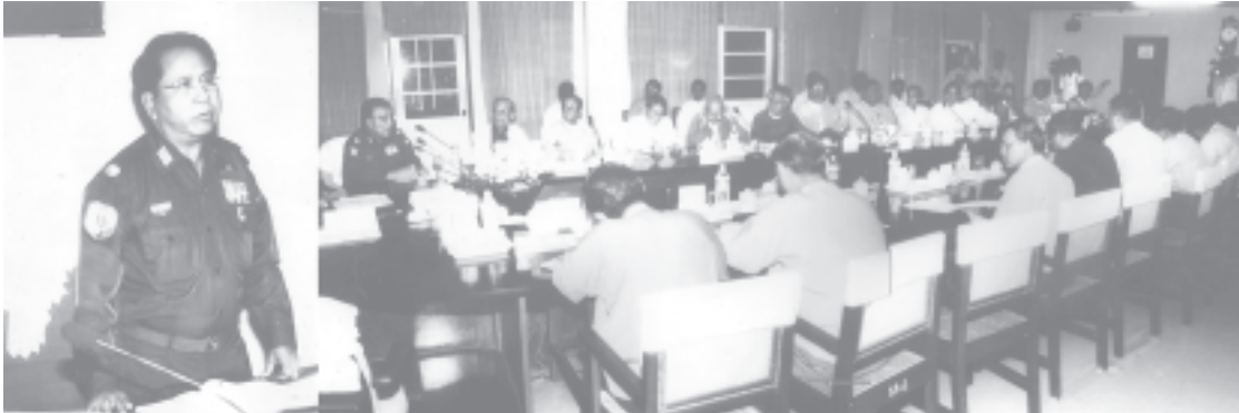
Minister Brig-Gen Kyaw Hsan meets with patrons and members of the newly-reconstituted MMPA. — MNA