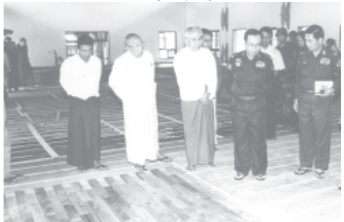
Prime Minister Lt-Gen Soe Win inspects progress in construction of Sasana Beikman in the precinct of Shwezigon Pagoda in Monywa.— MNA

marketable in the world market, locals are needed to cultivate rubber as well as tea in a commercial scale, he urged. He also urged the local people to strive for the development of the State and for upgrading of social standard of national races in cooperation with the government.