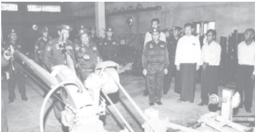
Prime Minister Lt-Gen Soe Win inspects power-tillers at Mandalay Power-tiller factory in Mandalay Industrial Zone.— MNA

be 7,700 ft in length and 348 ft in height and 10 generators will be installed.