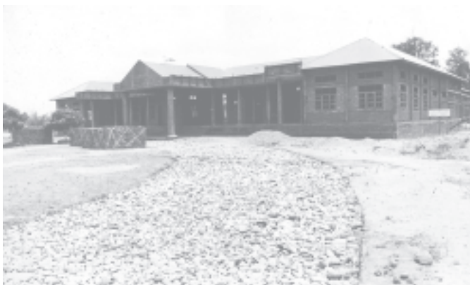
Homalin People's Hospital (100-bed) under construction in Sagaing Division.