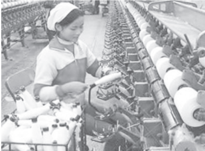
A Chinese worker inspects spools at a textile company in Shangrao, east China's Jiangxi Province recently.