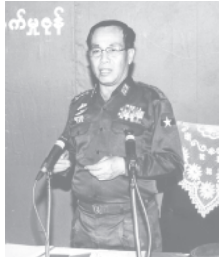
Prime Minister Lt-Gen Soe Win meets with members of Mandalay Industrial Zone Supervisory Committee and industrialists. — MNA

Under the Chindwin River valley development project, there are Htamanthi project, Mawlaik Project and Shwesarye Project which will use Chindwin River water. On completion all projects will produce electricity and they will supply irrigation water.