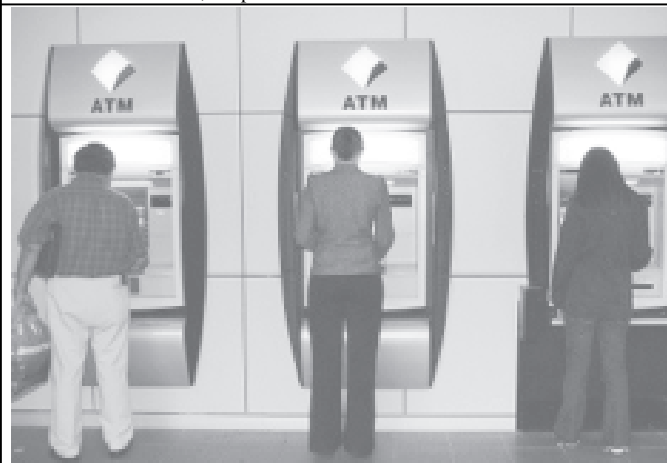
Commonwealth Bank customers in Sydney on 7 June, 2005. The Commonwealth Bank of Australia announced it had received approval to open a representative office in India. — INTERNET