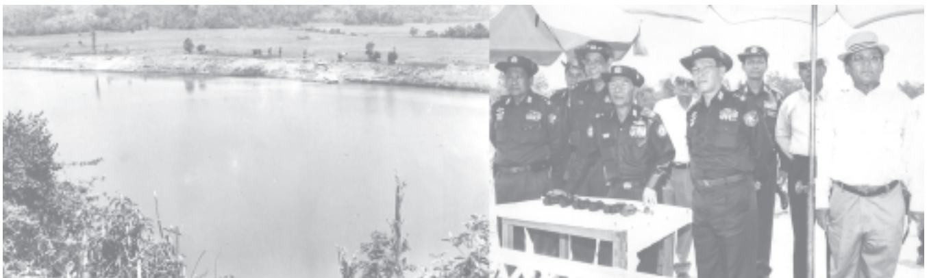
Prime Minister Lt-Gen Soe Win inspects the site chosen for Htamanthi Hydel-power Project near Tazone Village, Homalin Township.