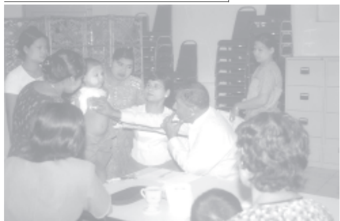
A specialist gives a medical check-up to a child.