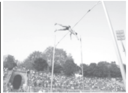
Italy's Giuseppe Gibilisco competes in the Pole-Vault event, during the IAAF Grand Prix meeting, at the Milan Arena, Italy, on 1 June, 2005.

More than 200 delegates from about 20 countries and regions attend the 3-day APR conference themed "confidence building and conflict reduction", which covers various issues on security and cooperation in the Asia-Pacific Region.—MNA/Xinhua