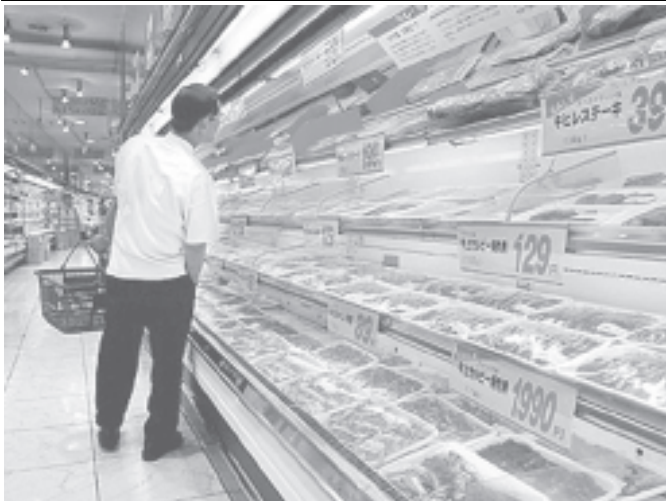
A customer checks packs of beef at a supermarket in Tokyo on 2 June, 2005.