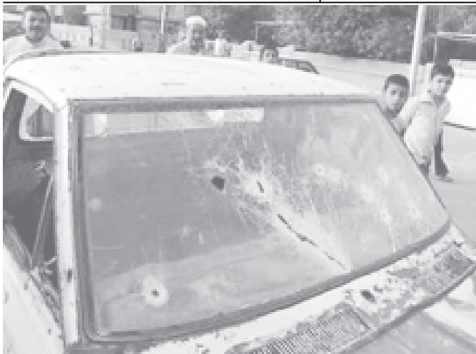
A suicide bomber detonated a car laden with explosives at a checkpoint leading to Baghdad airport on 1 June, 2005. — INTERNET

On the Mainland side, the China Wildlife Conservation Association will be responsible for talks with related authorities in Taiwan. — MNA/Xinhua