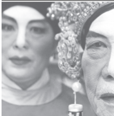
Cantonese Opera performers sporting traditional costumes and make-up in Hong Kong on 1 June, 2005.

Since 1 May, 2003, when President Bush declared that major combat operations in Iraq had ended, 1,529 US military members have died, according to AP's count. That includes at least 1,165 deaths resulting from hostile action, according to the military's numbers.—Internet