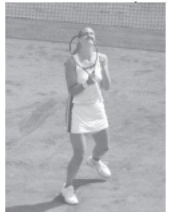
France's Mary Pierce reacts after defeating Russia's Elena Likhovtseva during their semifinal match of the French Open tennis tournament, at the Roland Garros Stadium, on 2 June, 2005 in Paris. Pierce won 6-1, 6-1.

"This is a match where I'd like to have fun," said Nadal, who turns 19 Friday. "I think I might be able to win. At least that's what I'm going to go for."