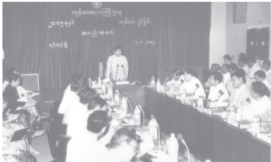
Minister Dr Kyaw Myint delivers a speech at the coordination meeting.

The minister assessed the reports and gave concluding remarks.