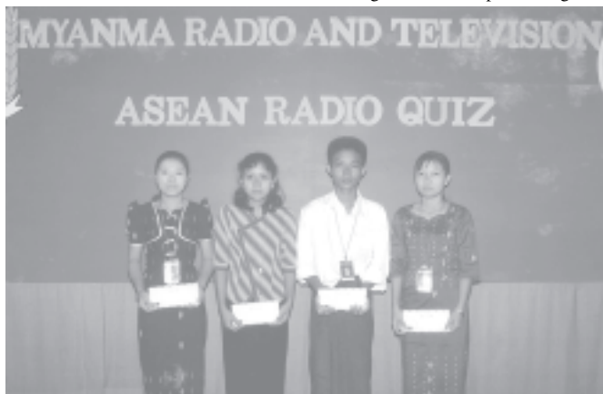
Winners of the ASEAN Radio Quiz for May.