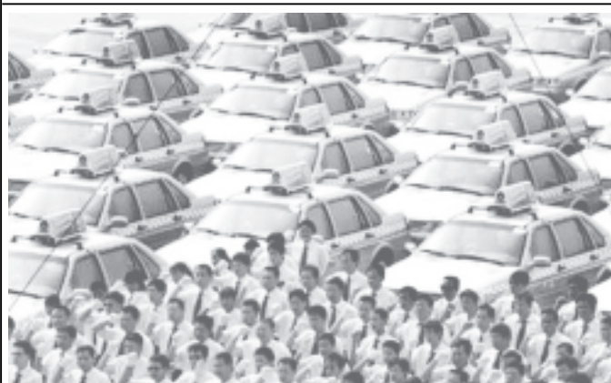
Chinese taxi drivers attend a ceremony putting 200 Volkswagon Santana 3000 cars into use at a taxi company in Nanjing, capital of east China's Jiangsu Province, on 2 June, 2005.