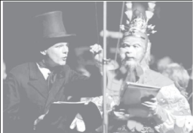
Danish entertainer Sigurd Barrett, left, plays the role of Hans Christian Andersen next to Sun Wukong, a mythical monkey in Chinese classics during a performance by Denmark's National Danish Symphony Orchestra for Children's Day in Beijing, China, on 1 June, 2005.