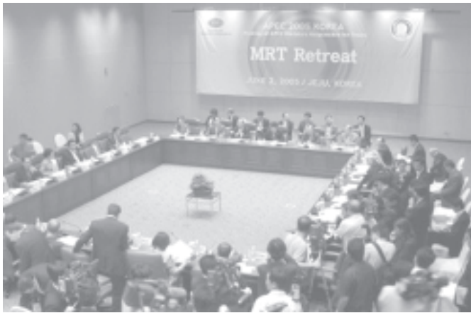
Trade ministers and officials from the 21-member APEC nations attend a meeting on the South Korean island of Jeju. New Zealand, Brunei, Chile and Singapore announced a trans-Pacific free trade pact to improve market access between the countries on 3 June, 2005. INTERNET