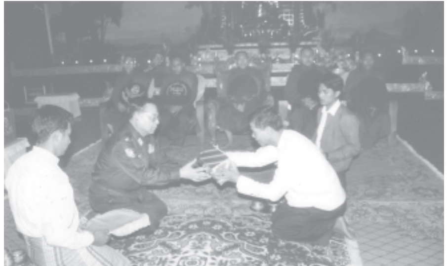
Deputy Minister Brig-Gen Thein Tun presents cash donations to an official. — INDUSTRY-1