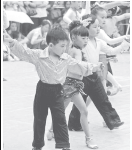
Chinese children compete during a Latin dance contest to celebrate 'International Children's Day' in Shanghai on 1 June, 2005. More than 100 pairs of Chinese children joined the event to mark 'International Children's Day', which falls on Wednesday.