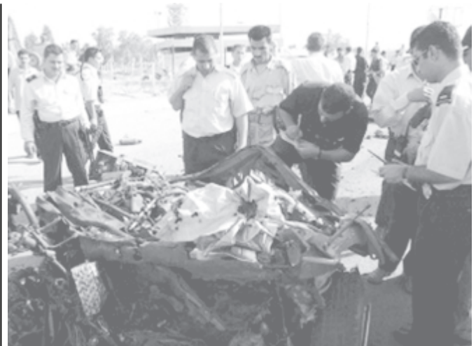
Iraqi police look on as an inspector takes down details of the remains of a car bomb in the northern city of Kirkuk on 3 June, 2005.