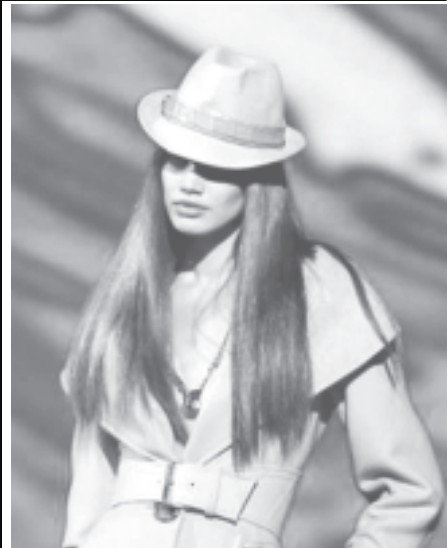
A model displays a design by Italian designer Donatella Versace during 'Una notte a Roma' (A night in Rome) Haute Couture fashion show in Rome's Navona Square on 1 June, 2005. — INTERNET

The current deadlock was blamed on EU's repeated rejection to Iran's demand of keeping restricted enrichment activities. Teheran in late April threatened to resume uranium enrichment activities, which it suspended last November to pave the way for talks with the EU. — MNA/Xinhua