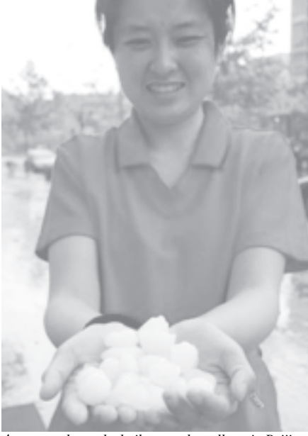
A woman shows the hailstones she collects in Beijing. capital of China, on 31 May, 2005.

Vanhanen, heading a large delegation composed of Cabinet ministers and businessmen from more than 20 companies, arrived in the Kuwait City on Sunday.