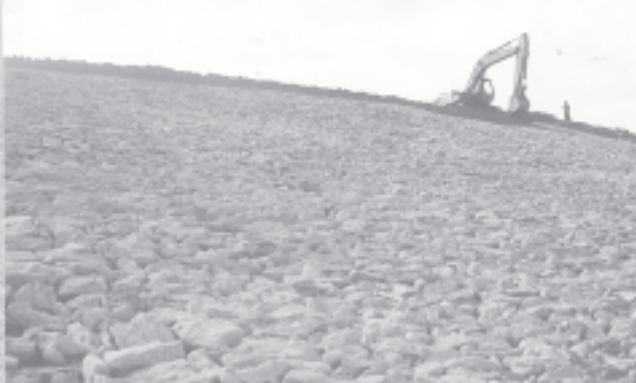
Minister for Agriculture and Irrigation Maj-Gen Htay Oo oversees construction of main embankment at Kataik Dam Project in Paung Township.