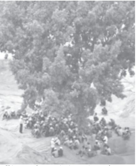
Chinese workers receive instructions under a tree at a construction site at the central business district in China's capital Beijing on 30 May, 2005.