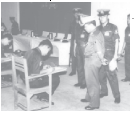
Camp Commandant Mai-Gen Hla Aung Thein views participation of officers and other ranks in Military Code of Conduct Competition at Ministry of Defence.

YANGON, 1 June -Military Code of Conduct Competition organized by the Ministry of Defence was held today at Konmyinttha here. A total of 174 officers and other ranks took part in the competition which was divided into four categories.