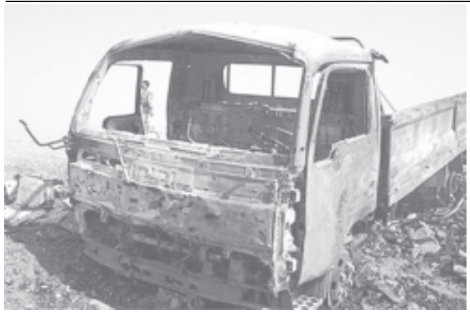
An Iraqi soldier walks past a burnt out truck at the scene of a car bomb south of Baquba, 60 kms northeast of Baghdad, on 31 May, 2005.

The minister said he had meetings with government officials of Italy and members of the business community there. The Italian business community expressed its desire to invest in export-processing zones (EPZs). At present, the trade is in favour of Bangladesh as the country exported goods worth 318 million US dollars to Italy while its import bill amounted to 180 US dollars from Italy in fiscal 2003-04. — MNA/Xinhua