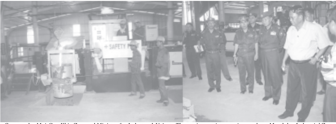
Commander Maj-Gen Khin Zaw and Minister for Industry-1 U Aung Thaung inspect iron casting works at Mandalay Industrial Zone Upgrading Project. — INDUSTRY-1

The commander the minister observed cars assembled by