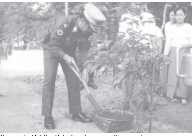
Commander Maj-Gen Myint Swe plants a star flower sapling.

YANGON, 1 June — Dalla Station of Yangon Command held a tree plantation ceremony at the regional battalion in Dalla Township, Yangon South District, today.