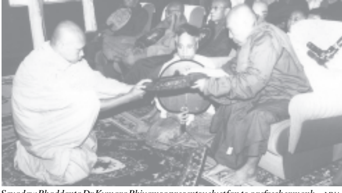
Sayadaw Bhaddanta Dr Kumara Bhivamsa presents velvet fan to a refreshermonk.

occasion were faculty members, Minister for Religious Affairs Brig-Gen Thura Myint Maung, Minister for Education U Than Aung, deputy ministers, advisers, departmental heads and guests.