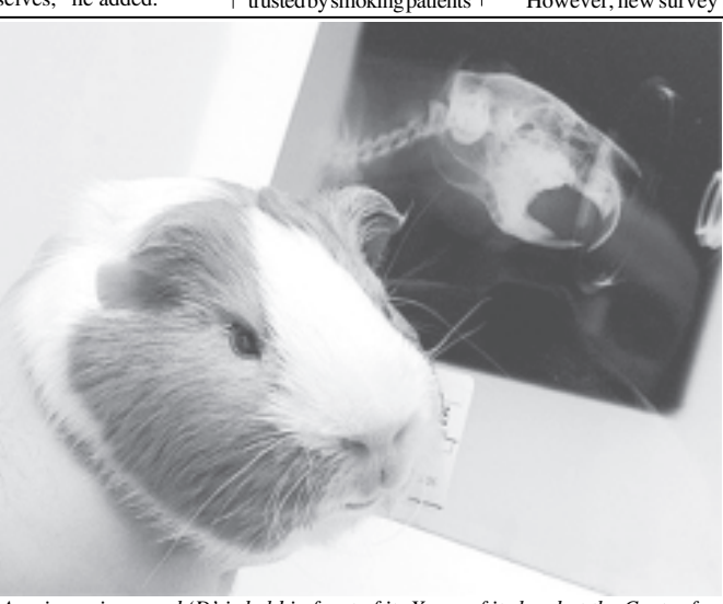
A guinea pig named 'D' is held in front of its X-ray of its head at the Center for Avian & Exotic Medicine in New York on 29 May, 2005.

The document is designed to promote bilateral cooperation as a means of developing understanding between the two nations and strengthening amicable ties, the report added. Based on the MoU, which has a five-year credit which can be extended upon the two sides' agreement, the two countries are obliged to provide facilities to travel agencies and make preparations for exchanging tours, according to the report. - MNA/Xinhua