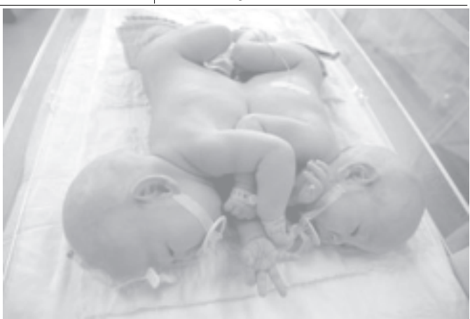
Two conjoined baby girls lie on an operating table before their separation surgery at the Xinhua Hospital in Shanghai municipality on 1 June, 2005.

There is a "virtual walk" on the "Walk the World" site: each time someone visits it for the first time, enters their email and clicks, TNT donates 19 US cents which feeds one child for