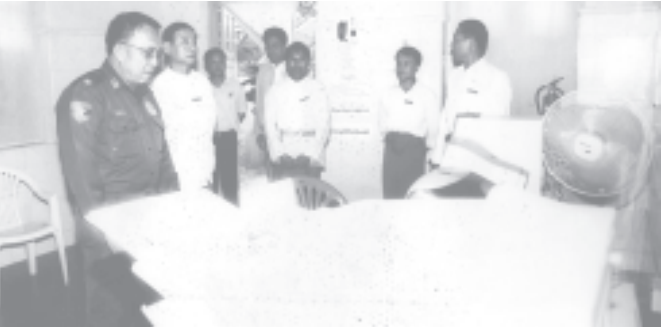
Deputy Minister Brig-Gen Aung Thein inspects Taunggyi Sub-printing House.

The deputy minister gave instructions on security, stockpile of spare parts for printing press and delivery of newspapers to