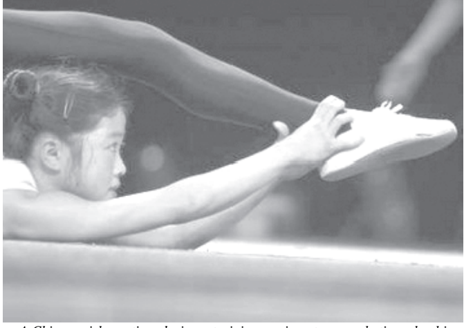
A Chinese girl practises during a training session at an acrobatics school in Liaocheng, in east China's Shandong Province on 30 May, 2005.