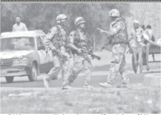
British troops on patrol in the southern town of Basra in Iraq on 29 May,