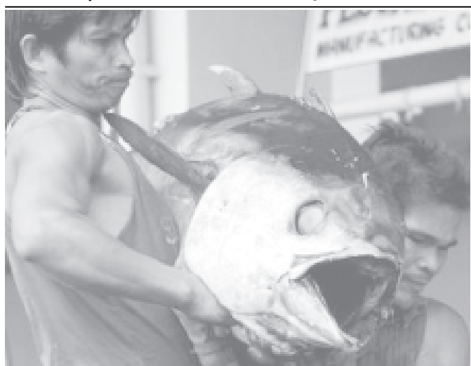
Filipino fish port workers carry a huge yellow fin tuna as they prepare to weigh the fish in General Santos City, in southern Philippines on 31 May, 2005.

May was a record month for car bombs used by fighters. US forces also suffered losses in offensives against the fighters such as Operation New Market in the western town of Haditha and Operation Matador around the western town of al-Oaim.