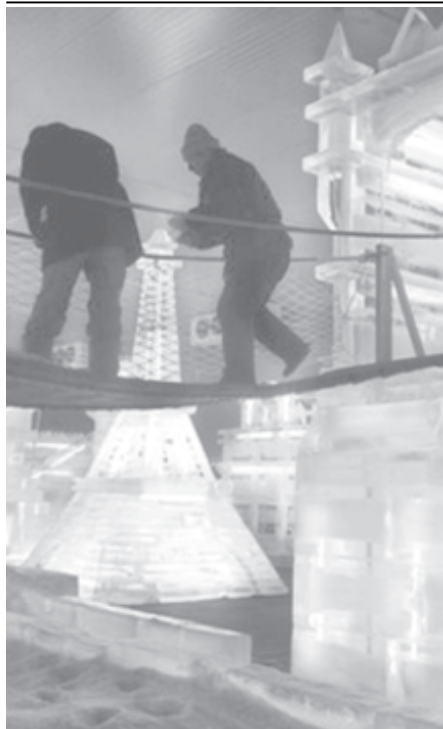
The silhouette of two workers frame an ice replica of the Eiffel Tower while working on another replica of the London Bridge on display at the Harbin Ice Wonderland exhibition which goes on for three months, on 30 May, 2005 in sunny Singapore.