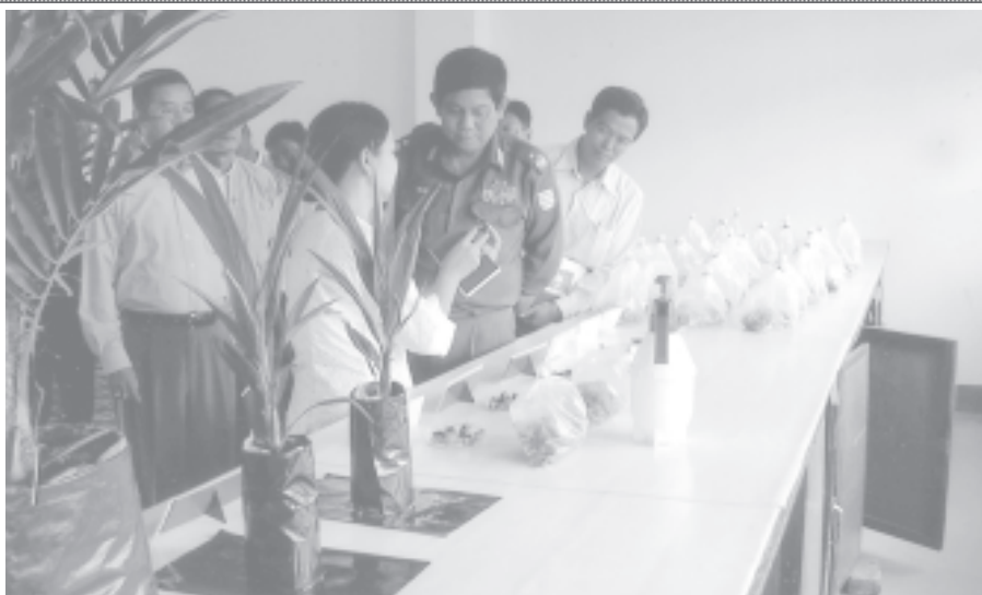
Minister Maj-Gen Htay Oo inspects production of cross-bred oil palm at the applied research division in Mawlamyine.