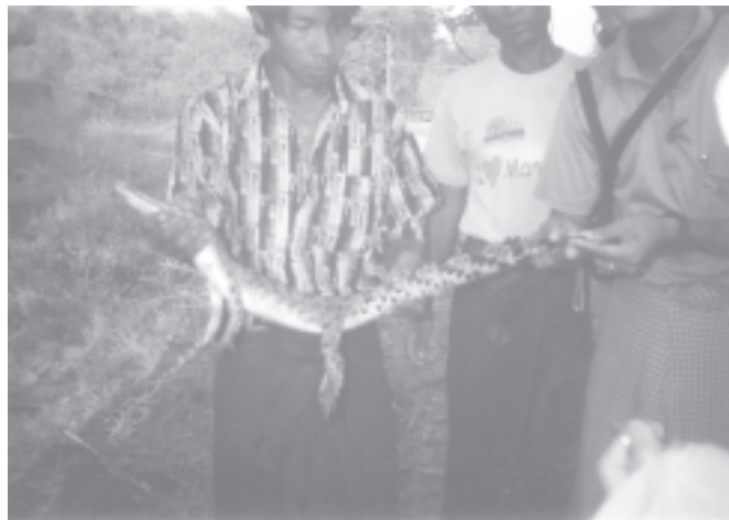
Tagging made on a crocodile.

model one of the department. Besides establishing sancutries and a captive, breeding-programme, it provides for a training centre for the personnel of the Wildlife Conservation Programme. We found that a