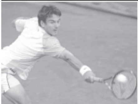
Spain's Tommy Robredo returns the ball to Russia's Marat Safin during their fourth round match of the French Open tennis tournament at Roland Garros Stadium, on 30 May, 2005 in Paris. Robredo won 7-5, 1-6, 6-1, 4-6, 8-6.

Brazil team web site quoted Parreira as saying: "Ronaldo claimed particular problems that prevent him from dedicating time to the national team. Then the technical commission decided to release him from his commitment."