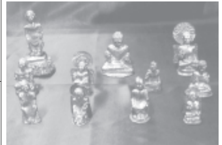
Pyu period gold Buddha statues in Mongmao. — CULTURE