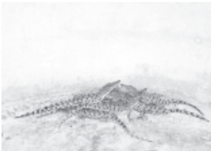
Baby crocodiles resting at the corner of nursery tank.

Conservation problems concerning biodiversity have been widely publicized and the majority of countries in tropical Asia are exerting efforts to manage and conserve this resource. Economically important group of animals with similar problems have been largely ignored in the past century. In terms of human exploitation, the most important brackish water species in tropical Asia are river terrapins and crocodiles. In February 2005, lecturers of Dagon University and myself travelled to the town of Bogalay and adjacent islands to conduct biological survey in the proposed protected area. On the first day of our trip when we arrived at Main Ma Hla Island, we observed the waterway of Bogalay River. We