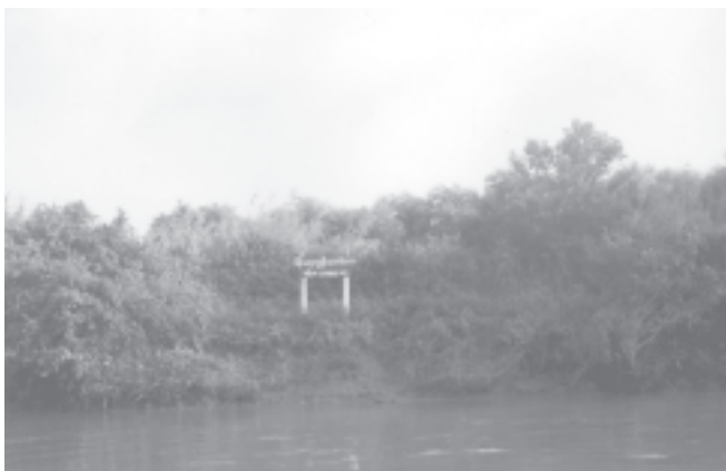
Main Ma Hla Island wildlife sanctuary.