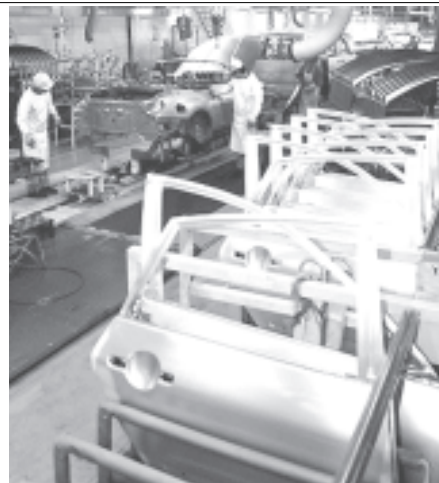
A Nissan car factory in Utsunomiya seen on 30 May, 2005.

After a meeting with Katsav, German President Horst Koehler said Israel and Germany will strengthen bilateral exchanges of science and culture as well as youth exchange with "a fund for the future".