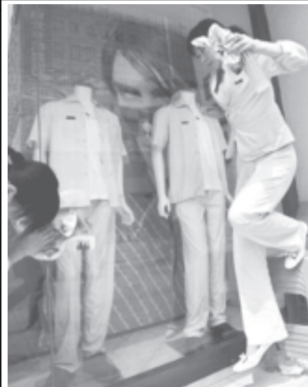
Chinese salesclerks clean the windows of a display showing Chinese made clothings in Beijing, on 31 May, 2005.