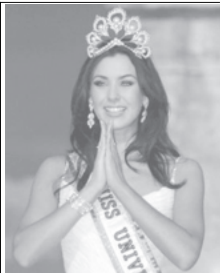
Newly crowned Miss Universe 2005 Natalie Glebova of Canada makes a Thai traditional greeting to photographers after the Miss Universe 2005 beauty pageant at Impact Arena in Bangkok, Thailand, on 31 May, 2005.

such as the spirit of apathy and drift, red tape, corruption, crime and endemic diseases such as malaria, tuberculosis and HIV/AIDS. — MNA/Xinhua