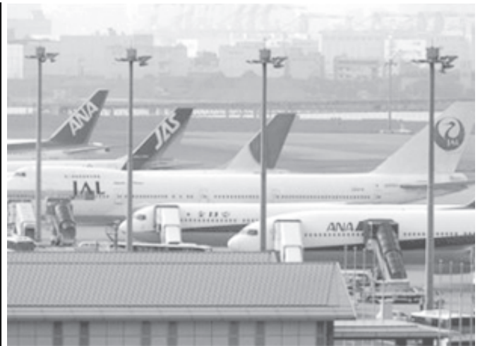
Japan Airlines (JAL) Boeing 747 jumbo jet is parked among other Boeing and Airbus planes at Tokyo's Haneda Airport on 28 May, 2005.