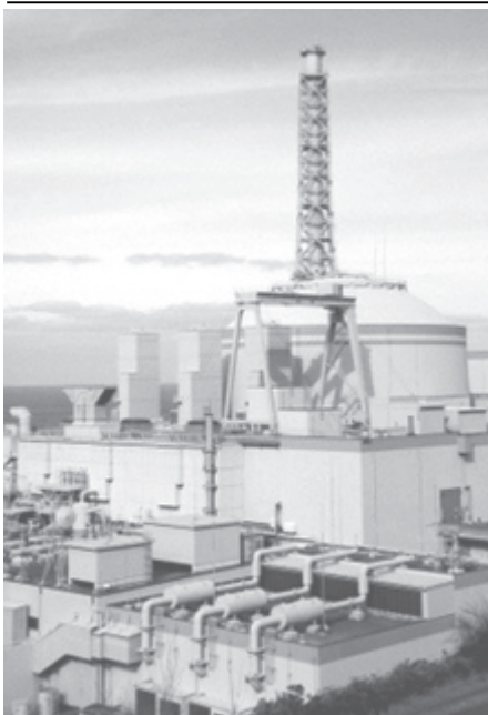
The Monju nuclear reactor in Tsuruga, Japan, seen on 30 May, 2005.