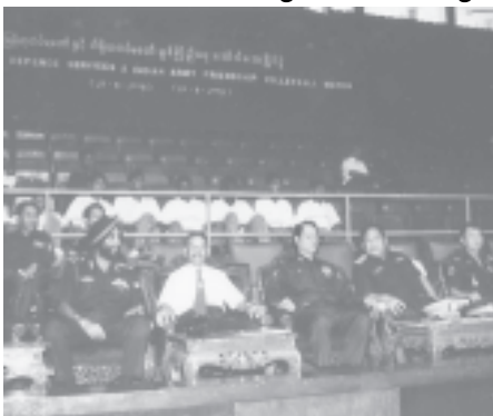
Brig-Gen Myo Myint watches the friendly volleyball match.

YANGON, 31 May — The friendly volleyball match between Yangon Command volleyball team and Indian Army volleyball team took place at the National Indoor Stadium 1, Thuwunna, this evening.