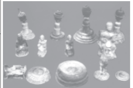
Pyu period silver cetis and Buddha statues unearthed in Mongmao.—CULTURE

The findings indicate that Buddha Sasana has flourished in Myanmar since the early Pyu period, and the gold and silver items in that period were exquisite. In addition, there was cultural interrelation between Tagaung, Hanlin, Beikthano and Sri Khattaya cities, and Buddhism has flourished in the nation ever since. — MNA