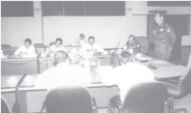
Minister Maj-Gen Hla Tun addresses the 70th banking meeting. — MNA

YANGON, 30 May — Banks Supervisory Committee and Executive Committee for Myanmar Banks Association of the Ministry of Finance and Revenue held its 70th meeting at the meeting hall of the ministry this morning, with an address by Minister for F&R Maj-Gen Hla Tun.