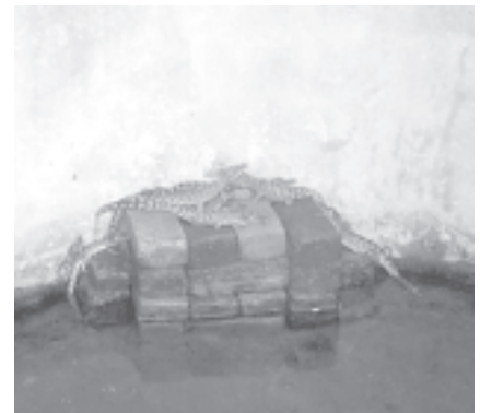
Baby crocodiles resting at the corner of nursery tank.

Each country needs to decide which actions are most suitable to their situation. It must be reemphasized, how-