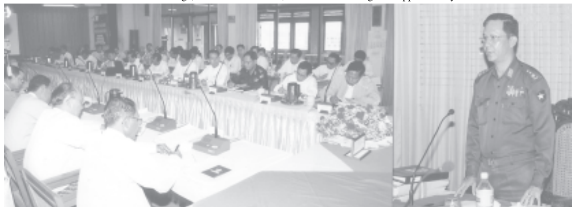
Minister Col Zaw Min addresses the coordination meeting of the Ministry of Cooperatives. — MNA

The meeting ended with the concluding remarks by Minister Col Zaw Min. —MNA