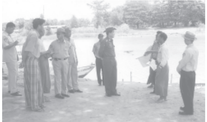
Minister Col Thein Nyunt inspects Khattiya earth road in Pantanaw Township.