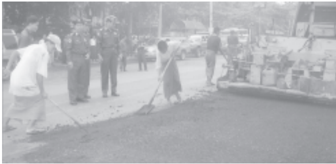
Commander Maj-Gen Myint Swe and Mayor Brig-Gen Aung Thein Lin inspect the tarmacking of Bayintnaung Road in Hline Township. — YGN COMMAND

First, the commander and mayor arrived at Thirimingala Housing in Ahlon Township and checked measures for proper drainage on either side of Strand Road,