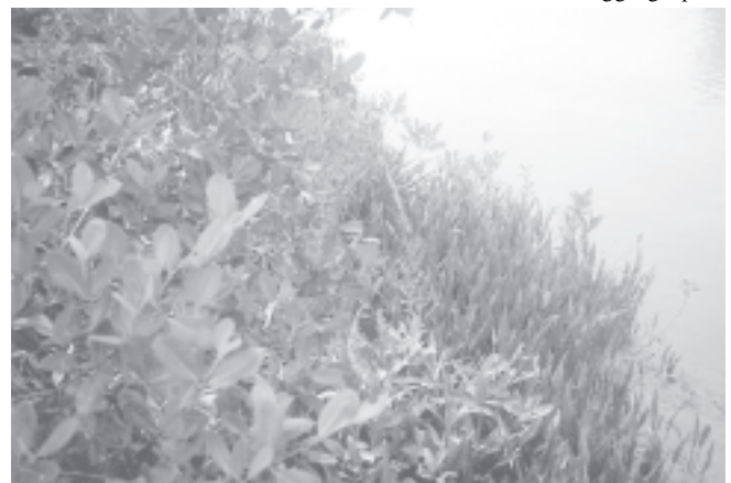
Refuge for crocodiles.

On return from this journey, we appreciated the young generation for their conservation efforts in Main Ma Hla Island. We collected the relevant information on the population statistics and comprehensive biological information such as migration, growth, mortality and other relevant facts that can be derived from tagging pro-