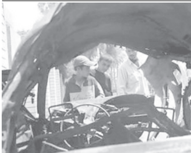
Local residents look at a vehicle destroyed in a suicide attack against police in the southern Iraqi town of Hilla, 100 km (60 miles) south of Baghdad on 30 May, 2005.

Last week, an OH-58 surveillance helicopter was shot down by small arms fire near the town of Baquba, northeast of Baghdad, killing both people on board.