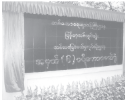
Minister Brig-Gen Thein Aung formally unveils the signboard of No 6 Furniture Factory in Wataya Industrial Zone. — MNA