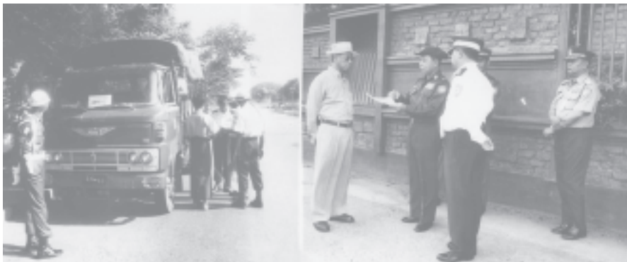
Minister for Mines Brig-Gen Ohn Myint and party supervise dry day inspection teams.

YANGON, 29 May — Dry Day Supervisory Committee Chairman Minister for Mines Brig-Gen Ohn Myint, together with leader of the inspection team Deputy Minister for Construction U Tint Swe and members Director General of Myanmar Police Force Police Brig-Gen Khin Yi, senior military officers and departmental heads this morning supervised dry day inspection teams checking the motor vehicles used by Tatmadaw and departments at the