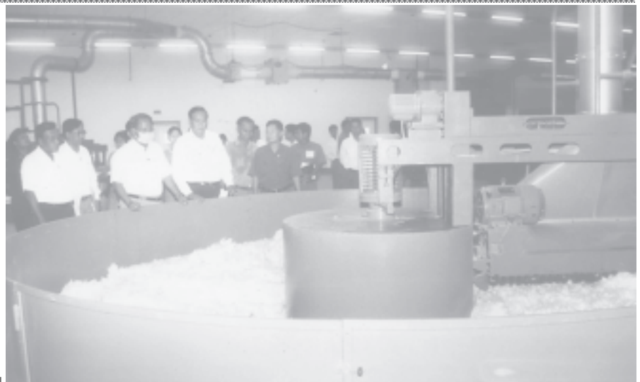
Minister U Aung Thaung inspects Pakokku Textiles Factory (Project) in Magway Division. — INDUSTRY-1

Later, the minister proceeded to Salingyi in Sagaing Division where he inspected the Winthuza shop.—MNA