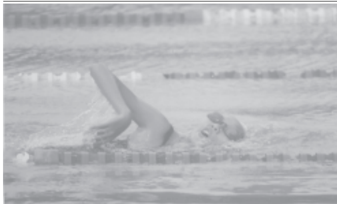
A swimmer participating in Myanmar Olympic Committee Chairman's Cup Women's and Men's Age-wise Swimming Championship Sunday.