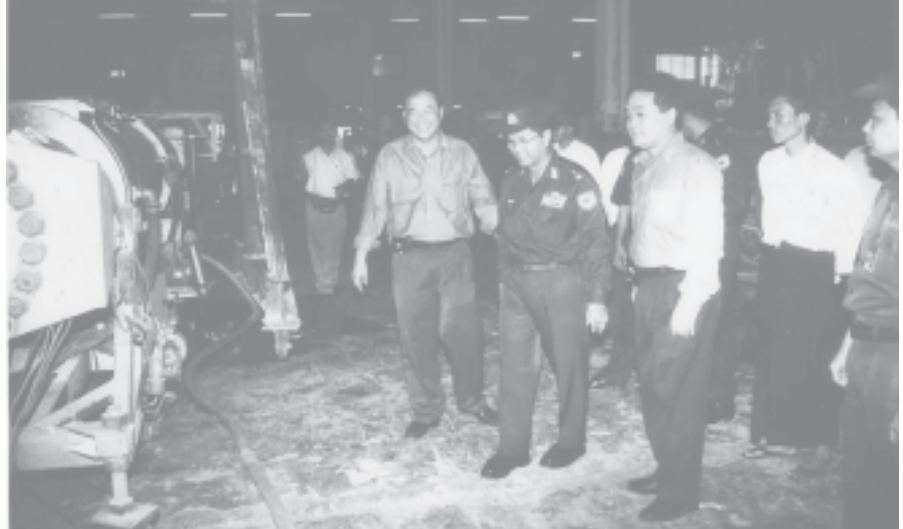
Commander Maj-Gen Myint Swe inspects Tokyo Pipe, Tokyo Plastics in Hlinethaya Industrial Zone-1.

The commander and party viewed various kinds of products of the factory displayed in the hall. (See page 9)