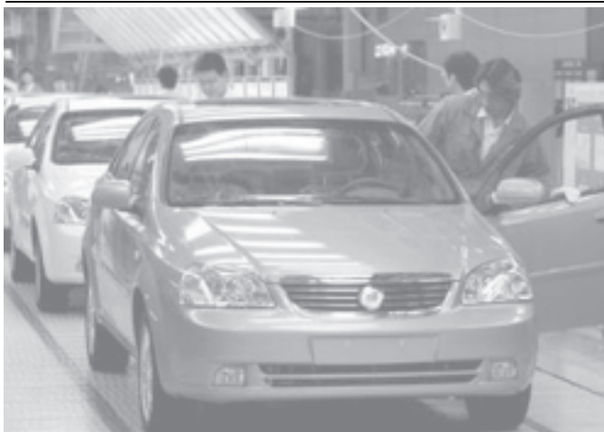
Chinese workers work at a production line at the General Motors Corp’s new plant in Shanghai, on 28 May, 2005.

The statement said Annan regarded the September UN summit as a unique opportunity to renew the efforts to strengthen the global collective security system. “He challenges leaders to use that opportunity to make bold commitments and address the pressing challenges to which the review conference could not provide answers,” it said. — MNA/Xinhua