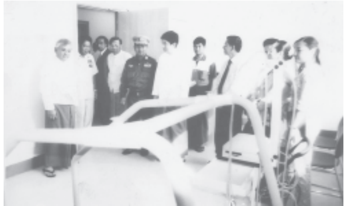
Ministers, deputy ministers and guests visit Pun Hlaing International Hospital. (News on page 16)