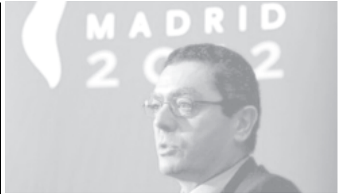
Madrid's mayor Alberto Ruiz Gallardon speaks beside a logo of Madrid 2012's Olympic bid during an interview with Reuters at Madrid's city hall on 23 May, 2005. Ruiz Gallardon expressed his confidence that Madrid will gain victory in Singapore on 6 July to organize the 2012 Olympic Games.