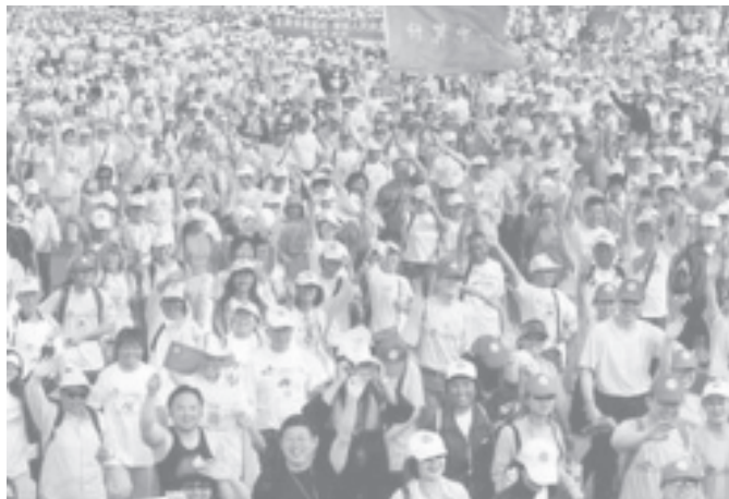
Chinese residents wave as they march on a street during an international walking festival in Dalian, northeast China's Liaoning Province on 28 May, 2005.