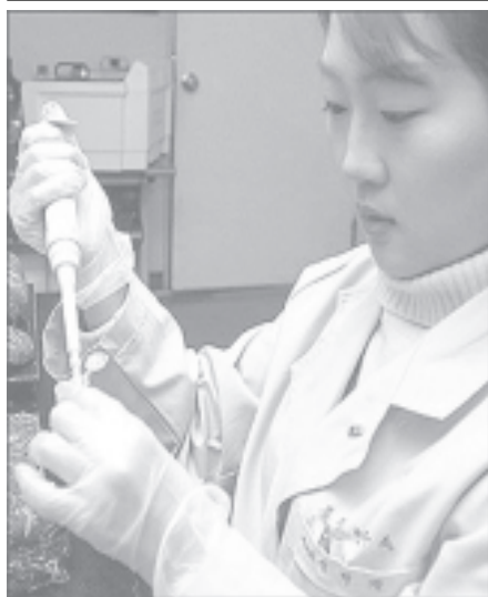
A female researcher seen in a lab in Tokyo, Japan, on 27 May, 2005.

More than 800 participants are expected to attend the trade forum, including members of the business community, representatives from trade and investment promotion agencies and government officials.— MNA/Xinhua