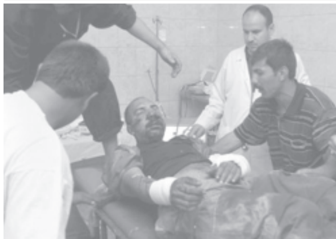
A man is treated in hospital in Fallujah 65 kilometers west of Baghdad in Iraq on 28 May, 2005.

He also said his meeting with Chinese President Hu Jintao was “frank” and “constructive”, and achieved satisfactory result.