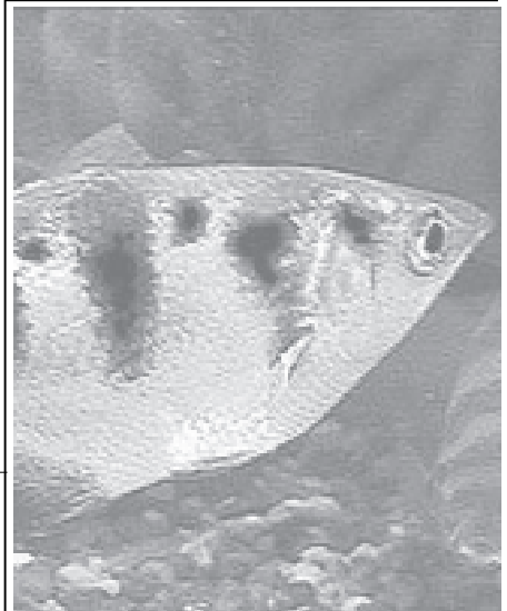
Researchers in Thailand said they had successfully bred and raised hundreds of the threatened Archer fish, which had never before lived for more than a week after artificial breeding on 27 May, 2005.