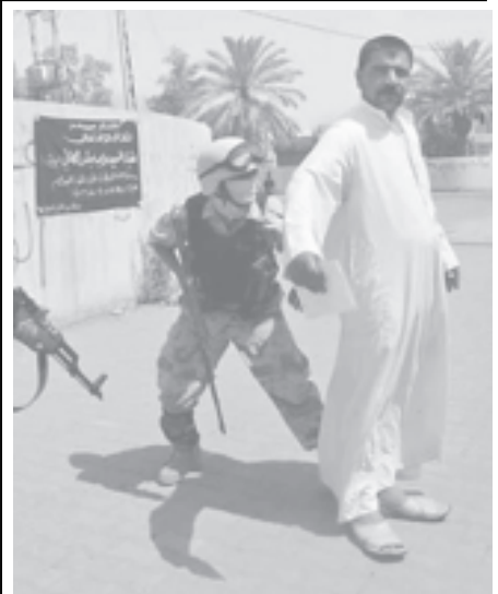
An Iraqi soldier searches a man at a checkpoint during an anti-terrorist operation in Baghdad on 28 May, 2005.