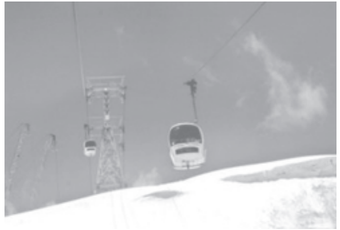
Cable cars move above snow capped peaks near the Line of Council, during the inauguration of the cable car at Afarwat in Gulmarg, some 60 kilometres (38 miles) west of Srinagar, India, on 28 May, 2005.