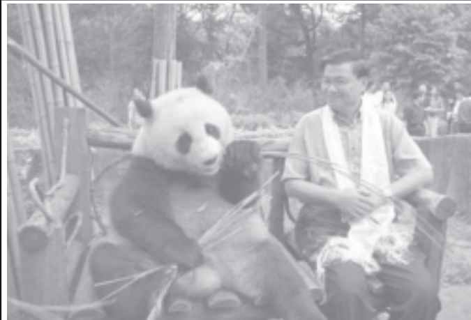
Laos Deputy Prime Minister Thongloun Sisoulith (R) looks at a giant panda eating bamboo at a giant panda breeding centre in Ya'an, southwest China's Sichuan Province, on 27 May, 2005.