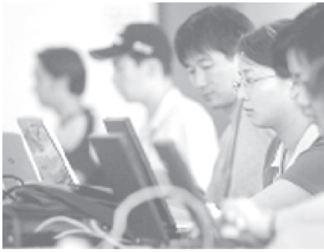
People surf the Internet in Jinan, China recently. INTERNET

"The aim and ambition of our policy in education is to meet the modern facts, the increased demands of the modern era, the needs of the social whole, the expectations and the visions of the new generation," Karamanlis said. —MNA/Xinhua