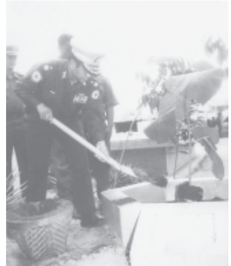
Commander Maj-Gen Myint Swe grows a sapling to mark the sapling planting ceremony of Bago Station. — YANGON COMMAND

The commander gave instructions on maintenance for durability of the main canal, upgrad-