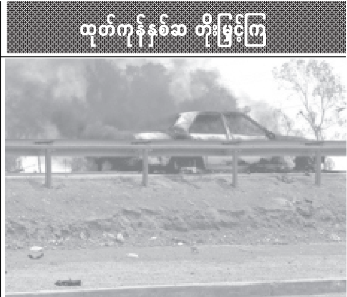
A car is gutted by fire following a car bomb against an Iraqi police convoy in Baghdad on 25 May 2005.