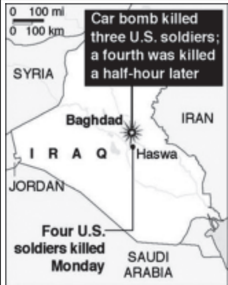
Map locates Haswa and Baghdad, Iraq, where US soldiers were killed on 24 May, 2005.

Four soldiers were killed Monday after they were attacked in Haswa, 30 miles south of Baghdad, the military said. The soldiers were assigned to the 155th Brigade Combat Team, II Marine Expeditionary Force.—Internet.