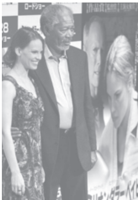
Hollywood stars Hillary Swank, left, and Morgan Freeman pose for the media at a Tokyo hotel on 25 May, 2005 during a press conference, promoting for Clint Eastwood's 'Million Dollar Baby' which won Academy Awards in February.

Last year, 2,500 postgraduate students from the western region have entered these universities. By 2007, the figure is expected to top 5,000, with a total of 15,000 postgraduates studying in these universities.—MNA/Xinhua