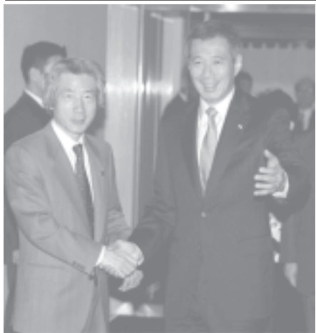
Singapore Prime Minister Lee Hsien Loong (R) shakes hands with his Japanese counterpart Junichiro Koizumi prior to their talks at a hotel in Tokyo on 24 May, 2005.