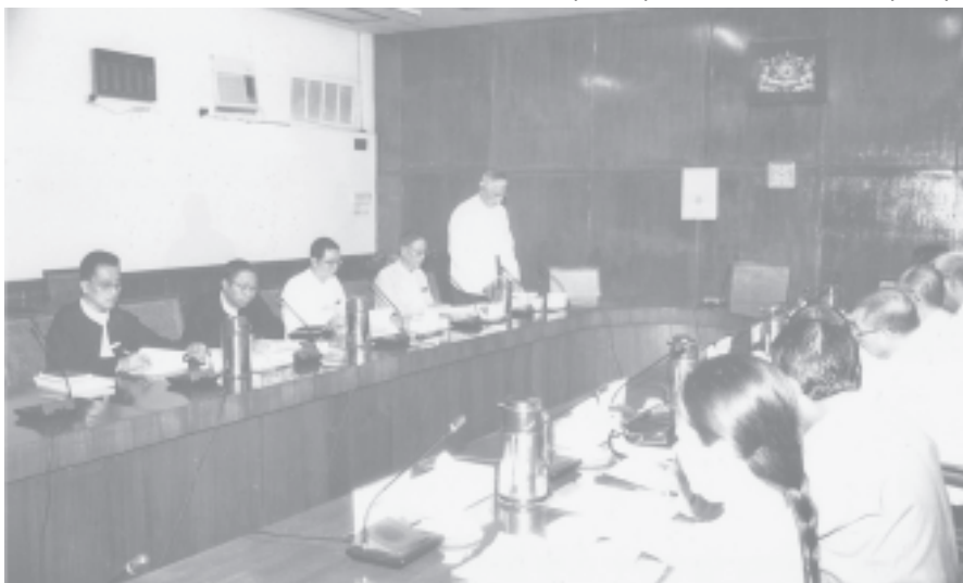
Coordination meeting of the alternate chairmen of National Convention Plenary Session in progress.