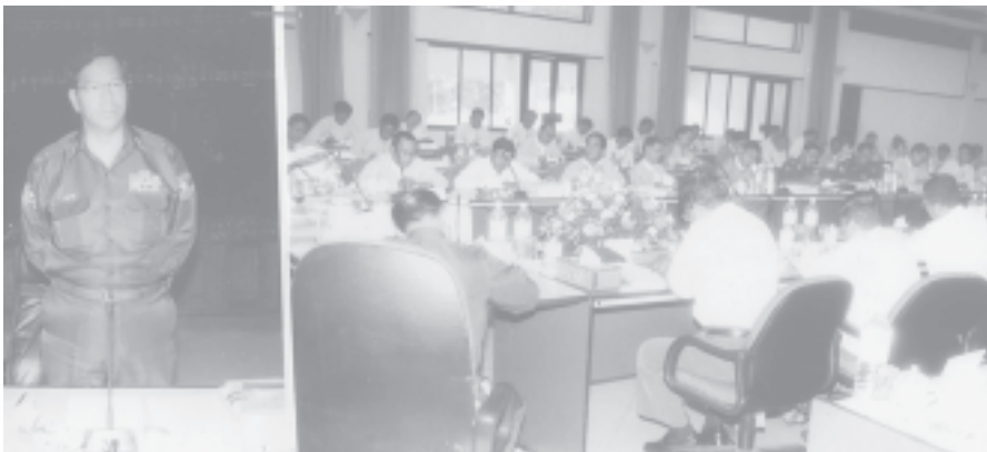
Minister Maj-Gen Hla Tun addresses coordination meeting of Ministry of Finance and Revenue. — F&R

YANGON, 25 May — The second day for second work coordination meeting 2005 of the ministry of Finance and Revenue, continued at the meeting hall of the ministry this morning, attended by Minister for Finance and Revenue