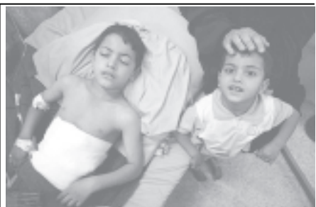
A boy stands next to his older brother laying in a hospital bed at the Yarmuk hospital in Baghdad, following a car bomb in Mahmudiyah, on 24 May, 2005.

အိမ်တိုင်းမှာသစ်ပင် ရွာစဉ်မှာတော့တန်း တစ်တောဝင်တစ်တောင်ဆက် မြို့တက်မယ့်လမ်း။