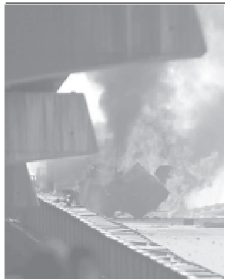
A US Army Humvee burns after a car bomb attack in Baghdad on 24 May, 2005.

It was constituted as per the commitments made in a special programme issued by a meeting of the Council of Ministers, or Cabinet, held under the chairmanship of Nepali King Gyanendra, the statement said.—MNA/Xinhua