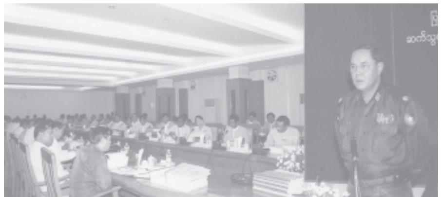
Minister Brig-Gen Thein Zaw delivers an address at the coordination meeting of Ministry of Communications, Posts and Telegraphs.—COMMUNICATIONS