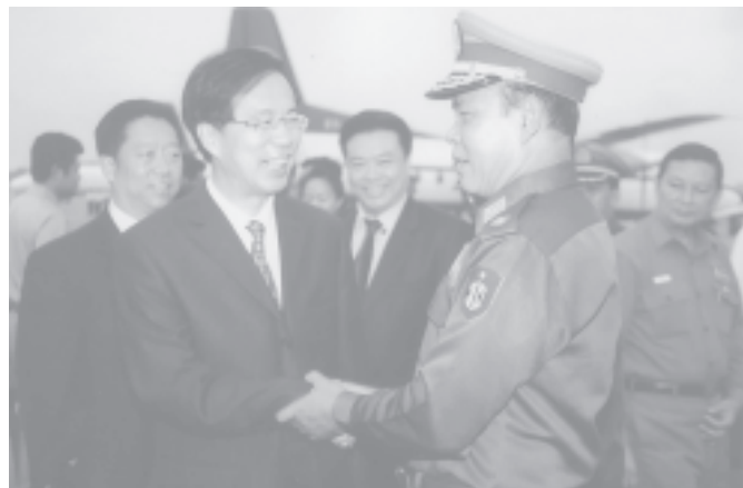
Mayor Brig-Gen Aung Thein Lin sees off Chinese goodwill delegation at Yangon International Airport.

YANGON, 25 May — The 22-member goodwill delegation led by Mr Xu Rongkai, Governor of Yunnan Province of the Peo-