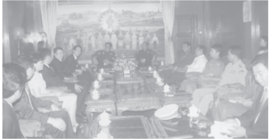
Home Affairs Minister Maj-Gen Maung Oo meeting with Governor of Yunnan Province of the PRC Mr Xu Rongkai and party. —MNA