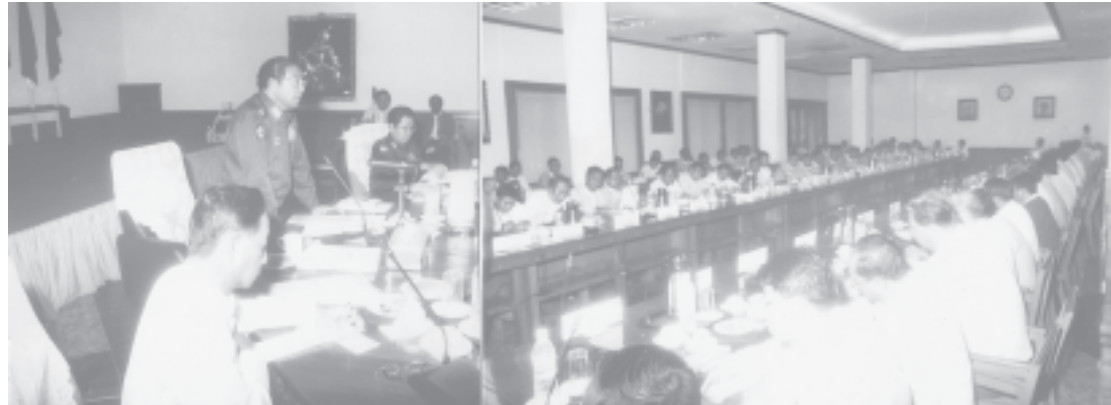
Minister Maj-Gen Saw Tun delivers an address at work coordination meeting.

YANGON, 25 May — The Ministry of Construction held its coordination meeting at the head office of Department of Human Settlement and Housing Development on Bogyoke Aung San Street, here, this morning.