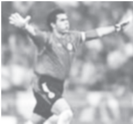
Mexican team Chivas goalkeeper Oswaldo Sanchez celebrates his team's goal against Pachuca during the second half of their Libertadores Cup soccer match at the Jalisco Stadium in Guadalajara City, Mexico, on 24 May, 2005.