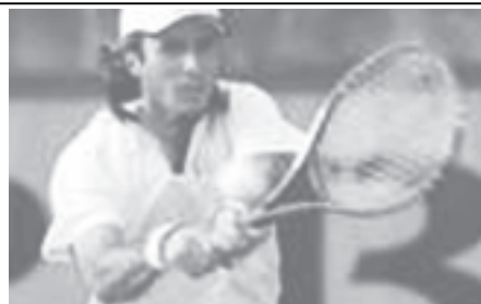
Vince Spadea of the US returns a backhand during his match against Spain's Albert Costa in the first round of the French tennis open at Roland Garros Stadium on 24 May, 2005. Spadea beat Costa 6-4 7-6 6-2.