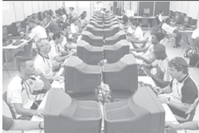
An Internet cafe set up for the Athens Olympics. Greeks will for the first time be able to name their Internet sites with letters from the Greek alphabet, the country's telecommunications authorities (EETT) said.