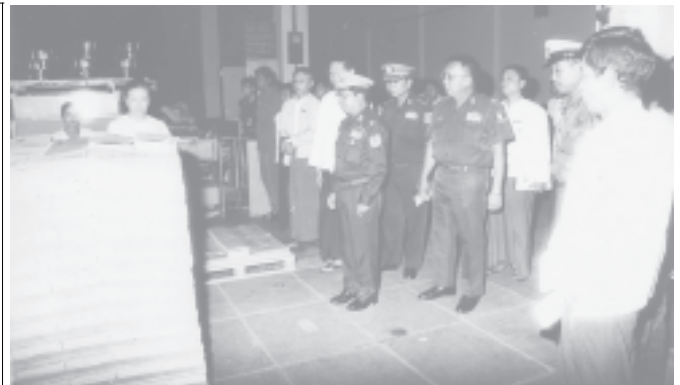
Information Minister Brig-Gen Kyaw Hsan inspects Photolitho Press in Bahan Township.