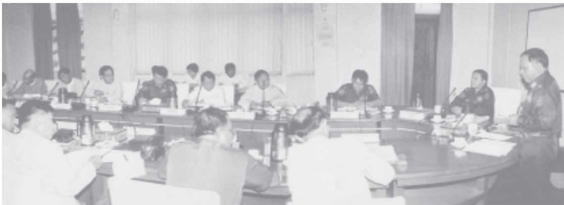
Minister Brig-Gen Thein Aung addresses at Environmental Conservation Committee Meeting.

Director-General U Soe Win Hlaing of Forest Department