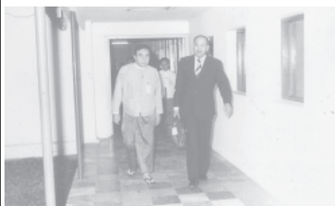
Assistant Foreign Minister for Asian Affairs of the Arab Republic of Egypt Mr Ezzat Saad Sayed being seen off at the airport on 24 May.