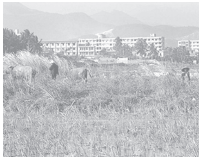
A farmer walks water buffalo through rice paddies in Sanya, southern China's Hainan island on 24 May, 2005.