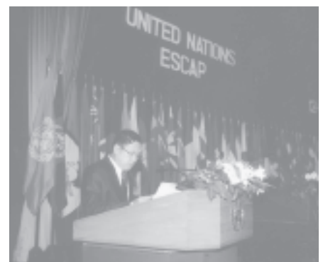
Maj-Gen Thein Swe delivers an address at the 61st Annual Meeting of United Nations Asia and Pacific Region Economic and Social Commission (ESCAP) held in Bangkok, Thailand.

On 19 May, the minister and party arrived back here by air. The minister was welcomed back by Minister for National Planning and Economic Development U Soe Tha, Minister for Rail Transportation Maj-Gen Aung Min, Deputy Minister for Transport U Pe Than and officials. Members of the