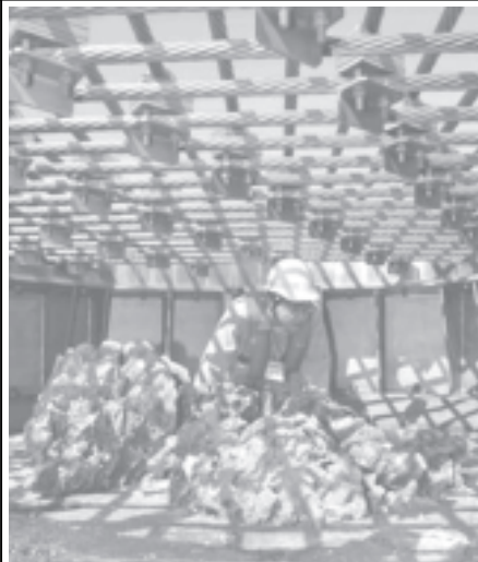
A member of Japan's Ministry of Land, Infrastructure and Transport looks at the surface of an outcropping, protected by a steel net and embankment, at Okinotori island, about 1,700 km (1,056 miles) south of Tokyo in the Pacific Ocean on 20 May, 2005.