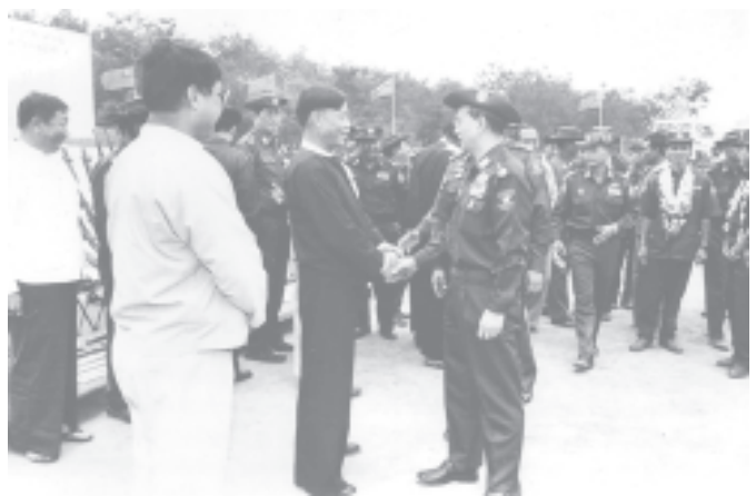
Secretary-1 Lt-Gen Thein Sein cordially greets those present at the ceremony to unconditionally exchange arms for peace.

He said that the ceremony was pleasant, auspicious and honourable not only for the nationalities of Nampaung region, Lashio Township, but also for the entire people of the nation as eternal peace and stability, the basic requirement for national development, can be restored. From a foreign nation, Sao Hkam Hpa, a son of Nyaungshwe Sawbwa Sao Shwe Thaik, an-