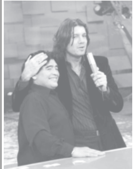
Former Argentine soccer star Diego Maradona (L) appears with television host Marcelo Tinelli during the Channel 9 show 'Showmatch' in Buenos Aires on late 18 May, 2005.