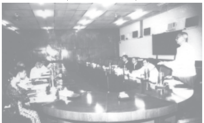
The coordination meeting of the alternate chairmen of the Plenary Session of the National Convention in progress. — MNA