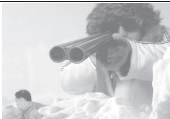
A Chinese man walks past a billboard promoting wild animal protection in Beijing, on 20 May, 2005. — INTERNET

recently refurbished Palace of Sport, the concert hall hosting most of the Eurovision events, with more than 2,000 police officers guarding the building. — MNA/Xinhua