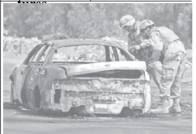
US soldiers examine a destroyed vehicle after a roadside bomb explosion in Baghdad on 18 May, 2005.

The Shanghai Pudong International Airport, the Shanghai Sculpture Park and other key sites will all erect sculptures, the source said.