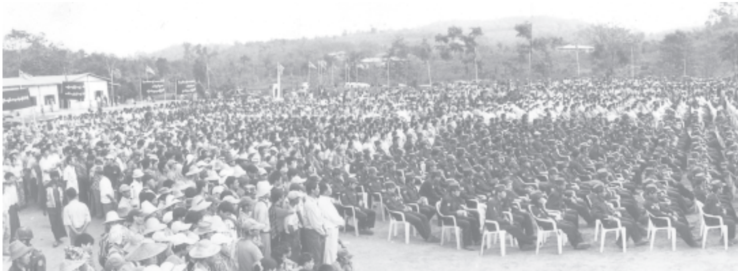
SSNA Brigade-19 led by U Gon Khay unconditionally exchanges arms for peace at a ceremony held in Nampaung village, Lashio Township.—MNA