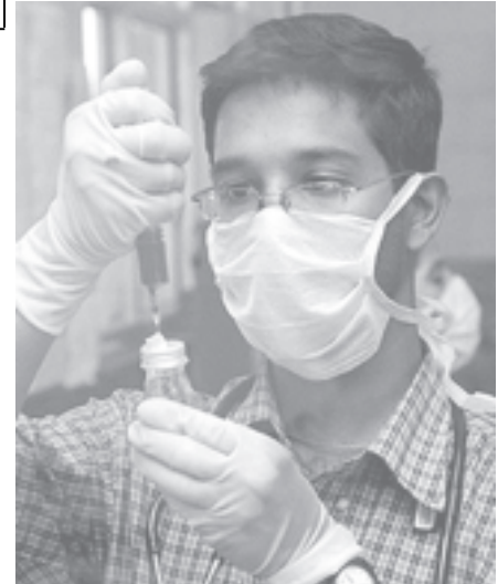
An Indian doctor tests the blood of a suspected bacterial meningitis patient at the Hindu Rao Hospital, in New Delhi. An outbreak of bacterial meningitis in New Delhi has left at least 28 people dead in the past three weeks, a municipal health office spokesman said. — INTERNET

Three people had succumbed Monday to the deadly disease that hit the capital over a fortnight ago. The total number of cases reported in the capital has gone up to 323. — MNA/Xinhua