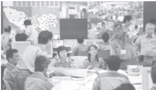
Municipal officials work in the emergency operation room of the Tokyo metropolitan government headquarters as Japan conducted drills on 19 May, 2005 in preparation for the possibility of a major quake hitting the capital during the morning rush hour.

With no oil refineries, Vietnam now has to export crude oil and import petroleum products. It shipped abroad 6.1 million tons of crude oil valued at nearly 2.3 billion US dollars in the first four months this year, down 6.1 per cent in volume but up 45.3 per cent in value against the same period last year, according to the country's General Statistics Office. In the period, Vietnam imported roughly 4 million tons of petroleum products worth nearly 1.5 billion dollars, posting increases of 4.9 per cent and 36.3 per cent respectively. — MNA/Xinhua