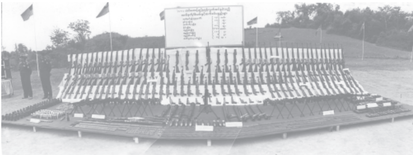
Arms and ammunition handed over by members of SSNA Brigade No 19.