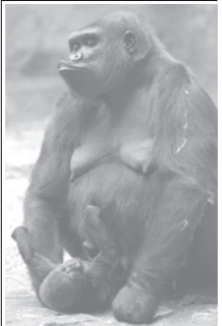
A baby gorilla is back with her mother following an emergency medical procedure to treat a rare bone disease, according to Franklin Park Zoo officials, on 19 May, 2005 in Boston.