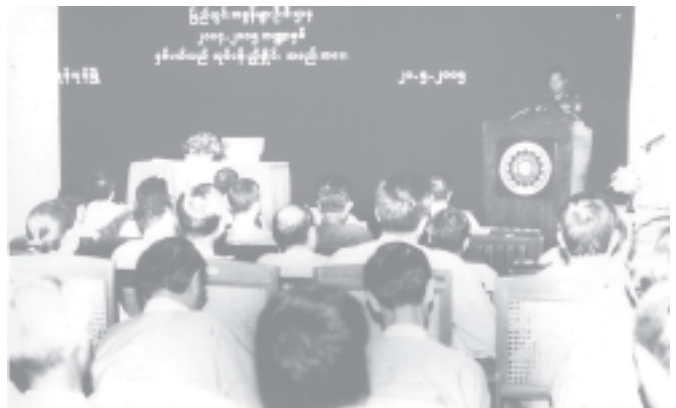
Minister Maj-Gen Hla Tun addresses the coordination meeting.

YANGON, 20 May — The meeting to review tax collection of Internal Revenue Department for 2004-2005 financial year and the meeting on revenue collection matters for 2005-2006 financial year