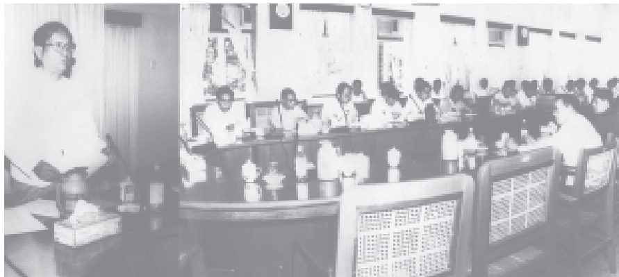
Minister Brig-Gen Thura Myint Maung delivers a speech at the meeting. — MNA

Revenue collection of states and divisions and future plans will be discussed tomorrow. —MNA