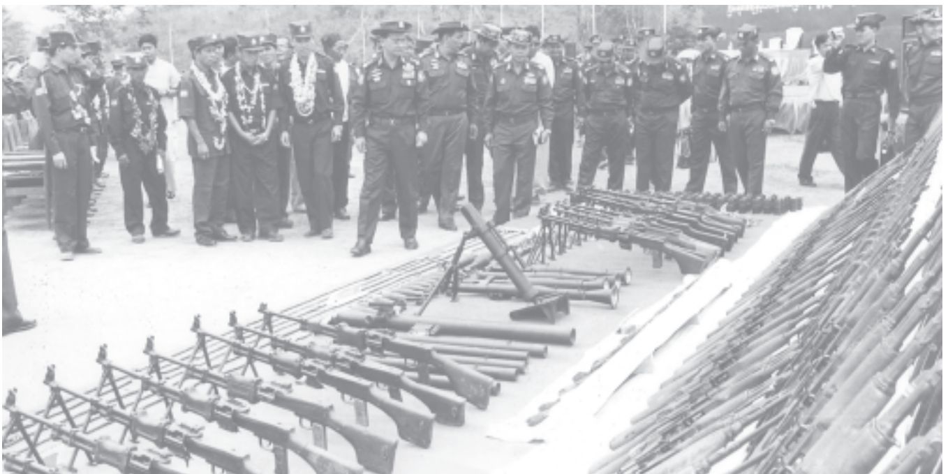
Secretary-1 Lt-Gen Thein Sein and party inspect arms handed over by SSNA brigade 19.

YANGON, 20 May —The Brigade-19 of Shan State National Army (SSNA) led by U Gon Khay who had returned to the legal fold since 1995, unconditionally exchanged arms for peace in Nampaung Village, Lashio Township this morning, attended by State Peace and Development Council Secretary-1 Lt-Gen Thein Sein.