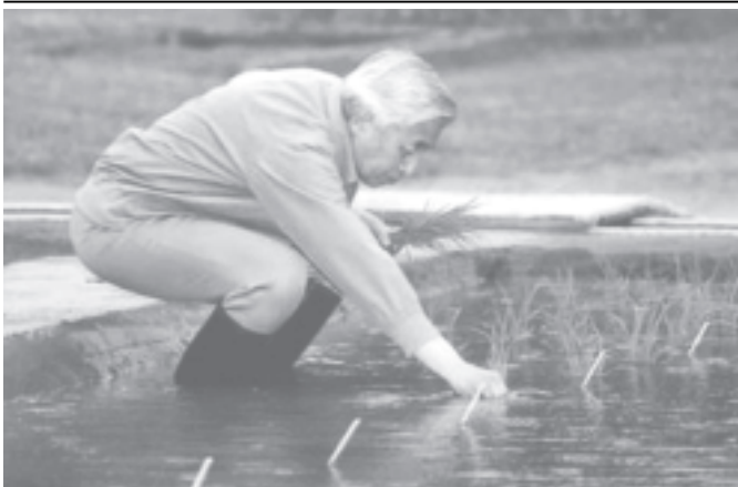
Japanese Emperor Akihito plants rice seedlings in a rice paddy at the Imperial Palace in Tokyo on 18 May, 2005. The Emperor will harvest the rice in autumn for use in religious rites at the palace.