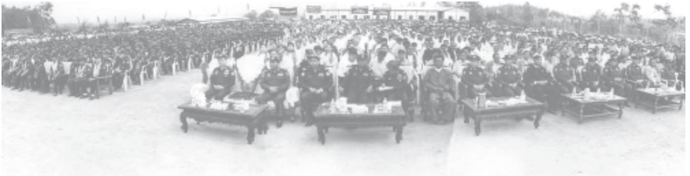
Secretary-1 Lt-Gen Thein Sein and dignitaries attend the ceremony to unconditionally exchange arms for peace.

(from page 8) organizing all their men to unitedly return to the legal fold. He said he made a sincere request to all the remaining brethren who are still