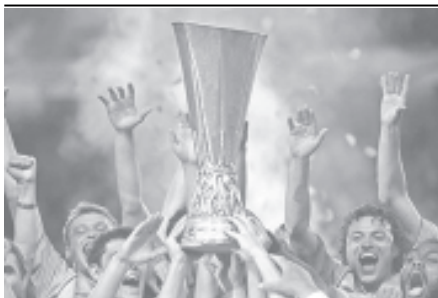
CSKA Moscow's players celebrate with the trophy at the end of the UEFA cup final football match Sporting Lisbon vs CSKA Moscow, at the Alvalade Stadium in Lisbon. Moscow won 3 to 1.