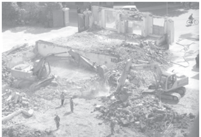
Shovels remove debris of a demolished old building at a construction site to build new apartment complex on 19, May 2005 in Shanghai, China. China's investment in construction, factory equipment and other fixed assets grew 25.7 percent on-year in the first four months of 2005, a slightly faster pace than during the first quarter, the government said on Thursday.