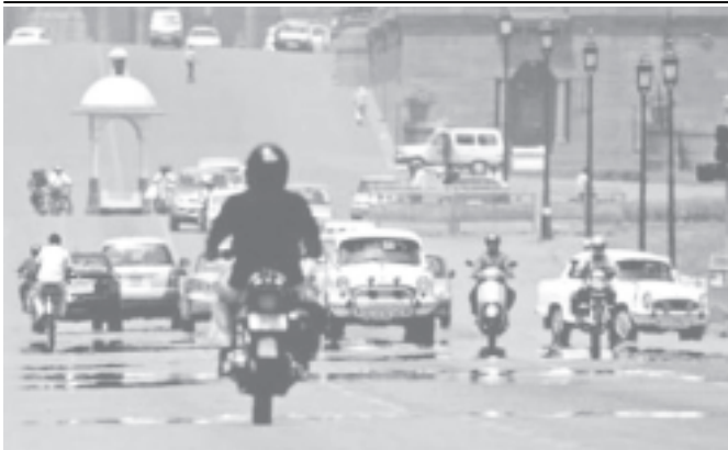
Traffic moves during a hot day in front of the Presidential Palace in New Delhi on 18 May, 2005. High temperatures are affecting most parts of India, including the capital New Delhi, as is usual for this time of year ahead of the monsoon, which normally begins in the south in the first week of June.