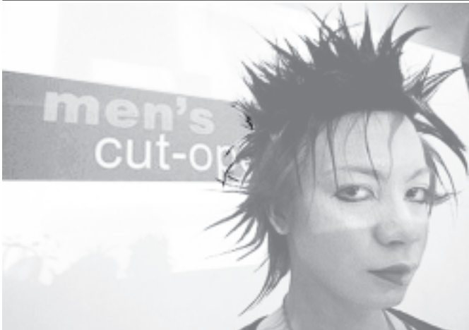
A hair model participant displays his hair-style for photograph during the 2005 hair and Make-up trend competition in Manila on 18 May 2005.