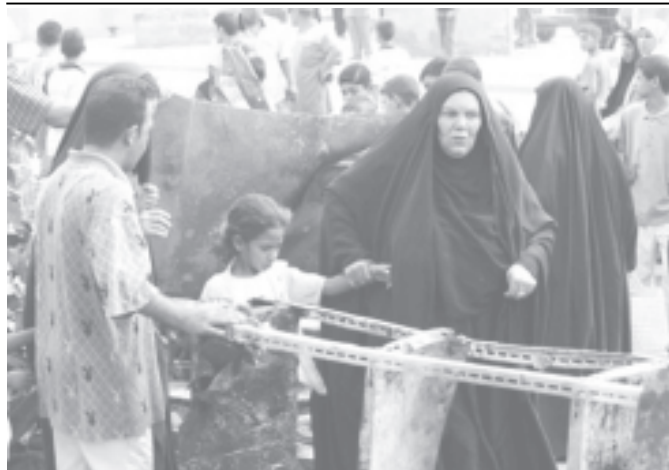
A mother leads her daughter by the hand past debris following a twin car bomb explosion in the Dura District of Baghdad on 18 May, 2005.