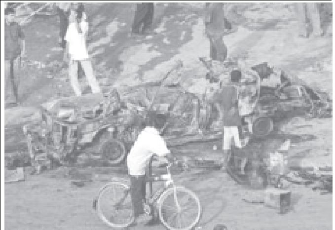
Onlookers view the remains of a vehicle which was destroyed by a car bombing at a Baghdad market on 17 May, 2005. —INTERNET

Malaysia may fully eliminate tariffs on vehicle imports by 2015 and is also considering immediate tariff removal on some models that do not compete with vehicles produced by national car makers Proton Holdings and Perusahaan Otomobil Nasional Kedua, better known as Perodua, according to the official. — MNA/Xinhua