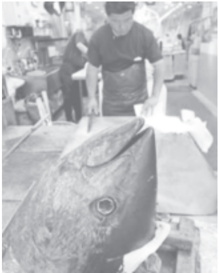
A head portion of a 150-kilogramme tuna awaits a fish shop worker sharpening a knife at Tuskiji fish market in Tokyo, on 17 May, 2005.