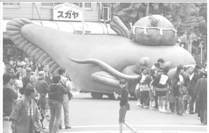
A float in the shape of a giant catfish with a stone on its head is pulled by shrine parishioners during a parade to mark the Kanda festival in Tokyo recently.

"In the long term, the cooperation between us will push forward world peace and stability," Prodi said. This year marks the 30th anniversary of the establishment of China-EU diplomatic ties. Former German Defence Minister Rudolf Scharping, chairman of the China Reform Forum Zheng Bijian and president of CFAU were also present on the forum. — MNA/Xinhua