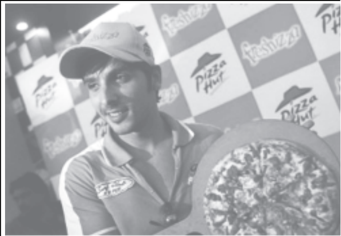
Bollywood Actor Zayed Khan poses with a pizza during the launch of a new product by pizza chain 'Pizza Hut' called Freshizza, at an outlet in New Delhi, India, on Wednesday, 18 May, 2005.

Vietnam, which shipped abroad over 4 million tons of rice worth 941 million dollars in 2004, is expected to export 3.8-3.9 million tons of the commodity this year. Meanwhile, Thailand's rice export is estimated at 8 million tons, down from more than 10.1 million tons last year, according to the report. — MNA/Xinhua