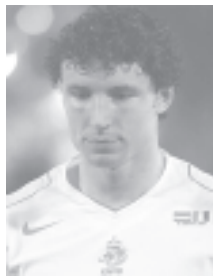
PSV Eindhoven midfielder Mark Van Bommel has agreed a three-year deal with Barcelona.