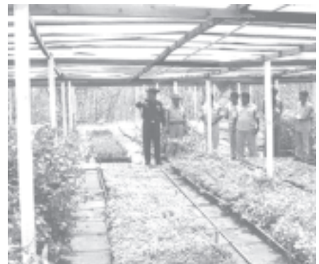
Minister Col Thein Nyunt inspects nursery of Chauk Township Development Affairs Department.