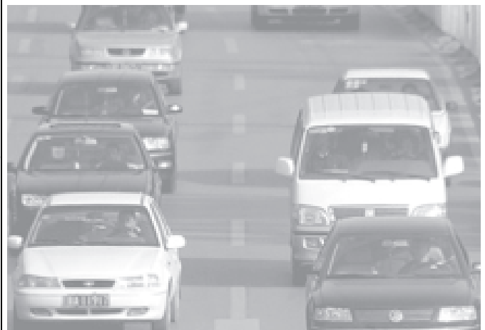
Cars on a busy road in Beijing, on 8 May, 2005.