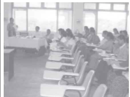
Presentation of research papers on ancient pagodas in Thanlyin-Kyauktan region organized by English Language Teaching Diploma Course of the University of East Yangon on 6-5-2005.— (H)