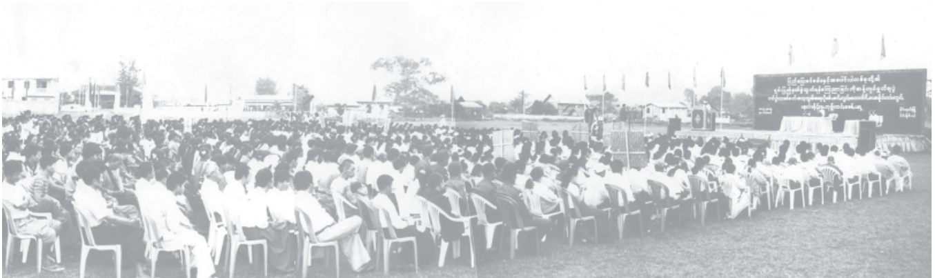
A mass rally to protest against and denounce declaration on secession of Shan State from the Union in progress in Mongrai.

Emergence of the State Constitution is the duty of all citizens of Myanmar Naing-Ngan.