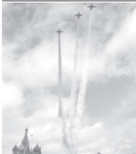
Russian fighters fly over St Basil's Cathedral in Red Square in Moscow during the military parade, on 9 May, 2005.

Asked whether India was "cosying up" to the US too much, Singh said, "Indo-US relations are not at the expense of some other country. So, why should it affect relations with any other country?" — MNA/PTI