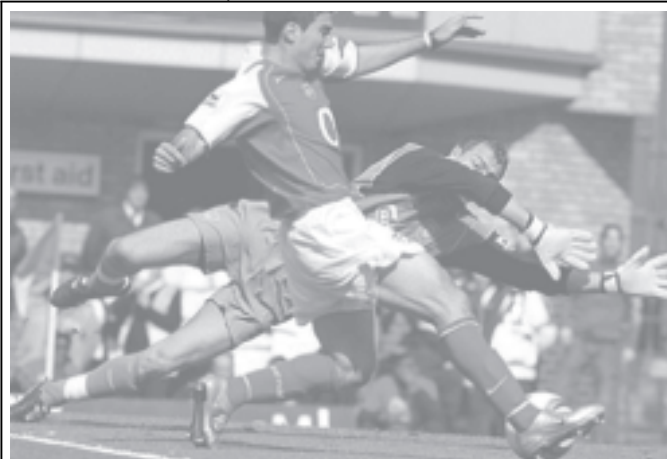
Arsenal's Jose Antonio Reyes has a chance at goal as he beats Liverpool's goalkeeper Jerzy Dudek during their Premiership match at home to Arsenal. The gunners won 3-1 at Highbury to send Everton into the Champions League.