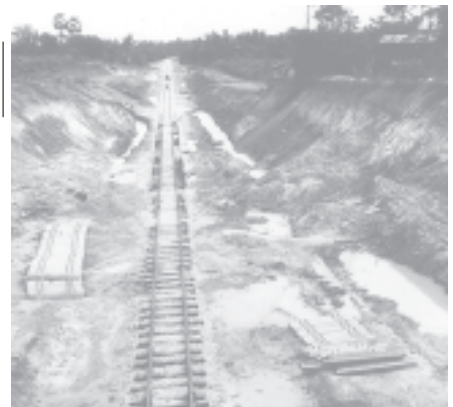
The railroad under construction in Daungzayat Ward, Mawlamyine, Mon State.

International Ltd's Rubber Plantation reported on progress of rubber growing.