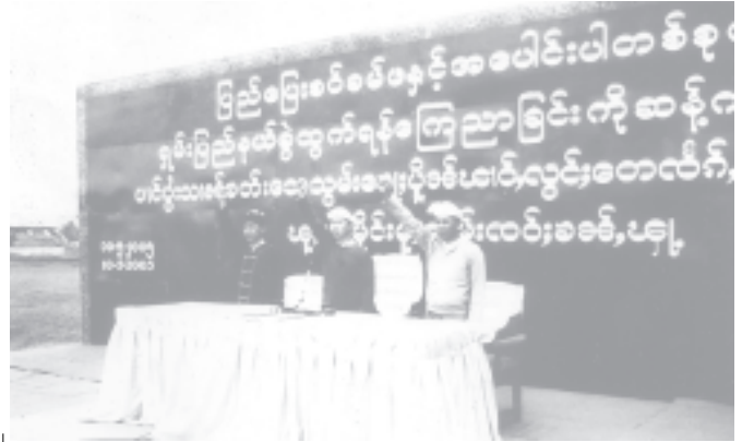
Members of the panel of chairmen and those present chanting the slogans at the rally.