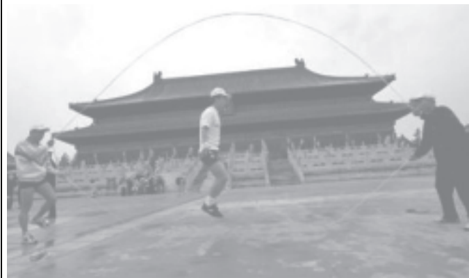
Chinese performers show traditional recreational games during the opening ceremony of 'Beijing-An Olympic City in view' photography contest in Beijing, on 10 May, 2005.