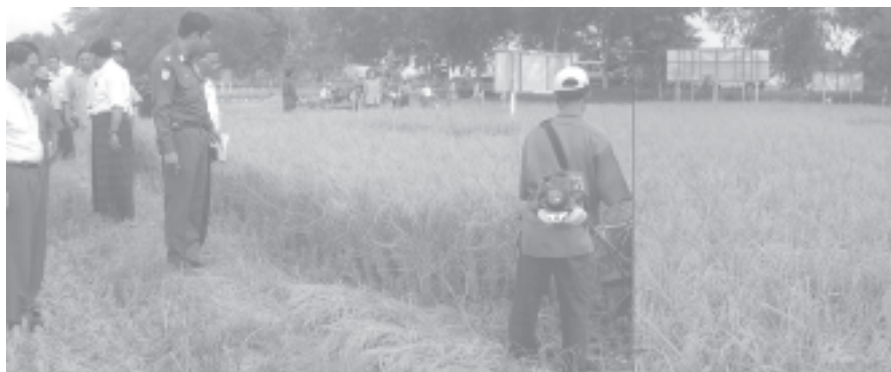
Minister Maj-Gen Htay Oo inspects harvesting of summer paddy on 5 May.— (A & 1)