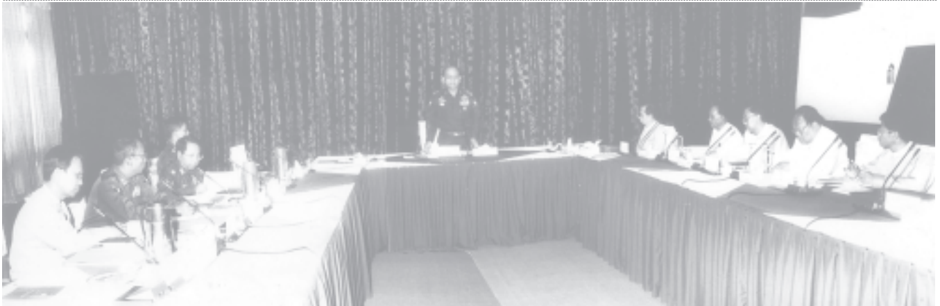
NCCC Chairman Secretary-1 Lt-Gen Thein Sein addresses the meeting No 2/2005 of the National Convention Convening Commission.

YANGON, 10 May — National Convention Convening Commission Meeting No 2/2005 took place at its meeting hall in Kyaikkasan Grounds at 3 pm today, with an address by Chairman of NCCC Secretary-1 of the State Peace and Development Council Lt-Gen Thein Sein.