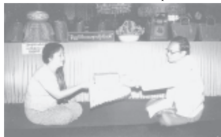
A wellwisher presents cash donation to an official.

YANGON, 10 May— A ceremony to drive stake, lay cornerstone and donate cash for Golden Jubilee Seintoe Dhammayon of Monyin Vipasana on Mindhanna Road in Bahan Township was held this