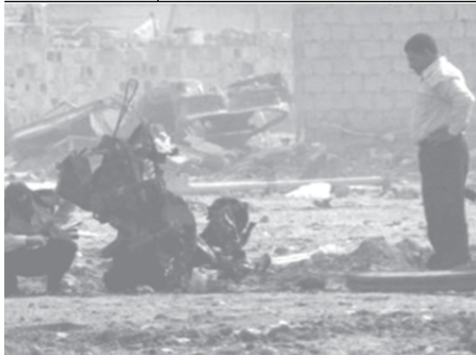
Iraqi police examine the scene following a car bomb attack in southern Baghdad, on 9 May, 2005.