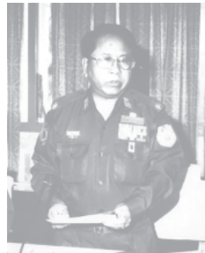
NCCC Secretary Minister for Information Brig-Gen Kyaw Hsan.