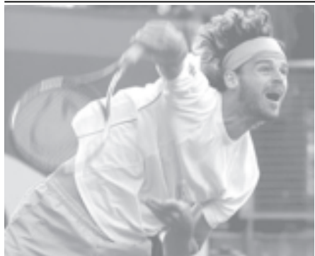
Gustavo Kuerten of Brazil serves during his match against Andrei Pavel of Romania at the ATP Masters Series tennis tournament in Hamburg, Germany. Kuerten won 6-2, 6-1.

"If the association (FA) would like to do so, if they are taking contact with us, they should make a proposal that would mean extending the number of teams from England in the Champions League next time from four to five." — MNA/Xinhua