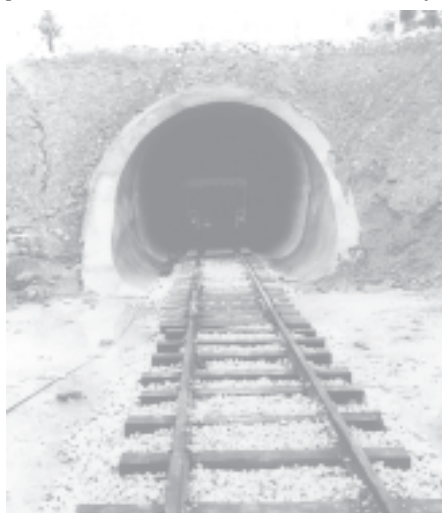
The tunnel being built under Mawlamyine-Mudon Road in Daungzayat Ward, Mawlamyine.

At the construction site of the Approach Railroad leading to new Mawlamyine Railway Station, Lt-Gen Maung Bo and party viewed work being carried out with use of heavy machinery.