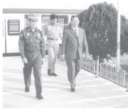
Minister Maj-Gen Thein Swe welcomes back Deputy Minister U Pe Than and party. — TRANSPORT

YANGON. 10 May— A Myanmar delegation led by Deputy Minister for Transport U Pe Than arrived back here this morning after attending the Third Officials Meeting on Kaladan Multi-purpose Project held in New Delhi, India, from 5 to 7 May. The delegation was welcomed back at Yangon International Airport by Minister for Transport Maj-Gen Thein Swe, Deputy Minister Col Nyan Tun Aung and departmental heads. — MNA