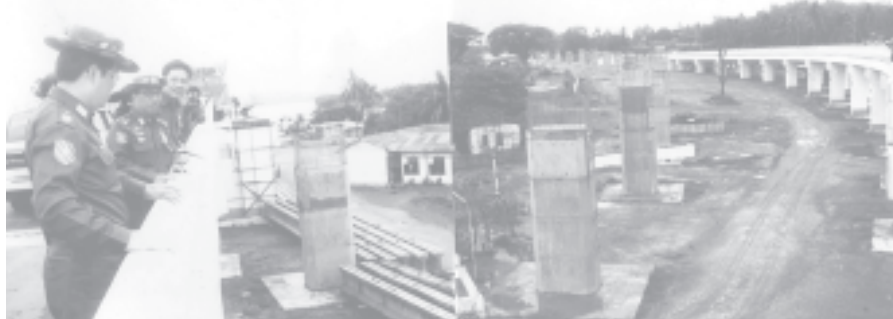
Lt-Gen Maung Bo inspects the project site for construction of the approach railroad (Mawlamyine bank) to Thanlwin Bridge (Mawlamyine).

After that, Lt-Gen Maung Bo, Commander Maj-Gen Thura Myint