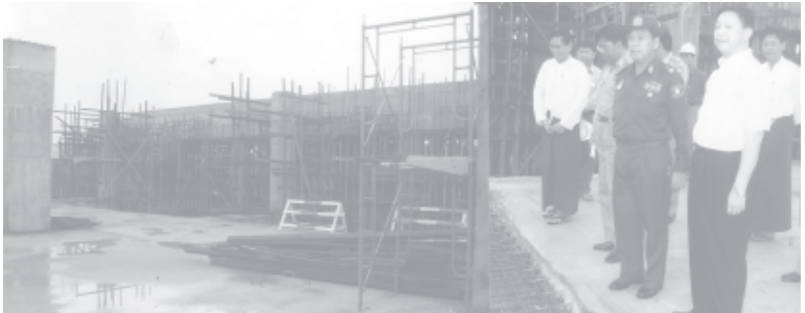
Minister Maj-Gen Thein Swe views tasks for the upgrading of Yangon International Airport. — TRANSPORT

Director-General of Department of Civil Aviation U Tun Hlaing gave a supplementary report. The minister oversaw progress