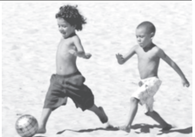
Brazilian children play soccer on Copacabana beach in Rio de Janeiro on 4 May, 2005.