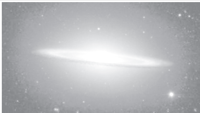
This image released by NASA on 5 May, 2005 shows the Sombrero galaxy. The galaxy, called Messier 104, is commonly known as the Sombrero galaxy because in visible light it resembles a broad-brimmed Mexican hat called a sombrero. The new Sombrero picture combines a recent infrared observation from NASA's Spitzer Space Telescope with a well-known visible light image from NASA's Hubble Space Telescope. —INTERNET

Betancourt said that under the document, a new scope will be opened up for bilateral cooperation, which will be extended to such important areas as malaria control, health research and alternative medicine. Zhang said the signing of the agreement has opened the way for increased cooperation between the health authorities of the two countries. —MNA/Xinhua