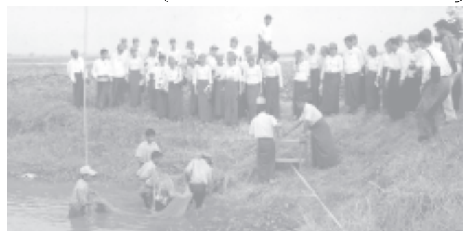
USDA members observe fish breeding ponds in Pathein.