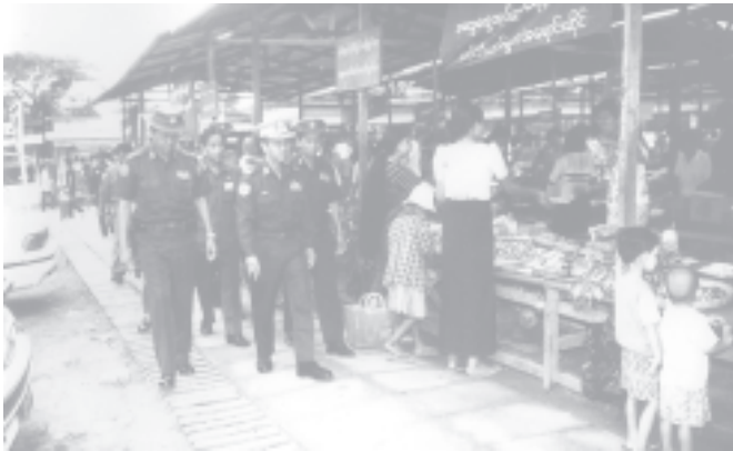
Maj-Gen Myint Swe inspects tax-free market in Yankin Township.

First, the commander visited Konmyinthathax free market in Mayangon Township, Nawade tax free market on Swedaw Road, Yankin tax free market in Yankin Township, Tamway tax free market in Tamway Township, Pantra tax free market in Dagon Township and Hanthawady tax free market in Kamayut Township and inspected sale of goods at the shops