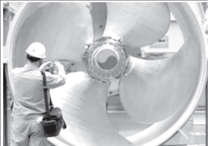
A Hyundai Heavy Industries worker takes a picture of a part of a new diesel engine at its unveiling ceremony in Ulsan, south of Seoul, on 6 May, 2005.

South Korea's Hyundai Heavy Industries Co. has achieved an aggregate of 50 million horsepower in 2-stroke engine for the first time in the world. —INTERNET