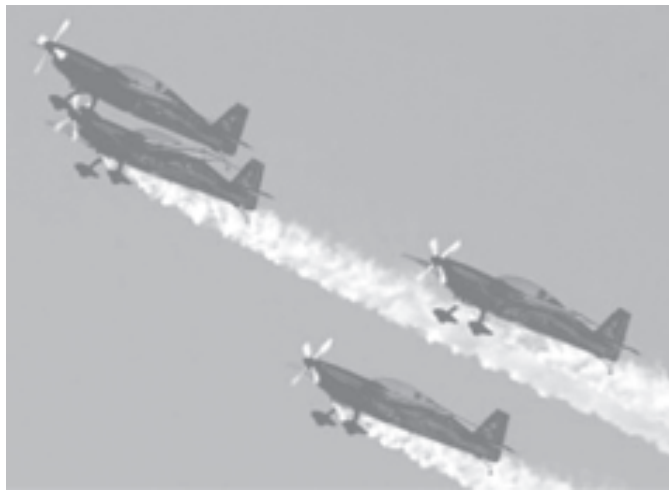
Royal Jordanian Falcons perform during an air show at the start of the Jordan International Rally in Amman on 5 May, 2005.