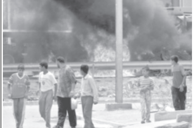
Iraqi people leave the spot where a US Army vehicle burns after it was hit by a suicide car bomb in the Dorah District of Baghdad, Iraq, on 5 May, 2005. At least 20 people were killed in three separate attacks targeting Iraqi and US security forces in Baghdad on Thursday.