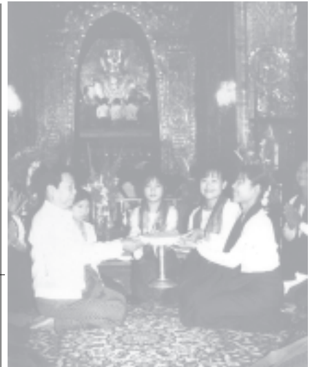
USDA members present cash donations to the funds of Maha Muni Buddha Image of Mandalay to an official.