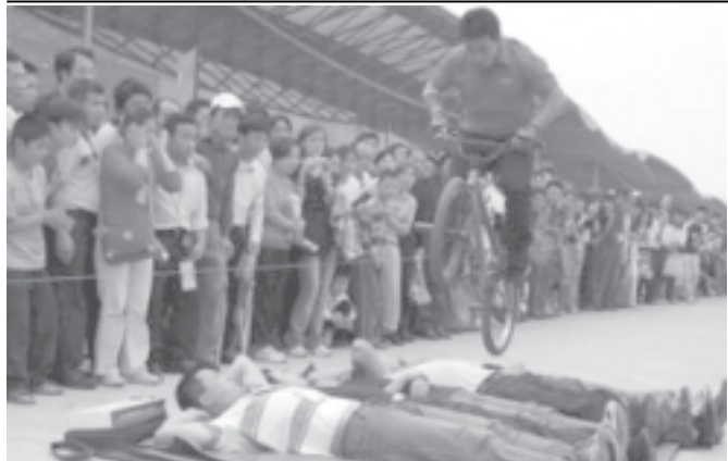
Chinese visitors look at a cyclist jumping over six people during a performance at the 15th China International Bicycle & Motor Fair in Shanghai on 4 May, 2005. 120,000 visitors from over 80 nations and regions are expected to attend the fair from Wednesday to Saturday.

Since May 1, 2003, when President Bush declared that major combat operations in Iraq had ended, 1,454 US military members have died, according to AP's count. That includes at least 1,108 deaths resulting from hostile action, according to the military's numbers.—Internet