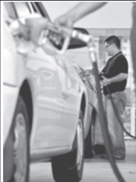
Malaysian motorists pump petrol in Kuala Lumpur on 5 May, 2005.

Technology. Experts said the country's vast area of low-yield farmland, salina, grassland and dry land can serve as a huge production base for biological materials. China has more than 260 million hectares of unarable land and more than 66 million hectares of grassland. In the country's rural areas, about 600 million tons of crop stalks lie wasted in fields, according to experts.—MNA/Xinhua