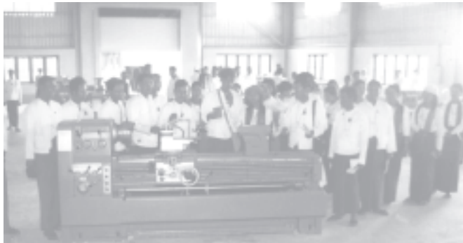
USDA members visit Foundry Plant in Ayethaya Industrial Zone of Taunggyi Township.—MNA

USDA Commander of South-East Command Maj-Gen Thura Myint Aung hosted a dinner in honour of them at the hotel.