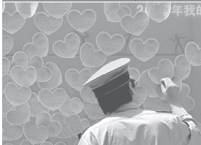
A security guard posts a heart-shaped entry form amidst hundreds of others as part of a lottery to win a car in central Beijing recently. — INTERNET