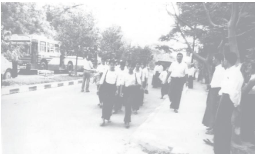
Youth delegates from States and Divisions on arrival at Bagan-NyaungU.

YANGON, 6 May —Youth delegates from States and Divisions who will attend the Youth Seminar in Bagan Archaeological Region arrived Bagan-NyaungU by car, train and air today.