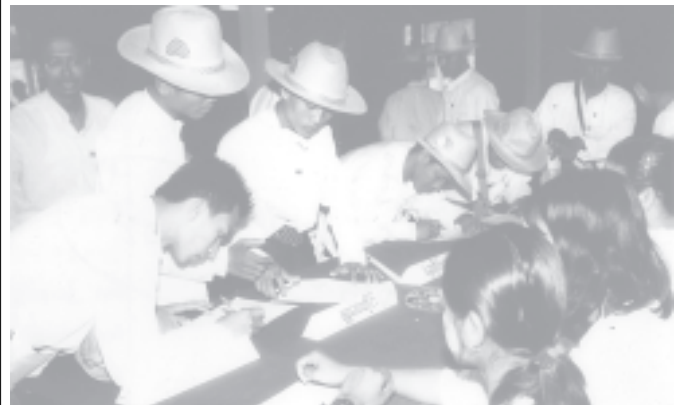
Youth delegates from States and Divisions on arrival at Bagan-NyaungU.