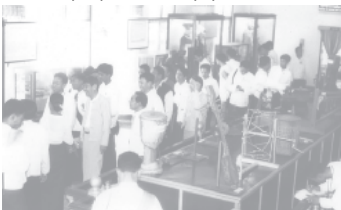
USDA members visit Cultural Museum in Kengtung.— MNA

At Government Technological College in Kengtung, they attended the tree planting ceremony. The commander planted a Gangaw sapling ( Mesua ferrea ). The youth also planted oak saplings. In the evening, the commander hosted a dinner to the excursion group members at new Kengtung Hotel. — MNA