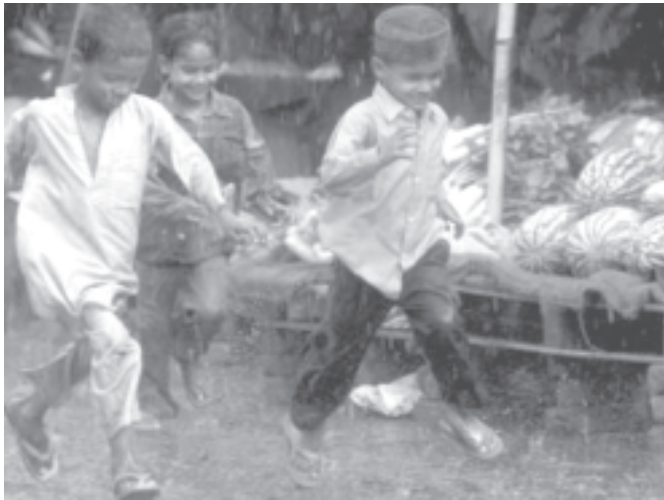
Indian children run in the rain on a street in New Delhi on 4 May, 2005.