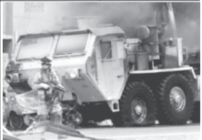
A US soldier stands next to a burning army truck destroyed by a car bomb in Baghdad on 5 May, 2005.

"I know Iraq has been a divisive issue in this country, but I hope now that we can unite again and look to the future there and here," he said after results gave him a resounding victory in his constituency of Sedgefield in northeastern England. Blair had to win his seat to keep his job as prime minister.