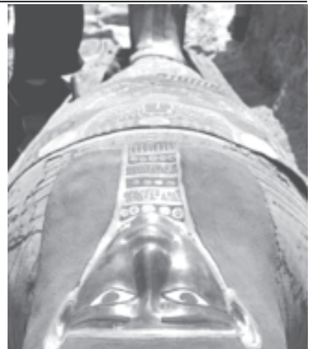
A 2,300-year-old mummy is displayed after it was found near the Saqqara Pyramids south of Cairo, on 3 May, 2005.

“We have revealed what may be the most beautiful mummy ever found in Egypt,” said Zahi Hawass. “The artists who made this mummy more than 2,300 years ago demonstrated the brilliance of the ancient Egyptians by using stunning colours and depicting his face so graphically.” He added that experts will use CT scanning technology within the next week to reveal more details about the ancient Egyptian’s identity. In February, Australian archaeologists discovered in the same area one of the best preserved ancient Egyptian mummies which were made about 2,600 years ago.