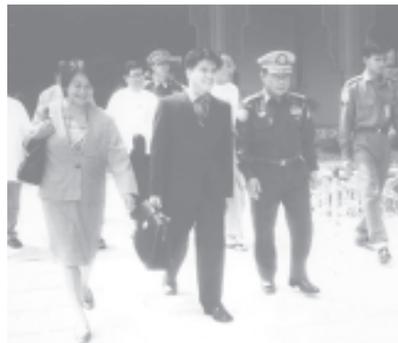
Minister of Environment and Natural Resources Mr Michael T Defensor and party of the Philippines being seen off at the airport. — MNA

YANGON, 6 May — Minister for Forestry Brig-Gen Thein Aung saw off Minister of Environment and Natural Resources Mr Michael T Defensor and party of the Philippines at Yangon International Airport this morning.