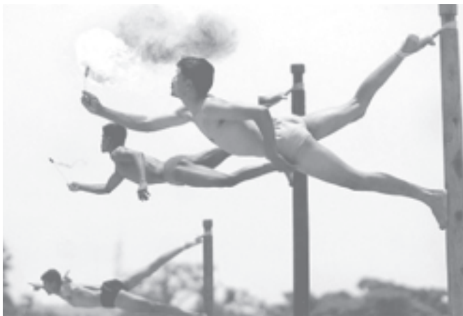
Indian soldiers perform a routine with fire while strapped to telephone poles during a rehearsal for the ‘Know Your Army Exhibition’ in Bangalore on 4 May, 2005.—INTERNET

Removal of the travel ban came after Chen’s announcement of the Mainland’s decision to present a pair of giant pandas to the Taiwan compatriots. — MNA/Xinhua