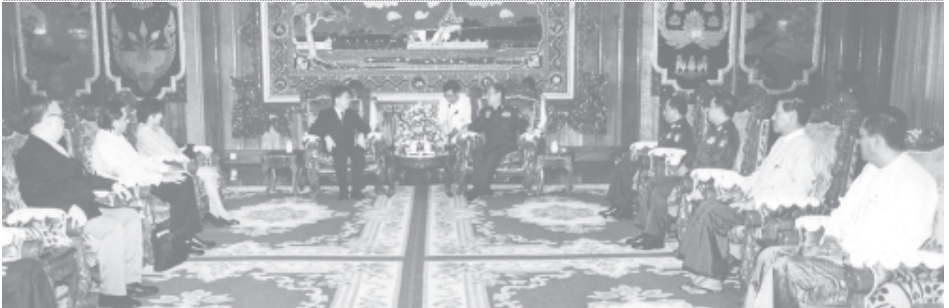
Prime Minister Lt-Gen Soe Win receives Minister of Environment and Natural Resources of the Philippines Mr Michael T Defensor.

YANGON, 5 May — Prime Minister Lt-Gen Soe Win received Minister of Environment and Natural Resources of the Philippines Mr Michael T Defensor and party at Zeyathiri Beikman on Konmyinthar at