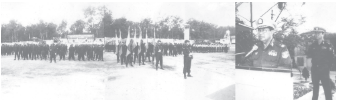
Minister Maj-Gen Sein Htwa delivers a speech at the 59th Anniversary Fire Services Day Parade.