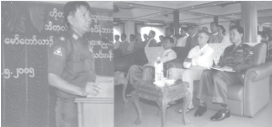
Deputy Minister for Hotels and Tourism Brig-Gen Aye Myint Kyu delivers a speech at the conclusion ceremony of the basic Italian and Spanish courses and tour guide course for drivers at Panda Hotel.