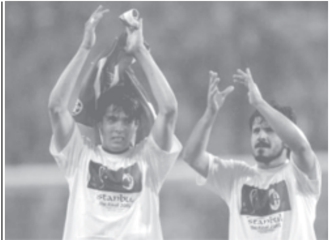
AC Milan's Gennaro Gattuso (R) and team mate Kaka celebrate after the Champions League semi-final second leg soccer match against PSV Eindhoven at the Philips Stadium in Eindhoven, the Netherlands on 4 May, 2005. AC Milan qualified for the final despite losing 3-1. Milan went through on the away goals rule to set up a final clash with Liverpool in Istanbul on 25 May.