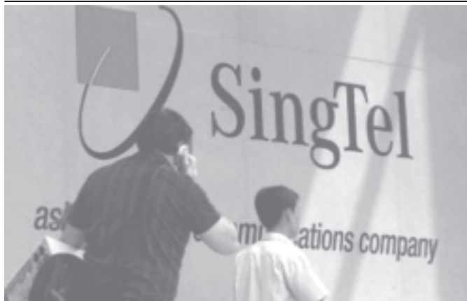
People pass a SingTel billboard on 3 May, 2005. Singapore Telecommunications (SingTel) said its Asian mobile subscriber base rose 37 percent to almost 65 million as of end March.