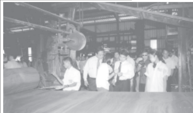
Minister of Environment and Natural Resources Mr Michael T Defensor and party visit Wood-based Products Factory of Chin Su May Flower Co in Bago.

Both sides of the foundation of each pillar protrude about 15 feet from the pillar. So, priority is to be given to the down-vessels in approaching the entrance, and two-fold vessels attached to each other are not allowed to pass through the entrance. — MNA