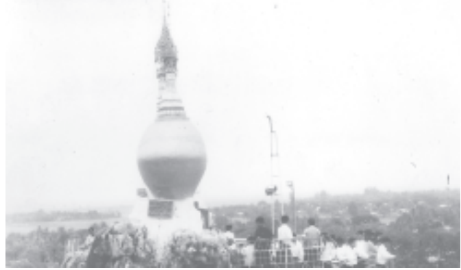
USDA members visit Thiri Mingala Taungdaw (Taunggye) Pagoda in Loikaw.

On 4 May, they planted the trees at the home for the aged in Loikaw together with departmental officials