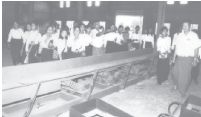
USDA excursion group members view round foundry plant at Monywa Industrial Zone.

On 4 May, they planted the trees at the home for the aged in Loikaw together with departmental officials