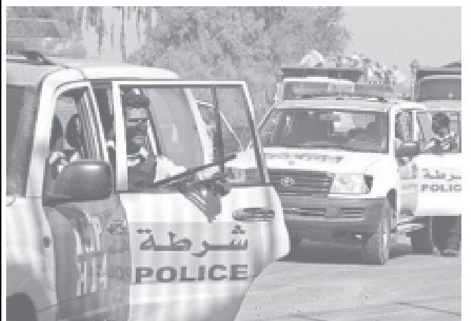
Iraqi police stop traffic after a roadside bomb exploded close to Baghdad airport on 4 May, 2005.