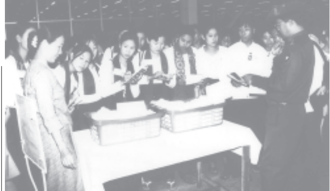
USDA members observe Textile Factory (Pwintbyu) of Myanma Textile Industries in Pwintbyu.— MNA