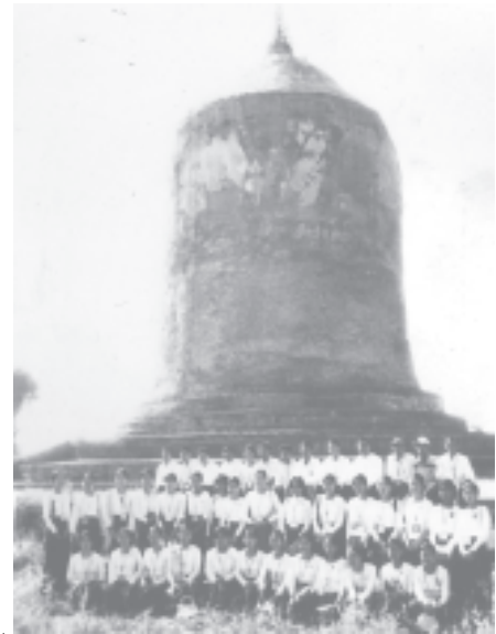
USDA members pose for documentary photo at ancient historic Bawbawgyi Temple.

Monywa, Sagaing Division arrived at Saipyingyi Model Village in Dabayin Township and visited the birthplace of Ledi Sayadaw and stone inscription warehouse. In the afternoon, they paid homage to Mahashwesigyi Pagoda. Afterwards, they visited Thaphan seik Dam and hydel electric power station. They proceeded to Yokepyo special clinic and medicine production factory. On 3 May, they visited Bio blue-green algae medicine production factory of the Ministry of Industry-1 in Budalin Township. In the afternoon, they visited factories in Monywa Industrial Zone. In the evening, they exchanged the views on excursion experiences at the office of Sagaing Division USDA.