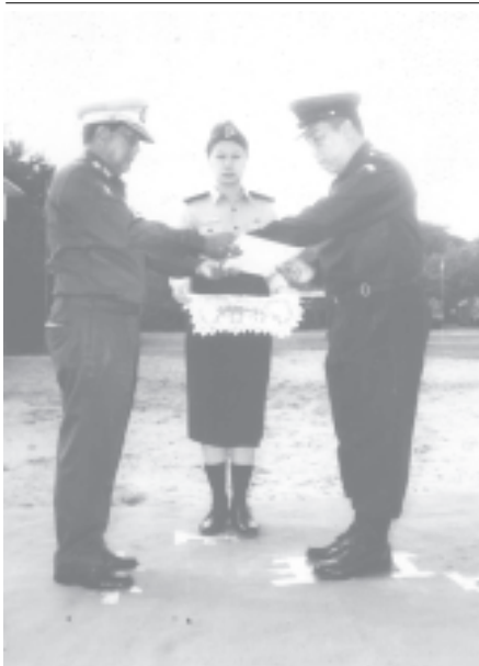
Minister for Social Welfare, Relief and Resettlement Maj-Gen Sein Htwa presents certificate to a Ye Thurein title winner. (News on page 16)