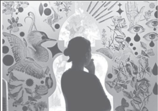
A Thai woman is silhouetted against an artistic window decoration at an interior design shop in Bangkok, on 3 May 2005.