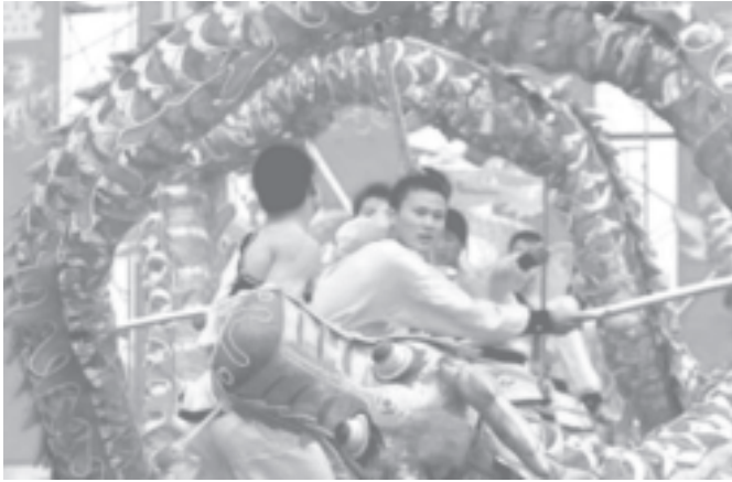
A group of performers perform a dragon dance during the National Elite Dragon & Lion Dance Contest in Nanjing, east China's Jiangsu Province on 4 May, 2005.