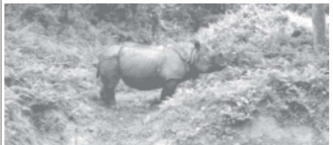
A one-horned rhinoceros at the Jaldapara Wild Life Sanctuary. The endangered one-horned rhino population in this eastern India sanctuary has risen 14 percent in the last two years as an anti-poaching drive continues to yield results, an official said.