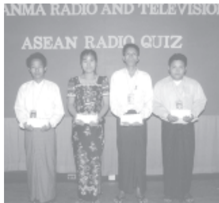
Prize Winners of ASEAN Radio Quiz for April seen at MRTV on 3 May.

the winners will be given handsome prizes and transportation expenses. — MNA