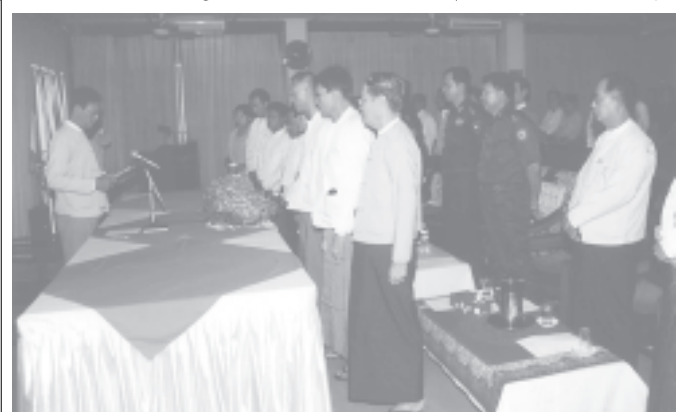
Members of the board of directors of Sakura Technological Services Cooperative Society Ltd reciting oaths at its formation ceremony. COOPERATIVE