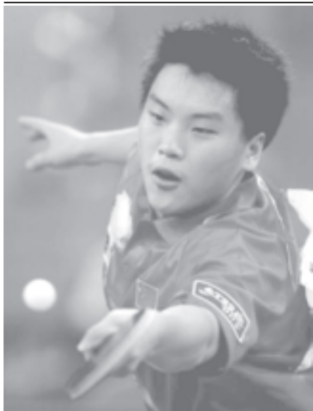
Hao Shuai of China in action against Michael Maze of Denmark during their men's singles quarter-final match at the 48th World Table Tennis Championships in Shanghai, China, on 5 May, 2005. Maze won the match 4-3.