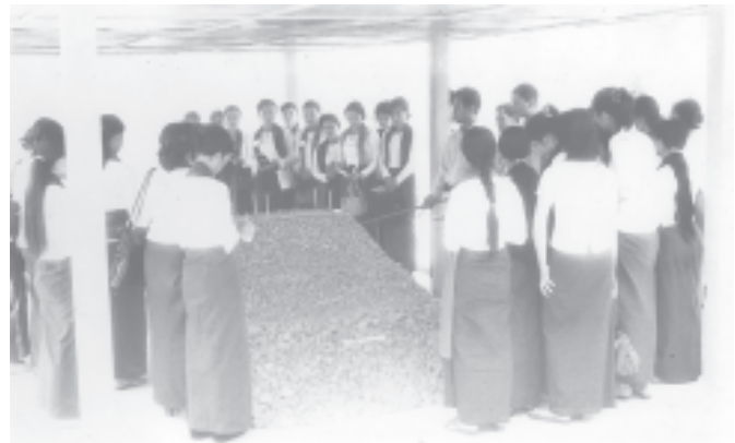
USDA members visit Shwegyin Hydel Power Plant.— MNA

and social organization members. Next, they served refreshments to 17 aged persons and donated K 300,00 to them and visited Thirimingalar Market.— MNA