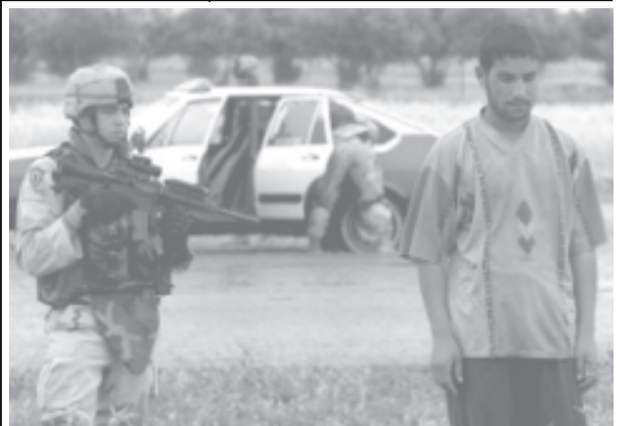
A US soldier guards an Iraqi man as soldiers search his car in the city of Mosul recently.