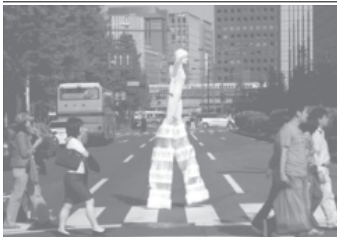
A street performer crosses a crosswalk in central Tokyo on 3 May, 2005. Tokyo metropolitan government supports some street performers as part of its cultural work.