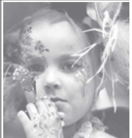
A seven-year-old model prepared by stylist Yulia Kirichenko is pictured during the first open championship of hairdressers art, decorative cosmetics, modeling and nail design at Siberian fashion week in the city of Krasnoyarsk, on late 28 April, 2005.