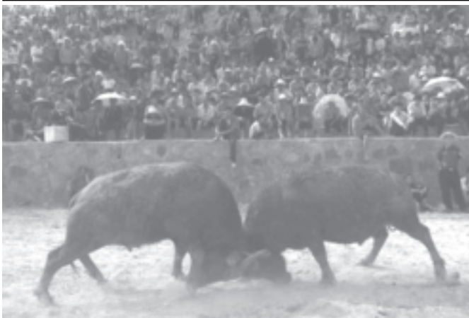
Chinese villagers look at a water buffalo fight in Kaili, southwest China's Guizhou Province, on 3 May, 2005.