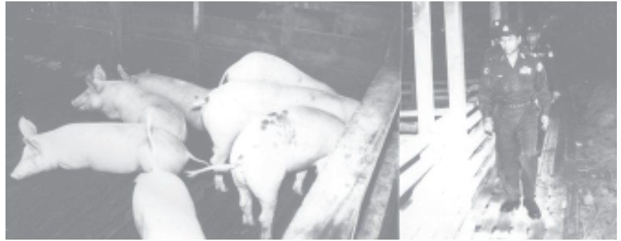
Commander Maj-Gen Myint Swe inspects pigsty of Yangon Command.

YANGON, 5 May — Chairman of Yangon Division Peace and Development Council Commander of Yangon Command Maj-Gen Myint Swe visited farms of Yangon Command this evening.