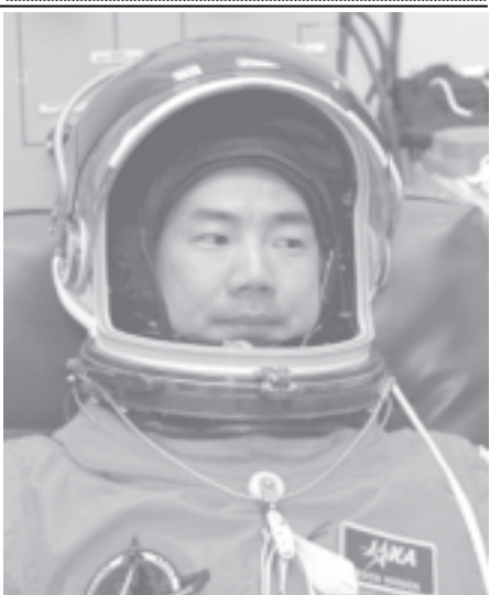
During the Terminal Countdown Demonstration Test at NASA's Kennedy Space Center, STS-114 crewmember Soichi Noguchi of Japan is fitted in his launch suit in Cape Canaveral, Florida on 3 May, 2005.