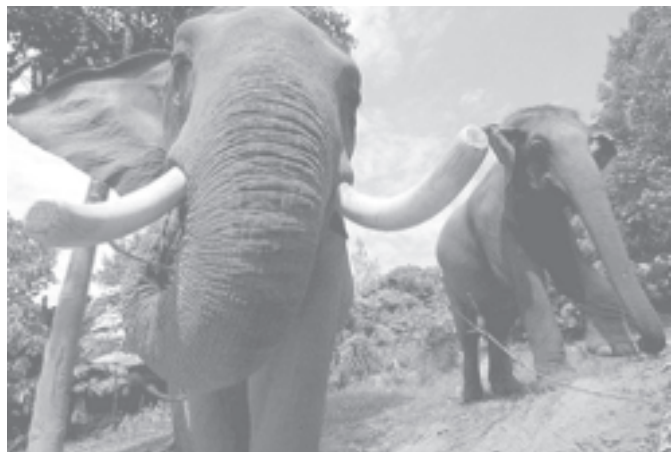
Thai elephants graze in the town of Khao Lak, Phang Nga Province in southern Thailand, on 3 May, 2005.