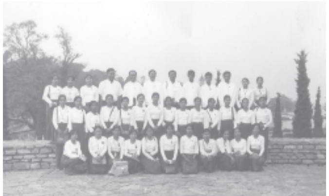
USDA excursion group members pose for documentary photo at National Kandawgyi Gardens in PyinOoLwin.

They arrived back Mandalay in the evening. MNA