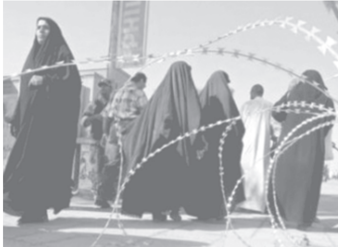
Iraqi women pass by a concertina wire at a checkpoint near the convention centre in Baghdad, on 3 May, 2005.