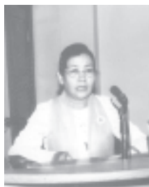
Chairperson of Mandalay Division Supervisory Committee for MCWA. — MNA

The unjust economic sanctions led to the closure of more than 160 garment factories and the reduction of workforces at 40 other factories.