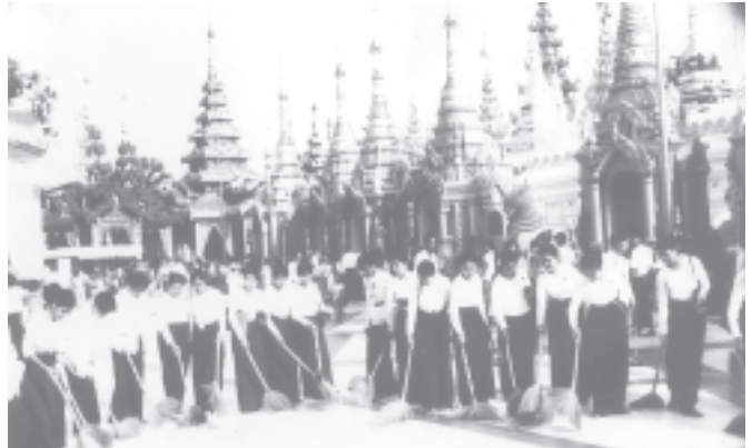
USDA youth excursion group from states and divisions carry out sanitation work at Shwedagon Pagoda.

YANGON, 4 May — The USDA youth excursion group from states and divisions visited Shwedagon pagoda this morning and paid homage to the pagoda.