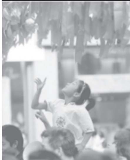
A girl, perched on the shoulder of her father, plays in a park in Shanghai on 2 May, 2005. UP to 3.8 million tourists are expected to visit Shanghai during the week-long May Day Holiday.