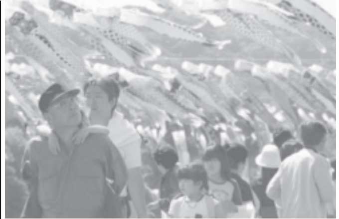
Holidaymakers view thousands of carp streamers, a symbol of good health and strength for children, hanging on the bank of the Sagami River in Sagami-hara, southwest of Tokyo on 3 May, 2005. About 1200 carp streamers are put up to celebrate the Japanese national Children's Day holiday on 5 May.