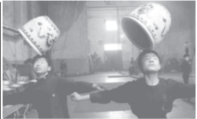
Young Chinese acrobats practice balancing a jar on their heads in the training room of an acrobatic troupe in Changzhi, in north China's Shanxi Province, on 19 April, 2005. The troupe has 40 members, mostly from rural areas, aged between six and 15.