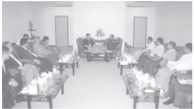
Minister for Forestry Brig-Gen Thein Aung receives Philippine Minister of Environment and Natural Resources Mr Michael T Defensor.— FORESTRY

YANGON, 4 May—Minister for Forestry Brig-Gen Thein Aung received Minister of Environment and Natural Resource of the Philippines Mr Michael T Defensor