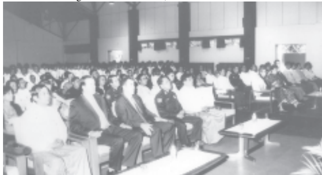
Minister for Health Dr Kyaw Myint speaking at Get-together of Outstanding Red Cross Members (2005).

In the afternoon, talks on social welfare and relief tasks of the ICRC and the IFRC took place at No 2 Basic Education High School in Latha, where the get-together is being held. The get-together continues till 10 May.