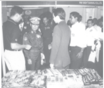
Deputy Minister for Commerce Brig-Gen Aung Tun views booths of Thailand Exhibition 2005.