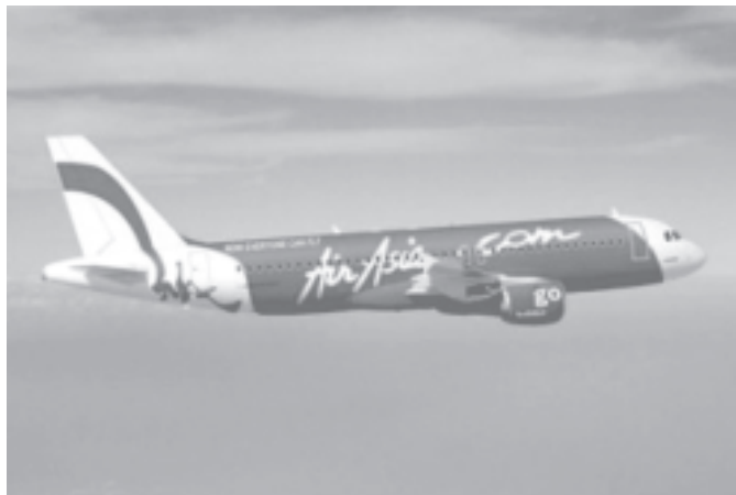
An Airbus A320 in Air Asia livery seen on 3 May, 2005. Malaysia's AirAsia Bhd— the region's biggest budget carrier — signed a purchase order for 60 Airbus A320 aircraft and took options to buy 40 more.