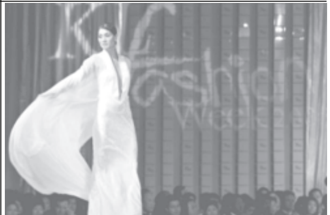
Miss Thailand 1992 and supermodel Metinee Kingpoyome wears a creation designed by her compatriot Nagara during the KL Fashion Week Gala Night at a hotel in Kuala Lumpur, Malaysia, on 3 May, 2005.