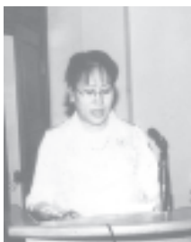
Chairperson of Yangon Division Supervisory Committee for MCWA.