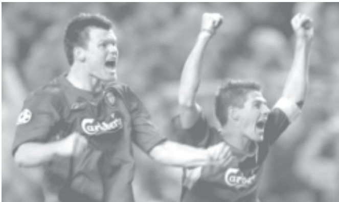
Liverpool's Steven Gerrard (R) and John Arne Riise (L) celebrate beating Chelsea in their Champions League semi-final soccer match at Anfield, Liverpool, on 3 May, 2005.