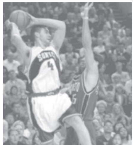
Seattle SuperSonics forward Nick Collison (4) looks to make a midair pass after saving the ball from going out of bounds as Sacramento Kings' Peja Stojakovic (R) tries to block him during the first quarter of their Western Conference first round NBA playoff game five at Key Arena in Seattle, on 3 May, 2005.