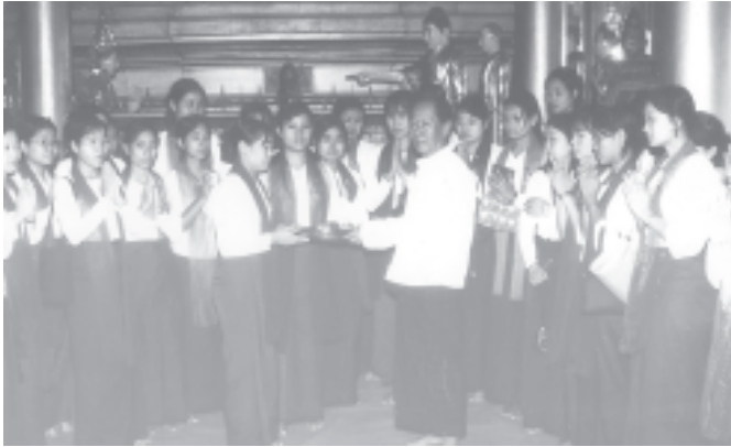
USDA excursion group members present cash donation to the funds of Seinthalyaung Pagoda in Bago to Pagoda Board of Trustees.