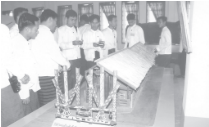
USDA excursion group members visit Kachin State Cultural Museum in Myitkyina.— MNA

The youth next visited the confluence, Kareinnaw resort, Bala Min Htin Bridge and Washaung Dam. —MNA