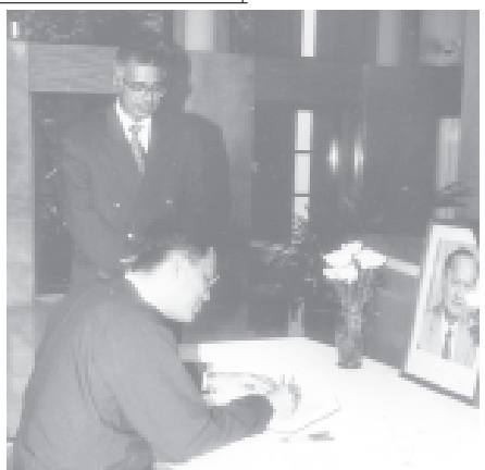
Deputy Minister for Foreign Affairs U Maung Myint signs book of condolences for former Singaporean President Dr Wee Kim Wee.