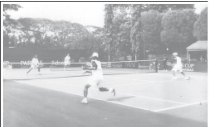
Athletes taking part in 2005 Davis Cup Asia Oceania Zone Group IV Sunday.