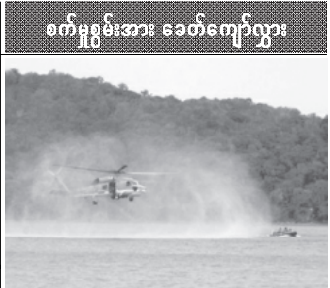
Thai rescue workers take part in a tsunami evacuation drill on the Thai tourist island of Phuket, on 29 April, 2005.