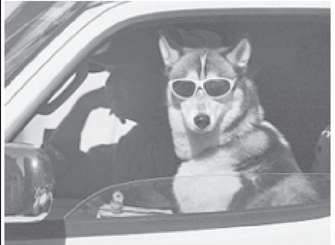
A Siberian Husky sports a pair of sunglasses as it sits in the passenger seat of a van stopped at traffic lights in Sydney recently.

A revision of policy regarding teachers is also under the government's consideration. When implemented, it will enable the transfer of government school teachers from one district to another to bring about uniformity in the teacher-student ratio, he added.—MNA/Xinhua