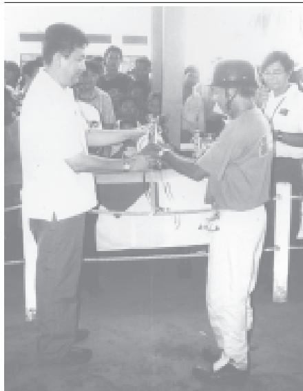
President U Pyone Maung Maung of Myanmar Equestrian Federation presents award to one of the winners of equestrian competitions Sunday.

give 50 armoured vehicles to Palestinian security forces and two transport helicopters to Abbas. We have officially asked the Quartet committee to press Israel to let the Palestinians rebuild security apparatuses battered by Israel over the last four years of violence," Rudeineh said. — MNA/Xinhua