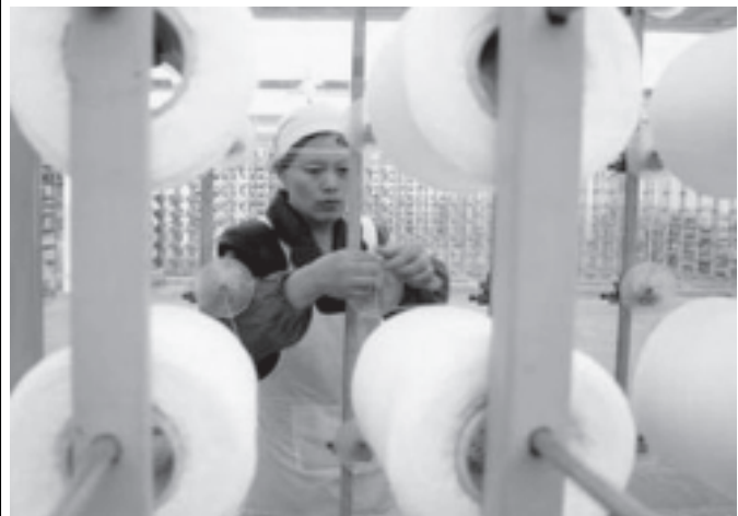
A Chinese woman works in a yarn and fabric company in Liaocheng, in east China's Shandong Province on 30 April, 2005.