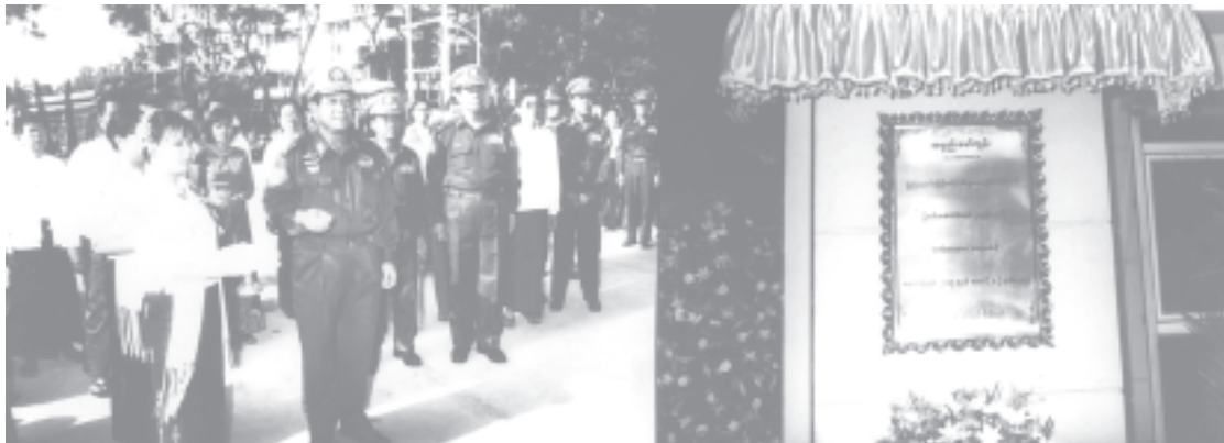
SPDC Member Lt-Gen Tin Aye presses the button to open stone inscription of Myawady Bank (Bayintnaung) new building.