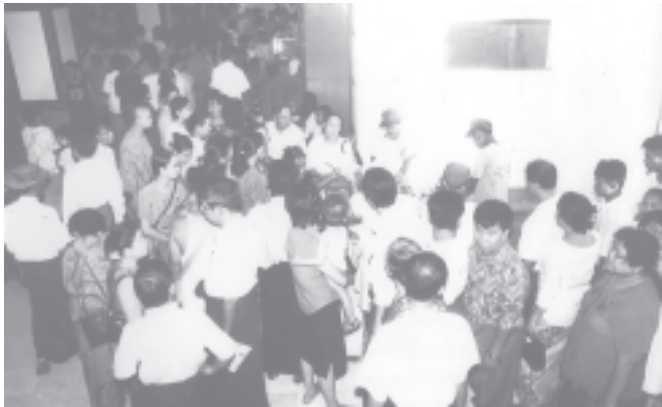
Tilapia Fish Festival 2005 crowded with people.

YANGON, 1 May — Under the leadership of the Ministry of Livestock and Fisheries, the Tilapia Fish Festival 2005, co-organised by Myanmar Fisheries Federation and Myanmar Fisheries Entrepreneurs Association, continue in the compound of MFF at the corner of Bayintnaung Road and the road to Pharmaceutical Factory in Insein Township at 3 pm today.