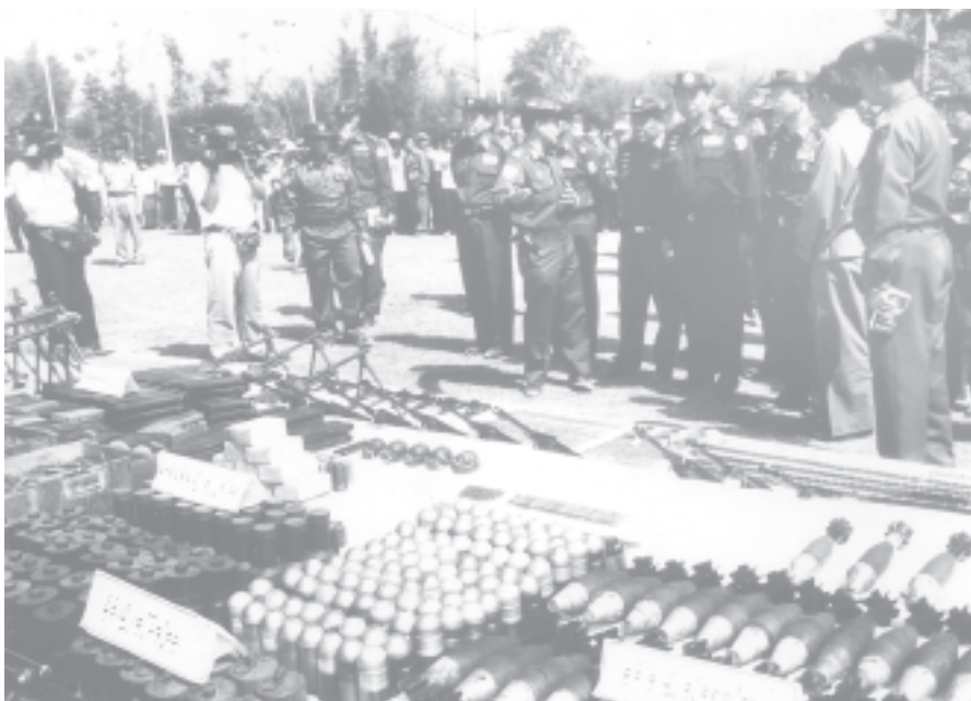
Secretary-1 Lt-Gen Thein Sein inspects 35 small weapons and communication devices of Brigade-11 of SSNA.