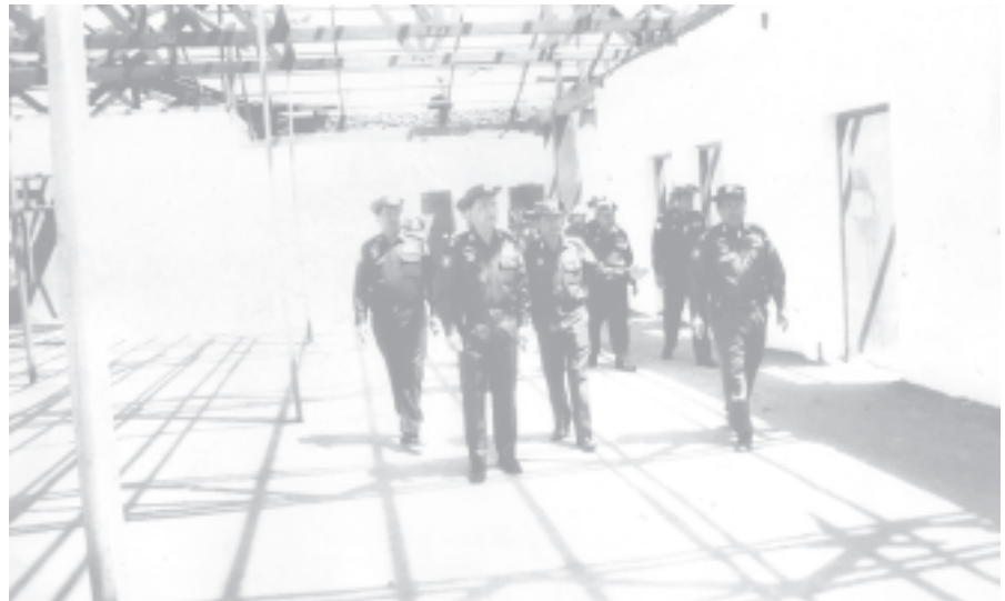
Lt-Gen Thein Sein inspects construction of the offices of State Organization for Women's Affairs and Maternal and Child Welfare Association.