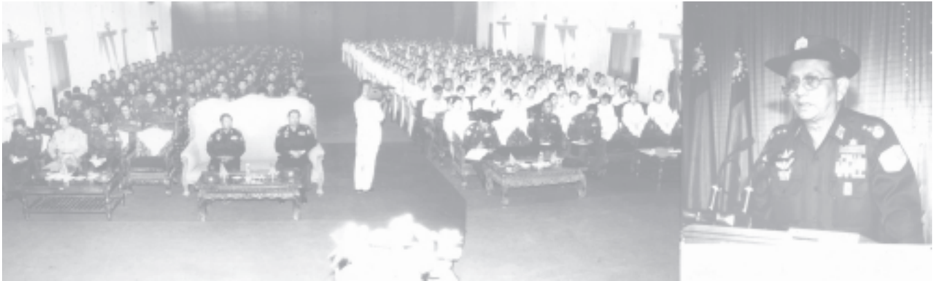
Secretary-1 Lt-Gen Thein Sein speaks in meeting with officers and other ranks and their families of Lashio Station at the North-East Command in Lashio.

YANGON, 1 May—Secretary-1 of the State Peace and Development Council Lt-Gen Thein Sein on 29 April met officers and other ranks and their families of Lashio Station at the station hall of North-East Command in Lashio and made a speech on the occasion.