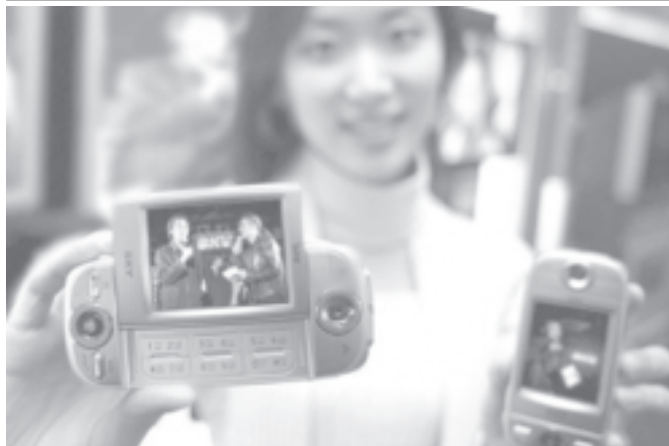
A South Korean model shows a new DMB mobile phone capable of receiving terrestrial digital television broadcast signals in Seoul on 1 May, 2005.

Mandelson said he had been in dialogue with top Thai officials, stressing that Thailand should be mindful of long-standing relations with Europe and of European business interests, which are extensive in the automotive industry as well as other manufacturing sectors. "Thailand has encouraged European companies to invest here and encouraged strong economic ties and partnership between Thailand and Europe. We would like to see there are no setbacks," he said. —MNA/Xinhua