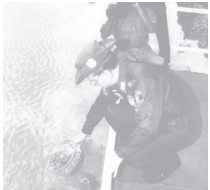
Secretary-1 Lt-Gen Thein Sein puts fish fries into Sanpya fish pond of the Shan State (North) PDC near Manhsu Village.—MNA

Later, the Secretary-1 and party visited the five-acre plantation of Hsinshweli paddy where they viewed thriving paddy and broadcasting of fertilisers.—MNA