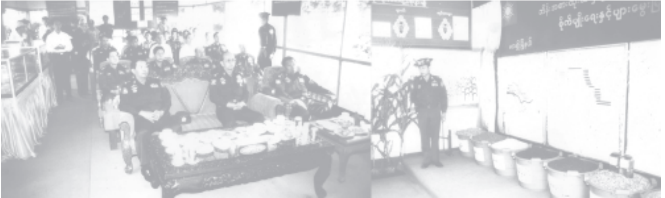
Secretary-1 Lt-Gen Thein Sein hears reports on opium substitute corn cultivation and bee keeping by Commander Maj-Gen Myint Hlaing