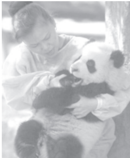
A breeder of Chengdu Panda Breeding and Research Base trains a baby panda in Chengdu, southwest China's Sichuan Province recently.