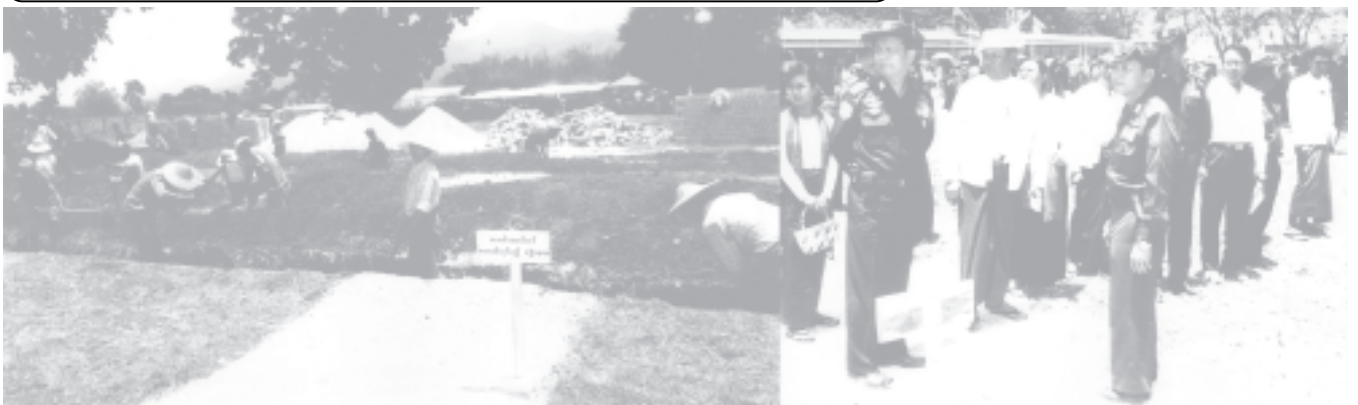
Secretary-1 Lt-Gen Thein Sein inspects earth works for construction of Mongyaw village Affiliated BEHS in Lashio. —MNA

The 24 special regions development project covers Taunggyi region, Lashio region, Kengtung region, and Panglong region, where national solidarity necessary for independence was conceived, in Shan State. Plans are well under way to help these four regions to develop at a high momentum.