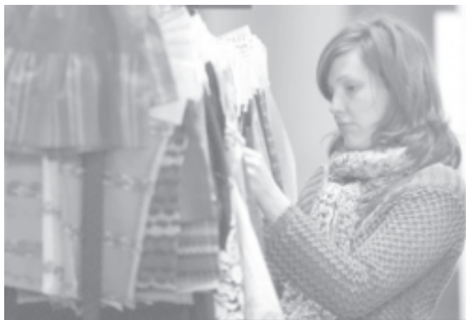
A fashion house buyer looks for materials for the new 2005/2006 Winter collections in Lille, Northern France at a textiles exhibition recently.