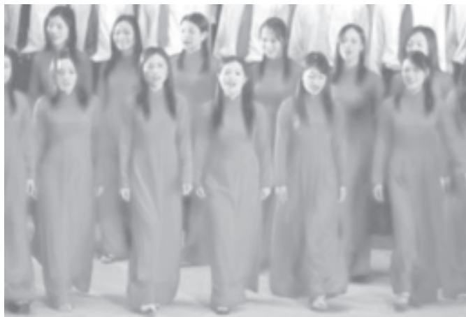
Vietnamese women in traditional 'ao dai' dresses perform during celebrations for the 30th anniversary of the end of the Vietnam War at the Batinh Hall in Hanoi on 29 April, 2005. —INTERNET

The two countries signed the Agreement on Maritime Transport in June 2000. — MNA/Xinhua