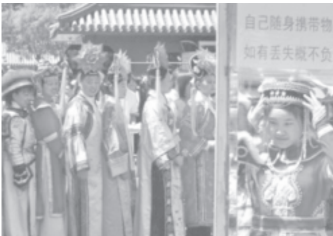
Visitors to Beijing's Forbidden City are photographed in imperial costume as they celebrate the May Day holiday in Beijing, on 1 May, 2005.

coordinator of the HIV/AIDS advisory team, said the Armed Forces, police and other uniformed services around the world face a serious risk of HIV/AIDS and other sexually transmitted diseases, due to mainly the nature and characteristics of their profession.