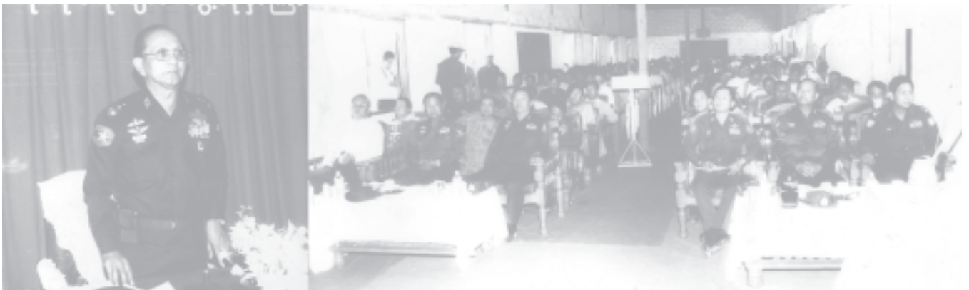
Secretary-1 Lt-Gen Thein Sein at a meeting with departmental heads, social organizations and local people at Affiliated BEHS in Mongyaw village, Lashio.

After the meeting, the Secretary-1 had a cordial conversation with U Kan Na, U Pwan Wan and members, departmental officials, and local