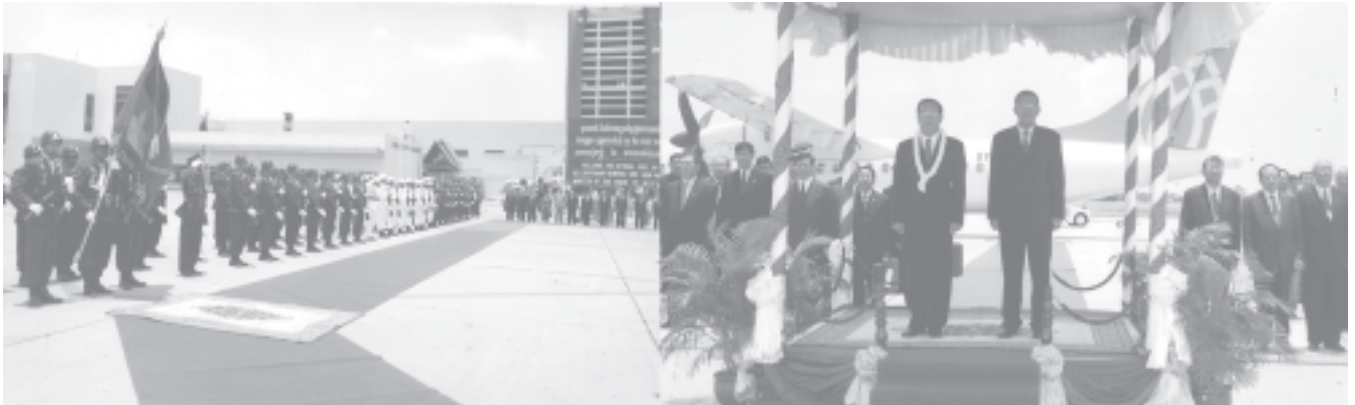
Prime Minister Lt-Gen Soe Win and Cambodian Prime Minister Samdech Hun Sen take the salute of the Guard of Honour. — MNA

YANGON, 11 April— At the invitation of Prime Minister of Kingdom of Cambodia Mr Samdech Hun Sen, Prime Minister Lt-Gen Soe Win of the Union of Myanmar accompanied by Minister for Commerce Brig-Gen Tin Naing Thein, Minister for Information Brig-Gen Kyaw Hsan, Minister for Cooperatives Col Zaw Min, Deputy Minister for Foreign Affairs U Kyaw Thu and departmental heads arrived at Phnom Penh International Airport in Phnom Penh at 11.45 am local time on 8 April.