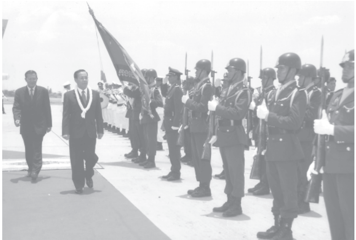
Prime Minister Lt-Gen Soe Win and his counterpart inspect the Guard of Honour. — MNA

Prime Minister Lt-Gen Soe Win and party went to Hotel Inter-Continental in Phnom Penh. — MNA