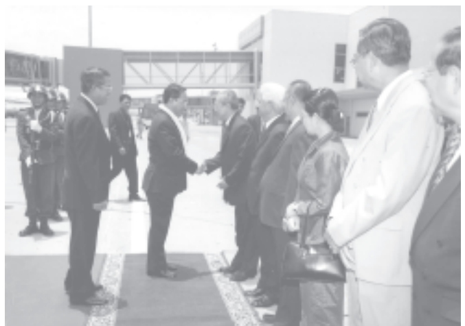
Prime Minister Lt-Gen Soe Win greets high level officials of Cambodia.