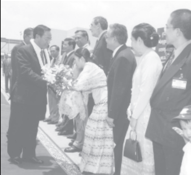
Family members of Myanmar embassy in Cambodia welcome Prime Minister Lt-Gen Soe Win.