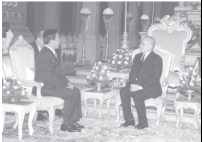
Prime Minister Lt-Gen Soe Win pays a courtesy call on King of Cambodia His Majesty Preah Bat Samdech Preah Boromneath Norodom Sihamoni at the Palace in Phnom Penh.