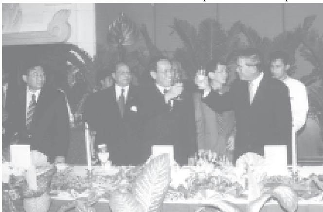
Prime Ministers of the two countries propose toasts at the dinner.— MNA

went back to Hotel Inter-Continental.—MNA