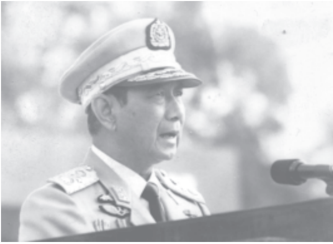
Vice-Senior General Maung Aye addresses the graduation parade of 108th intake of Defence Services (Army) Officers Training School.

codes of conduct, which are the base of discipline. The people of Myanmar love, respect and obey the leaders who observe the codes of conduct. Myanmar has a saying, which goes, "If the senior officials do not observe discipline, the subordinates will be worse at it. Thus, the leader should be an example in observing discipline. The cadets should observe discipline, with greater degree, as they are going to play a role in the armed institution.