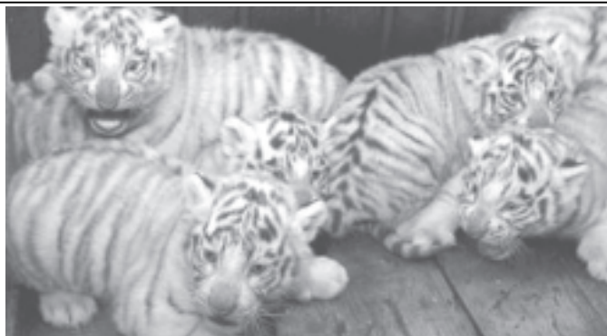
Quintuplet white tiger cubs, born a month ago, play at a zoo in Nanjing, in eastern China's Jiangsu Province on 11 April, 2005. Their mother, Xingta, has given birth to 19 cubs in the last five years. Those were the cubs for first public appearance.

Seniors are also more vulnerable because they metabolize and excrete drugs more slowly. — MNA/Xinhua