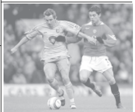
Manchester United's Cristiano Ronaldo (R) tries to get past Norwich City's Darreb Huckerby at the Carrow Road Stadium during their English championships match in Norwich. Norwich won the match 2-0.

Cahill increased Everton's lead two minutes into the second half with a volley from Marcus Bent's right cross and headed the third seven minutes later before Vaughan put the icing on the cake.