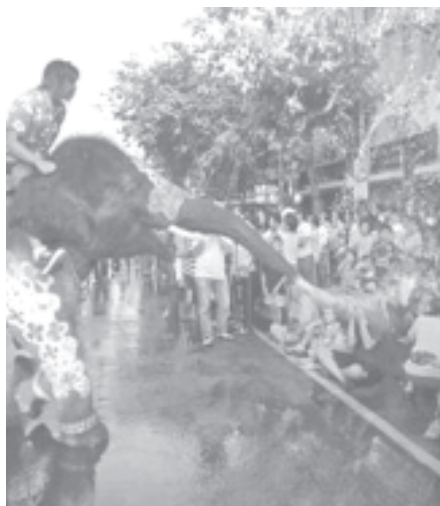
An elephant sprays water on spectators as part of the Songkran festival in Bangkok on 9 April, 2005. The Songkran festival marks the start of the Thai traditional New Year, which falls on 13 April 2005.

"I am concerned that the institutional framework for providing long-term capital for investment in agriculture is weak," said the Prime Minister. He stressed that for the country to achieve 7-8 per cent annual economic growth, "we have to accelerate the rate of growth in agriculture". — MNA/Xinhua