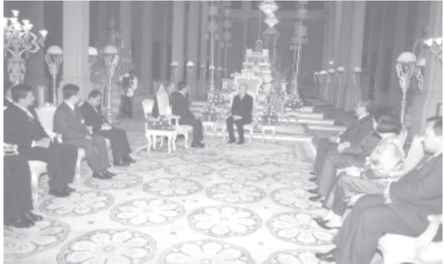
Prime Minister Lt-Gen Soe Win pays a courtesy call on King of Cambodia His Majesty Preah Bat Samdech Preah Boromneath Norodom Sihanoni at the Palace in Phnom Penh.

Also present at the call were Minister for Commerce Brig-Gen Tin Naing Thein, Minister for Information Brig-Gen Kyaw Hsan, Minister for Cooperatives Col Zaw Min, Deputy Minister for Foreign Affairs U Kyaw Thu, Myanmar ambassador Dr Aung Naing, Director-General U Soe Tint of the Prime Minister's office and departmental heads.—MNA