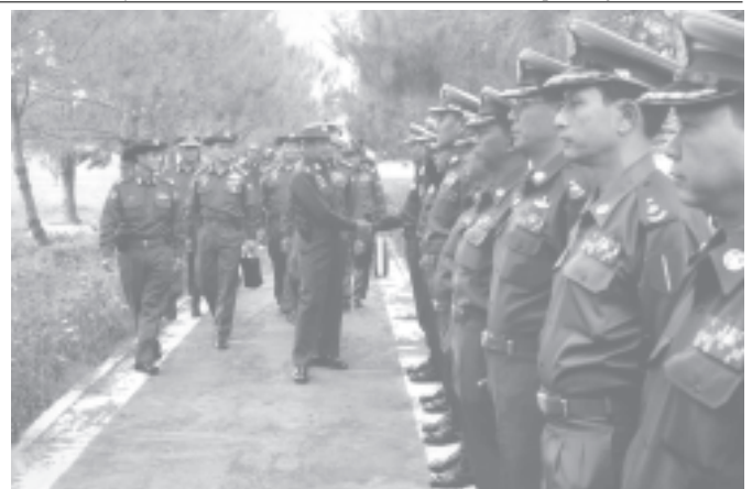
Vice-Senior General Maung Aye cordially greets senior military officers of Bahtoo Station. (News on page 1)

Later, Vice-Senior General Maung Aye left the parade ground.