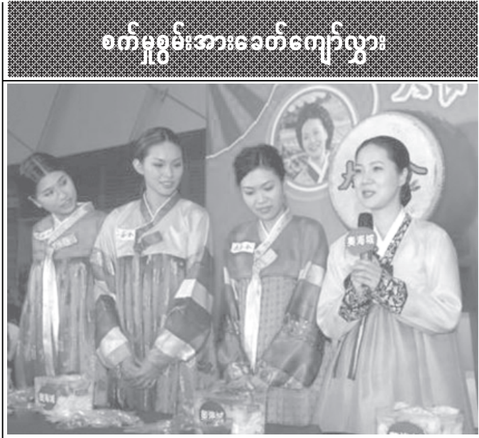
South Korea actress Yang Mi-kyung (R) attends a promotional event in Hong Kong on 9 April, 2005. Yang is in Hong Kong to promote the Korean Agriculture Festival.