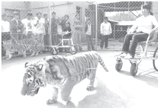
Two tigers practise dragging carts at a zoo in Nanjing, east China's Jiangsu Province on 8 April, 2005.