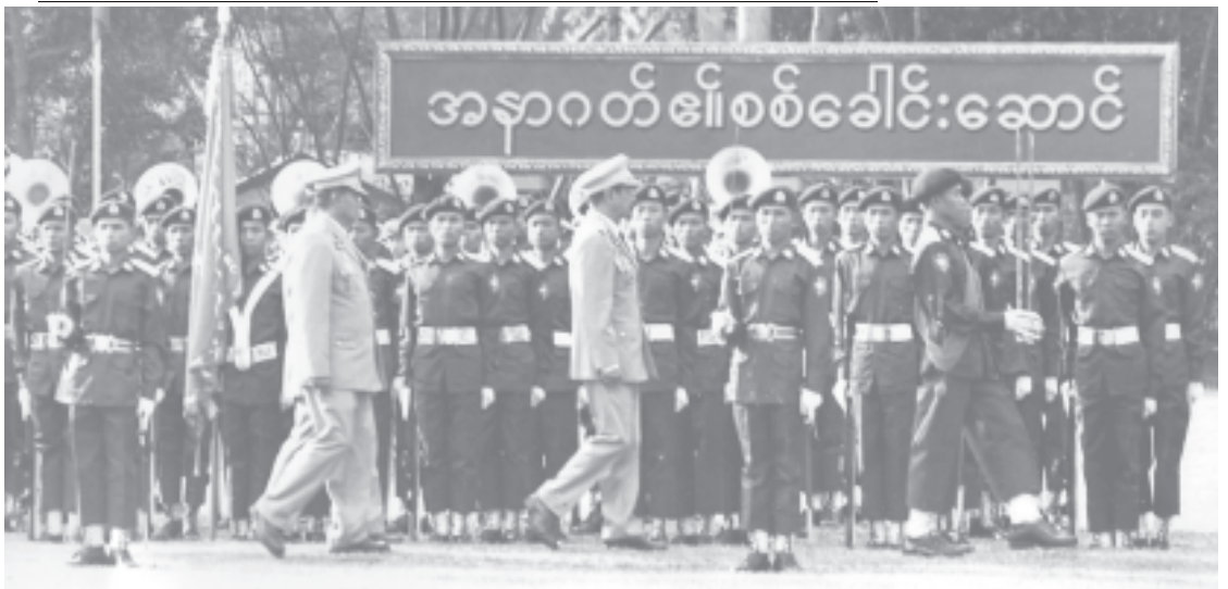
Vice-Senior General Maung Aye inspects graduating cadet companies.

in accord with the aims, to arm the unit with advanced weapons if necessary, to apply innovative means, and to have the qualification to give good command, supervision and administration. The degree of management becomes higher when the unit gets larger and the duties greater. The field of management becomes wider due to sophisticated military science. Thus, the cadets will have to learn military management from now on. All the peoples of the world have social