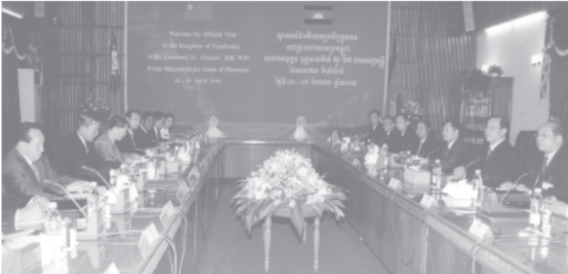
Myanmar delegation led by Prime Minister Lt-Gen Soe Win holds talks with Cambodian Prime Minister Samdech Hun Sen and officials.