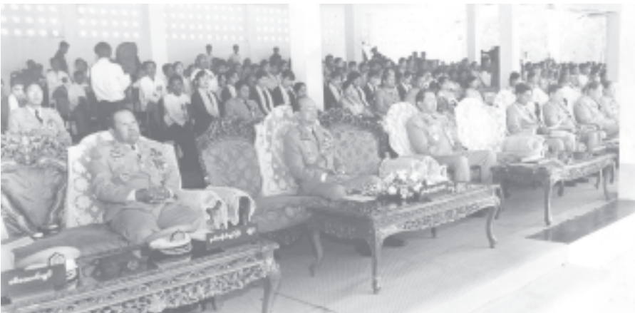
Those attending the graduation parade of 108th intake of Defence Services (Army) Officers Training School.

stigation, the nation became a gangland, where administrative machinery came to a halt, and anarchy was reigning under the slogans of democracy. Because of anarchy that ruled the nation during the unrest, the Tatmadaw had come to realize the need to adopt the discipline-flourishing democracy in accord with the people's wish. First, the Tatmadaw restored peace and stability and the rule of law in the nation. History stands witness to the fact that the danger of Union disintegration and losing independence and sovereignty has threatened the nation.