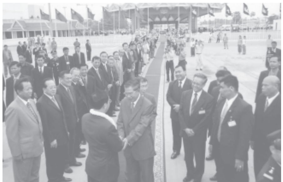
Prime Minister Samdech Hun Sen bids farewell to Prime Minister Lt-Gen Soe Win.

Next, Prime Minister Lt-Gen Soe Win and party left there and arrived back here later in the morning.—MNA