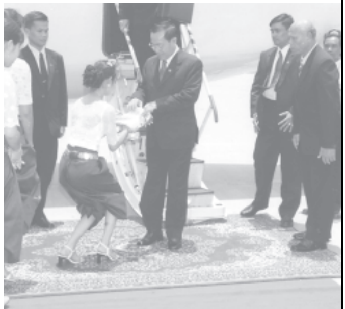
A Cambodian damsel presents a garland to Prime Minister Lt-Gen Soe Win.