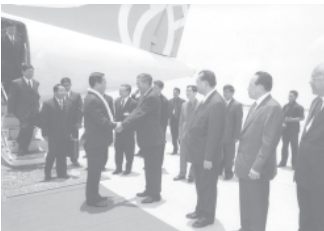
Prime Minister Samdech Hun Sen welcomes Prime Minister Lt-Gen Soe Win.