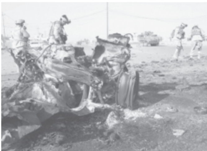
US soldiers inspect the remains of a car after it detonated next to a passing army Stryker vehicle in the town of Mosul, 400 kilometres north of Baghdad recently.

However, Kabanda said the fresh negotiations aimed at putting aside some of the old agreements and for new ones to be put in place to benefit all the countries in the Nile Basin.— MNA/Xinhua