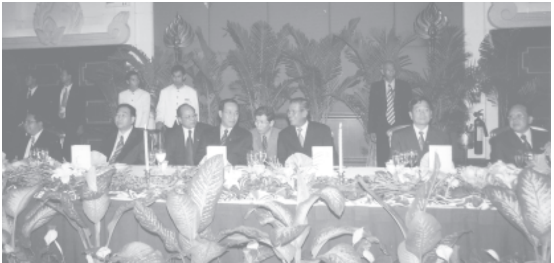
Prime Minister Samdech Hun Sen hosts a dinner in honour of Myanmar delegation led by Prime Minister Lt-Gen Soe Win.