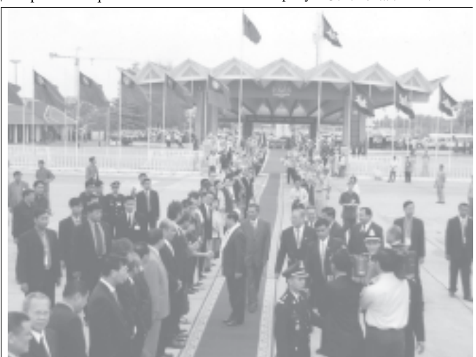
Prime Minister Lt-Gen Soe Win greets Cambodian officials at the airport.—MNA