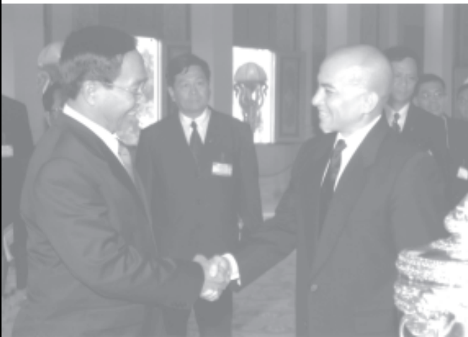
Prime Minister Lt-Gen Soe Win greets King of Cambodia His Majesty Preah Bat Samdech Preah Boromneath Norodom Sihamoni at the Palace in Phnom Penh.