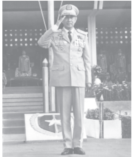
Vice-Senior General Maung Aye takes the salute of graduating companies of the 108th intake of the Defence Services (Army) Officers Training School.

well, should always try to enhance their skills, should always get in touch with their subordi-