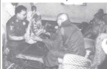
Deputy Minister Brig-Gen Aung Thein offers provisions to a member of the Sangha.

Next, Deputy Minister Brig-Gen Aung Thein and departmental heads and officials offered provisions to the Sayadaw. The congregation shared the merits gained. After the ceremony the deputy minister and officials offered soon to the Sayadaws. —MNA