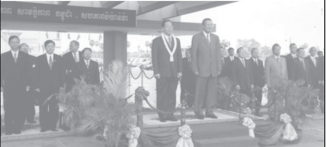
Prime Minister Lt-Gen Soe Win and Prime Minister Samdech Hun Sen take the salute of the Guard of Honour.—MNA