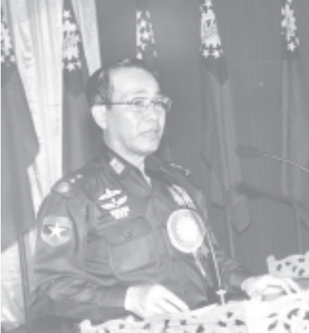
Prime Minister Lt-Gen Soe Win addresses opening ceremony of Government Technological College (Hpa-an).

Although Kayin State is not far from Yangon, it lagged behind development for a long time due to various social evils including armed insurgency. Only when there is rapid progress in the region can Kayin State catch up with other states and divisions. As it borders a neighbouring country, it is necessary for the state to develop in all sectors. Therefore, national dignity will be brightened and national force will be consolidated, he added.