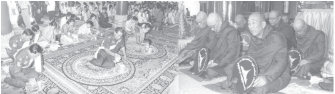
Senior General Than Shwe and wife Daw Kyaing Kyaing and party share merits at consecration ceremony of Maha Theikdzaya Pagoda.