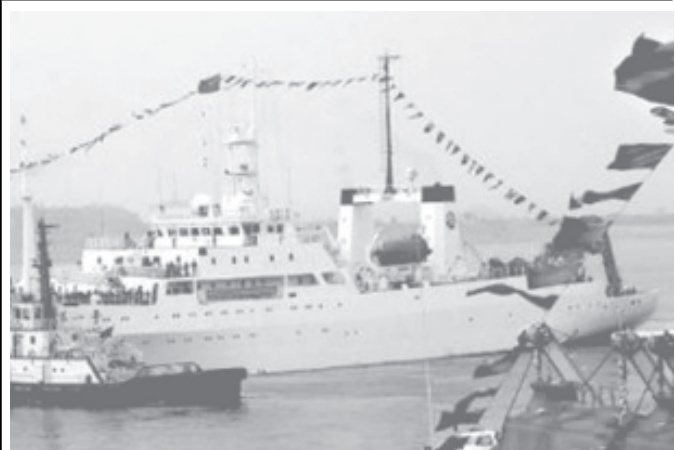
China's research ship Ocean No 1 leaves Qingdao in east China's Shandong Province for research in the Pacific, Atlantic and the Indian Ocean on 2 April, 2005.