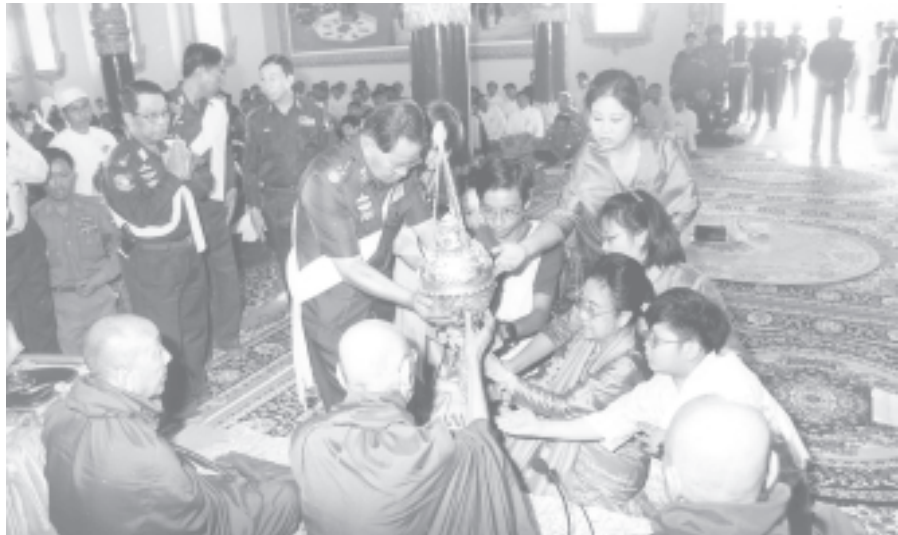
Senior General Than Shwe and wife Daw Kyaing Kyaing offer Seinbudaw for Maha Theikdzaya Pagoda to a Sayadaw.

and Development Council, the Commander-in-Chief (Navy), the Commander-in-Chief (Air), the Commander-in-Chief (Air), the ministers, senior