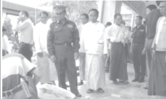
Minister for Mines Brig-Gen Ohn Myint inspects jade lots at 42nd Myanma Gems Emporium.— MNA

A total of 1,326 gem merchants— 873 of 306 companies from abroad and 453 of 251 local companies— bought competitively. Myanma Gems Emporium continues tomorrow. — MNA