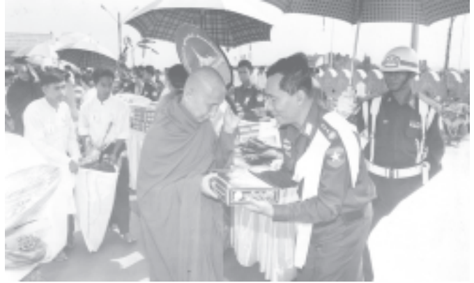
General Thura Shwe Mann donates alms to a Sayadaw at rice offering ceremony.