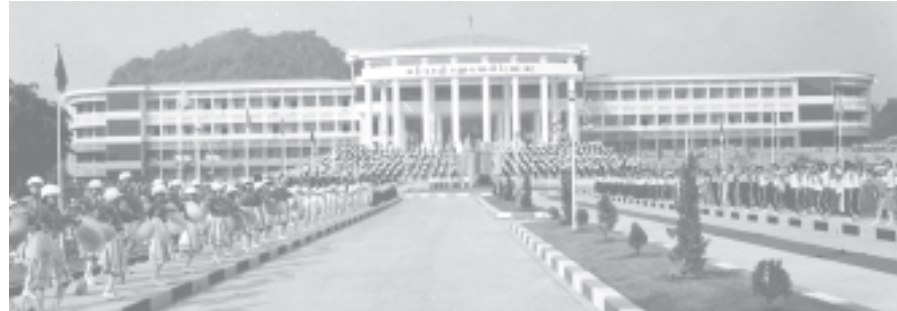
New three-storey building of Hpa-an Technological College. — MNA

building and one four-storey lecture building was built on an area of 35.19 acres near Yetha village of Hpa-an Township, which includes 49 rooms and it has produced 738 graduate students till now. MNA