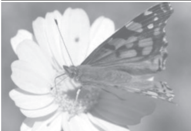
A monarch butterfly lands on a yellow daisy in Pt Loma near San Diego, Calif on 31 March, 2005.