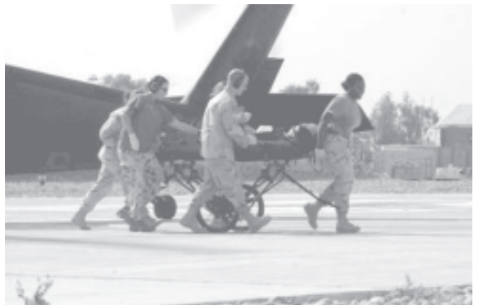
A medical evacuation team moves a wounded soldier to the emergency room at the Air Force theatre hospital in Balad Air Base, north of Baghdad on 3 April, 2005.