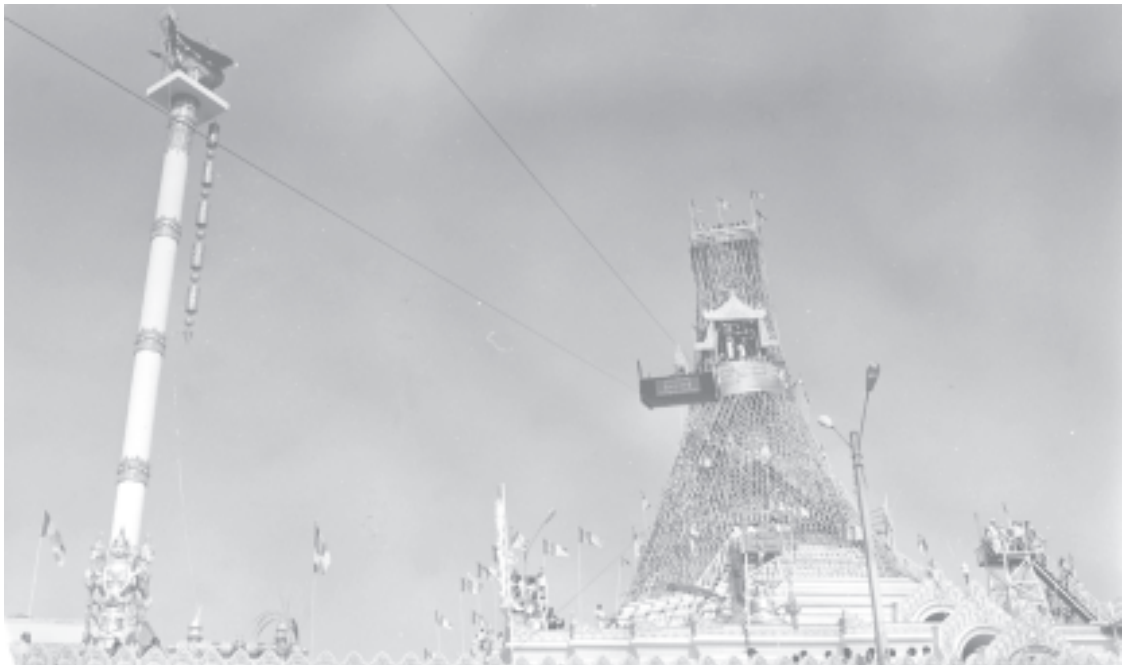
Senior General Than Shwe and wife Daw Kyaing Kyaing and party convey Shwehtidaw atop Maha Theikdzaya Pagoda.

Lt-Gen Maung Bo and Lt-Gen Tin Aye donated Shwekyar Thingan and fruits to Konagamana Buddha image.