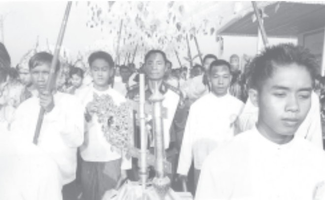
General Thura Shwe Mann conveys Hngetmyatnadaw round Maha Theikdzaya Pagoda in Myeik.