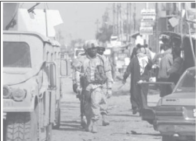
US Army troops from the 10th Mountain Division patrol a market in the Abu Ghraib district in western Baghdad on 29 March, 2005.