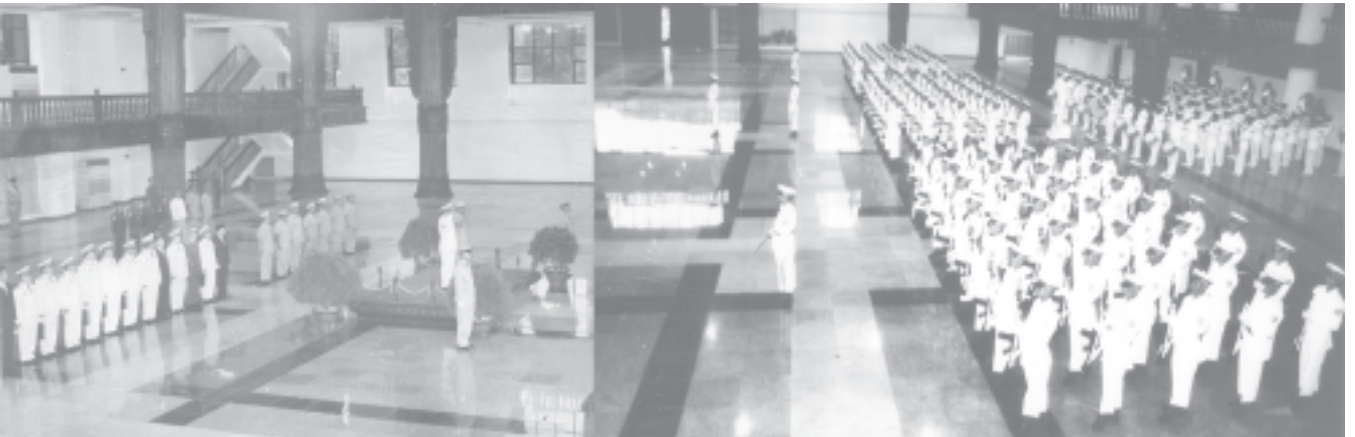
Vice-Senior General Maung Aye and Chief of General Staff of Vietnam Senior Lt-Gen Phung Quang Thanh take the salute of Guard of Honour at the airport.