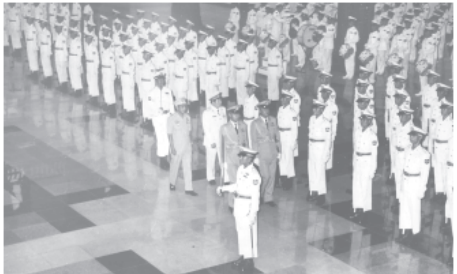
Vice-Senior General Maung Aye and Chief of General Staff of Vietnam Senior Lt-Gen Phung Quang Thanh inspect Guard of Honour at the airport.

Next, the Vietnamese guests left for No 1 Tatmadaw Guest House. Vice-Senior General Maung Aye and party waved to the guests.—MNA