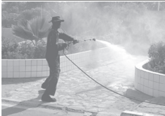
A health worker sprays to help prevent Cholera in Dakar on 2 April, 2005.