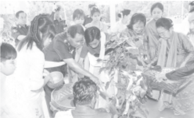
Senior General Than Shwe and wife Daw Kyaing Kyaing and party plant a Bo tree.