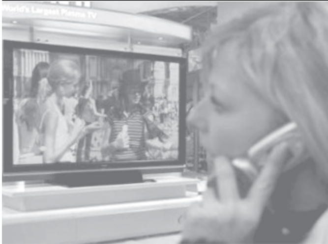
A woman looks at the world's largest 102 inches plasma television by South Korean electronic maker Samsung as the world's largest computer fair CeBIT in Hanover, recently.