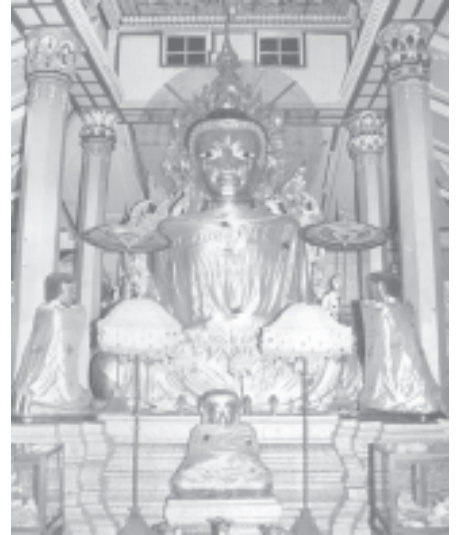
Senior General Than Shwe paying homage to Buddha image at Laygyun Hsimee Pagoda.