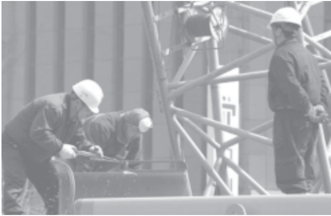
South Korean construction workers at a site in downtown Seoul on 3 April, 2005.