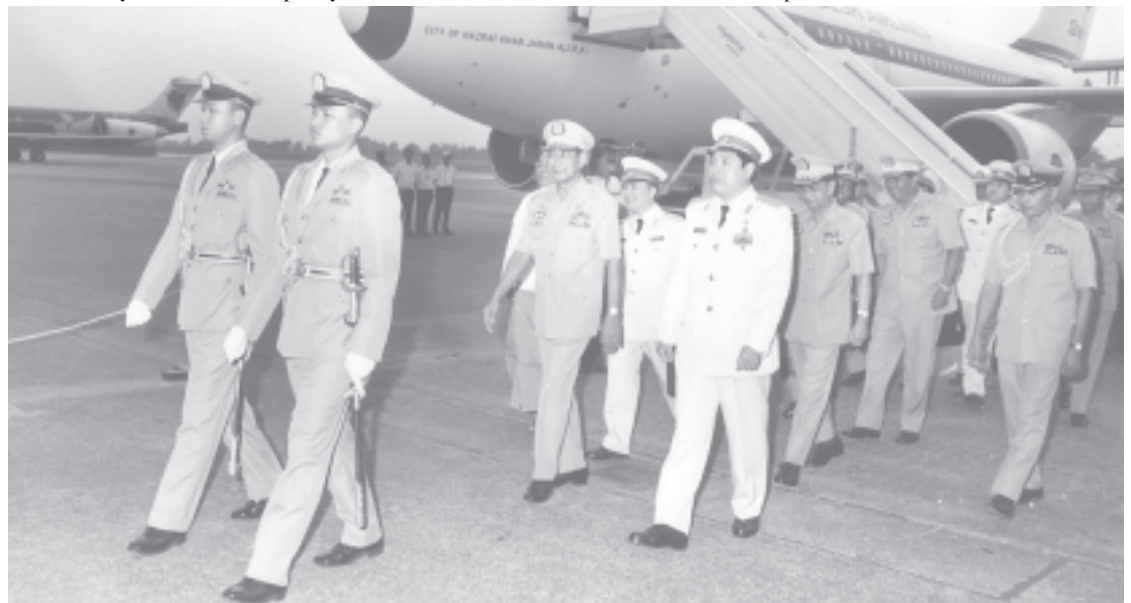
Vice-Senior General Maung Aye welcomes Chief of General Staff of Vietnamese Army Senior Lieutenant-General Phung Quang Thanh at the airport.

occasion were Secretary-1 of the State Peace and Development Council (See page 10)