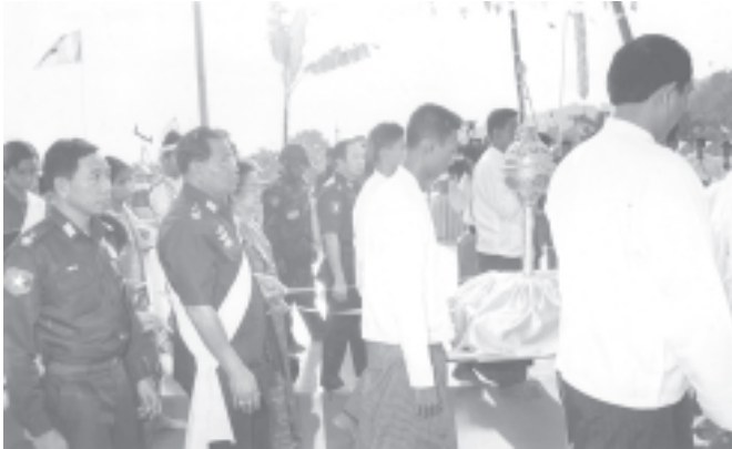
Senior General Than Shwe and wife Daw Kyaing Kyaing convey Yadana Seimbudaw round Maha Theikdzaya Pagoda in Myeik.