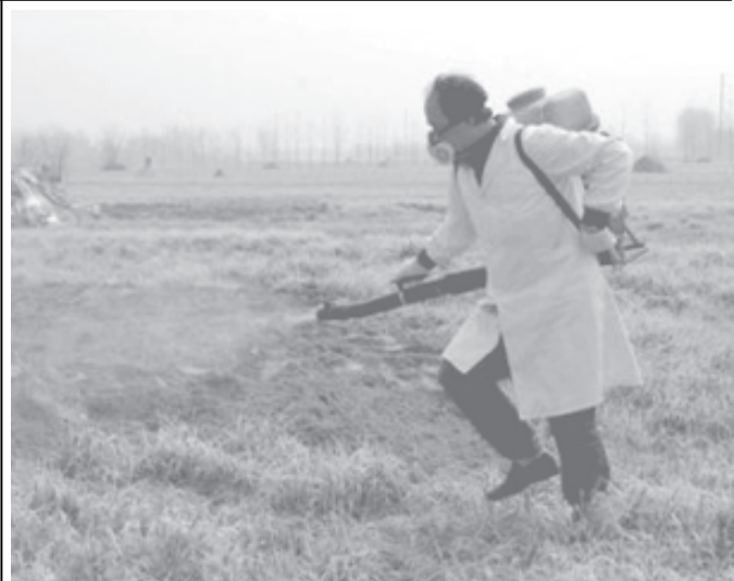
A disease control and prevention worker sprays disinfectant in a field in Huai'an, east China's Jiangsu Province, on 2 April, 2005.