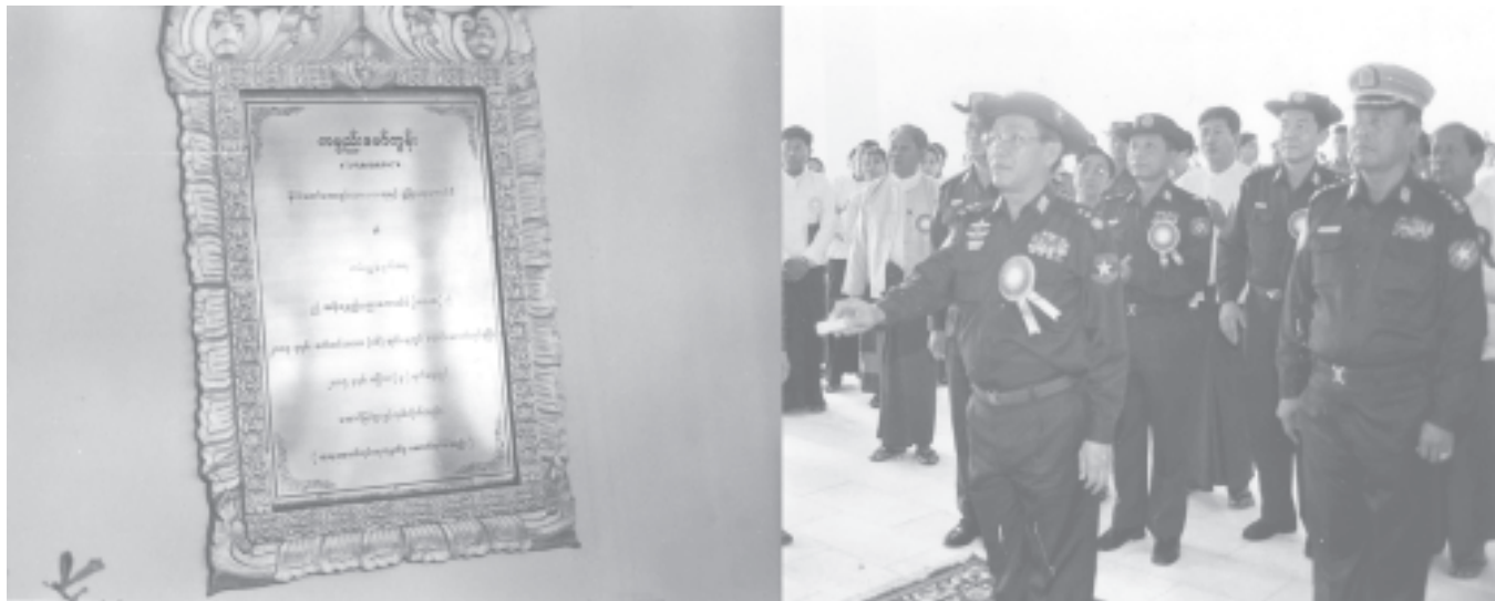
Prime Minister Lt-Gen Soe Win unveils the bronze plaque of the main building of Hpa-an GTC.

YANGON, 3 April — An opening ceremony of a three-storey main building of Government Technological College (Hpa-an) was held at the college this morning, where Prime Minister Lt-Gen Soe Win formally unveiled the stone plaque of the building and delivered an address on the occasion.