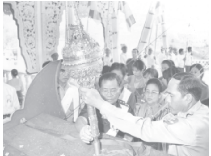
Senior General Than Shwe and wife Daw Kyaing Kyaing convey Seinbudaw atop Maha Theikdzaya Pagoda.

At 8.30 am, Senior General Than Shwe and wife Daw Kyaing Kyaing sprinkled scented water on the Hngetmyatnadaw and conveyed it atop the pagoda by Myalayyin