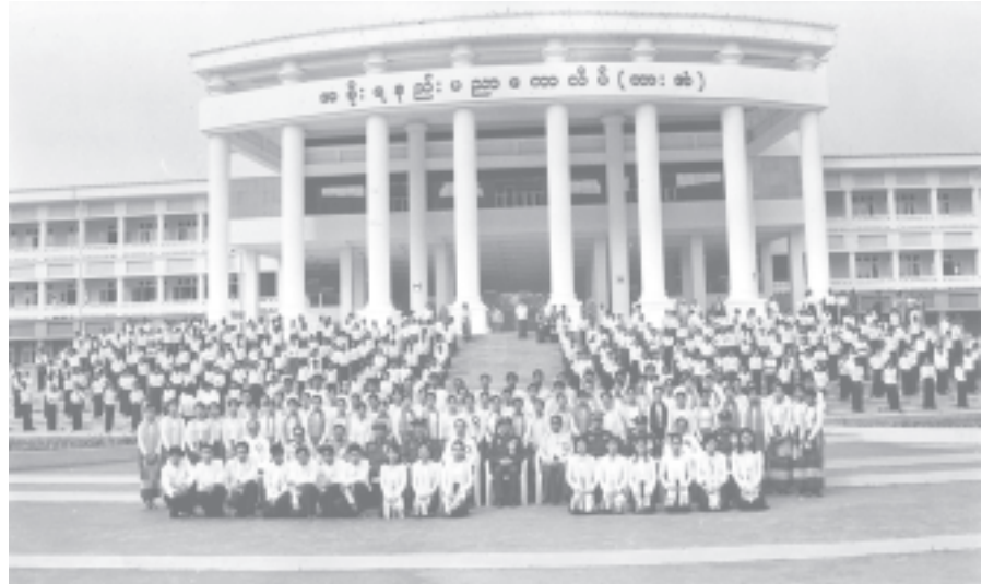
Prime Minister Lt-Gen Soe Win and party pose for documentary photo with faculty members and students in front of GTC (Hpa-an).

Kyuu, senior military officers, officials of the State Peace and Development Council Office, heads of departments, members of State, District and Township PDCs, social organizations, faculty members, local people and guests.