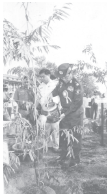
Prime Minister Lt-Gen Soe Win plants a Gantgaw tree at the opening ceremony of three-storey building of Hpa-an GTC.

In efforts to make reforms and fulfil necessary foundations for smooth transformation of old system to a new one, the government always places emphasis on lofty aims of narrowing the gap between one region and another, equal development of all states and divisions and national people.