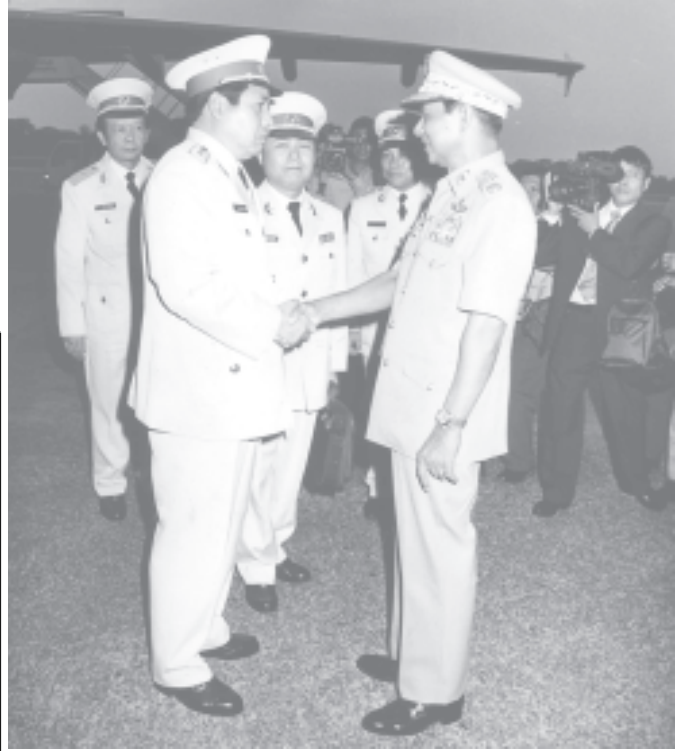
Vice-Senior General Maung Aye greets Chief of General Staff Senior Lieutenant-General Phung Quang Thanh.

Shukhintha Road in Thakayta Township. It is being built of RC beams and floor. On completion, the bridge will be 970 feet long and it will have 48 feet wide motor road and six feet wide pedestrian way on either side. Its clearance will be 65 feet wide and 11 feet high. The bridge will withstand 60-ton loads. So far, the bridge has been completed by 22.3 per cent.