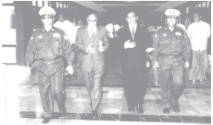
Minister for Foreign Affairs U Nyan Win seen at the airport before his departure for Pakistan.

YANGON, 3 April — At the invitation of Mr Khurshid M Kasuri, Minister for Foreign Affairs of Pakistan, U Nyan Win, Minister for Foreign Affairs, left Yangon by air this morning to attend the Fourth Asia Cooperation Dialogue (ACD) Ministerial Meeting to be held in Islamabad, Pakistan, from 5 to 7 April 2005.