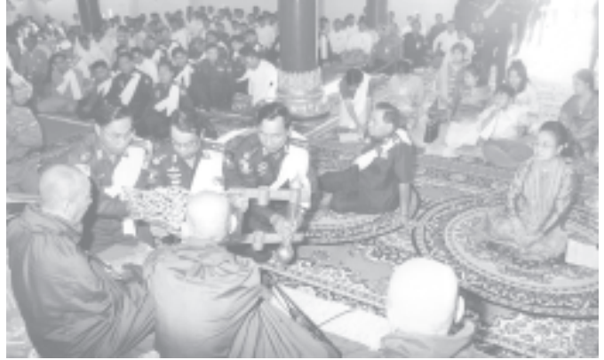
General Thura Shwe Mann offers Hngetmyatnadaw to a Sayadaw.