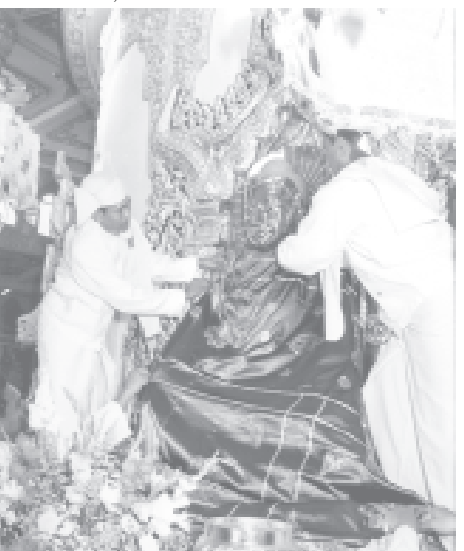
Senior General Than Shwe and wife Daw Kyaing Kyaing pay homage to Botama Buddha image at Maha Theikdzaya Pagoda in Myeik.