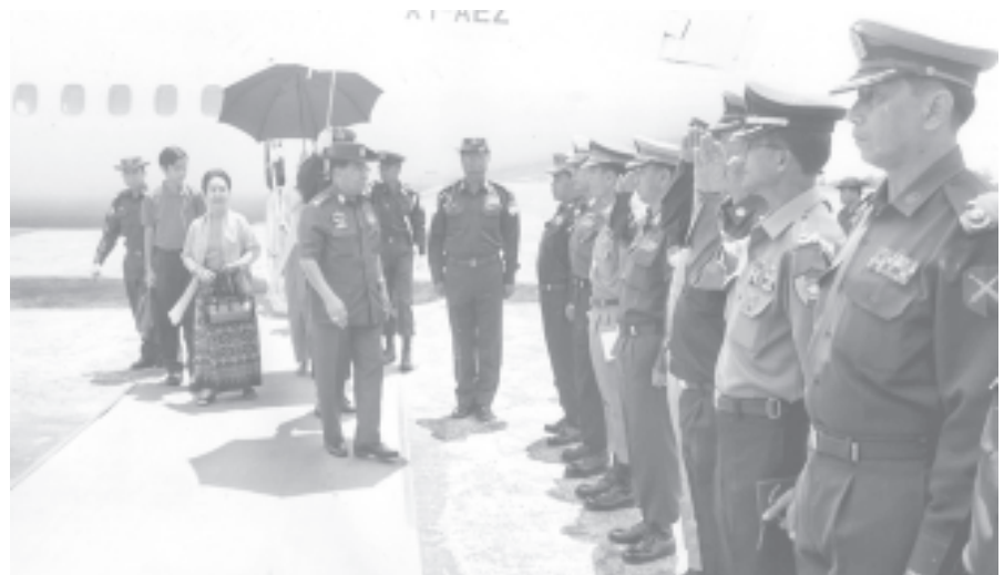
Senior General Than Shwe being welcomed by departmental officials at Myeik Airport.