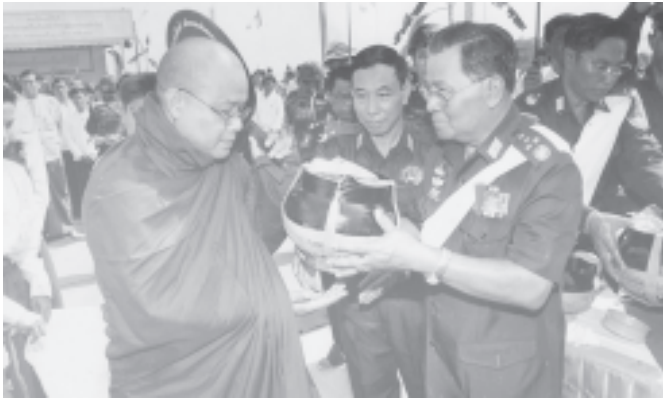
Senior General Than Shwe offers 'soon' to a Sayadaw.