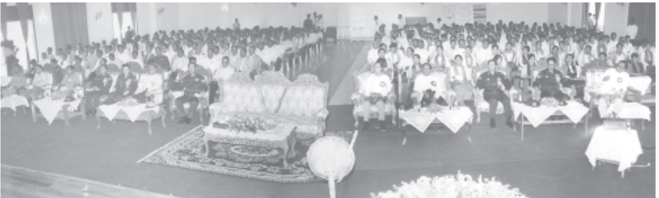
Ministers and departmental officials attending the opening ceremony of Government Technological College (Hpa-an).

With the advancement in IT today, all the fields such as politics, economy, education and health are gaining great momentum in all human societies, he noted. That