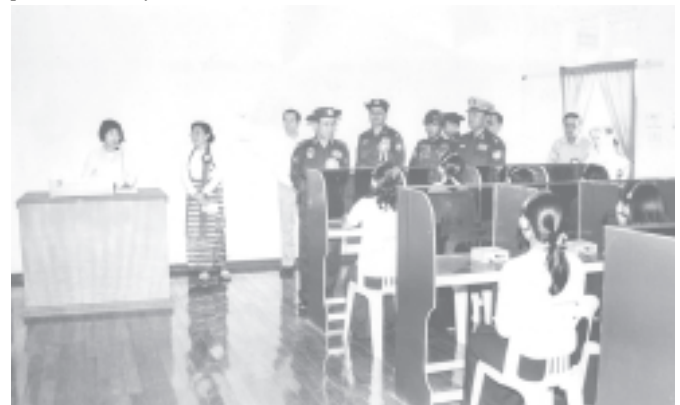
Prime Minister Lt-Gen Soe Win views classrooms of Government Technological College (Hpa-an).—MNA

With the advancement in IT today, all the fields such as politics, economy, education and health are gaining great momentum in all human societies. That is why all the global nations are adapting and improving their education systems to catch up with this momentum. It is necessary to produce human resources which must be a society of constant learning. The future of the nation can be shaped through education.