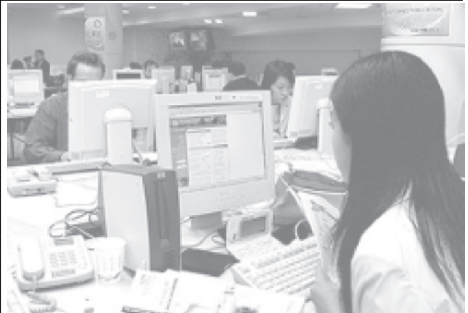
Journalists check the Internet recently. The future of online journalism will in part be shaped a landmark legal battle being waged in Canada pitting the Washington Post and 50 media giants against a former United Nations official who is suing the Post over an article published online.