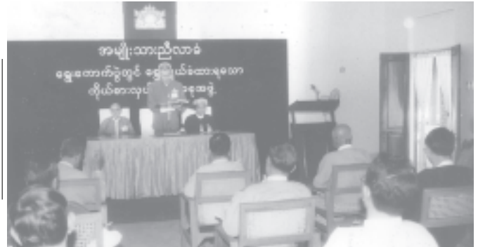
Delegates of representatives-elect hold group-wise discussions.