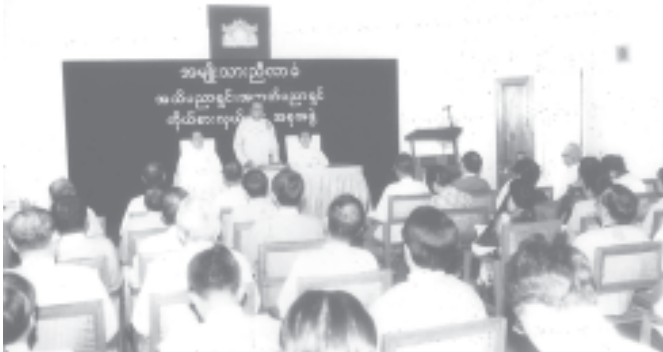
Delegates of intellectuals and intelligentsia hold group-wise discussions.

The attendance of the delegates accounted for 98.10 per cent. The chairman delivered an