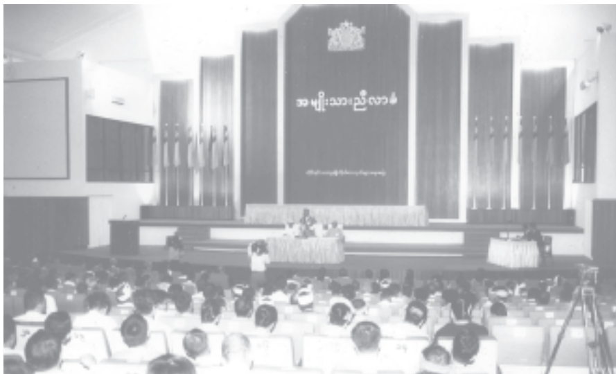
The discussion of Delegate Group of National Races in progress at Pyidaungsu Hall of Nyaunghnapin Camp in Hmawby Township.