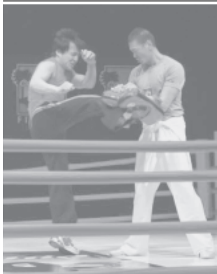
Hong Kong movie star Jackie Chan demonstrates kickboxing during a news conference in Hong Kong on 15 March, 2005.