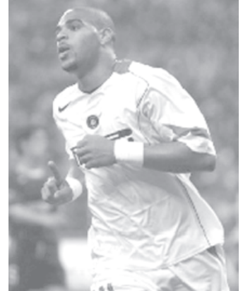
Inter Brazilian soccer ace Adriano reacts after scoring his second personal goal during the Champions League first knockout, 2nd leg soccer match between Inter Milan and Porto at the San Siro Stadium in Milan, Italy, on 15 March, 2004.

That should have settled Inter's nerves and made it clear to the Portu-