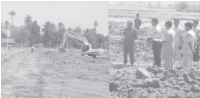
Director-General U Myo Myint inspects construction of district-to-district road in Yedashe.