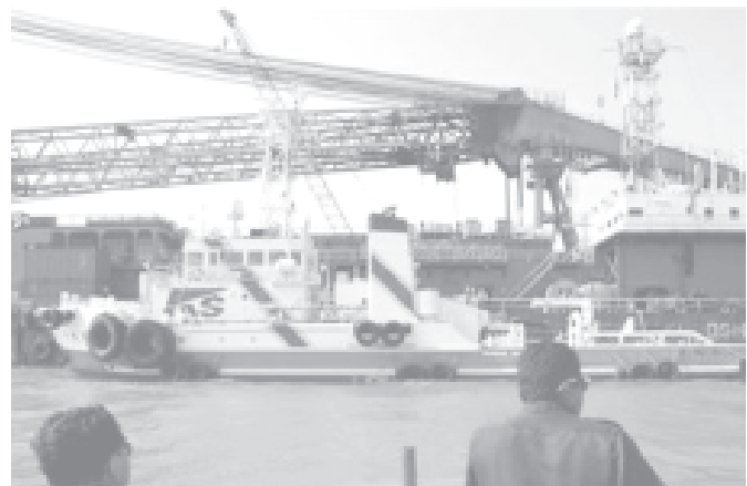
Japanese-registered tugboat 'Idaten,' foreground, waits off Penang Island, Malaysia, on 15 March, 2005.