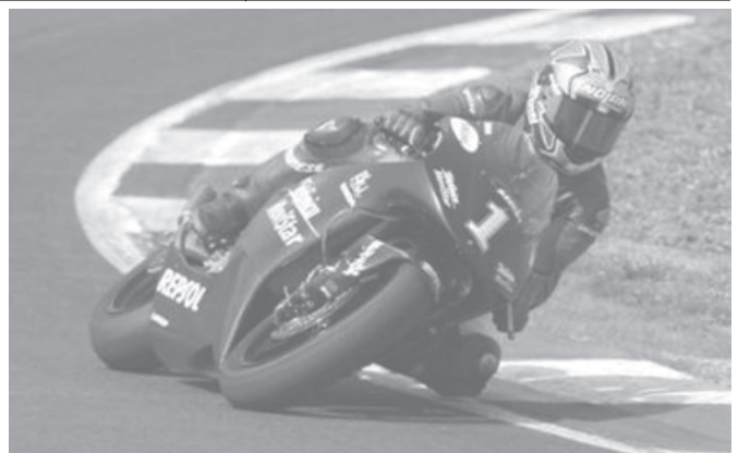
Spanish 250cc World Champion rider Dani Pedrosa takes a curve over his 250cc Honda motorbike during the official test session at Catalunya's racetrack, near Barcelona, Spain, on 17 March, 2005.