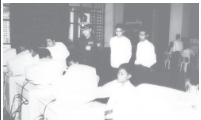
Members of USDA participating in Computer Quiz to mark 60th Anniversary Armed Forces Day at Defence Services Museum.