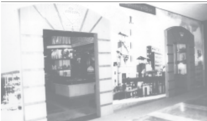
Progress of renovation of ministries' booths for Armed Forces Day Commemorative Exhibition at Defence Services Museum.