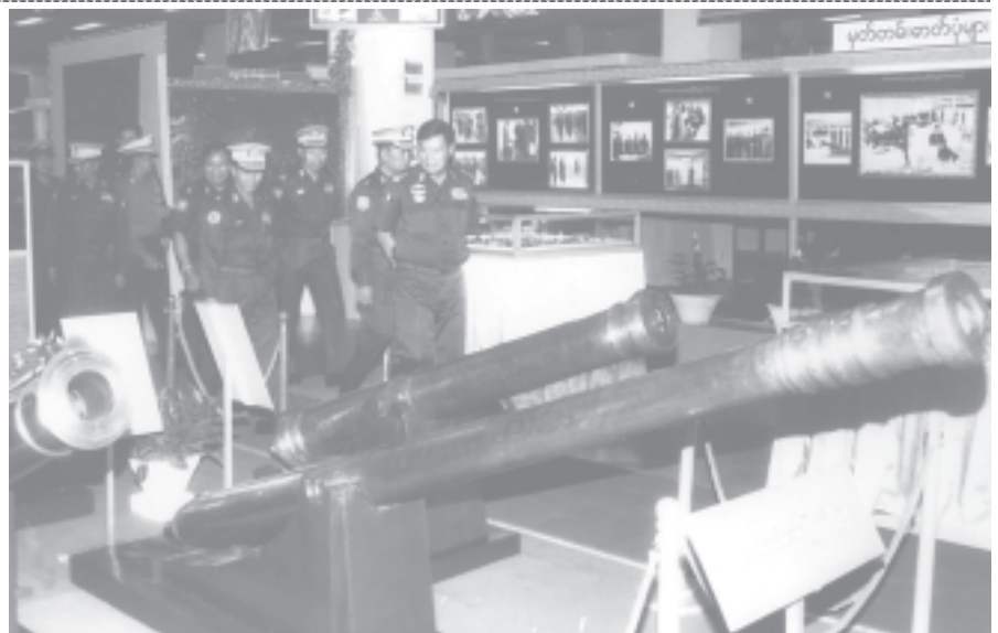
Chief of Armed Forces Training Lt-Gen Kyaw Win inspects booths at Defence Services Museum.—MNA

Emergence of the State Constitution is the duty of all citizens of Myanmar Naing-Ngan.