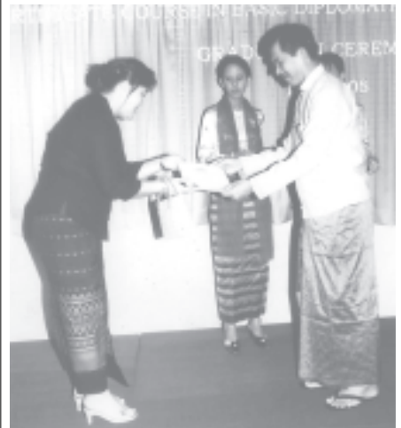
Minister U Nyan Win presents certificate to a trainee. (News on page 2) — MNA