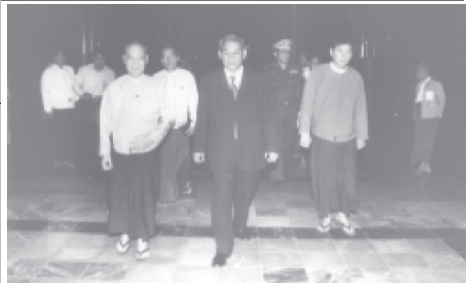
MINISTER ARRIVES BACK: Minister for Education U Than Aung attended the 40th South-East Asian Education Ministers' Council Conference held in Hanoi, Vietnam, recently. Minister at the Prime Minister's Office U Than Shwe and Minister for Health Dr Kyaw Myint welcome back Minister U Than Aung at the airport Thursday. — MNA