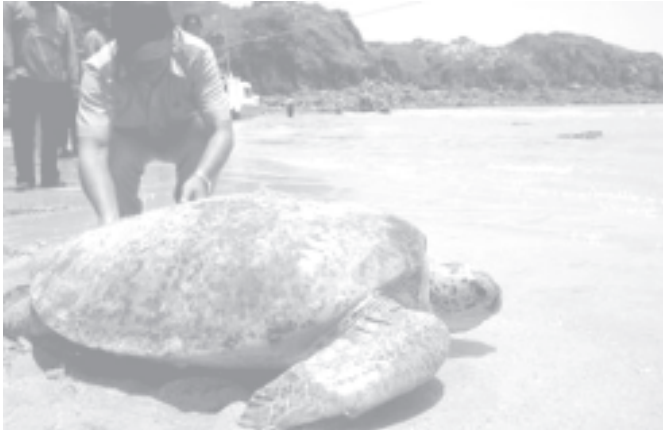
A member of the Turtle Conservation Team of Indonesia attends to a 265 lb. endangered Green Turtle, which washed ashore, on 17 March, 2005, in Riau, Indonesia. According to the team, the 70-year-old turtle was the largest ever found in the Riau Islands.