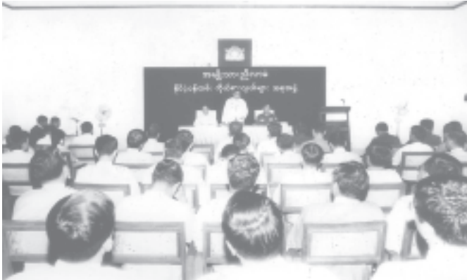
Delegates of State service personnel hold group-wise discussions.

the National Unity Party, and U San Tha Aung, proposals of Mro (a) Khami National Unity Organization regarding basic principles to be laid down for the sharing of executive and judicial powers to be included in the framing of the