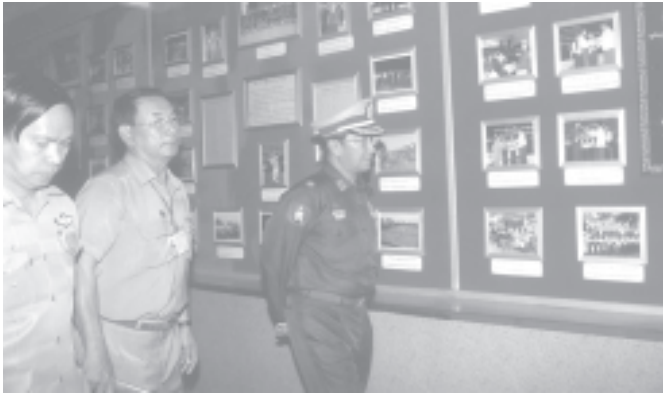
Minister Brig-Gen Thura Aye Myint inspects arrangements for the booth of the Ministry of Sports in the Defence Services Museum.

YANGON, 17 March— Minister for Sports Brig-Gen Thura Aye Myint arrived at Defence Services Museum on Shwedagon Pagoda Road this morning and inspected the booth of twelve objectives of the State, the booth of nation-building endeavours and the booth of the Ministry of Sports.