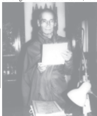
Sayadaw Bhaddanta Tejaniya. MNA