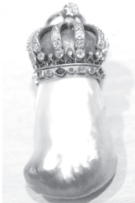
The Hope Pearl, part of an exhibit The Allure of Pearls , is shown at the Smithsonian's National Museum of Natural History in Washington, on 16 March, 2005. A pearl once owned by the builder of the Taj Mahal, another on loan from actress Elizabeth Taylor, and the Hope Pearl — a former partner to the Hope Diamond — are among a dozen of the world's rarest pearls on display in the exhibit, opening on 18 March and running through 5 Sept.