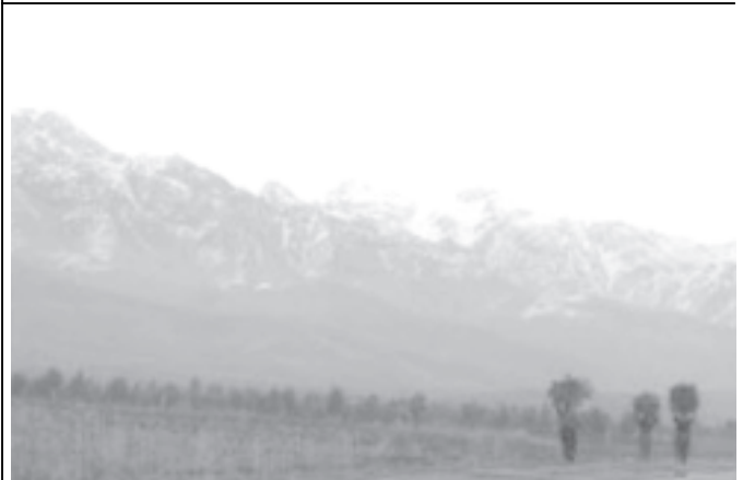
Kurdish Iraqi women carry wood on a road leading to the northern Kurdish town of Halabj on 16 March, 2005.