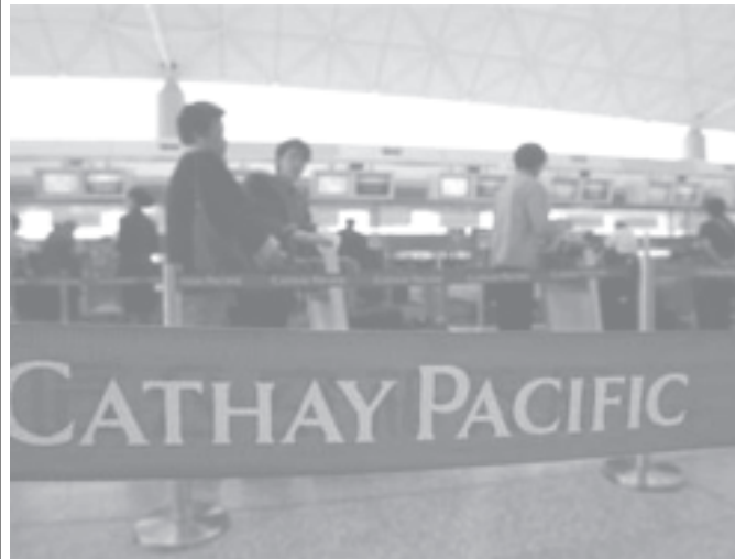
Passengers wait in line at a Cathay Pacific Airways check-in counter at the Hong Kong international airport on 16 March, 2005.