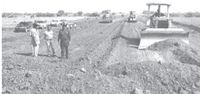
Deputy Minister Col Tin Ngwe inspects construction of District-to-District road No.2 in Mandalay Division.

local people and spoke at length regarding five rural development tasks being implemented by the State. After inspecting measures being taken for building 30-foot wide earth road between Gonywa and Kanswa villages, he left necessary instructions. Afterwards, the deputy minister inspected 19-mile long village-to-village road. MNA