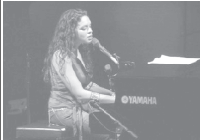
Internationally famed jazz singer Norah Jones performs her 'Feels Like Home' Asia Tour on 14 March, 2005, in Taipei County.