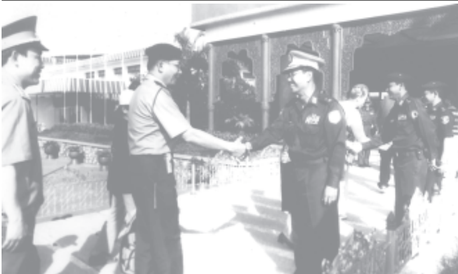
Chief of Defence Services Military Security Maj-Gen Myint Swe welcomes back Military Attachés and wives and party who visited Taunggyi, Inlay, Pindaya and Kalaw regions of Eastern Command area.— MNA

Emergence of the State Constitution is the duty of all citizens of Myanmar Naing-Ngan.