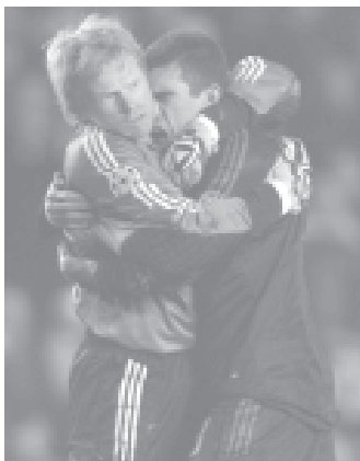
Bayern Munich goalkeeper Oliver Kahn (L) and defender Lucio of Brazil celebrate their team's victory during a Champions League first knockout round second leg soccer match against Arsenal at Highbury in London, on 9 March, 2005. Bayern Munich lost the match 0-1 but will advance to the quarter finals on a 3-2 aggregate.

Arsenal captain Patrick Vieira dragged a volley wide at the start of the second period as the English side desperately sought a goal to get back into the tie.