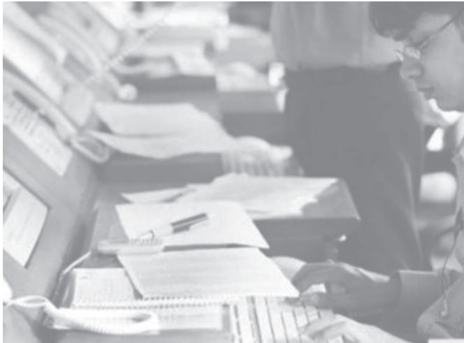
An Indian stockbroker uses a computer at a brokerage firm in Mumbai on 7 March, 2005.