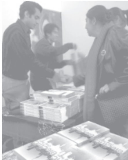
A woman buys a book on the opening night of the 2005 Man Hong Kong International Literary Festival, in Hong Kong on 9 March, 2005.