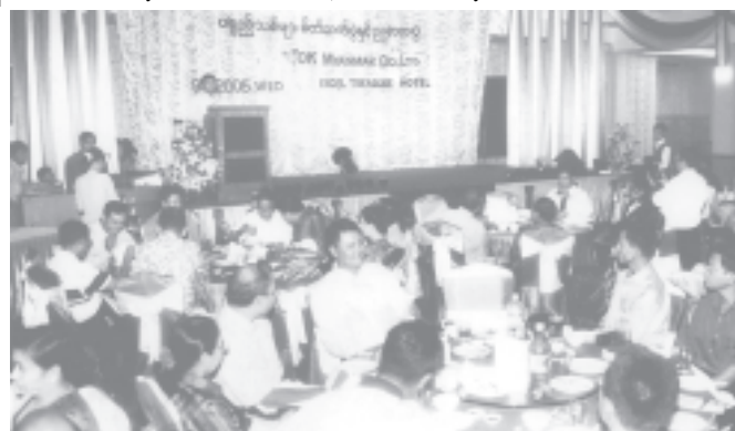
The ceremony to launch products of new Sanyo electronics in progress at Excel Treasure Hotel in Bahan Township.