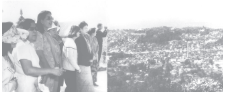
Military Attachés, wives and families enjoy scenic beauty of Taunggyi on 10-3-2005. (News on Page 7)