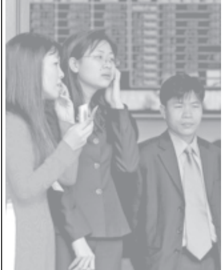
Workers at a currency exchange office wait for arriving officials at the building housing the Hanoi Stock Market during its official opening in Hanoi, Vietnam, on 8 March, 2005.