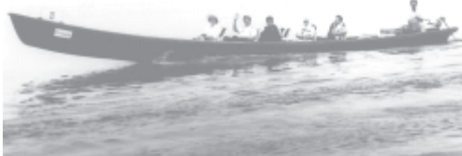
Military attachés, wives and families visit Inlay Lake on 8-3-2005. (News on page 7)—MNA