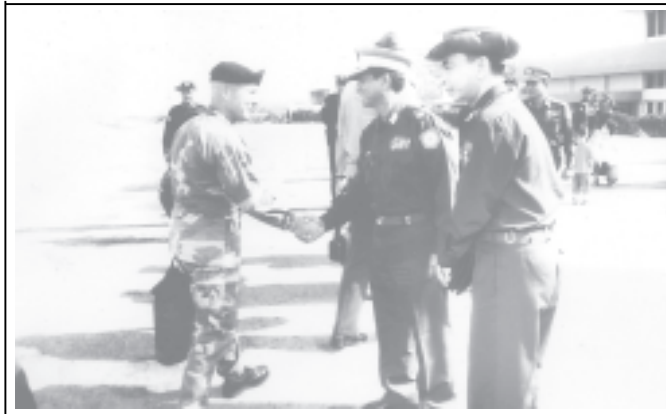
Commander of Eastern Command Maj-Gen Khin Maung Myint welcomes military attachés, their wives and families of foreign missions at Heho Airport. (News on page 7) —MNA

The region or state government shall have