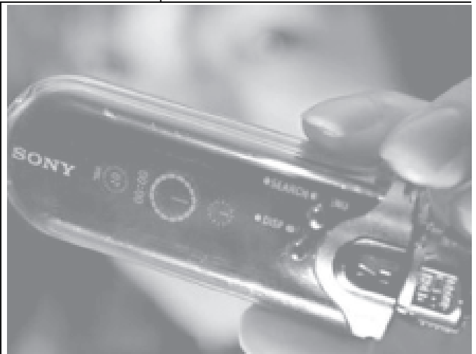
Sony Corp's new Walkman portable music player NW-E507 is displayed in Tokyo on 9 March, 2005.