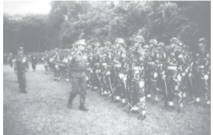
Vice-Chief of Armed Forces Training Maj-Gen Aung Kyi inspects drill practising of Tatmadaw columns.