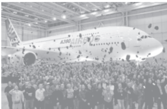
Airbus employees throw their caps in the air next to the new Airbus A380 after its unveiling ceremony, near Toulouse, southwestern France, in this 18 Jan, 2005 file photo. The A380 double-deck superjumbo is the world's largest passenger plane. European Aeronautic Defence and Space Co said on 9 March, 2005.