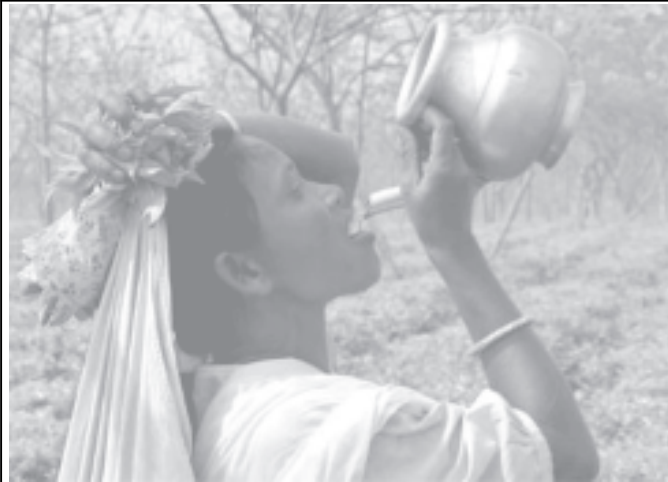
An Indian tea plantation worker drinks water during a break while plucking the season’s first crop in Singha Jora, India recently.