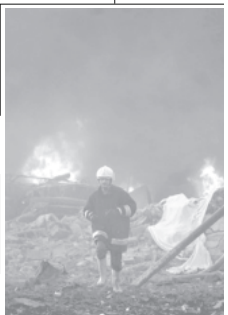
A fireman runs from the flaming scene after a garbage truck exploded at dawn near a hotel used by western contractors in central Baghdad, on 9 March, 2005.—INTERNET

The official said Reliance wants to become a fully integrated energy firm with interests in upstream oil and gas exploration and production and downstream refining and marketing. — MNA/PTI