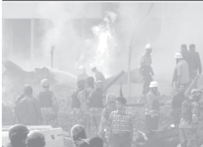
Iraqi authorities arrive at the scene after a powerful suicide bomb exploded in central Baghdad on early 9 March, 2005.