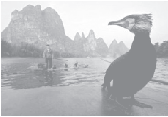
A cormorant waits for its turn to fish on a boat in the Li Jiang River near the town of Xingping, China recently. The birds have been used for centuries by Chinese fisherman, who tie strings made of hemp around the birds' neck to stop them from swallowing their catch.