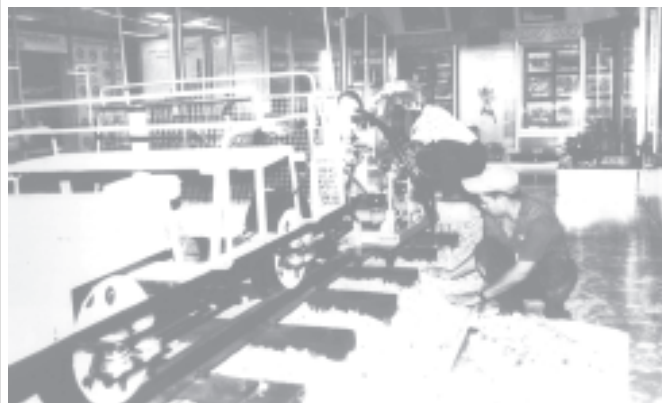
Preparations for display of Ministry of Rail Transportation Booth being made at Defence Services Museum.— MNA

YANGON, 10 March — The decoration tasks of the booths of Defence Services Museum are being carried out for the 60th Anniversary Armed Forces Day Commorative Exhibition 2005.