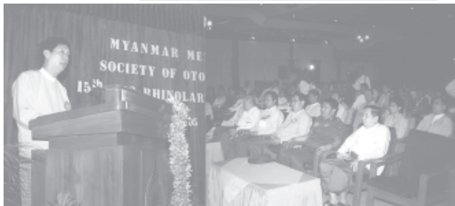
Minister for Health Dr Kyaw Myint addresses opening ceremony of 15th Oto-Rhinology Conference.— HEALTH