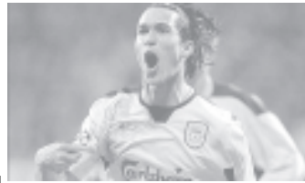
Liverpool's Luis Garcia (Spain) celebrates after scoring against Bayer Leverkusen during their round of 16 return match of the Champions' League in Leverkusen. Liverpool won 3-1.

Daniel Bierofka set up Landon Donovan for a clear shot in the 23rd minute but the American completely missed his kick.