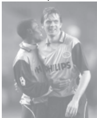
PSV Eindhoven's Phillip Cocu (R) and DaMarcus Beasley celebrate after winning their Champions League soccer match at Monaco (2-0), on 9 March, 2005.

Monaco coach Didier Deschamps had no complaints, although he said the first PSV goal was a killer blow.