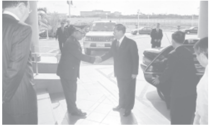
The Prime Minister and party arrived here later in the evening.