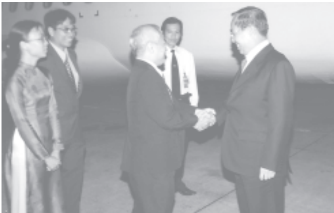
Prime Minister Lt-Gen Soe Win being welcomed by Deputy Chief of Cabinet of the Office of the People's Council & People's Committee of Ho Chi Minh City Mr Huynh Khanh Hiep at Tan Son Nhat International Airport.— MNA