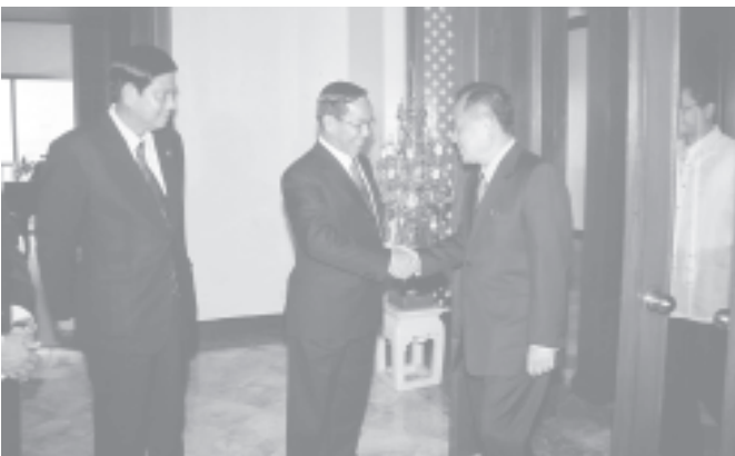
Prime Minister Lt-Gen Soe Win being greeted by Mr Jose C De Venecia.