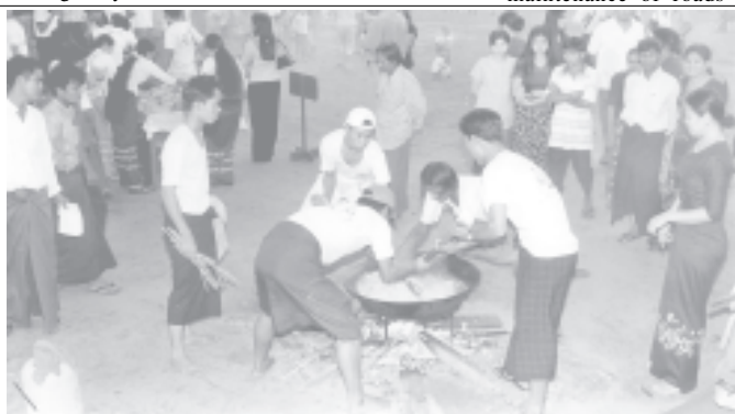
Myanmar traditional Htamane preparation contest in progress at the Kandawgyi Karaweik Natural Garden on Full Moon Day of Tabodwe (23-2-2005).

(Issued at 10:00 hours M.S.T on 23-2-2005) An earthquake of moderate intensity (5.5) Richter Scale with its epicentre outside of Myanmar about (654) miles Southwest of Kaba-Aye Seismological Observatory was recorded at (23) hrs (43) min (46) sec M.S.T on 22 nd February 2005.