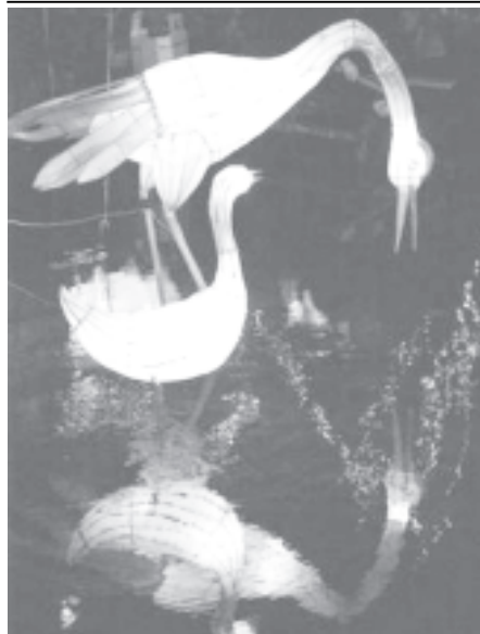
Crane-shaped lanterns are seen at Baotu Spring Park in Jinan, capital of east China's Shandong Province, on 20 Feb, 2005.—INTERNET

Those sentences were the first in Singapore for cocaine consumption since 1971 and followed a year in which synthetic "club drugs" overtook heroin as Singapore's drug of choice.—MNA/Reuters