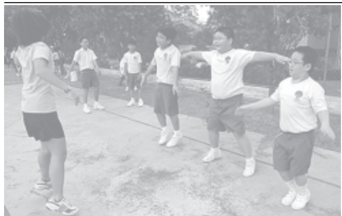
Overweight students follow instructions from their fitness teacher(L) during a free period at their school in Singapore as part of the government's 'Trim and Fit' (TAF) programme on 22 Feb, 2005.

"China supports the peace process in Sudan and is willing to join hands with Sudan to promote Sino-Sudanese cooperation," Chinese Foreign Minister Li Zhaoxing said in a telephone conversation with his Sudanese counterpart Mustafa Othman Ismail here Monday morning. Li said China would further strengthen consultations "with concerned parties" and make efforts to promote the resolution of the on-going humanitarian crisis in Sudan's Darfur region.— MNA/Xinhua