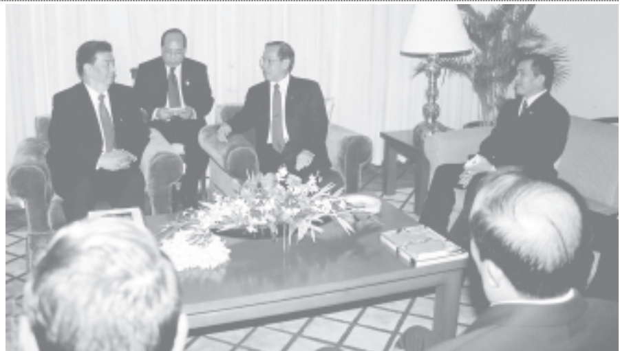
Prime Minister Lt-Gen Soe Win of the Union of Myanmar receives Senate President of Philippines Mr Franklin Drilon. — MNA

Also present at the calls were Minister for Agriculture and Irrigation Maj-Gen Htay Oo, Minister for National Planning and Economic Development U Soe Tha, Minister for Foreign Affairs U Nyan Win, Minister for Hotels and Tourism Brig-Gen Thein Zaw, Myanmar Ambassador to the Philippines U Tin Tun, and Director-General of the Political Department of the Ministry of Foreign Affairs U Thaug Tun. — MNA