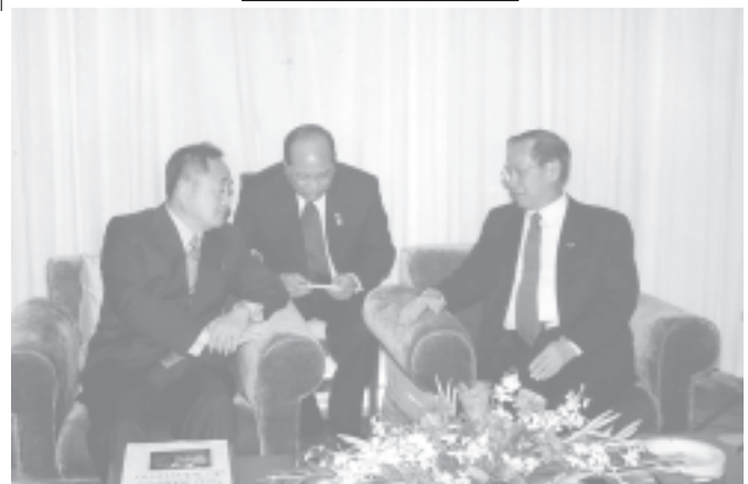
Prime Minister Lt-Gen Soe Win receives Mr Jose C De Venecia.