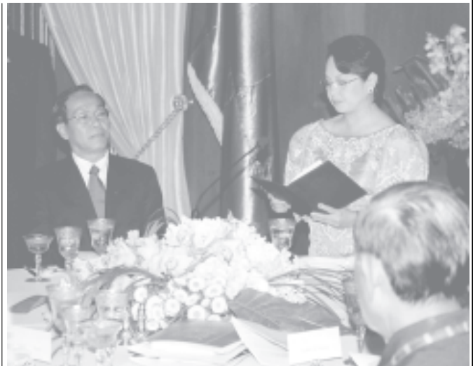
Philippine President Madame Gloria Macapagal Arroyo delivers an address.

I am deeply touched by Your Excellency's kind words of welcome. The warmth with which we have been received since our arrival in Manila no doubt reflects the close bonds of friendship between our two countries. It is a pleasure to be among friends. (See page 6)