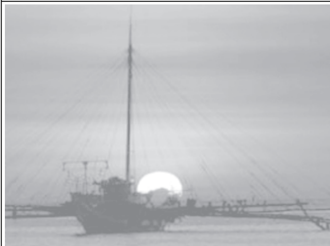
A traditional fishing boat sets off from a private wharf at sunset in the port city of Zamboanga, southern Philippines on 22 Feb, 2005.