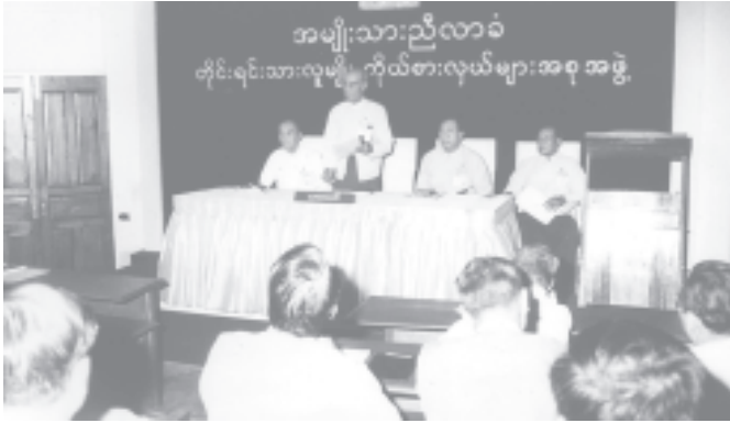
Members of the panel of chairmen and delegates of national races seen at the discussions.

YANGON, 23 Feb— The meeting of the panel of chairmen of delegates of national races and 14 representatives from 14 States and Divisions took place at the meeting hall-3 of Nyaungnabin Camp in Hmawby Township this afternoon for compilation of the delegates' proposals regarding the NCC Work Committee chairman's clarifications to detailed basic principles for distribution of the legislative power to be included in the framing of the State Constitution.