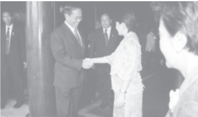
Philippine President Madame Gloria Macapagal Arroyo greets Prime Minister Lt-Gen Soe Win after the luncheon.