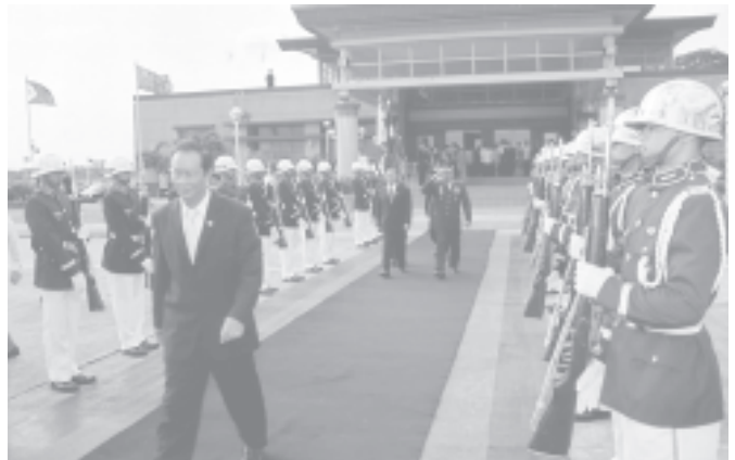
Prime Minister Lt-Gen Soe Win takes the salute of the Guard of Honour at Villamor Air Base in Manila.