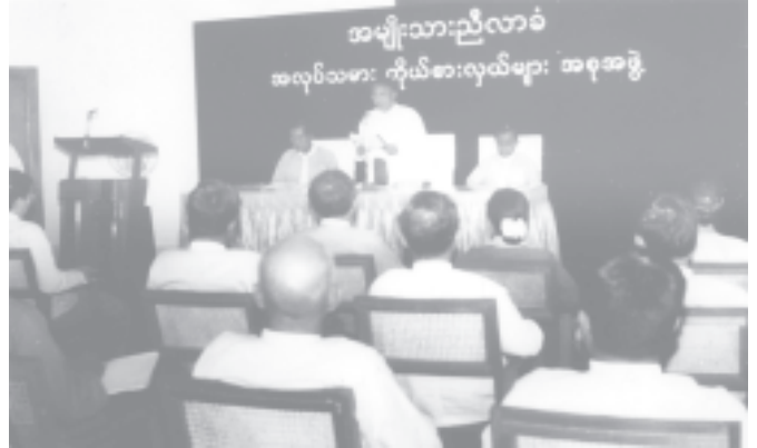
Members of the panel of chairmen and delegates of workers hold the discussions.