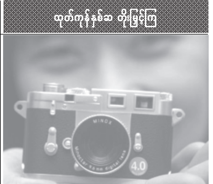
A Japanese woman shows the Minox miniature Leica M3 replica digital camera in Tokyo on 23 Feb, 2005.

To further arouse public awareness of the HealthyHK web site, the department will organize a series of roving exhibitions in a number of shopping arcades including New Town Plaza, Lok Fu Shopping Centre, Queensway Plaza and Kornhill Plaza between March and May this year.