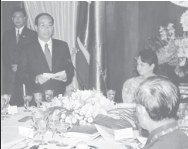
Prime Minister Lt-Gen Soe Win delivers an address at the luncheon.

YANGON, 23 Feb — The following is the full statement of Prime Minister of the Union of Myanmar Lt-Gen Soe Win at the luncheon given in his honour by the President of the Republic of the Philippines Gloria Macapagal Arroyo on 21-2-2005.