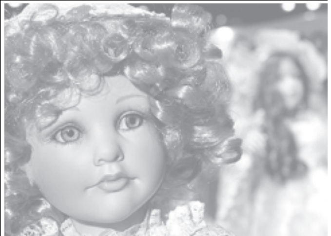
A porcelain doll by Seymour Mann is displayed recently at the 2005 American International Toy Fair at the Jacob Javits Convention Centre in New York City.

The 23rd Session of UNEP Governing Council and Global Ministerial Environment Forum entitled "Protecting the Environment: the thread that runs through the Millennium Development Goals" will be held from February 21 to 25 in the UNEP headquarters based in Nairobi.