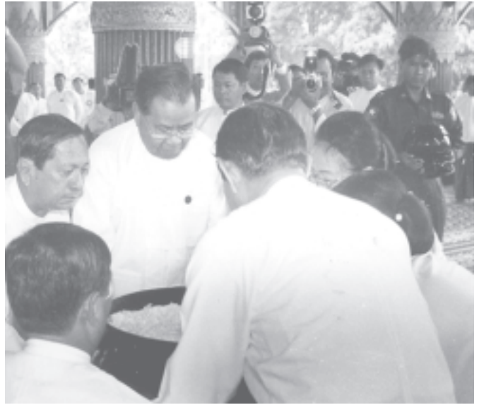
Senior General Than Shwe and wife Daw Kyaing Kyaing donate 'soon' to Lawka Chantha Abhaya Labha Muni Buddha Image.