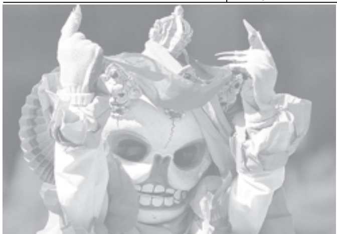
A dancer sporting a mask performs Cham Dances at the Labrang Monastery on the second day of the Monlam (Great Prayer) Festival in Xiahe, on the remote fringes of the Tibetan plateau in western China's Gansu Province, on 22 Feb, 2005