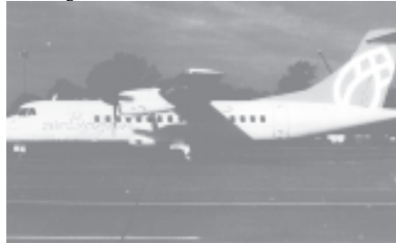
New arrival of ATR-42 aircraft for Air Bagan.— MNA

Air Bagan operates its regular domestic flights from Yangon to Mandalay, Nyaung U, Heho, Kengtung, Tachilek, Thandwe, Sittway, Myitkyina, Putao, Patheingyi, Dawei and Myeik by three aircraft— Fokker-100, ATR-72 and ATR-42. Air Bagan also operates chartered flights to other cities.— MNA