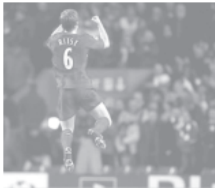
Liverpool's John Arne Riise celebrates his goal against Bayer Leverkusen during their Champions League soccer match at Liverpool, England, on 22 Feb, 2005.