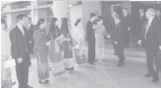
Prime Minister Lt-Gen Soe Win being seen off at Villamor Air Base in Manila by staff and families of Myanmar Embassy.