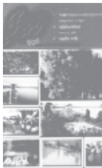
Vol II, No 5 issue of Doh Kyeywa Journal.— MNA