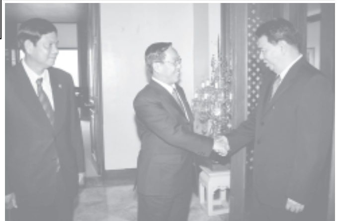
Prime Minister Lt-Gen Soe Win being greeted by Senate President Mr Franklin Drilon.