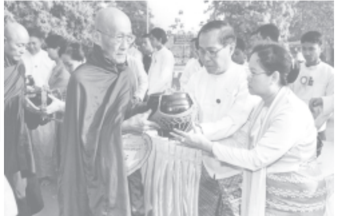
Prime Minister Lt-Gen Soe Win and wife Daw Than Than Nwe donate a 'soon' bowl to a Sayadaw.