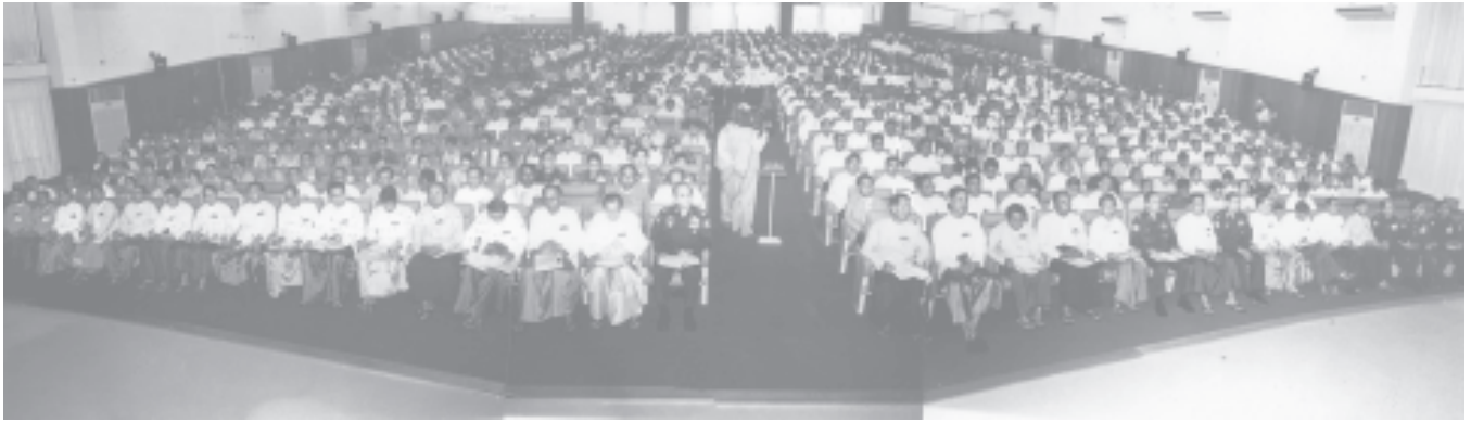
NCCC Chairman Secretary-1 Lt-Gen Thein Sein and members, chairmen of Work Committee and Management Committee and members, and delegates at the National Convention.