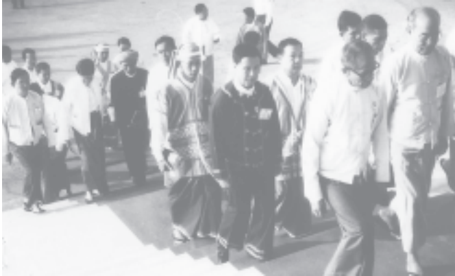
Delegates enter Pyidaungsu Hall to attend the NC.