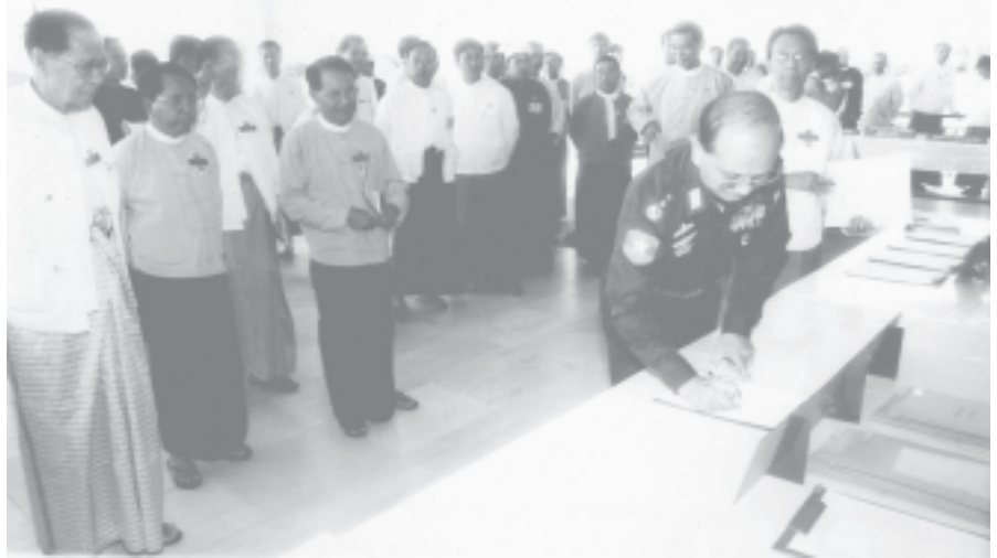
Secretary-1 Lt-Gen Thein Sein signs in the attendance book.