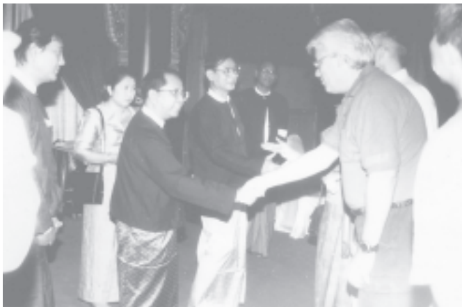
Minister Brig-Gen Kyaw Hsan cordially greets a foreign correspondent.

YANGON, 18 Feb — Minister for Information Brig-Gen Kyaw Hsan hosted a dinner to the correspondents of foreign news agencies abroad and local correspondents who were to make media coverage of the National Convention, at Karaweik Palace of Kandawgyi Gardens yesterday evening.