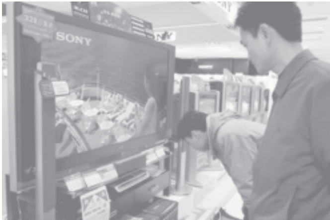
Chinese shoppers check the features of a wide-screen television set at a shopping mall in Shanghai on 18 Feb, 2005.