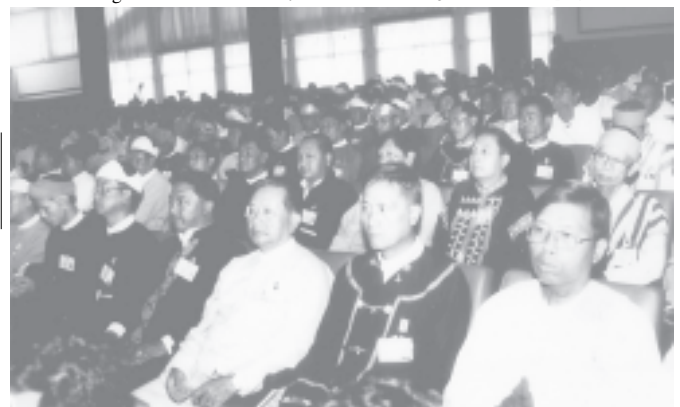
Delegates attend the National Convention.