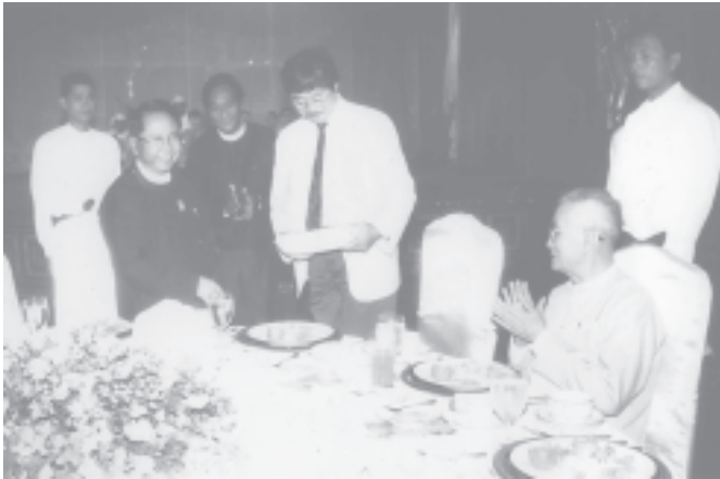
Minister Brig-Gen Kyaw Hsan presents books published by the ministry to a foreign correspondent. (News on page 16)