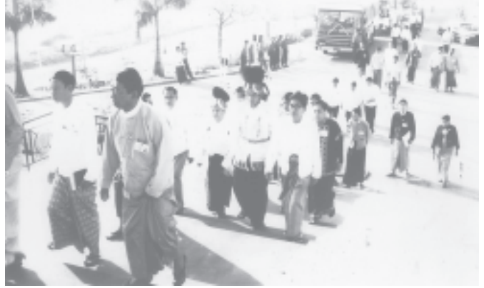
Delegates enter Pyidaungsu Hall to attend the NC.