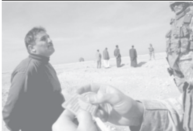
US Marines check the identity of an Iraqi national who was found with an AK-47 assault rifle in his car at a checkpoint on the highway between Haditha and the border with Syria and Jordan, 250 kms northwest of Baghdad.