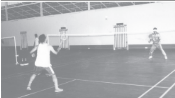
Delegates taking physical exercises.(News on page 16)