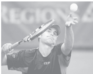
Andy Roddick

The 22-year-old American, who has dropped just 13 games in his two matches here thus far, will face compatriot Mardy Fish, the sixth seed, or Robby Ginepri in the round of eight.