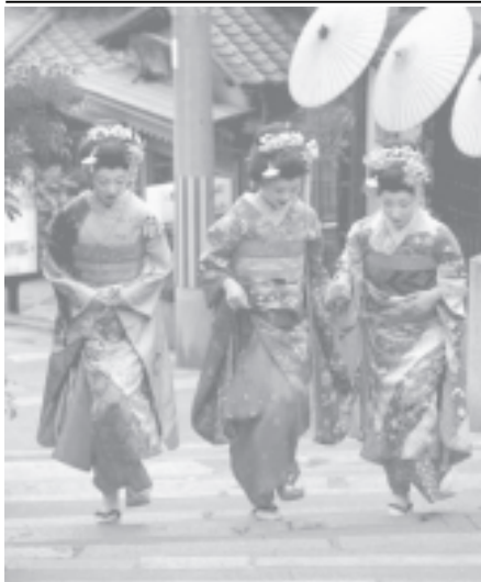
Tourists dressed as Maikos, Japanese traditional dancing girls, walk in Kyoto in western Japan, on 17 Feb, 2005. They can rent the Maiko costumes and have photographs taken in them from about 10,000 yen ($95).

In 2004, Changi Airport hosted 30.35 million passengers and handled 1.78 million tons of cargo, up 23.1 per cent and 10.2 per cent over the previous year. Both volumes were record-breaking.— MNA/Xinhua