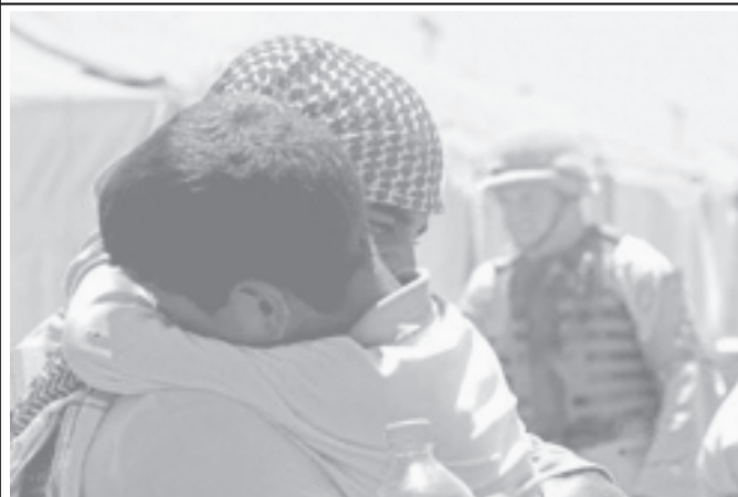
An Iraqi detainee embraces his son at the end of an hour of visitation inside the Abu Ghraib Prison west of Baghdad on 17 Feb, 2005.

"If the travel advisory continues, it will be unfair to us and therefore it should be corrected," he said.