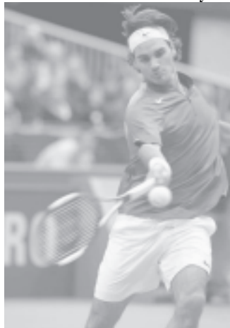
Roger Federer

The second set looked to be heading in a similar way when he was again broken at the beginning but cheered on by a boisterous crowd, Wawrinka found his footing and even earned a break point when his illustrious opponent was