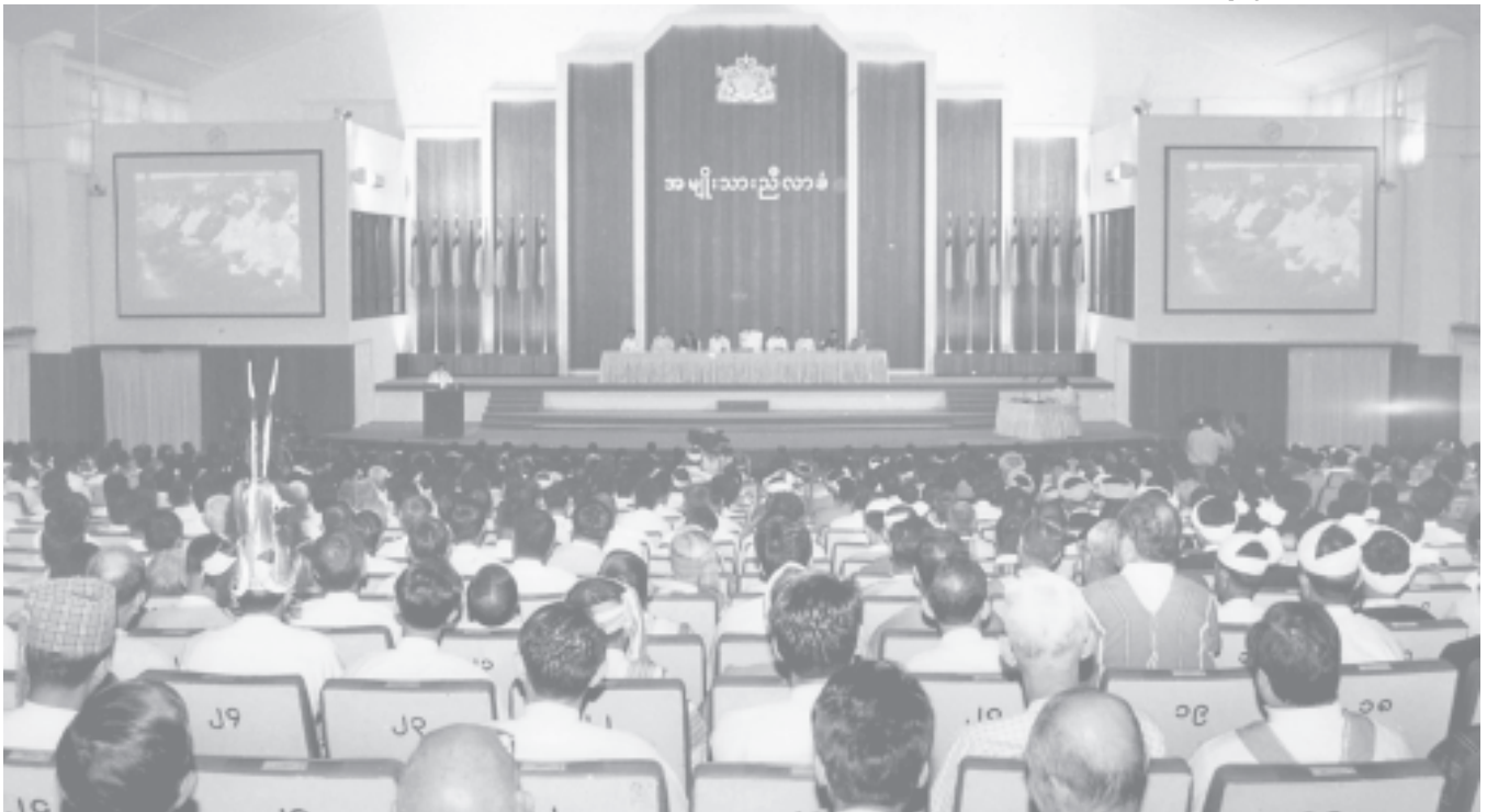
The Plenary Meeting of the National Convention in progress at Pyidaungsu Hall of Nyaunghnapin Camp in Hmawby Township.

Mon, Rakhine, Shan (South), Shan (North) and Shan (East) States, Sagaing, Taninthayi, Bago, Magway, Mandalay, Yangon and Ayeyawady Divisions, delegates of intellectuals and intelligentsia, delegates of workers from Kachin, Kayah, Kayin, Chin, Mon, Rakhine, Shan (South), Shan (North) and Shan (East) States, Sagaing, Taninthayi, Bago, Magway, Mandalay, Yangon and Ayeyawady Divisions, delegates of State service personnel from the State Peace and Development Council, the President's Office, the Pyithu Hluttaw Office, the Government Office, the Supreme Court, the Attorney-General's Office, the Auditor-General's Office, the Multi-party (See page 7)