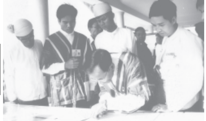
National Convention delegates sign in the attendance book.

intellectuals and intelligentsia, delegates of State service personnel, and other invited delegates signed the attendance registers at Pyidaungsu Hall and