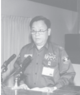
Maj-Gen Aung Thein.