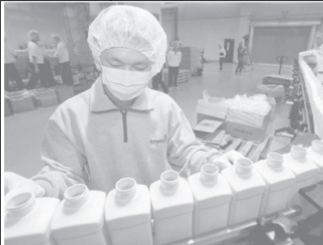
Workers check shampoo bottles on a production line at a Gaungzhou factory in the southern Chinese province of Guangdong.