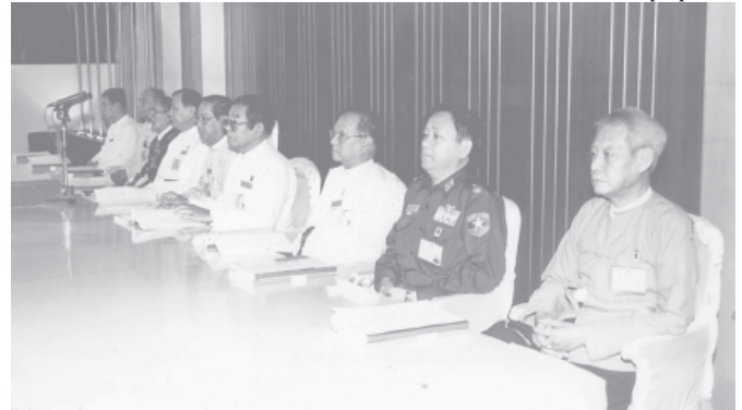
Member of the panel of chairmen. — MNA

The delegate group of the representatives-elect submitted five proposed