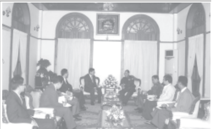
Minister Brig-Gen Thein Zaw receives Chinese guests. (News on Page-2)