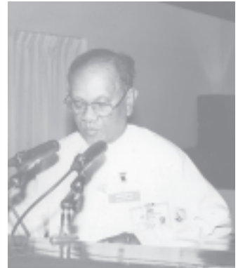
Dr U Thein Oo Po Saw.

egates on laying down basic detailed principles concerning the sharing the legislative power to be included in the State Constitution at Pyidaungsu Hall of Nyaunghnapin Camp in Hmawby Township yesterday.