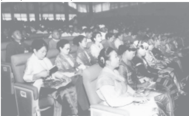
Delegates attend the National Convention.