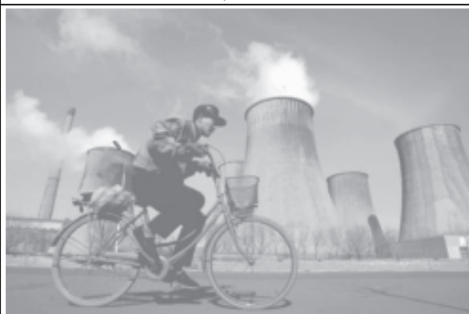
A man cycles past cooling towers of the coal powered Fuxin Electricity Plant in Fuxin, in China's northeast Liaoning province on 17 Feb, 2005.