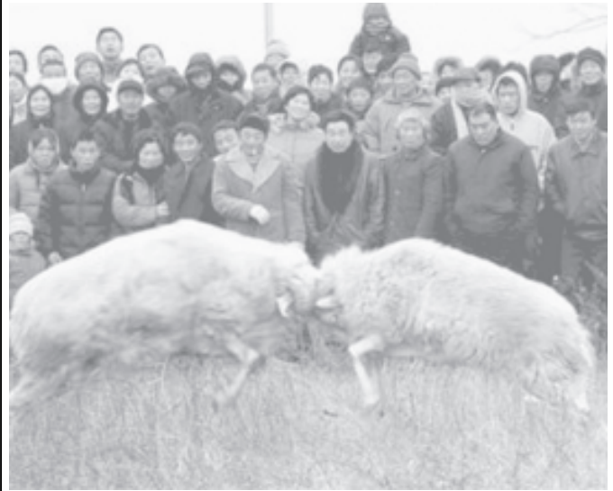
People watch sheep-fighting to celebrate China's traditional Spring Festival in Huaibei city, east China's Anhui Province on 17 Feb, 2005.