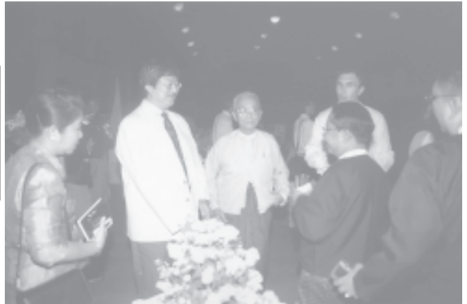
Minister Brig-Gen Kyaw Hsan cordially converses with foreign correspondents at the dinner. (News on page 16)