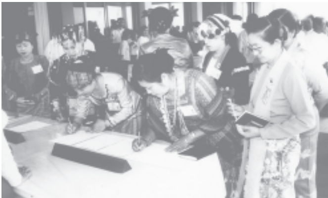
National Convention delegates sign in the attendance book.

presented matters relating to the social sector. (The presentation will be stated later) The National Convention continues on 21 February. MNA