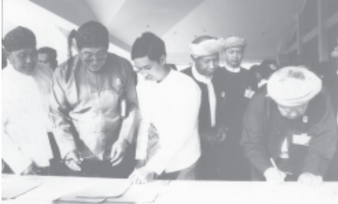
National Convention delegates sign in the attendance book.