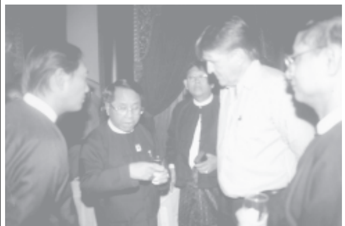
Minister Brig-Gen Kyaw Hsan gives replies to queries raised by a foreign correspondent at the dinner. — MNA

After the plenary session, the NC delegates had a recreation by playing games peacefully and joyfully yesterday and today evenings. —MNA