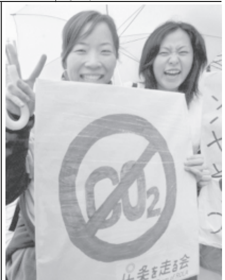
Members of a Japanese environmental group smile while holding anti-carbon dioxide placards at celebrations to mark the Kyoto Protocol coming into force on 15 Feb, 2005.

Prime Minister "Tony Blair didn't listen then and we don't expect him to listen in the future with regard to withdrawing troops or an attack on Iran — that's one of our greatest concerns," she said.