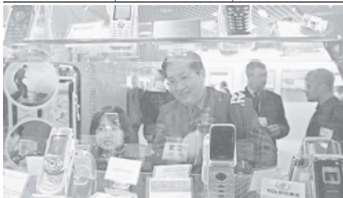
Visitors check out new mobile phones in Cannes during the GSM World Congress on 15 Feb, 2005. The number of 3G users globally is now approaching the 20 million mark.