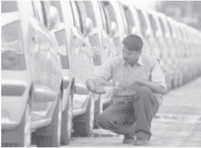
South Korea's top automaker Hyundai Motor said that it would build its second auto plant in India by mid-2007 to ride on the country's fast-growing demand for automobiles.—INTERNET