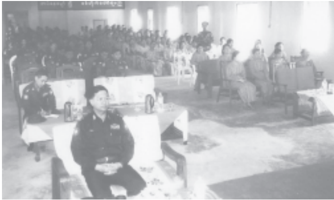
Lt-Gen Khin Maung Than meets with officers and other ranks of local battalion in Yeni.— MNA

It is a gravel-filled diversion weir, 7 feet high and 250 feet wide, and the