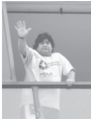
Argentinian former soccer star Diego Armando Maradona waves from the window of a hotel in Cartagena, Colombia, on, 11 Feb, 2005.