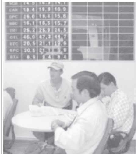
Vietnam's second stock exchange will open in Hanoi next month offering shares of state-owned companies undergoing painful restructuring to private investors. Here Ho Chi Minh's exchange on 16 Feb, 2005.