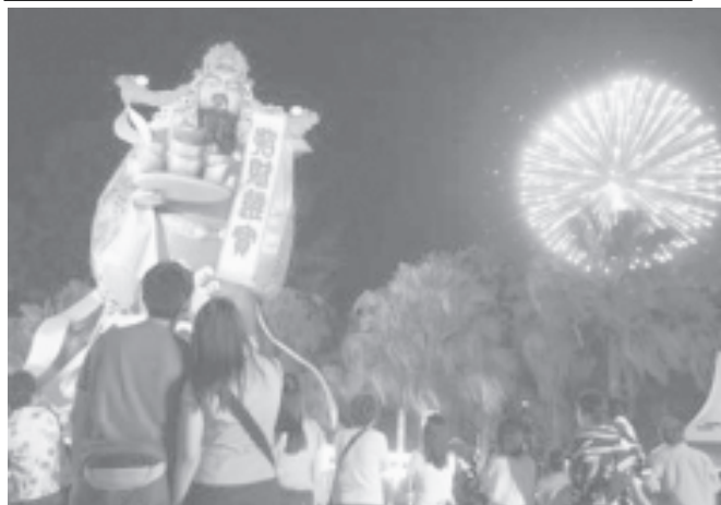
Standing by a statue of the God of Fortune people watch fireworks recently, marking the start of Chinese New Year celebrations in Singapore.