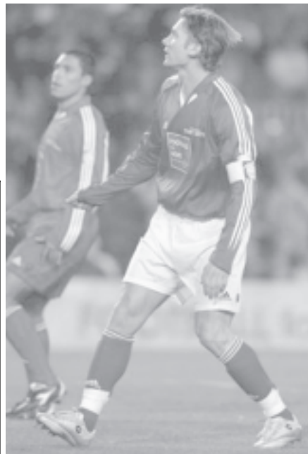
Ukrainian captain Andriy Shevchenko of the Andriy Shevchenko team looks on during the 'football for hope' charity soccer match against the Ronaldinho team in Barcelona, Spain, on Tuesday, 15 Feb, 2005. The soccer match, between two all-star teams, one led by World Player of the Year Brazilian Ronaldinho and the other by European Footballer of the Year Ukraine Andriy Shevchenko, is to raise money for the victims of the Indian Ocean tsunami. The Ronaldinho team won the match with 6-3.