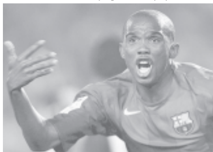
Barcelona's Cameroonian striker Samuel Eto'o, seen here in January 2005, was named African Footballer of the Year for the second consecutive year.

Eto'o, who was not in Durban to collect his award because he is in Barcelona to play in FIFA's tsunami benefit match on Tuesday, spoke briefly by video link.