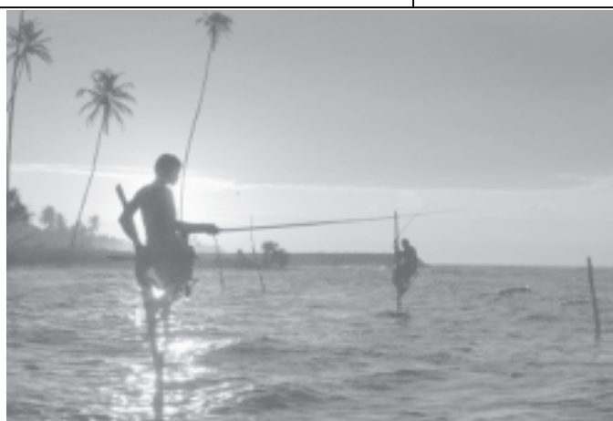
A stilt fisherman in south of Colombo on 14 Feb, 2005.