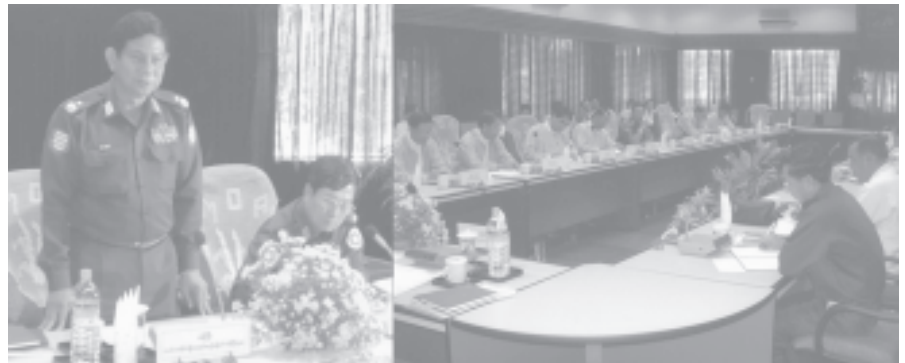
Minister for Agriculture and Irrigation Maj-Gen Htay Oo speaking at the meeting to promote export of agricultural produces.

He pledged that the two ministries would take measures for raising the socio-economic life of the people. The Agriculture and Irrigation Ministry would provide agricultural methods and assistance for extension of sown acreage and cultivation of market-