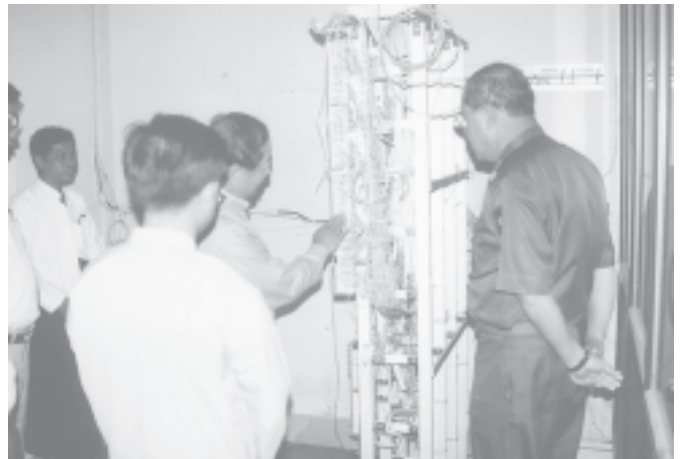
Minister for Communications, Posts and Telegraphs Brig-Gen Thein Zaw inspects Taungdwingyi Auto-Telephone Exchange.—COMMUNICATION

In Magway, the minister together with Chairman of Magway Division Peace and Development Council Col Phone Maw Shwe in-