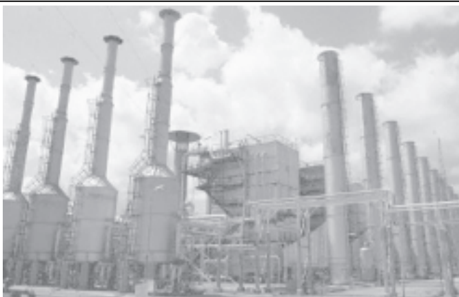
A liquefied natural gas (LNG) processing plant in South Korea recently. South Korea will buy 20 billion dollars of LNG from Yemen, Malaysia and Russia over 20 years from 2008.