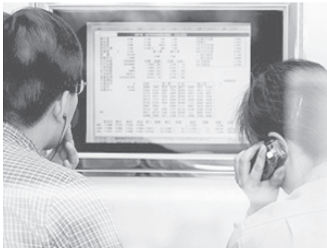
Chinese business people look at a screen on 13 Feb, 2005. The number of FBI investigations into Chinese espionage in California's technology corridor has soared.