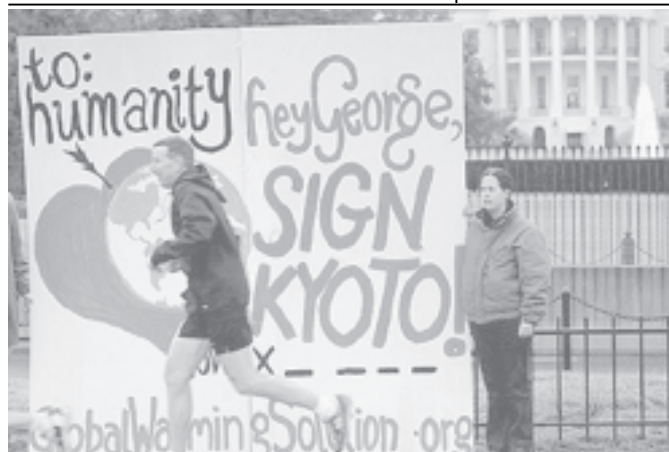
A runner passes an activist holding a huge "Valentine to humanity" during a protest of US President George W Bush's withdrawal of support for the Kyoto Protocol on 14 Feb, in Washington, DC.