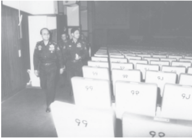
NCCC Chairman Secretary-1 Lt-Gen Thein Sein inspects preparatory tasks at Pyidaungsu Hall where the National Convention will be held. (News on page 1)