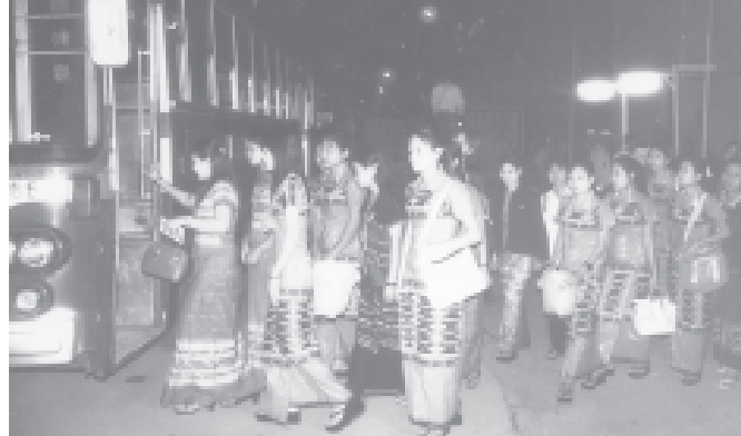
Union Day delegates from states and divisions leave for home.

the 58th Anniversary Union Day Ceremony and Dinner, returned home by air, train and car starting this morning.