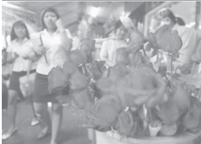
Thai girls look at bouquets of roses at a flower market in Bangkok recently.