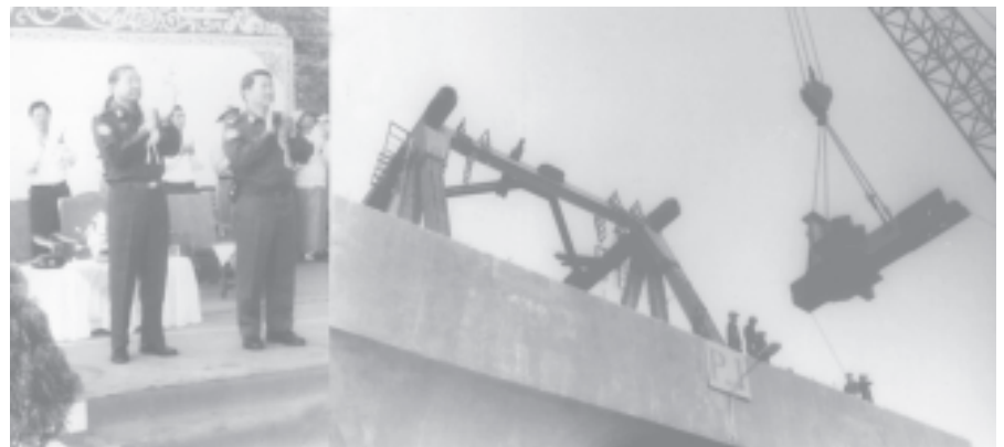
Commander Maj-Gen Soe Naing and Minister for Construction Maj-Gen Saw Tun oversee installation of iron frame at Pyapon Bridge.— CONSTRUCTION

The minister and party arrived back here in the evening.— MNA