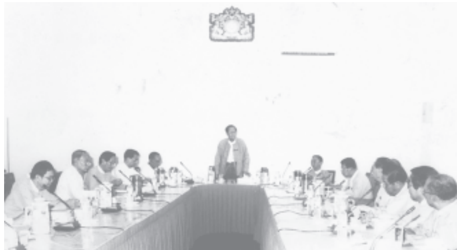
NCCWC Chief Justice U Aung Toe addresses coordination meeting of NCCWC and members of the Panel of Alternate Chairmen of Plenary Meeting of National Convention.— MNA

The meeting ended with the concluding remarks by the chairman of NCCWC. — MNA