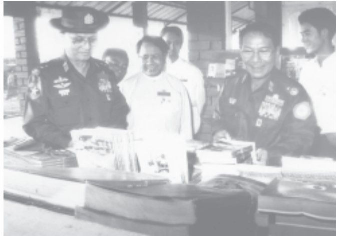
NCCC Chairman Secretary-1 Lt-Gen Thein Sein views Sarpay Beikman Book Stall at Nyaunghnapin Camp in Hmawby Township. (News on page 1)