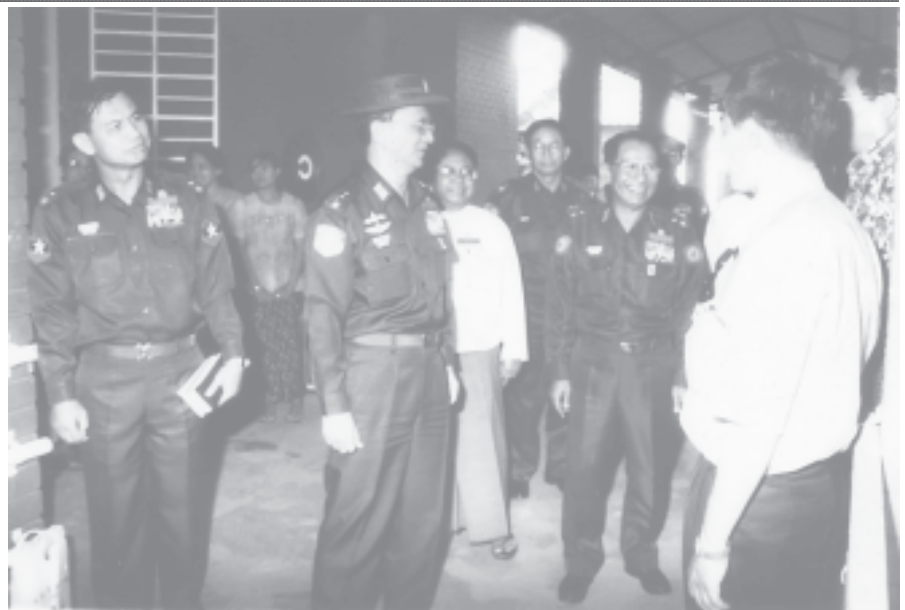
NCCC Chairman Secretary-1 Lt-Gen Thein Sein cordially converses with National Convention delegates.— MNA