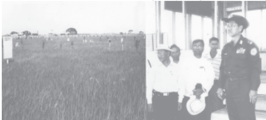
Commander Maj-Gen Myint Swe inspects summer paddy special zone near Malit Village of Hlegu Township.— YANGON COMMAND