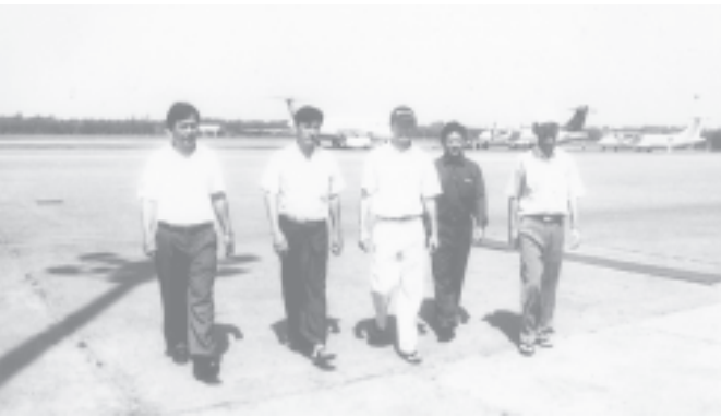
Delegates from Shan State (North) arrive at the airport.