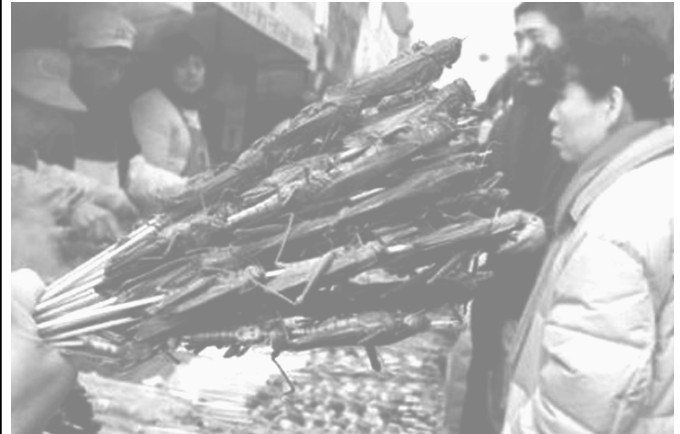
Chinese visitors buy barbecued locusts at a fair in the Temple of the Earth in Beijing on 14 Feb, 2005.