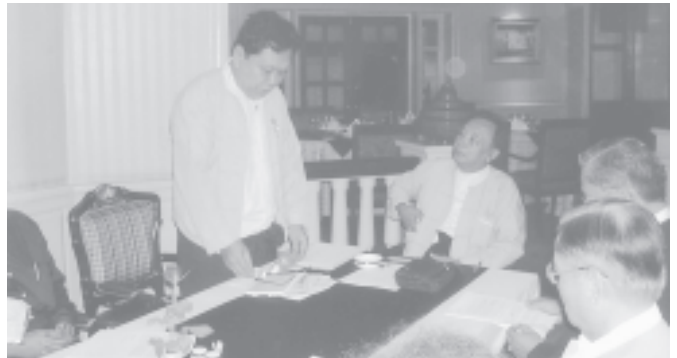
Secretary of MFCC explains about budget report at Annual Meeting of MFCC.