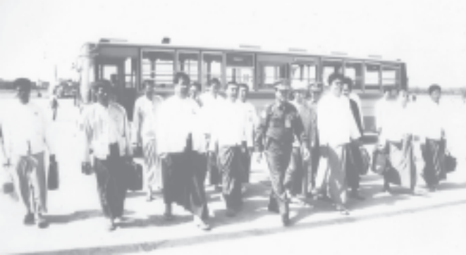
Delegates from Rakhine State being welcomed at the airport.