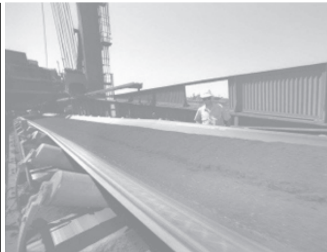
A worker inspects iron ore at BHP Billiton's facilities in West Australia. The global mining giant is poised to post the largest interim net profit in Australian corporate history on 12 Feb, 2005 as unprecedented demand from China and high commodity prices continue to boost its bottomline.