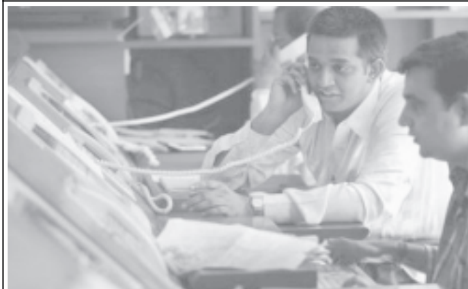
Indian stock brokers trade at a brokerage firm in Bombay on 14 Feb, 2005.

He said that the idea behind the move is that it will take at least two years to build 20,000 to 30,000 permanent houses for those people.—MNA/Xinhua