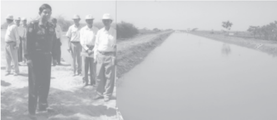
Minister Maj-Gen Htay Oo inspects water supply and maintenance of canal in Ngamoeyek Dam in Hlegu Township. — AGRICULTURE & IRRIGATION

Officials also reported on boosting income of local farmers on account of the extended cultivation of summer paddy and other crops. The minister gave instructions on construction tasks, cultivation of cash crops and assistance to be rendered. Afterwards, the minister oversaw the construction of the sluice gate building by use of heavy machinery. Later, the minister inspected paddy plantations of various species near the agricultural education camp at block No 492-A in Malit village, Hlegu township, supply of river water for irrigation of farmland through the Malit river-water pumping project. — MNA