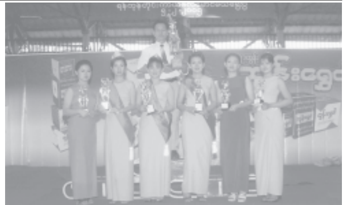
BODY BUILDING & BEAUTY CONTEST: Yangon Division Body Building and Physical Culture Subcommittee and Tun Shwe Wah Traditional Medicine Enterprise jointly organized the 58th Union Day commemorative Yangon Division body building and beauty contest on 5-2-2005. Photo shows Latha Township team, that won championship shield, posing with modals. — H