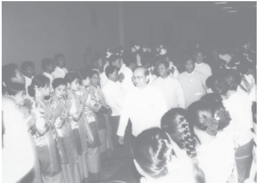
Chairman of Central Committee for Observance of the 58th Anniversary Union Day Secretary-1 Lt-Gen Thein Sein cordially greets Union Day delegates. — MNA

Artistes of the University of Culture (Yangon), Myanmar Music and Motion Picture Asiayons presented songs and Myanmar traditional cultural dances.—MNA