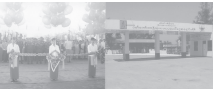
Maj-Gen Myint Swe, Minister Brig-Gen Lun Thi and ministers attend opening of the filling station. — ENERGY

First, Minister for Energy Brig-Gen Lun Thi and Minister for Rail Transportation Maj-Gen Aung Min formally opened the filling station and Yangon Commander formally unveiled the signboard of the station. Next, the commander, the ministers and party were conducted around the station by Director of MOGE U Myint Htay. — MNA