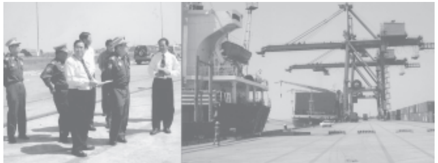
Minister Maj-Gen Thein Swe inspects Myanmar International Port (Thilawa). — TRANSPORT

YANGON, 15 Feb — Minister for Transport Maj-Gen Thein Swe arrived at Myanmar International Thilawa Terminal this afternoon and inspected unloading of tar containers from the vessel.