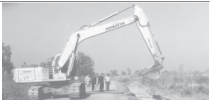
Deputy Director-General of Development Affairs Department Thuwa U Soe Aung inspects progress in building of Moekaung-Gwaykon-Shwethahtay road section in Aunglan Township on 7 February. — H