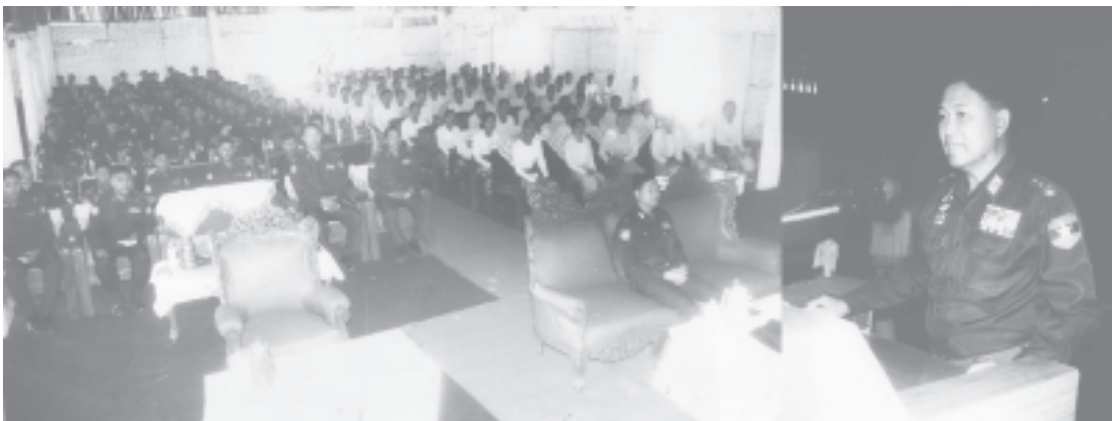
Lt-Gen Khin Maung Than holds a meeting with officers and other ranks and their families in Ottwin.

Emergence of the State Constitution is the duty of all citizens of Myanmar Naing-Ngan.