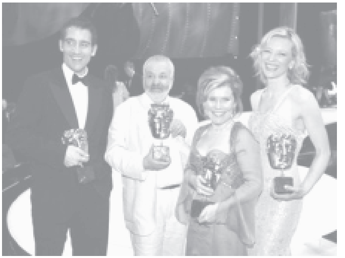
From left to right: Clive Owen with his Best Supporting Actor Award for ‘Closer,’ Mike Leigh with his Best Director award for ‘Vera Drake,’ Imelda Staunton with her Best Actress award for ‘Vera Drake,’ and Cate Blanchett with her Best Supporting Actress Award for ‘The Aviator,’ pose together after the British Academy Film Awards (BAFTAs), at the Odeon Leicester Square in central London on Saturday night, 12 Feb, 2005.