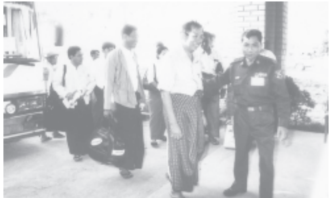
Delegates from Bago Division (East) arrive at Nyaungnapin Camp.