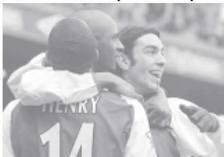
Arsenal's French internationals (R-L) Robert Pires, Patrick Vieira and Thierry Henry. Arsenal fielded their first entirely overseas squad in their 119-year history with no British players on the field or the bench for the Premier League match against Crystal Palace.

LONDON, 15 Feb— Arsenal produced a scintillating display of attacking football to crush Crystal Palace 5-1 and close to within two points of second-placed Manchester United in the Premier League on Monday.