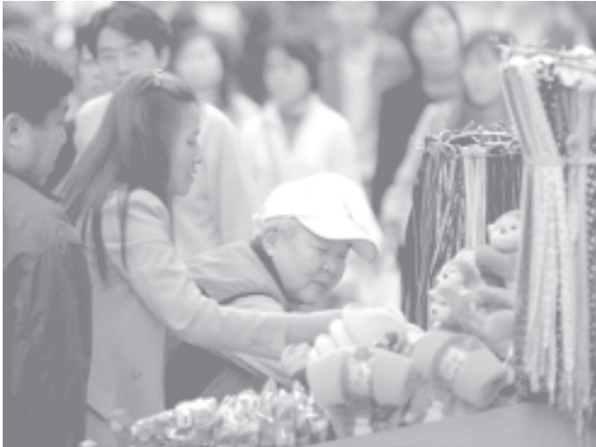
Shoppers look for goods to buy in Seoul on 14 Feb, 2005.