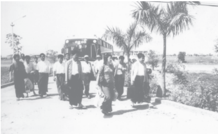
National Convention delegates from Ayeyawady Division arrive at Nyaungnabin Camp, Hmawby.

YANGON, 13 Feb — National Convention delegates of respective groups arrived here by air and by car to attend the National Convention which is to resume on 17 February at the Nyaungnabin Camp in Hmawby township.