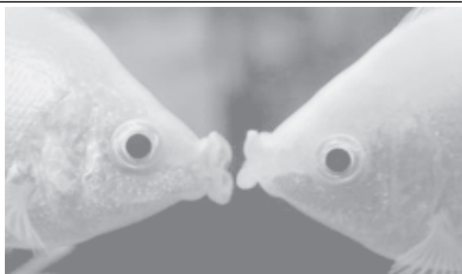
A pair of tropical kissing fish, locally called Jie wen yu, kiss at a pet shop in Shanghai on 14 Feb, 2005. — INTERNET

The exchange cut costs by 22 per cent, but its operating revenue went up 79.8 per cent in 2004, according to Chang. Shenzhen, a boomtown facing Hong Kong across a river, hosts the China High-tech Fair every October. — MNA/Xinhua