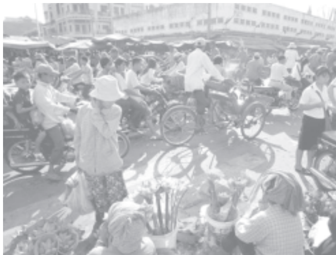
Cambodian woman stops to buy flowers outside a busy market in Phnom Penh recently.

The US market accounts for 60 per cent of its annual revenue. "In view of the growing interest of global corporations in the KPO business, we have decided to increase our manpower in the Chennai facility from 400 to 600 by the end of the current year," said Sivadas.—MNA/Xinhua