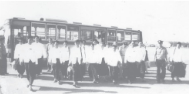
Delegates representing Kachin State arrive at the airport.