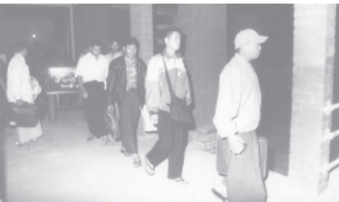
Delegates from Shan State (South) arrive at Nyaungnapin Camp.