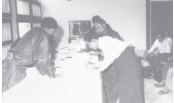
Delegates from Bago Division (West) put their signatures in the registration book at Nyaungnapin Camp.

tion with merit-sharing ceremony. At the ceremony, provisions will be offered to 108 members of the Sangha and 31 nuns led by State Sangha Maha Nayaka Sayadaws.—MNA