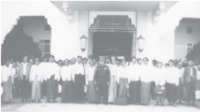
Officials welcome delegates from Mandalay Division at Yangon Central Railway Station. — MNA