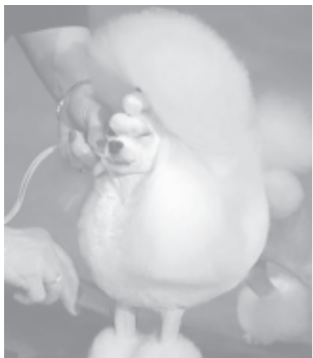
The Best of Breed for the Poodles (Toy), 'Champion North Well Chako JP Platina King,' is groomed on the ramp waiting to be called for the judging of the toy group of dogs at the Westminster Kennel Club show at New York's Madison Square Garden, on 14 Feb, 2005.

War-time tunnels at Labrador Park, one of Singapore's strategic defensive sites and a key site of resistance during WWII, will open to the public for the first time from March, and people will have rare opportunities to visit WWII sites in September where public access is denied normally. Memorial services in mid-September at the Kranji War Memorial, the Changi Chapel Museum and the Semba-wang Wharves will mark the end of the commemorative series.