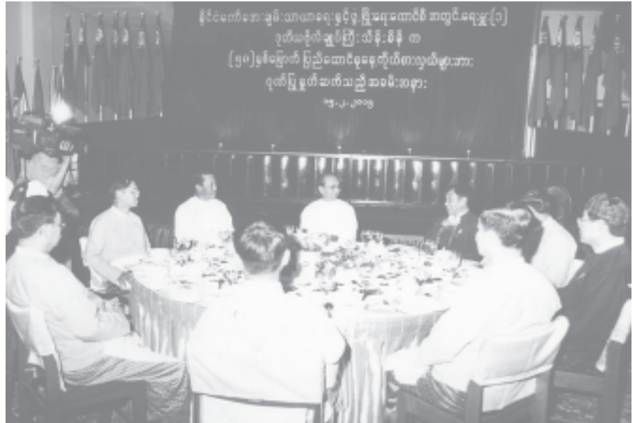
Secretary-1 Lt-Gen Thein Sein hosts dinner for Union Day for delegates in honour of the 58th Anniversary Union Day. (News on page 1)