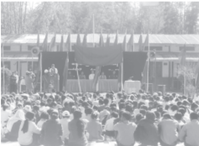
The mass rally to honour Union Day and support the National Convention in progress at Laukkai District, Shan State (North) (News on page 16).