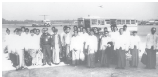
National Convention delegates of Rakhine State being welcomed at the airport. (News on page 16)