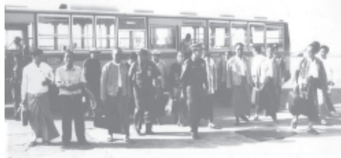
National Convention delegates of Sagaing Division and Chin State being welcomed at the airport. (News on page 16)