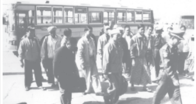
National Convention Delegates of Shan State (South) and Chin State being welcomed at the airport.