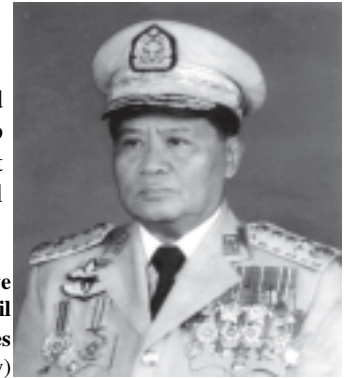
Senior General Than Shwe Chairman of the State Peace and Development Council Commander-in-Chief of Defence Services (From the message sent to the 57th Anniversary Union Day)

The State has already declared its seven-point future political programme clearly and openly. The seven points show exactly the way in which all the national races will have to march towards a discipline-flourishing modern and developed democratic nation without fail. The national races who love the country will have to walk straight on the way with full Union Spirit and the spirit of national unity.