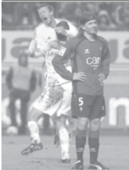
English Real Madrid player David Beckham shouts as he embraces his Spanish teammate Ivan Helguera congratulating him with his goal as Uruguayan Osasuna player Pablo Garcia, right, looks on during their Spanish league soccer match in Pamplona, Northern Spain, on Sunday, Feb. 13, 2005. Real Madrid won the match with 2-1.

Osasuna should have extended their lead on the stroke of halftime when the unmarked Morales sliced over from five metres after Pablo Garcia picked him out with a fine through pass.