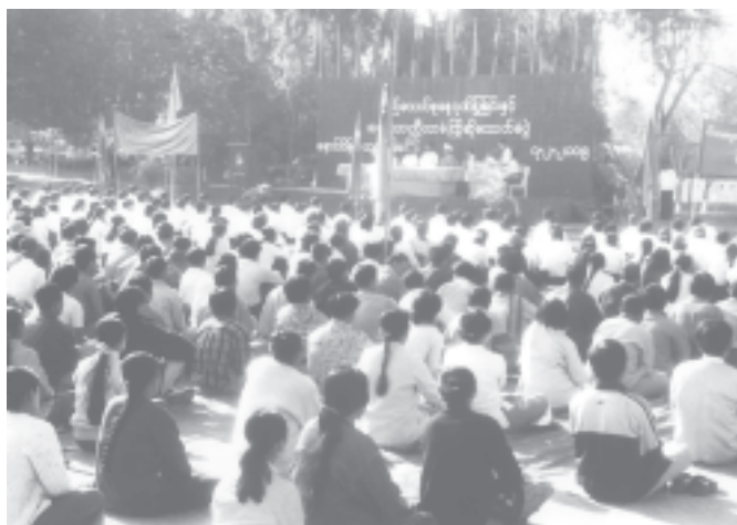
The mass rally to honour the Union Day and to hail the National Convention in progress in Kyaukme Township, Shan State (North).

YANGON, 14 Feb — Members of Union Solidarity and Development Association, other social organizations, local people and cultural troupes totalling over 2,000 hailed the Union Day and supported the National Convention at Nongpain model village in Kyaukme Township, Kyaukme District, Shan State (North), on 7 February.