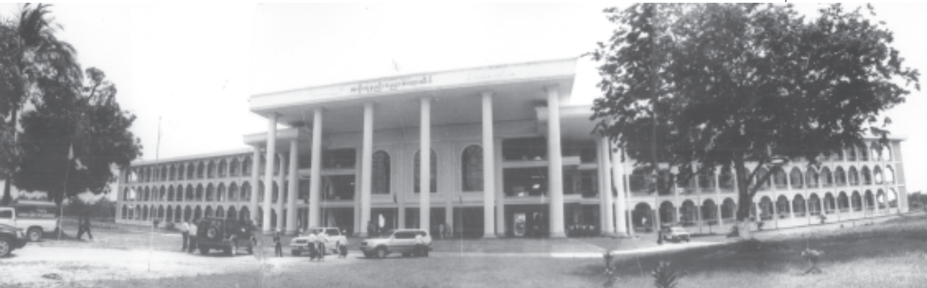
The main building of Government Technological College in Patheingyi, Ayeyawady Division. MYANMA ALIN