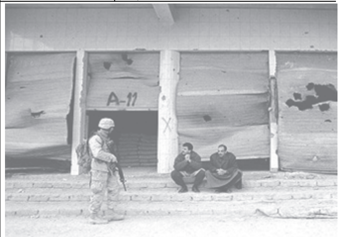
Iraqi men look at a soldier of the Kilo Company 3rd Battalion Fourth Marines patrolling in downtown Fallujah, 50 kms west of Baghdad on 14 Feb, 2005.