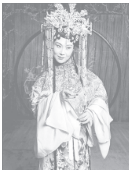
This handout photo shows a Kunqu performer dressed up in her costume prior to a performance in Beijing recently. Kunqu is China's oldest opera form and is known for its graceful acting movement and poetic lyrics, combining song, body movement and dance but lacks the martial arts acrobatics well-known in Peking opera. — INTERNET

India's exports in 2003-2004 were estimated at 63.4 billion US dollars. — MNA/Xinhua