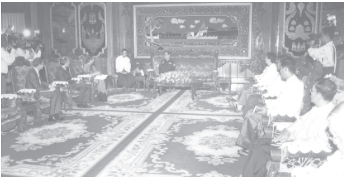
Prime Minister Lt-Gen Soe Win receives Dr Nafis Sadik, Special Adviser to the United Nations Secretary-General and Special Representative of Asia and the Pacific Region Anti-AIDS Campaign.