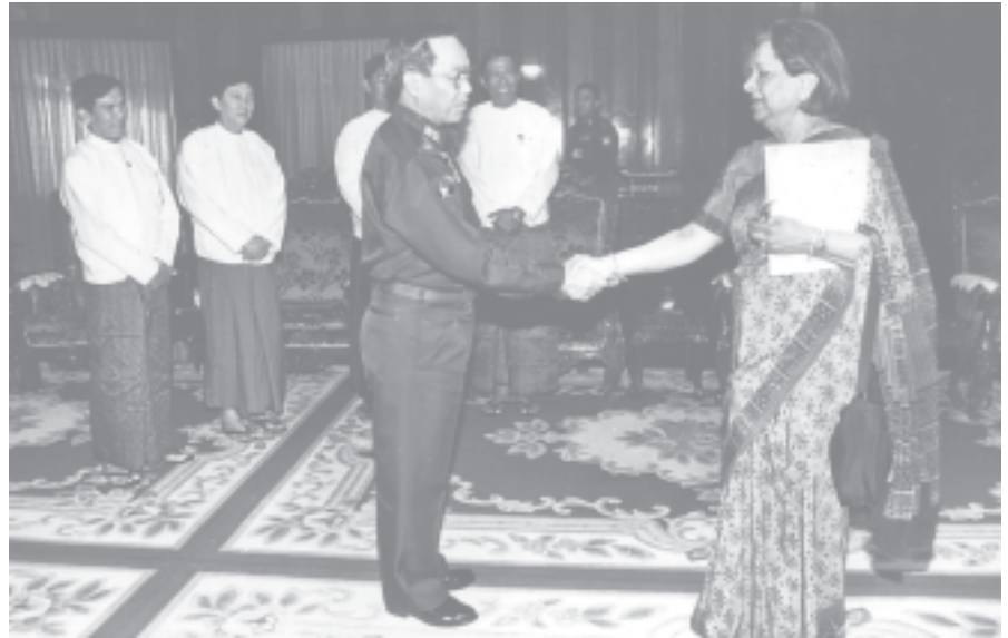
Prime Minister Lt-Gen Soe Win cordially greets UN Secretary-General's Special Adviser Dr Nafis Sadik at Zeyathiri Beikman on Konmyinthta. (News on page 1)