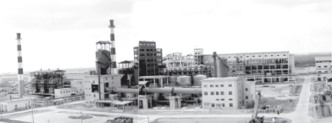
The 200-ton Pulp Factory Project (Thabaung) in Thabaung Township, Ayeyawady Division.