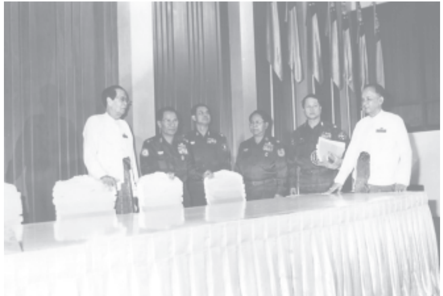
NCC Vice-Chairman Maj-Gen Tin Htut and party inspect preparations in the Pyidaungsu Hall. — MNA

First, they inspected the Pyidaungsu Hall, the venue of the plenary session of the National Convention and the mess hall and gave necessary instructions to officials. Next, they oversaw the hostel and recreation centre for NC delegates, cooperative shops, Win Thuza Shop of the Ministry of Industry-1, Sarpay Beikman Book Shop and book rental shop of the Ministry of Information, Mon Mon Beauty Salon, Myanmar optical shop, post office of Myanmar Posts and Telecommunications, upgrading of the open-air stage for entertainment programmes, commodity shop of the Ministry of Livestock and Fisheries, restaurants of Myanmar Hotels and Tourism Enterprise and the Ministry of Industry-1 and preparations made at the gymnasium, health and fitness centre and playground and hospital. Later, Maj-Gen Lun Maung and party gave necessary instructions to officials. — MNA