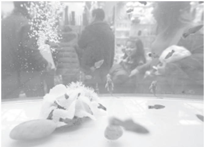
A mother (R) holds onto her daughter as they walk between rows of tanks while shopping for pet fish in Beijing on 13 Feb, 2005.