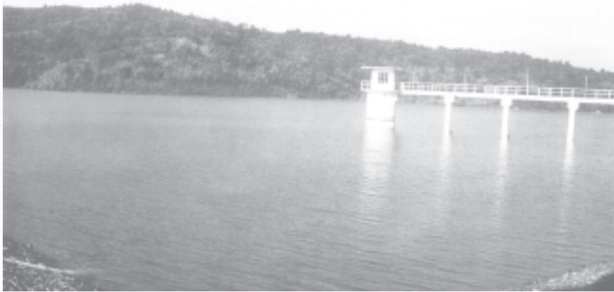
Nankathu Dam in Ingapu Township, Ayeyawady Division.