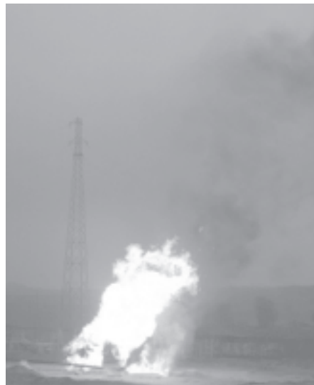
A gas pipeline linking Iraq's northern oil hub of Kirkuk to the Baiji refinery burns after being hit by a rocket, on 9 Feb, 2005.