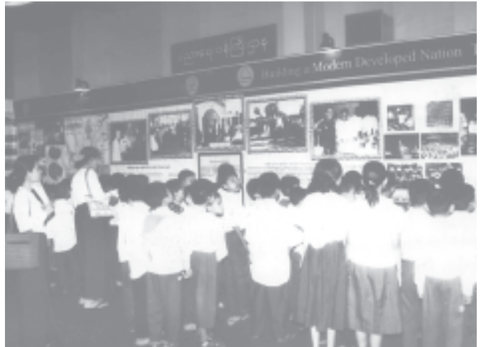
The 58th Anniversary Union Day Commemorative Exhibition at the Tatmadaw Convention Centre attracts teachers and students.