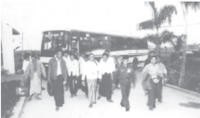
NC delegates of Magway Division arrive at Nyaungnapin Camp, Hmawby Township. (News on page 16)