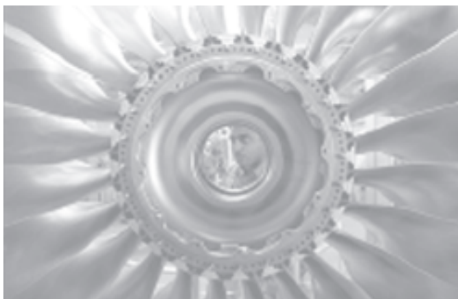
Engine assembly : A journalist looks at a CFM56-7 jet engine fan blade assembly on display at the Aero India 2005 airshow at the Yelahanka Air Force Station on the outskirts of Bangalore recently.