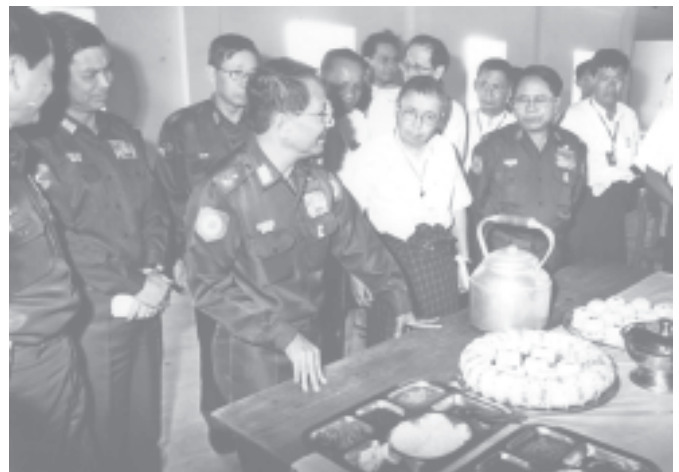
NCC Vice-Chairman Maj-Gen Tin Htut inspects preparatory measures taken at the staff mess hall at Nyaungnmapin Camp. (News on page 16)