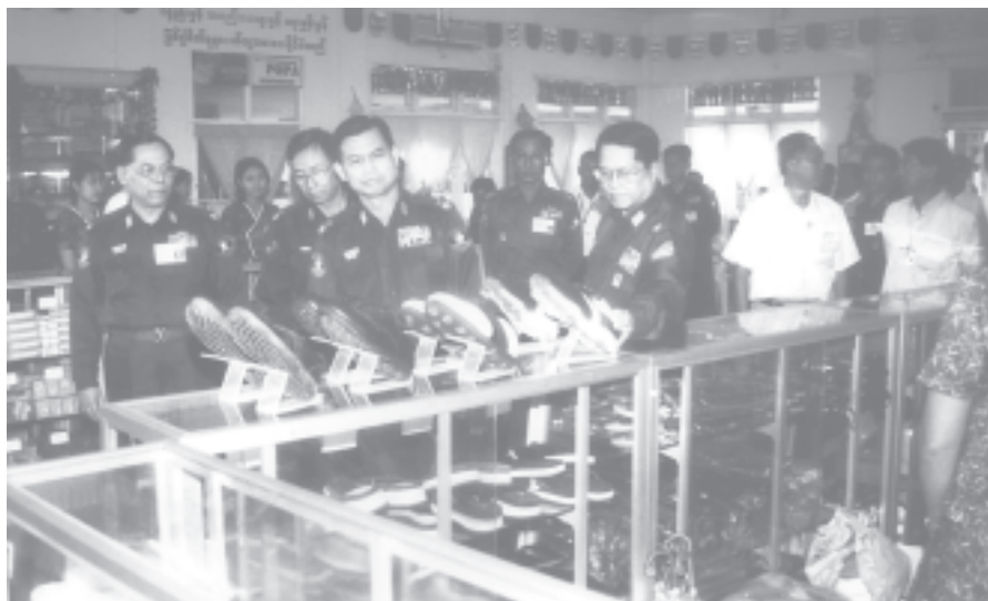
Maj-Gen Lun Maung visits Win Thuza Shop of Ministry of Industry-1.