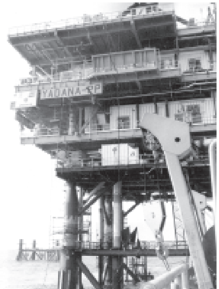
The rig at block No-1 of Yadana gas field seen offshore Taninthayi coast.