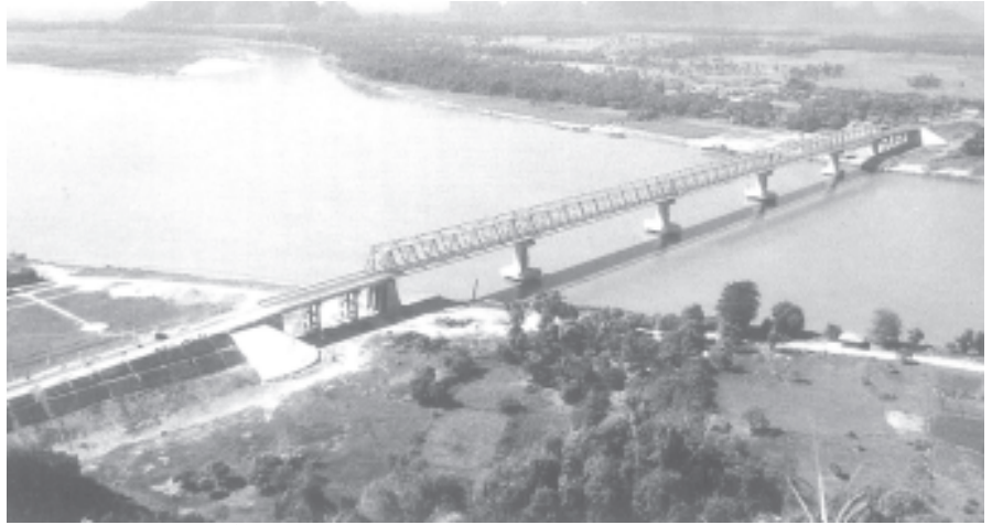
Thanlwin Bridge (Hpa-an) linking Myainggalay and Hpa-an in Kayin State was commissioned into service on 3 August, 1997.