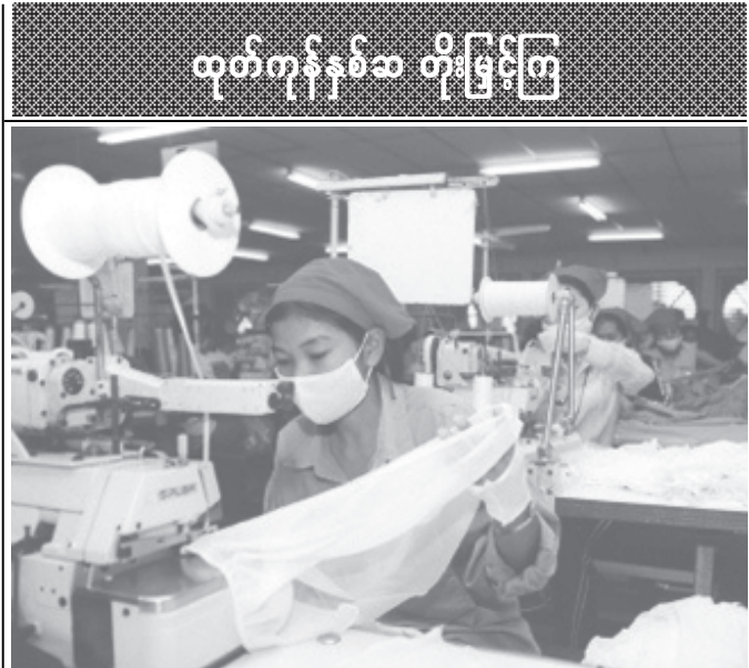
Garment factory workers stitch garments for export in Phnom Penh recently.