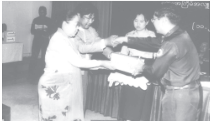
Commander Maj-Gen Myint Swe accepts cash and kind donated by wellwishers hailing 60th Anniversary Armed Forces Day Parade.

Than; K 500,000 each by All Private Bus-line Control Committee and Sibin Thayayay Bank Ltd; K 500,000 by U Yan Kyar Saik; K 1 million by YCDC and K 500,000