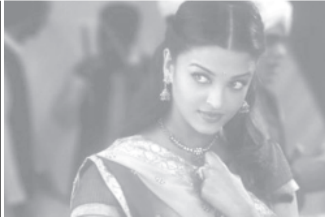
Aishwarya Rai appears in a scene from the new film 'Pride and Prejudice'. The film by 'Bend It Like Beckham' director Gurinder Chadha takes novelist Jane Austen's 183 classic 'Pride and Prejudice' and sets it in contemporary small-town India.