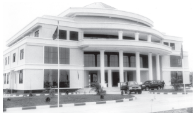
Bhamo degree college built in Bhamo, Kachin State.