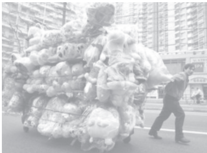
A Chinese vendor pulls a container full of stuff toys to sell on the eve of the Lunar New Year in Shanghai on 8 Feb, 2005.

The 13-man Chinese expedition team left the eastern port of Shanghai on 25 October last year. They surmounted the highest icecap peak in Antarctica on 18 January, becoming the first humans to reach the peak of Dome A Icecap, 4,039 metres above sea level, located at 80:22:00 degrees South Latitude and 77:21:11 degrees East Longitude.—MNA/PTI