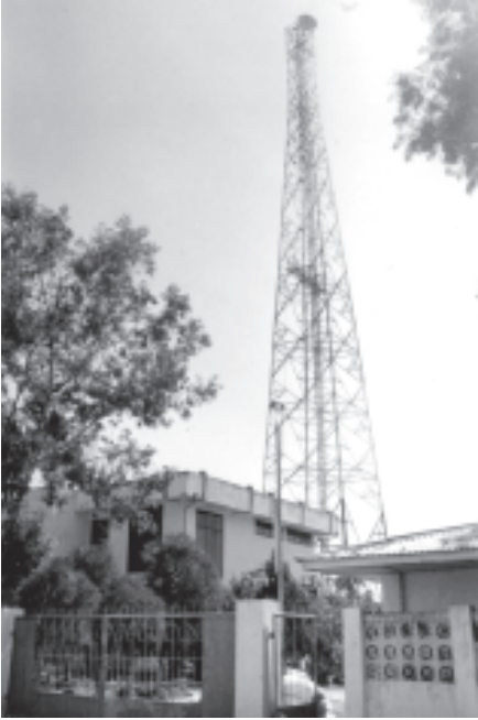
For the convenience of people living in Kayah State, a microwave station was built in Loikaw, Kayah State.