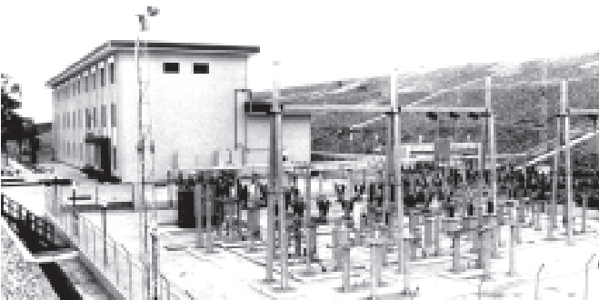
Thaphanseik Hydel Power plant built near Thaphanseik village in Kyunhla Township, Shwebo District, Sagaing Division.