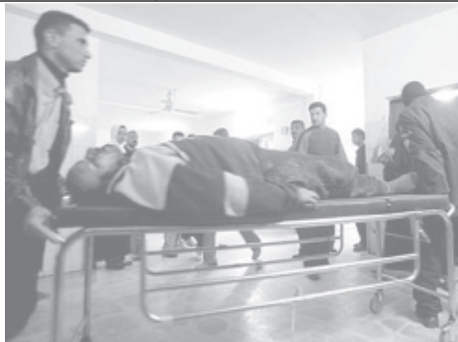
An Iraqi policeman is rushed into the emergency room of Yarmuk hospital in Baghdad after an attack on a police patrol 20 km south of Baghdad recently.