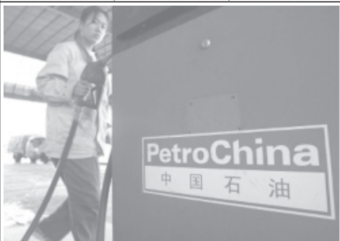
A PetroChina gas station attendant in Beijing returns the nozzle. Energy-hungry China dug deeper last year in search of new oil, boosting its reserves by at least 25 percent