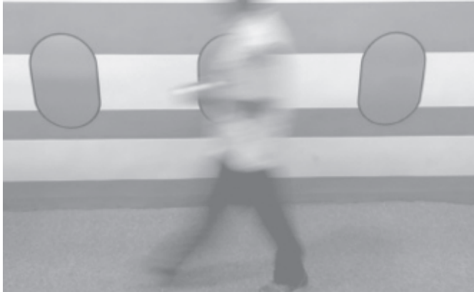
India is planning to develop a new jet fighter and a long-range version of an unmanned aircraft. —INTERNET