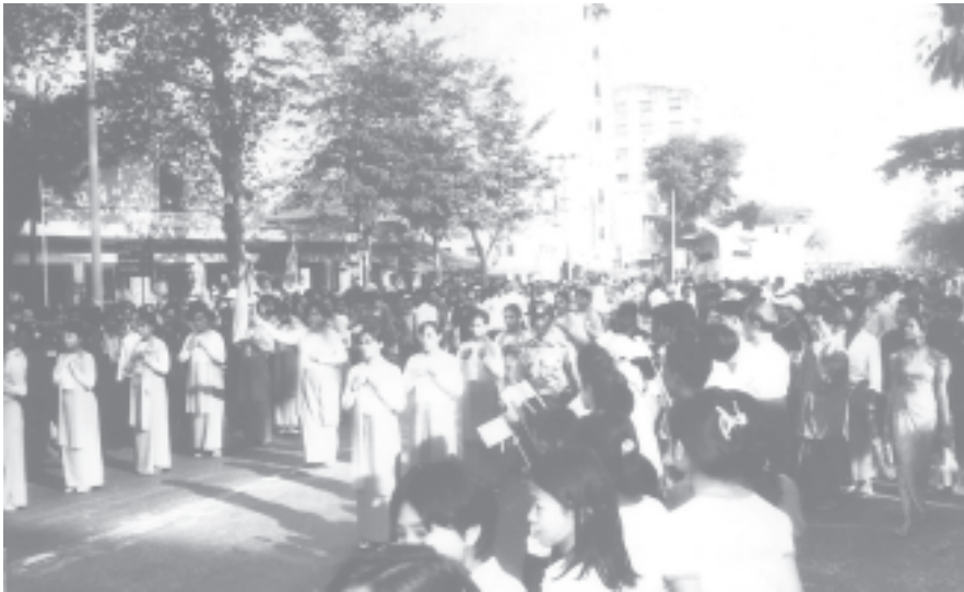
Union Flag conveying ceremony in progress in Kyimyindine Township.