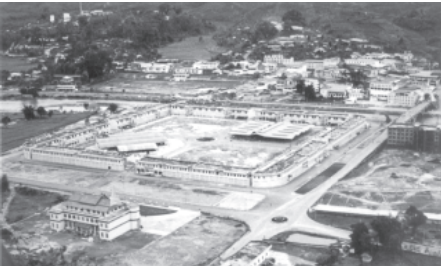
The above photo stands witness to the fact that Mongla in the border region in Shan State (East) has developed significantly. MYANMA ALIN