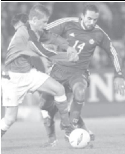
Northern Ireland's Steve Davis, left, battles for the ball with Canada's Dwayne De Rosario.