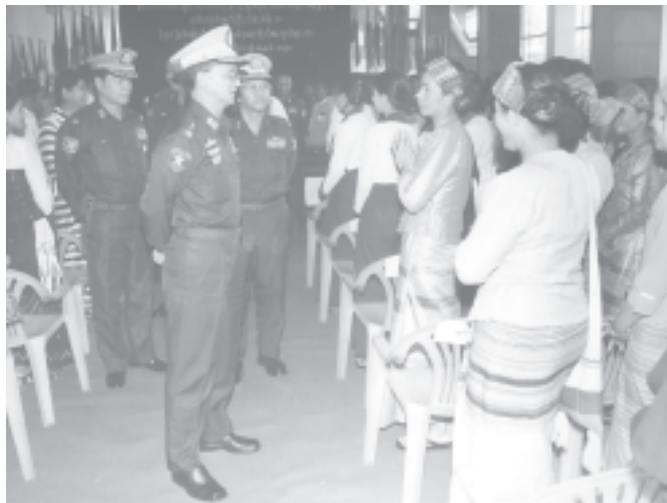
Secretary-1 Lt-Gen Thein Sein cordially converses with Union Day delegates.

the delegates from various parts of the Union are taking pride in the golden opportunity to take part in the Union Day celebration. They can also grab a unique opportunity to get together in amity, and expose and exchange respective traditions, culture and customs. Therefore, it can enhance mutual understanding and friendship alongside amicable relations and fraternal spirit among the national brethren. A careful analysis on the Myanmar history will reveal that the nation is home to more than 100 national races who have been living in unison and harmony and preserving the essence of a human society based on family spirit.