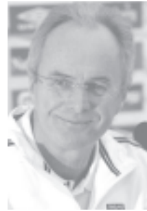
England's Head Coach Sven-Goran Eriksson

Eriksson said: "All the discussion about David Beckham not being the captain, not playing for the team and being finished with the England job, I never understood that."