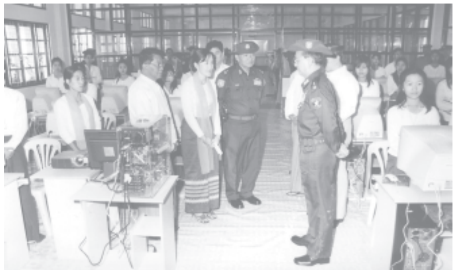
MEC Chairman Secretary-1 Lt-Gen Thein Sein inspects classrooms of Government Computer College (Kengtung).— MNA