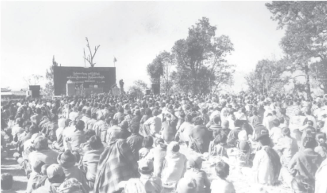
A mass of people seen at the ceremony to honour Union Day and support National Convention in Khwirein model village of Mindat Township.