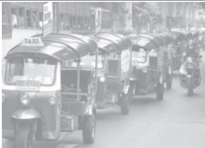
Thai policeman rides past a convoy of 'tuk-tuks', or motorised three-wheel rickshaws in Bangkok. —INTERNET

Each volunteer followed each regimen for a month, with a break in between each treatment cycle.—MNA/Xinhua