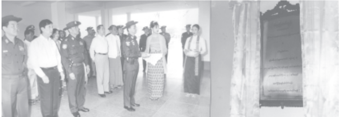
Secretary-1 Lt-Gen Thein Sein unveils the bronze plaque of the main building at Government Computer College (Kengtung).

For instance, Shan State (East) has been facilitated with an airport, new roads, a 200-bed