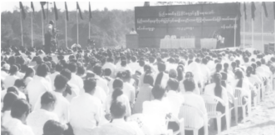
The ceremony to honour Union Day and support National Convention in progress in Sinkhan village of Bhamo Township.