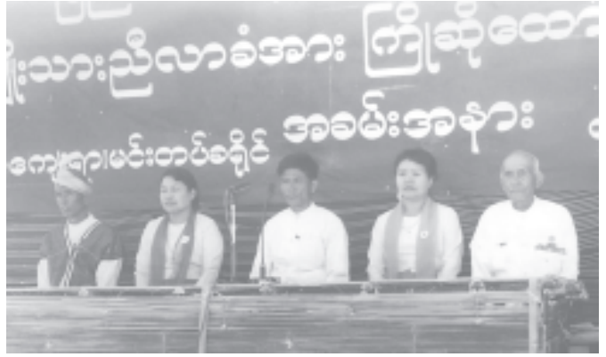
The panel of chairmen seen at the ceremony to honour Union Day and support National Convention in Khwirein model village of Mindat Township.