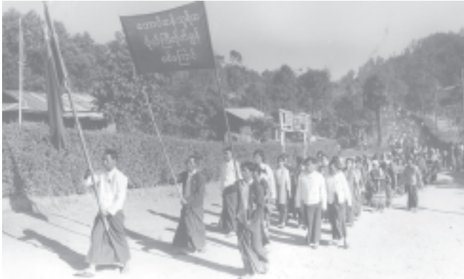
Local people marching to the rally held in the sports ground of Khwirein model village of Mindat Township.