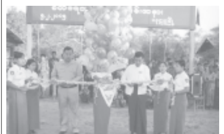
The opening ceremony of tube-well in progress in Paunglaungkan Village of Pakokku Township.— DAD