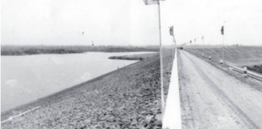
Bawbin dam built across Thayet Creek in Gyobingauk Township, Bago Division, irrigates 30,000 acres of farmland.