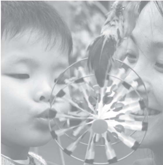
A young boy blows on a wind-powered toy with his mother at the Lunar New Year fair in a busy park in Hong Kong on 8 Feb, 2005.