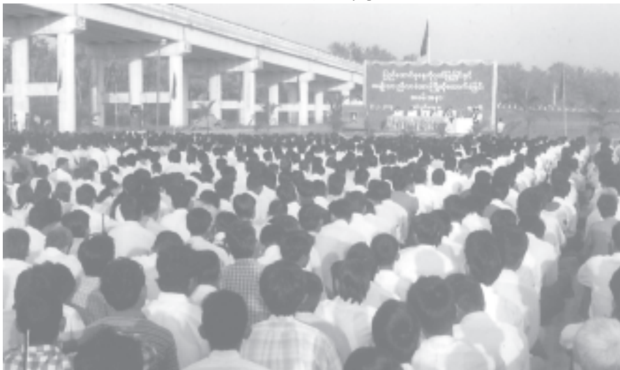
People attend the ceremony to honour Union Day and support National Convention in Htinkwin Village of Kyaiklat Township. — MNA

Afterwards, the reports of the representatives were seconded by a representative. Later, all those present approved their reports. The meeting ended with chanting of slogans.— MNA