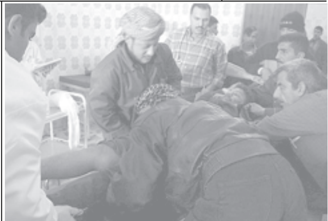
Men carry an injured policeman on a stretcher inside Baquba hospital after an attack in the Sunni town 60 kilometres northeast of Baghdad on 8 Feb, 2005.