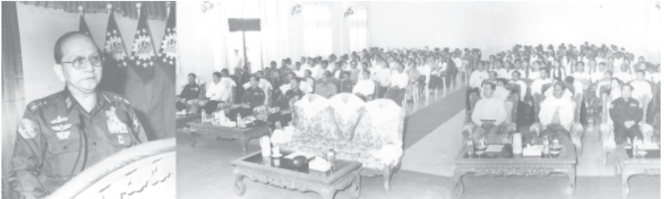
MEC Chairman Secretary-1 Lt-Gen Thein Sein delivers an address at the opening ceremony of the main building of Government Computer College (Kengtung).