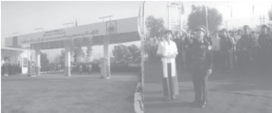
Commander Maj-Gen Myint Swe formally opens signboard of CNG Filling Station No 006.— ENERGY

YANGON, 9 Feb — The CNG filling station No 006 of Myanma Oil and Gas Enterprise under the Ministry of Energy was commissioned at the station on No 2 Highway in Dagon Myothit Township this morning.