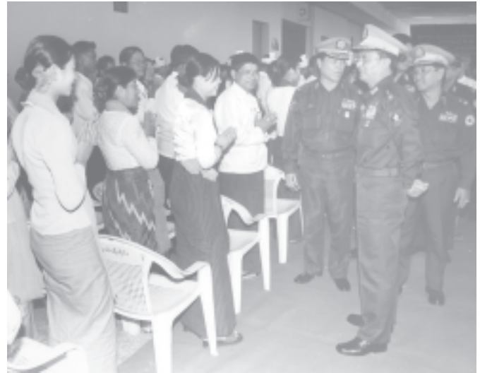
Secretary-1 Lt-Gen Thein Sein cordially meets with Union Day delegates.

The Secretary-1 continued to say that as the Union Day delegates have witnessed that adhering to Our Three Main National Causes, the government has been able to rebuild national solidarity, which is the very first programme for the national progress. As a result, the internal armed conflicts among the national brethren came to an end. And the national unity has brought