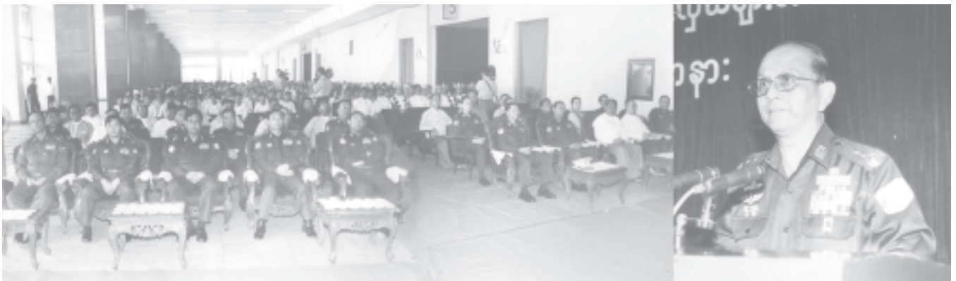
Secretary-1 Lt-Gen Thein Sein extends greetings to Union Day delegates.— MNA

YANGON, 9 Feb—Chairman of the Central Committee for Observance of the 58th Anniversary Union Day Secretary-1 of the State Peace and Development Council Lt-Gen Thein Sein held a meeting with Union Day