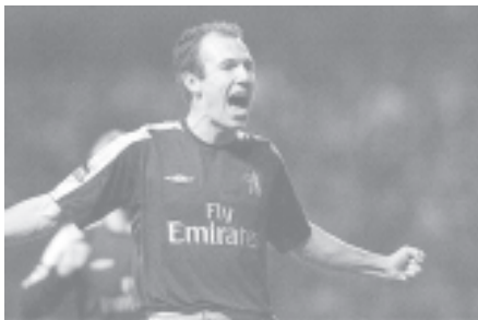
Chelsea's Arjen Robben celebrates after scoring against Blackburn.

"Six weeks is the average time to heal this injury and then I need a few more weeks to be completely fit again," Robben, who scored the only goal at Ewood Park, told Dutch newspaper Algemeen Dagblad.