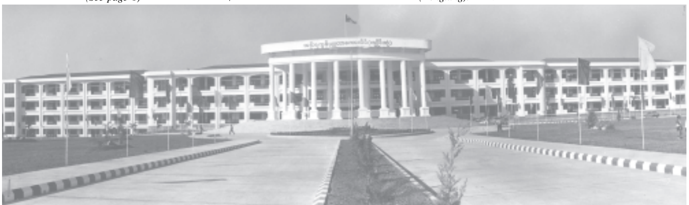
Newly-opened main building of Government Computer College (Kengtung).

Emergence of the State Constitution is the duty of all citizens of Myanmar Naing-Ngan.