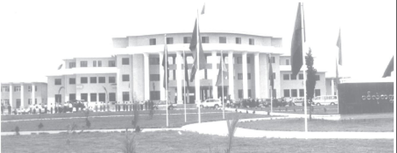
Magnificent Panglong University in Panglong, Loilem District, Shan State (South).