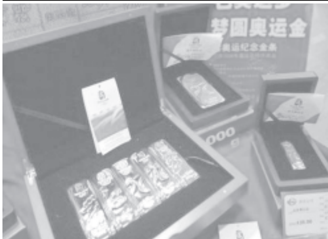
Gold bars specially issued for the 2008 Beijing Olympics are displayed in a shopping centre in Beijing on 4 Feb, 2005. The gold bars, different in colour and theme, represent the five-ring Olympic logo. Each set of gold bars includes four 99.99 per cent pure gold bars weighing 50g, 100g, 500g and 1kg respectively.