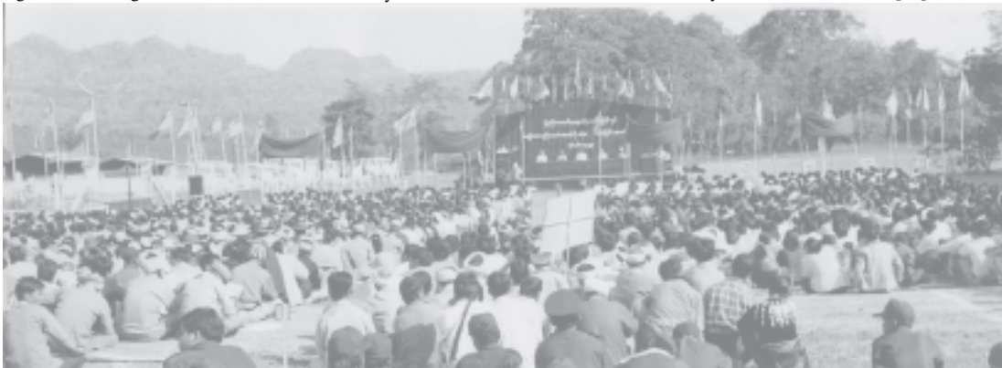
A ceremony to hail the Union Day and support the National Convention in progress in Lashio District.