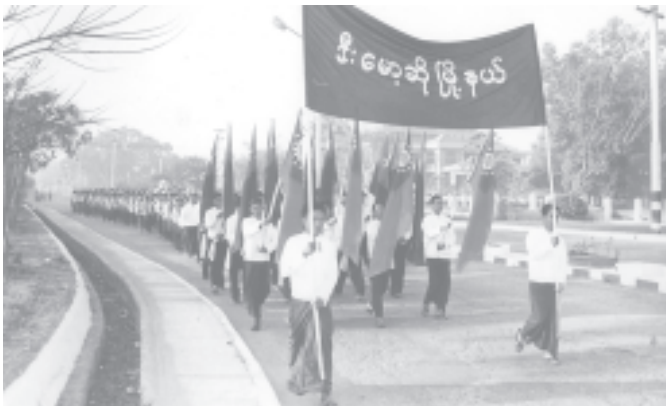
Members of USDA, and social organizations and local people marching to Kandahaywun Park.

He spoke at length on instability, lagging behind development due to the misunderstanding among