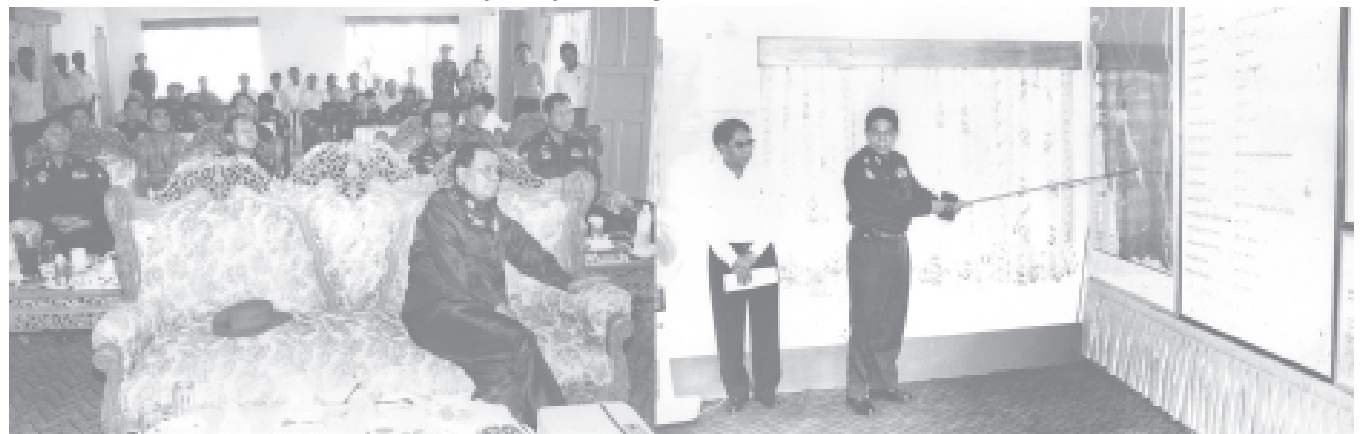
Senior General Than Shwe hears reports on implementation of Kataik Dam Project presented by Minister for Agriculture and Irrigation Maj-Gen Htay Oo.