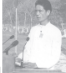
Shardaw township USDA Joint-Secretary U Ye Win.

to hail the 58th Anniversary Union Day, to safeguard the perpetuation of the Union, to take part in the respective roles for successful implementation of the seven-point Road Map, to support the National Convention and he also urged USDA members to participate in national and rural development tasks.