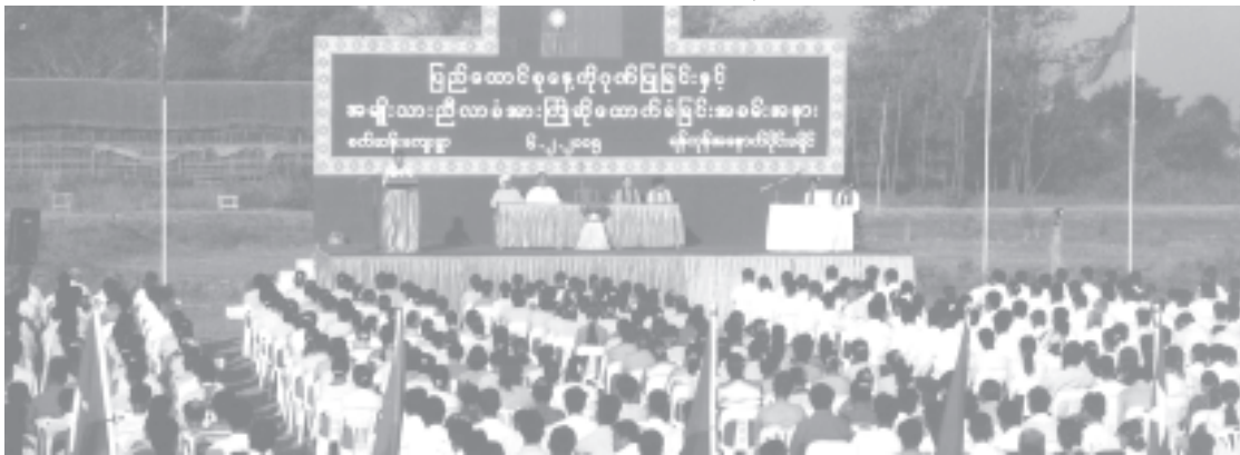
Ceremony to hail the Union Day and support the National Convention in progress in Yangon West District