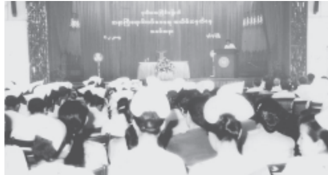
The second Leprosy Elimination Day in progress at Institute of Nursing (Yangon).— MNA

After the ceremony, the deputy minister and party viewed around educational booths of leprosy elimination. — MNA