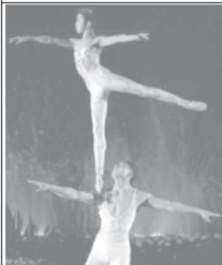
Chinese acrobats from Dalian, China perform their acrobatic ballet during the celebration of the Mines Lantern Festival 2005 near Kuala Lumpur on 4 Feb, 2005. This event is part of Chinese New Year celebrations.