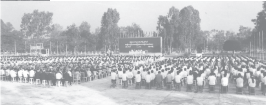
Ceremony to honour Union Day and support National Convention in progress in Loikaw.