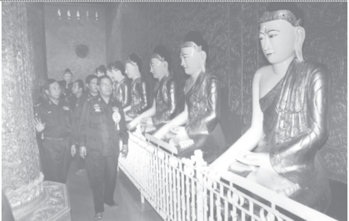
Senior General Than Shwe views all-round renovation of Buddha images at Kyaikmaraw Pagoda.