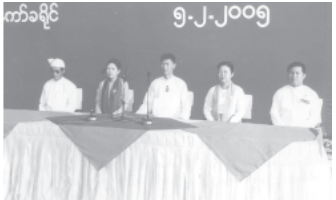
The panel of chairmen presiding over the ceremony to honour the Union Day and support the National Convention.