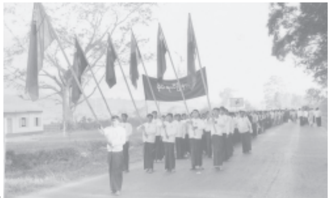
USDA members and local people marching to Mongli village BEMS — MNA

As is known to all, efforts are being made to ensure equitable development in all regions by implementing the border area development project, the 24-zone development project, and the five-point rural development project. Later, he called upon those present on the occasion to hail the Un-