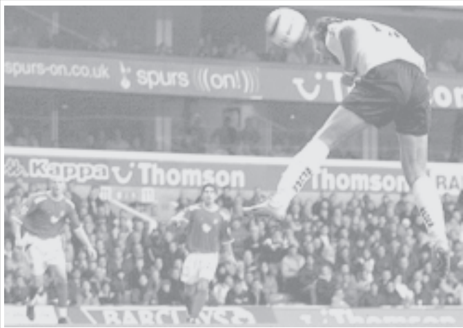
Spurs's Mido heads the ball to score in his first match for the Spurs during their Premiership football match against Portsmouth at Tottenham Hotspur's grounds in London.