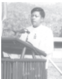
Lashio township USDA Executive U Zin Han Tang Gyi.—MNA

Before concluding the ceremony, all the participants approved to honour the Union Day and support the National Convention and regional development tasks.—MNA