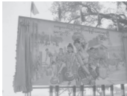
The signboard to mark supply of potable water for rural people in Pwintbyu Township, Magway Division.— DAD

၂၀၀၅ ခုနှစ် (၅၈)နှစ်မြောက်ပြည်ထောင်စုနေ့ပြပွဲ နေ့ရက်- ၈-၂-၂၀၀၅ မှ ၁၆-၂-၂၀၀၅ အချိန်- နံနက် ၀၉:၀၀ နာရီ မှ ညနေ ၁၇:၀၀ နာရီ နေရာ- တပ်မတော်ခန်းမ၊ ဦးဝိစာရလမ်း၊ ရန်ကင်းမြို့၊ (မည်သူမဆို အခမဲ့လာရောက် ကြည့်ရှုနိုင်ပါသည်။)