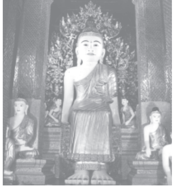
Senior General Than Shwe and party pay homage to the Kyaikmayaw Pagoda. — MNA