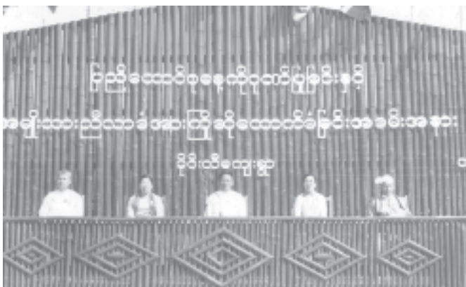
Those presiding over the ceremony to hail the Union Day and support the National Convention.—MNA

The organizer presented his report covering development of road transport, water supply, education, health and agriculture sectors in Lashio District. Furthermore, he said that Mongli Village, his native place, has been upgraded to the model village and that local people of 200 households enjoy facilities of