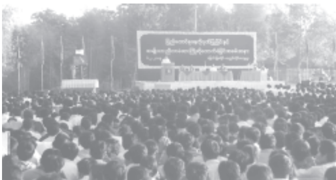
Ceremony to hail the Union Day and support the National Convention in progress in Myaungmya District. —MNA