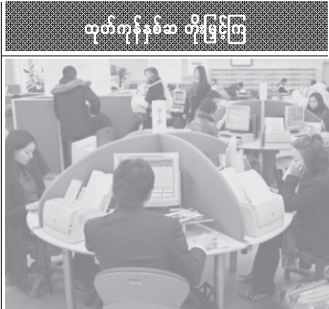
This 28 January 2005 file picture shows Japanese youth search for jobs at Young Hellowork at Shibuya, known as the "Town of youth" in Tokyo.