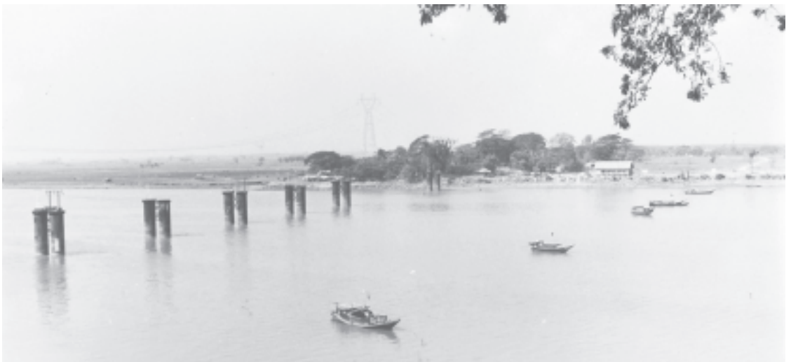
Senior General Than Shwe views the site for construction of Sittoung Bridge (Mopalín) near Sittoung Model Village in Kyaikto Township.

At 10 am, the Senior General and party arrived at the briefing hall