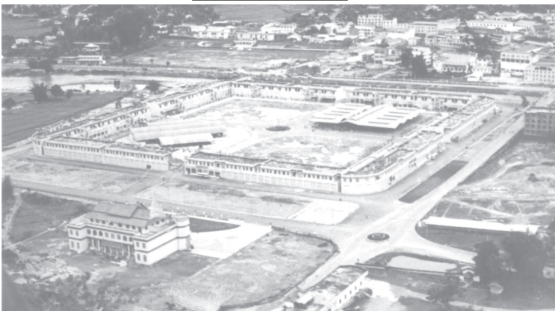
The left photo stands witness to the fact that Mongla in the border region in Shan State (East) has developed significantly.