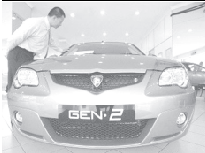
A man looks at the price tag for a Proton Gen2 car in a showroom in Kuala Lumpur on 6 Feb, 2005.