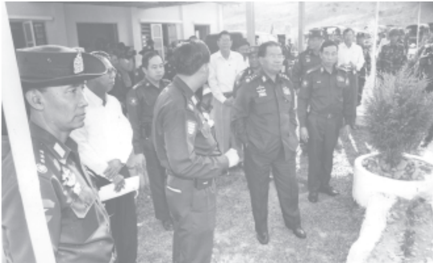
Senior General Than Shwe inspects construction of Kataik Dam in Kataik Village of Paung Township.

and Minister for Energy Brig-Gen Lun Thi, on supply of fuel for the