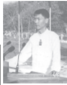
Loikaw District USDA Secretary U Myint Thein.

Tarred and gravel roads and bridges were constructed and the existing ones repaired in the district for the betterment of transport sector. U