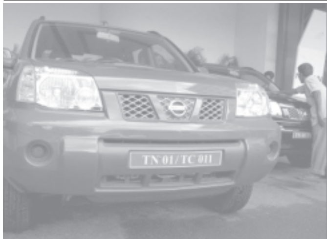
Japan's second biggest automaker Nissan on 4 Feb, 2005 said it will return to the market in Pakistan after five years, saying the country had a fast-expanding appetite for cars.