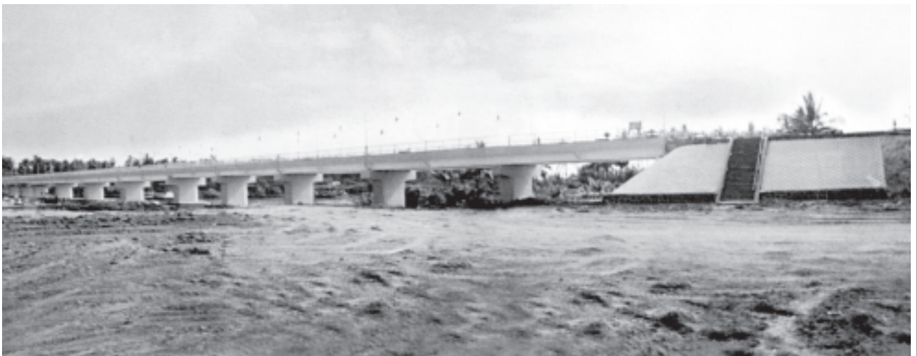
Ye Bridge with the length of 857 feet was built by Myanma Railways in Ye Township is rail-cum-road facility.