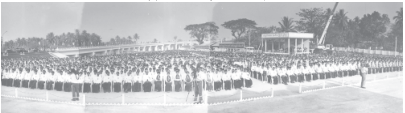
Guests and local residents at the opening of Thanlwin Bridge (Mawlamyine) spanning Thanlwin River. The bridge is the longest and the largest facility of its kind in Myanmar.