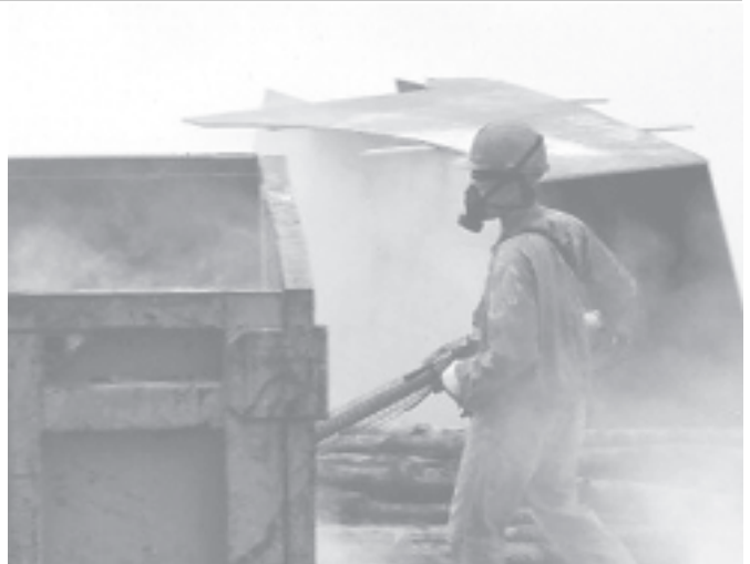
A Singapore health official fumigates a construction site against mosquitoes recently.

It will take Nepali 20 hours to reach Lhasa by land, as the narrow Arniko Highway makes the road travel time-consuming. Therefore, a team of Chinese experts will travel along the highway to assess the road condition in the coming weeks, said Satyal. — MNA/Xinhua