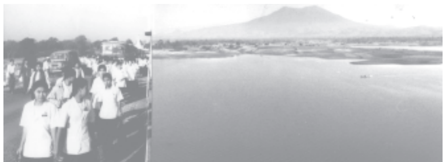
The trainees on their excursion at the Kyetmauktaung Dam.