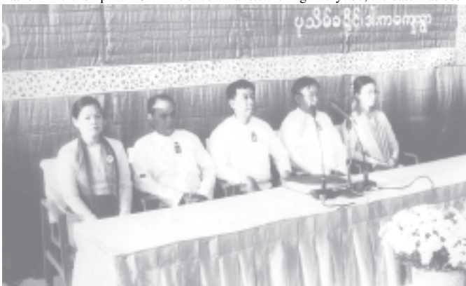
The meeting panel of chairmen seen at the ceremony to support National Convention near Dahka Bridge in Dahka Village of Kangyidaunt Township.—MNA