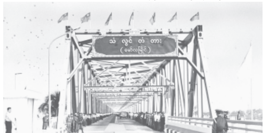
Thanlwin Bridge (Mawlamyine).

It is important to build strength of solidarity, community peace and tranquillity and prevalence of law