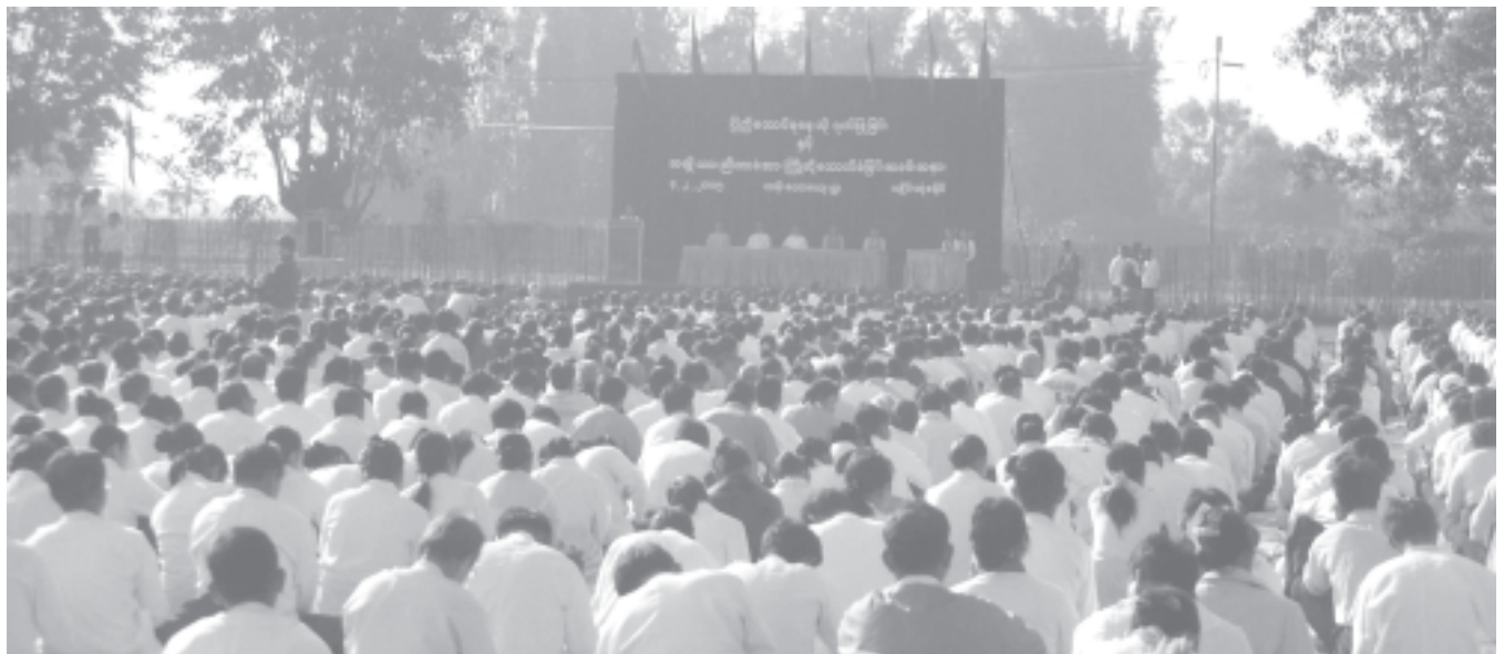
USDA members and locals attending the ceremony to honour Union Day and support National Convention in Yanlaw model village of Kengtung Township.