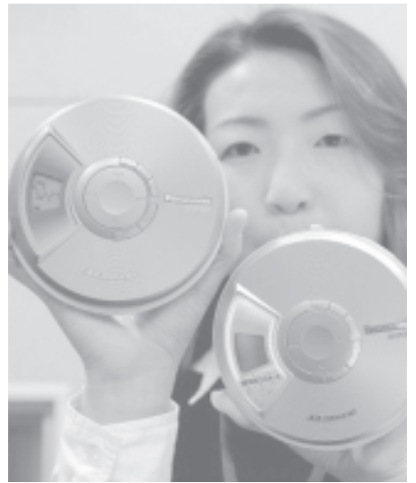
A Matsushita Electric Industrial employee displays the new portable CD player 'SL-CT352' at the company's showroom in Tokyo recently.