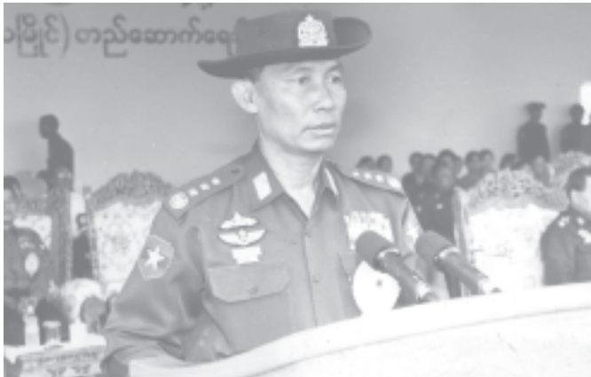
General Thura Shwe Mann addresses opening ceremony of Thanlwin Bridge (Mawlamyine) as a gesture of hailing 58th Anniversary Union Day.