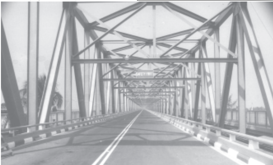
Thanwin Bridge (Mawlamyine). — MNA