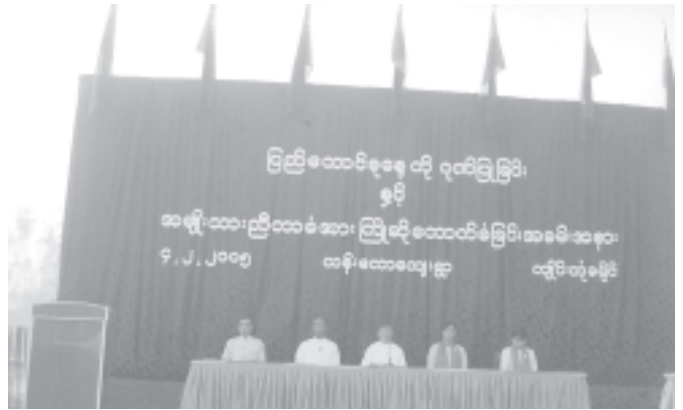
The meeting chairmen seen at the rally to honour Union Day and support National Convention in Kengtung Township.

Kengtung District USDA Daw Nan Hla Yin table the motion calling for hailing the National Convention.