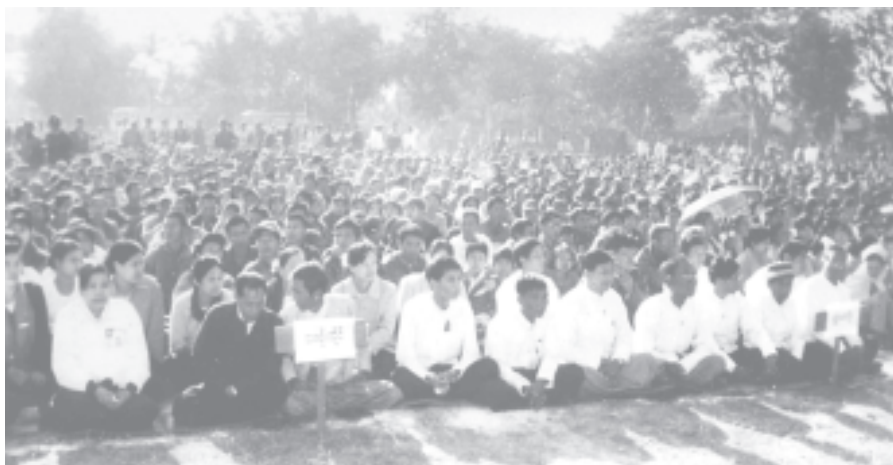
A mass of people attend the rally to honour Union Day and support National Convention in Kalay Township.— MNA

Before concluding the ceremony, all the participants approved to honour the Union Day and support the National Convention and rural development tasks.— MNA