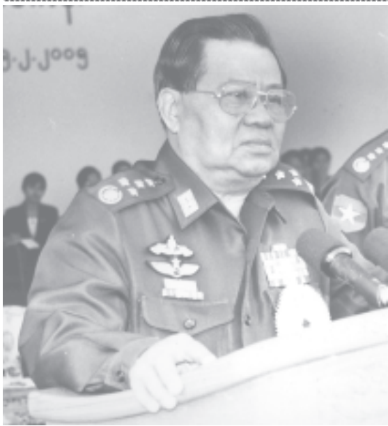
Senior General Than Shwe delivers an address to the opening ceremony of Thanlwin River spanning Thanlwin Bridge (Mawlamyine)

YANGON, 5 Feb — As a gesture of hailing the 58th Anniversary Union Day, Thanlwin Bridge (Mawlamyine), the longest and the largest in Myanmar, was successfully commissioned into service on a grand scale this morning. The ceremony to inaugurate Thanlwin Bridge (Mawlamyine) linking Mawlamyine, city of Mon State, and Mottama, was held at the pandal near the bridge on Mawlamyine bank at 8 am today, with greetings extended by Chairman of the State Peace and Development Council Commander-in-Chief of Defence Services Senior