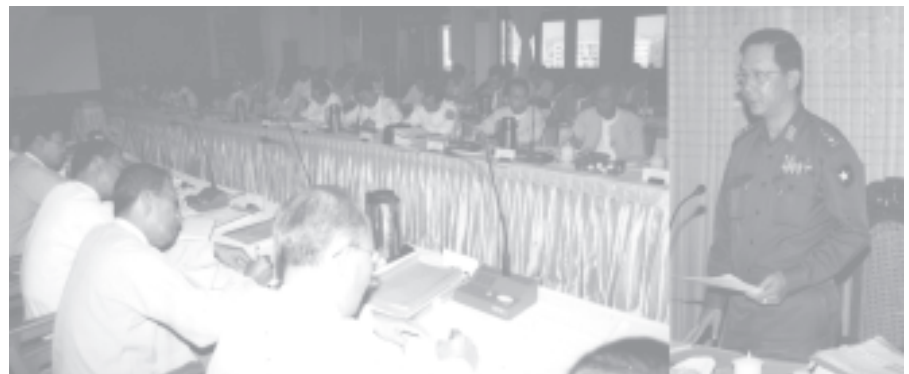
Minister Col Zaw Min speaks at the coordination meeting. — COOPERATIVES