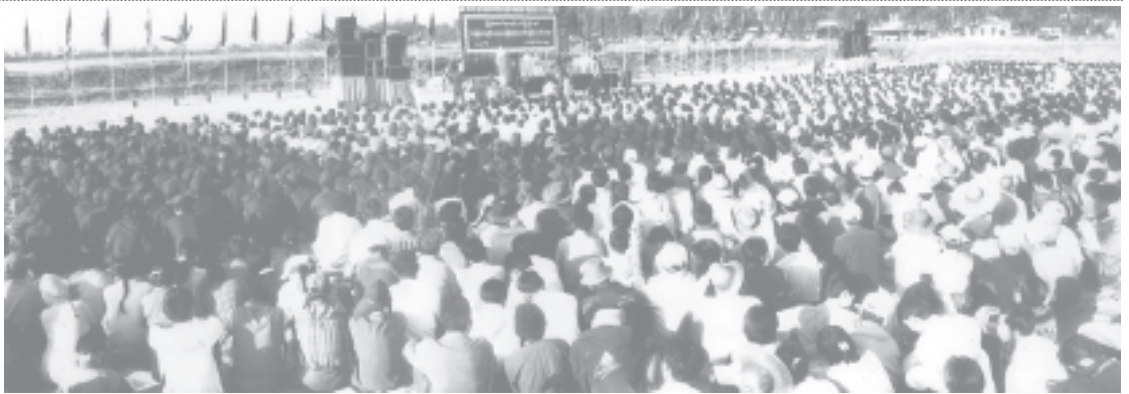
The ceremony to honour Union Day and support National Convention in progress near Dahka Bridge in Dahka Village of Kangyidaunt Township.