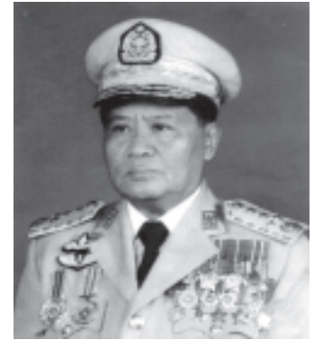
Senior General Than Shwe Chairman of the State Peace and Development Council Commander-in-Chief of Defence Services (From the message sent to the 53rd Anniversary Union Day)

Throughout history, the Union people were able to set up the fine historical traditions of living together with Union Spirit on the same land and drinking water from the same source, with eggs and nest intact, and warding off in unity all the dangers befalling the nation. These fine traditions have firmly existed as a symbol of unity of national races of the entire Union of Myanmar for many years.