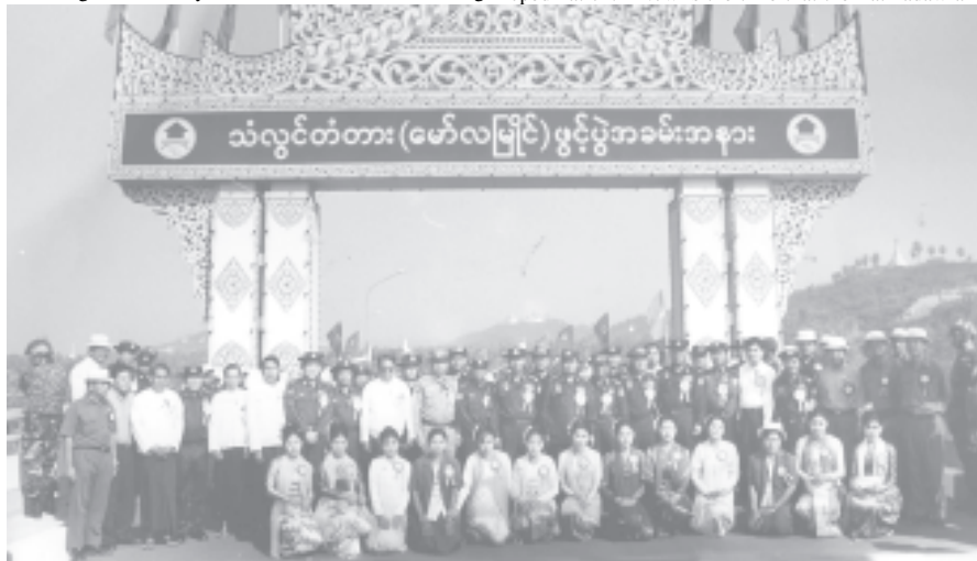
Senior General Than Shwe and party pose for the documentary photo together with local people at Thanlwin Bridge (Mawlamyine).

the Thanlwin River. Z-craft and ferries were the only transport means. It took long to reach the other bank. Down on luck, travellers had to spend the night there. It was also risky to cross the river in the rainy season. Now, these obstacles are a thing of the past.