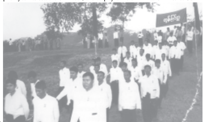
USDA members and local people marching to the rally in Dahka Village of Kangyidaunt Township.