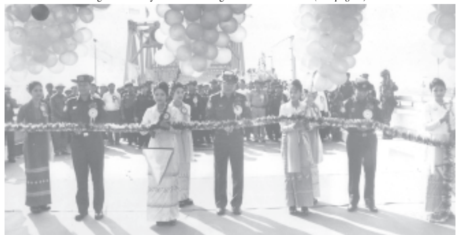
Commander Maj-Gen Thura Myint Aung, Minister for Construction Maj-Gen Saw Tun and Minister for Rail Transportation Maj-Gen Aung Min formally open Thanlwin Bridge (Mawlamyine).

In line with the guidance of the Head of State, arrangements are made to enable armed groups to return to the legal fold and to participate in the nation-building tasks. As a result, a total of 17 armed groups have returned to the legal fold. They are now lending