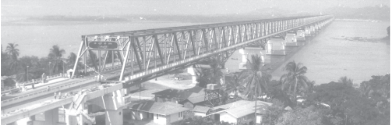
The 11,575-foot Rail-cum-road Thanlwin Bridge (Mawlamyine), the longest and the largest in Myanmar, lies on Thanlwin River after its opening ceremony.

It is important to build strength of solidarity, community peace and tranquillity and prevalence of law and order whatever difficulties the country encounters. Difficulties can be overcome through these two strengths.