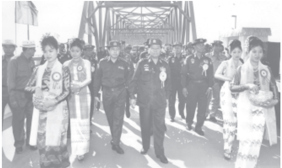
Senior General Than Shwe and party crossing over the Thanlwin Bridge (Mawlamyine).— MNA

Before this bridge has come into existence, people travelling to Mawlamyine found it difficult in crossing