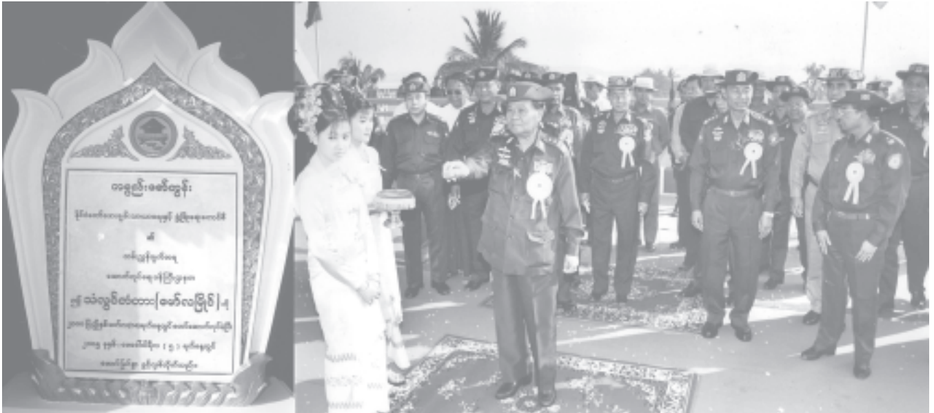
Senior General Than Shwe pressing the button to unveil the stone inscriptions of Thanlwin Bridge (Mawlamyine).