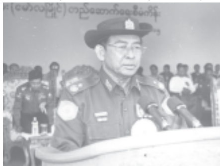
Minister Maj-Gen Saw Tun.

The bridge is located on Yangon-Mawlamyine-