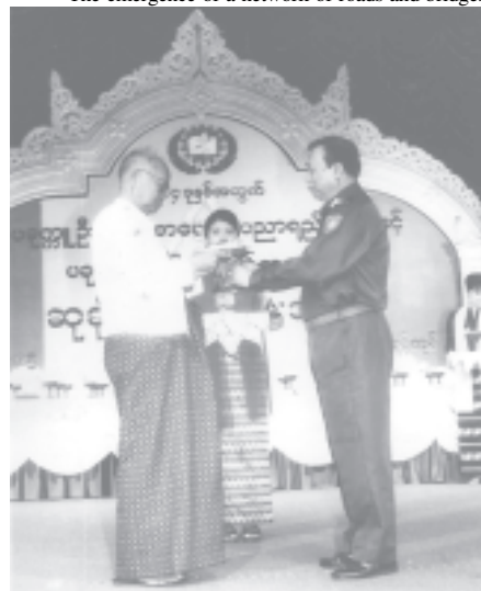
Minister for Culture Maj-Gen Kyi Aung Pakokku U Ohn Pe Life-long Literary Award to U Kyi Aye (writer Hsinbyukyun Aung Thein).—MNA

After the ceremony, ministers, deputy ministers, Pakokku U Ohn Pe had a documentary photo taken together with prize winners. —MNA