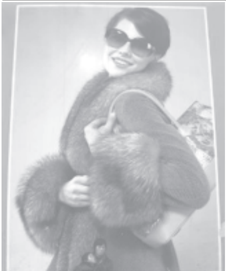
A Chinese mother and child stand in front of a fashion billboard in Shanghai, on 21 Jan, 2005. Living standards for China's 1.3 billion people have risen sharply after more than two decades of economic reforms that boosted private business and capitalist-style investment.