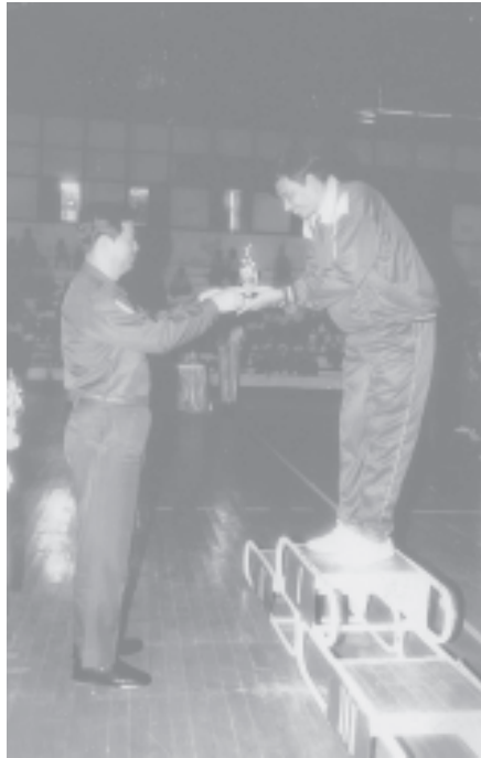
Minister for Finance and Revenue Maj-Gen Hla Tun presents prize to winner in the Inter-Department Volleyball Tournament of Ministry of Finance and Revenue.

Later, Minister Maj-Gen Hla Tun and wife awarded first prizes to the women's MEB team and the men's Customs Department team.