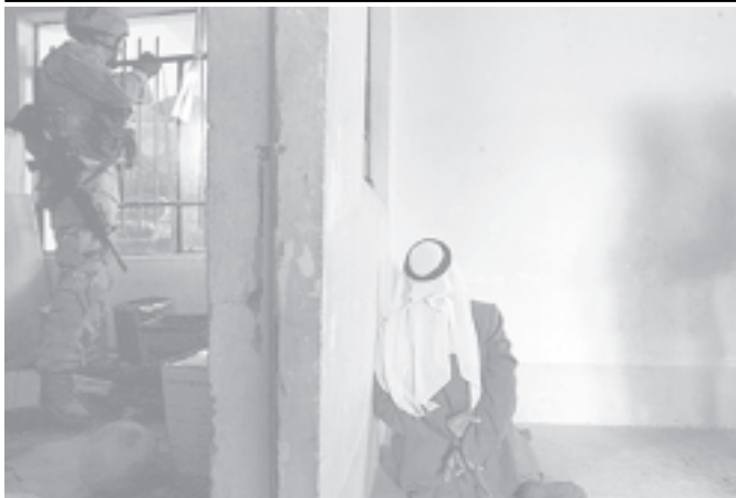
An Iraqi man (R), detained and later released, kneels on the floor while US soldiers inspect his house during a search for illegal weapons in the guerilla stronghold in Mosul on 20 Jan, 2005.