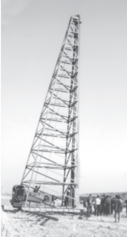
Pile driving for construction of the ponds seen at Yangon City Water Supply Project (Ngamoeyek).

On 17 April 1992, Special Projects Implemen-