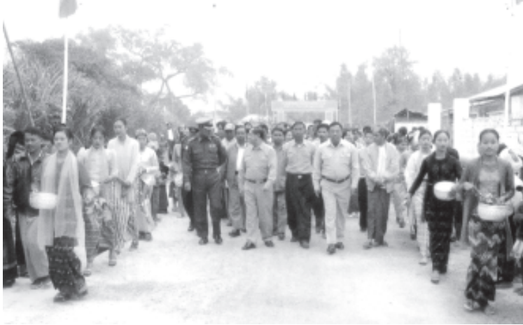
Officials and local authorities inspect Weinlaung tarred road in Ward 6 of Tangyan Township after opening it. (H)

The new tarr road measuring 1,720 feet long and 12 feet wide was built at a cost of K2,197,000 by the Township Development Affairs Committee and K 2 million by the local people.— KYEMON