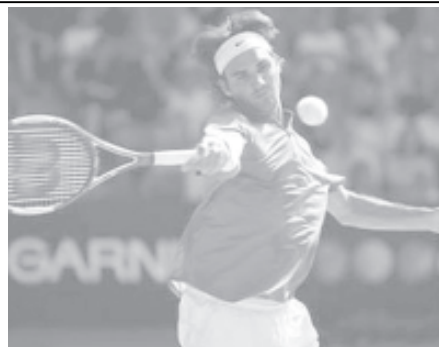
Roger Federer in action against Finland's Jarkko Nieminen during their third-round match at the Australian Open tennis tournament in Melbourne, on 21 Jan, 2005.