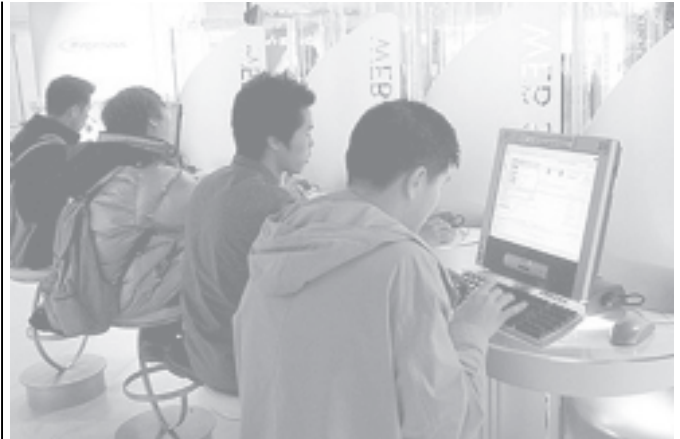
An Internet cafe is crowded with visitors in Seoul. South Korea licensed three telecom firms to launch new wireless Internet services which provide mobile broadband Internet dubbed WiBro. —INTERNET

China was Singapore's second largest visitor-generating market with a record number of 880,000 visitor arrivals last year, only after Indonesia's 1,765,000. —MNA/Xinhua