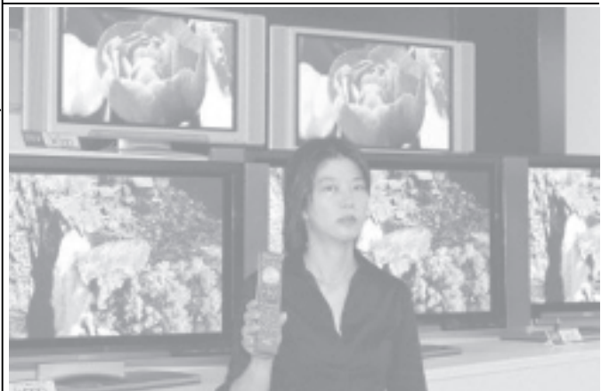
A Hitachi employee shows the flat panel television line up of the plasma display panel and LCD in Tokyo on 20 Jan, 2005. Japan's Fujitsu is considering drastically downsizing its involvement in, or even withdrawing from, the plasma-display panel business, a report said.