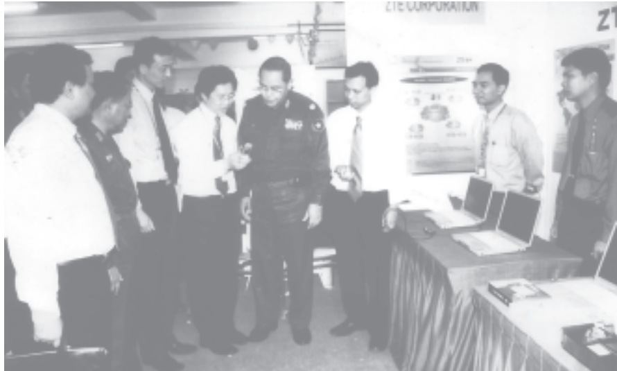
Minister for Communications, Posts and Telegraphs Brig-Gen Thein Zaw and Minister for Livestock and Fisheries Brig-Gen Maung Maung Thein inspect preparations for holding MICT Week-2005.