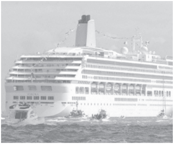
The P and O cruise liner Aurora in the Solent off Southampton. P and O said it was cancelling a much-delayed luxury cruise by the Aurora, after repair work on the ship's propulsion system turned out to be insufficient.