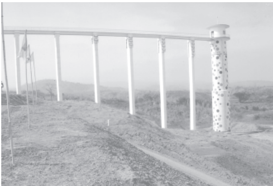
Progress in construction of water control tower at Ma Mya Dam in Myanaung Township on 16-1-2005.