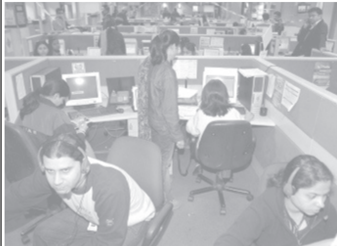
Wipro employees, the Indian software company's third-quarter net profit jumped 56 percent driven by robust outsourcing orders from global clients.—INTERNET

Indrawati said the CGI is expected to make decision on Indonesian proposal Thursday.— MNA/Xinhua