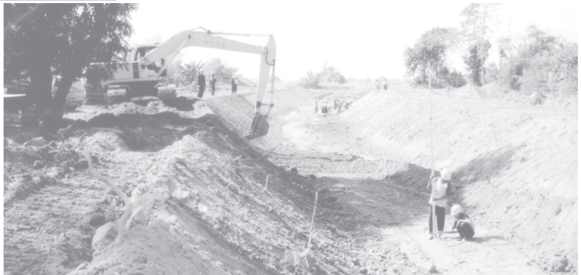
The open channel is being dredged linking Ngamoeyek main canal to Ahtayu Pump Station.

lings, take fire prevention measure and organize local people to participate in safeguarding and preserving the forest plantations.— MNA