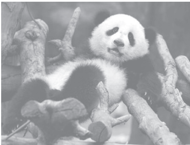
A giant panda cub seen at a panda park in the outskirts of Chengdu, capital of China's southwestern Sichuan Province on 20 Jan 2005.