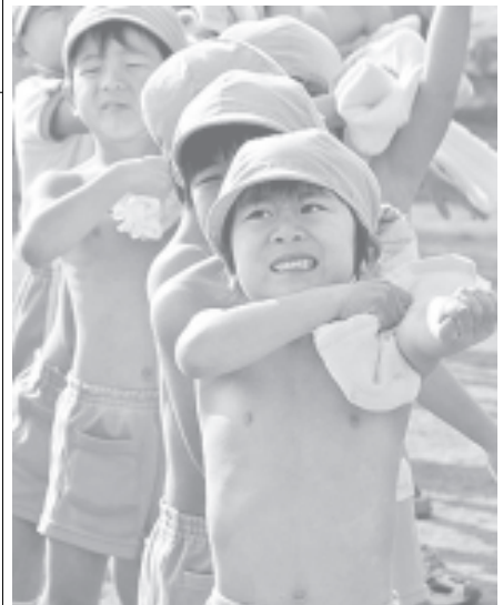
Kindergarten children rub down with their dry towels after a workout in a playground at a Tokyo kindergarten recently on the day of Daikan, which is believed to be Japan's coldest day of the year.