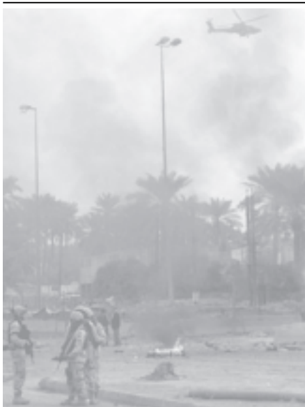
US soldiers secure the site after an explosion in Baghdad, on 19 Jan, 2005. A car bomb exploded near the Australian Embassy in central Baghdad on Wednesday, killing two people and wounding four, police and witnesses said.

The US military said on Thursday that a Brazilian was missing following the attack in Beiji, but could not confirm reports the Brazilian was kidnapped. The Army of Ansar al Sunna said it would issue details about its attack soon.—Internet