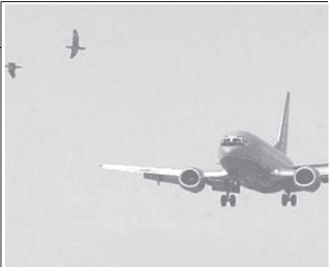
Birds fly near a Southwest Airlines jet about to land in Dallas, on 19 Jan, 2005.