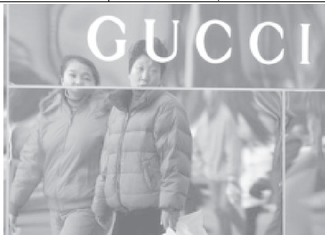
Chinese shoppers look at a Gucci store in Shanghai on 21 Jan, 2005.

Both parties discussed agreements on personnel training, modernization of the Cuban fleet, hydrometeorological research and environmental monitoring. They also called for a continuation in extending the range of exchange in training crews and scientific cooperation. — MNA/Xinhua