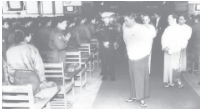
Minister U Than Aung cordially meets teachers.