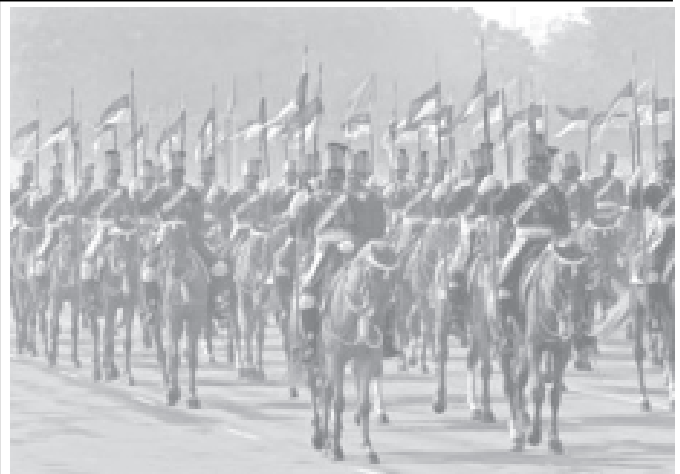
Indian soldiers ride horses during an Army Day parade in New Delhi, on 15 Jan, 2005. India celebrated on Saturday the 57th anniversary of the formation of its national army with soldiers from various regiments and artillery on display.