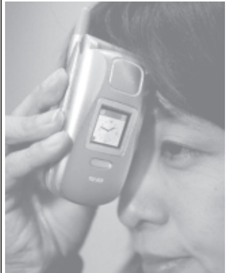
A Sanyo employee demonstrates Tu-Ka TS41 mobile phone, produced by Sanyo, which can transmit sounds with vibrations via the skull on 15 Jan, 2005.