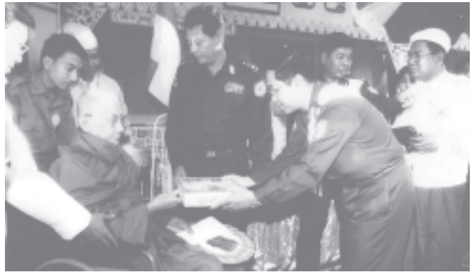
Commander Maj-Gen Myint Swe offers alms to a Sayadaw.—MNA

Minister Brig-Gen Thura Aye Myint enjoyed the sports meets in commemoration of the new year festival from morning to evening.—MNA