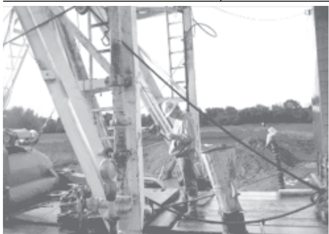
A land based oil well. Two Japanese companies have sought government permission to drill for oil and natural gas in the East China Sea where Chinese companies are already at work, a press report says.

During the meeting, participants urged the government and authorities concerned to offer more vocational education and skill training for working-age women to enable them to take advantage of new opportunities opening up with larger factories when skilled positions become available. — MNA/Xinhua