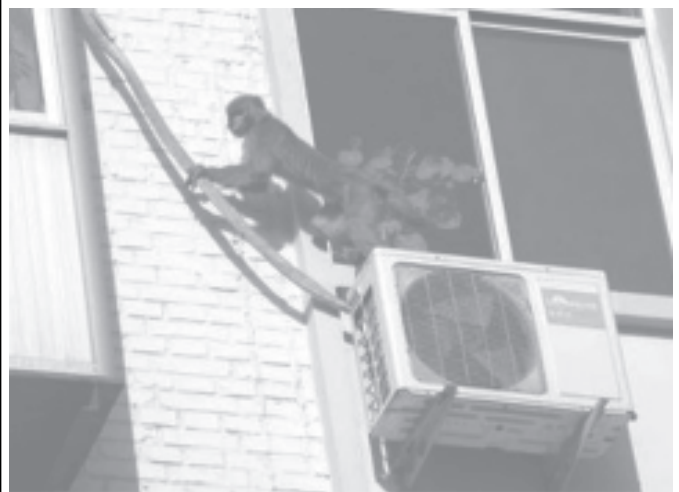
A monkey stands on an air conditioner hung on a five-floor residential building in Shijiazhuang, North China's Hebei Province, on 14 Jan, 2005.