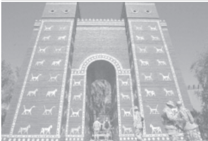
US soldiers enter the ancient city of Babylon. A damning report by the British Museum revealed that US-led forces in Iraq have caused irreparable damage to the site of the ancient city of Babylon, contaminating the soil and destroying archaeological evidence.—INTERNET