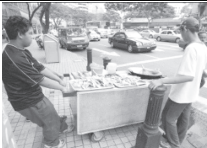
Fish for sale in Kuala Lumpur on 15 Jan, 2005.