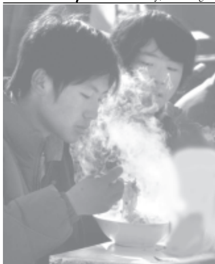
Chinese farmers have their lunch at an open market at Guan in China's Hebei Province, on 15 Jan 2005.—INTERNET

Bangladesh, as a net importer of oil, may be affected adversely due to high oil price in the international market, the report said.—MNA/Xinhua