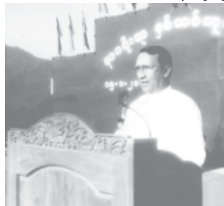
Minister for Sports Brig-Gen Thura Aye Myint speaking at Naga New Year Festival.