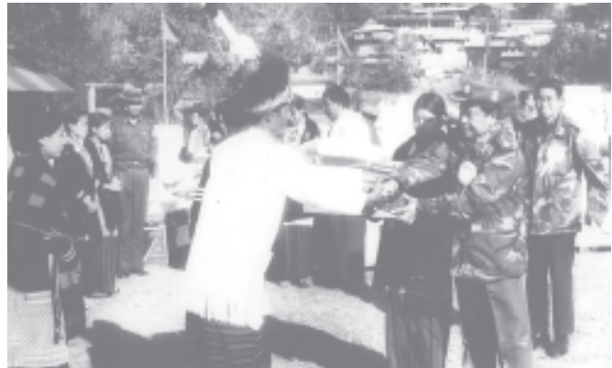
Lt-Gen Ye Myint presents gifts of the Prime Minister to a head of Naga national tribe.— MNA

Deputy Minister for Religious Affairs Brig-Gen Thura Aung Ko handed over K 1.5 million for carrying out missionary tasks in Hkamti District, robes, slippers and construction materials donated by Sagaing