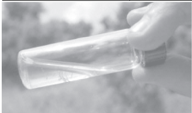
A phial containing mosquito larvae, responsible for spreading dengue fever recently. Malaysia warned of a possible dengue epidemic in the capital Kuala Lumpur and three other states in coming months after the number of infections in the country more than doubled.—INTERNET

The Portuguese police, who are under Italian command in the southern Iraqi city of Nasiriyah, were first deployed in November 2003. President Jorge Sampaio had refused to send troops without United Nations approval.—Internet