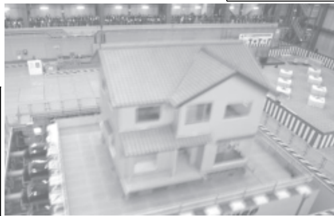
A group of invitees watch a two-storey model house being shaken by a huge amount of jolt created by a three-dimensional full-scale earthquake testing facility at Hyogo Quake-Resistance Research Centre, near Kobe, in western Japan, during its completion ceremony, on 15 Jan, 2005.