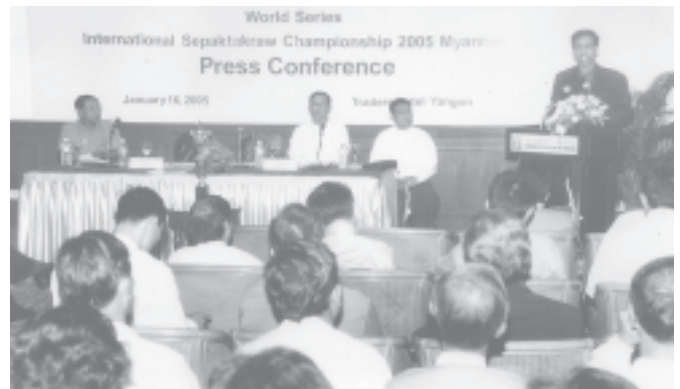
The press conference on World Series International Sepak Takraw C'ship 2005 in progress.