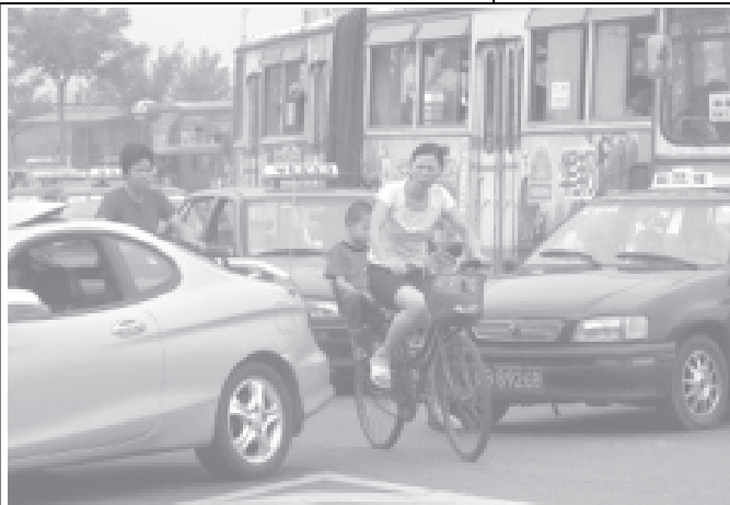
Beijing vehicles on 14 Jan, 2005. China's auto market is meant to be the great hope for the world's top manufacturers but with sales growth slowing dramatically in 2004 they may instead have to get used to the idea of unwanted competition in their home markets from Chinese exports.