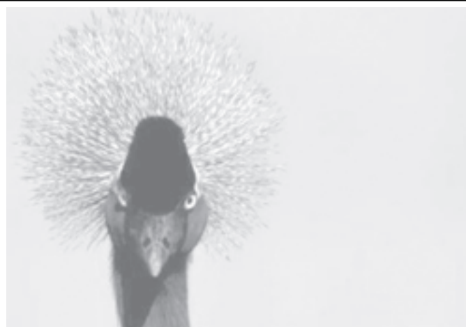
An African Black-Crowned Crane forages for food at the Santillana del Mars Zoo, northern Spain, on 13 Jan, 2005.