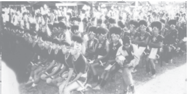
Commander Maj-Gen Tha Aye addresses Naga New Year Festival 2005 in Lahe Township.

Emergence of the State Constitution is the duty of all citizens of Myanmar Naing-Ngan.