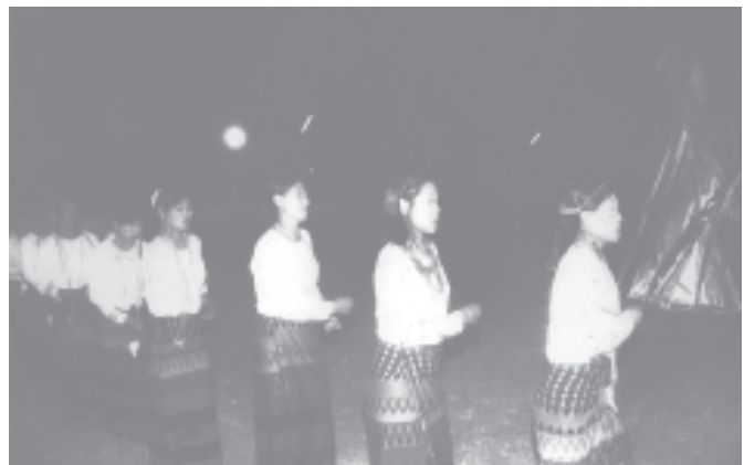
The bonfire of Naga New Year Festival in progress in Lahe.

full participation of the people. Relentless efforts are being made to ensure the balanced progress of the whole nation by laying down the 24 special development region project and the five rural development tasks. The State is also undertaking these projects by laying down 'our three main national causes, the four points of people desire and the 12 objectives'. That is why our country,