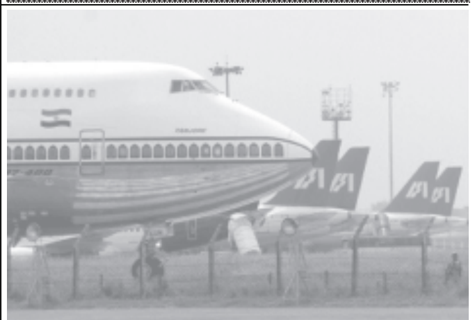
India Airlines planes at Delhi's Indira Gandhi International Airport on 15 Jan, 2005.