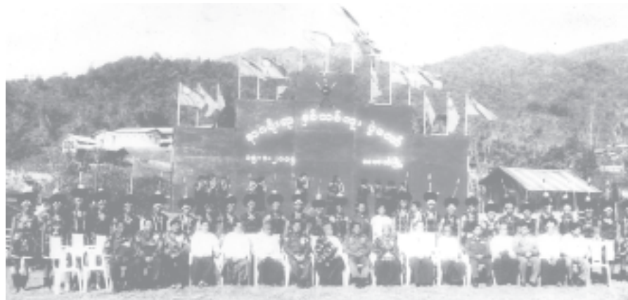
Lt-Gen Ye Myint and party pose for documentary photo with heads of Naga tribe at Naga New Year Festival.

Later, the commander called for active participation of Naga national race in the successful implementation of the seven-point Road Map for the establishment of a peaceful, modern, de-