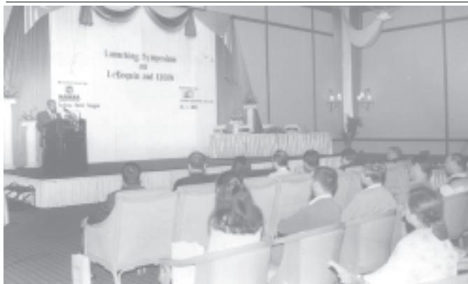
The launching symposium on LeVoquin and LUCON medicines of Navana Pharmaceuticals Ltd (Bangladesh) in progress. — NLM.

ports, the minister oversaw the poultry farm. Next, he proceeded to Pynmabin Broiler Farm and inspected it. — MNA