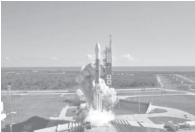
The 'Deep Impact' spacecraft is launched by a Delta II launch vehicle at 1:47:08 pm EST from Space Launch Complex 17B, Cape Canaveral Air Force Station, Florida, on 12 Jan, 2005. —INTERNET

Scientists stressed the strike will not break the comet, nor distract Tempel 1 from its original orbit around the sun into a course to collide with the Earth.—MNA/Xinhua