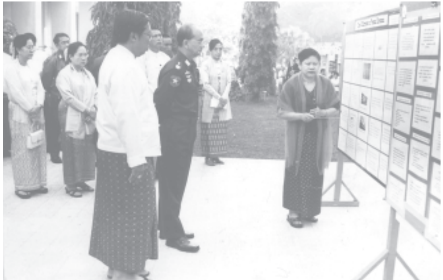
Chairman of NHC Secretary-1 Lt-Gen Thein Sein views health research posters at the opening ceremony of Myanmar Health Research Conference.

As the future of the nation is on the shoulders of today's youths, measures are well under way after designating the health care concerns of the youths as an important sector. The Secretary-1 said he has learnt that to take disease prevention measures after designating the youths as target group is the most beneficial and most effective strategy for developing countries. Nowadays, the Ministry of Health and social