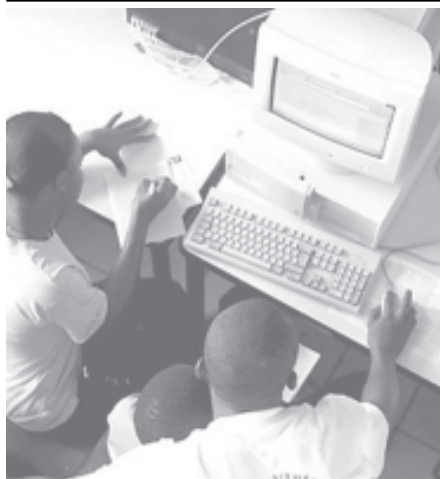
Students use the Internet in Africa. Kenya's telecommunication regulators approved licences for three new companies to provide commercial satellite Internet services in a bid to improve broadband access and boost development.—INTERNET