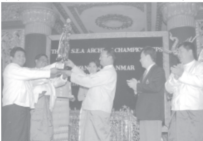
Minister for Sports Brig-Gen Thura Aye Myint presents championship trophy to Myanmar archery team.