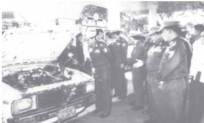
Minister for Energy Brig-Gen Lun Thi, ministers and guests inspect filling of CNG to a car at CNG Filling Station No 003 (Ahlon).

YANGON, 14 Jan — The opening ceremony of the CNG Filling Station No 003 (Ahlon) of the Myanma Oil and Gas Enterprise under the Ministry of Energy was held at the station on Strand Road in Ahlon Township yesterday morning.