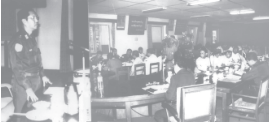
Commander Maj-Gen Myint Swe speaking at the coordination meeting for ensuring smooth and secure transport in Yangon City. (News on page 8)