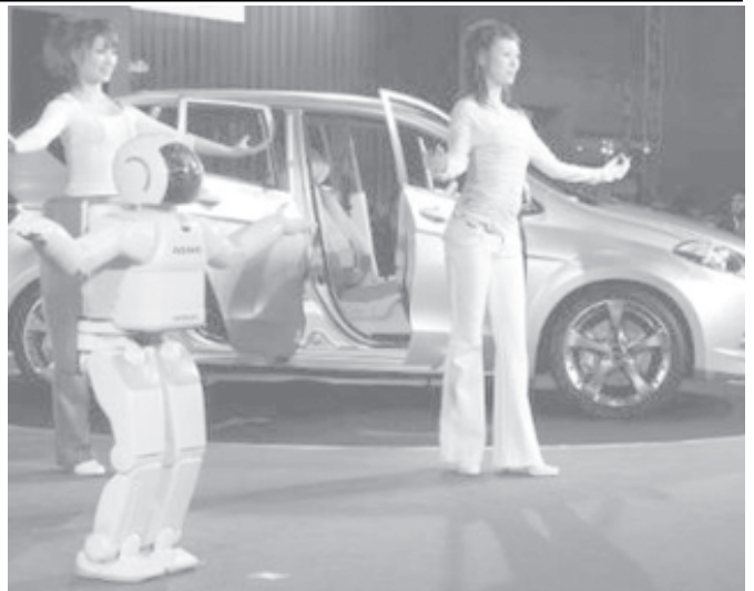
Honda Motor Co's humanoid robot Asimo performs with dancers next to the company's 'Edix Modulo concept vehicle' at Tokyo Auto Salon 2005 in Chiba, east of Tokyo January 14, 2005.

More than 1,350 US servicemen have been killed since the US invasion of Iraq in March, 2003. —MNA/Xinhua