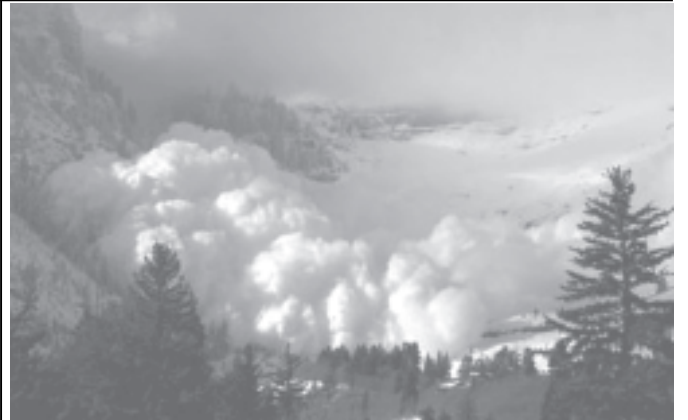
A very large avalanche slides down the northeast chute of Elk Point on Mt Timpanogos, near Provo, Utah, on Wednesday, 12 Jan, 2005. The natural release had a fracture line length of over a half-mile and 4 to 8 feet deep, descending three different, major avalanche paths at once. The slide mowed down hundreds of mature pines over an area of two football fields and piled up snow 40 feet deep.