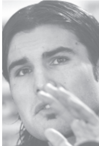
Adrian Mutu, sacked by Chelsea for using cocaine, has signed a five year contract with Juventus.

The arrival of Mutu at Juventus, who lead Serie A by four points from champions AC Milan, reinforces an attack already bristling with internationals, including David Trezeguet, Alessandro del Piero and Zlatan Ibrahimovic.