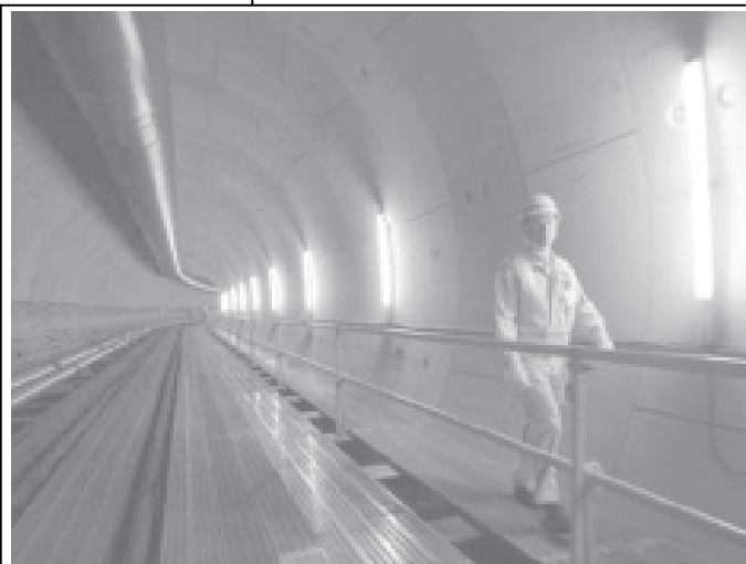
A construction worker walks in a tunnel under construction called the 'Common Utility Duct,' 40 m (43 yd) below Tokyo, on 13 Jan 2005.