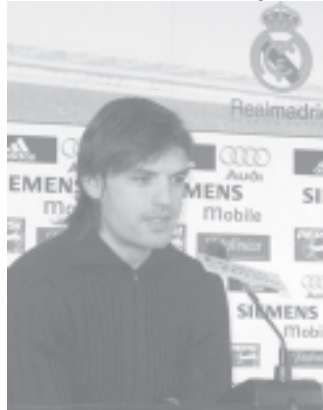
Real Madrid's striker Fernando Morientes speaks during a press conference in Madrid on 12 Jan, 2005.