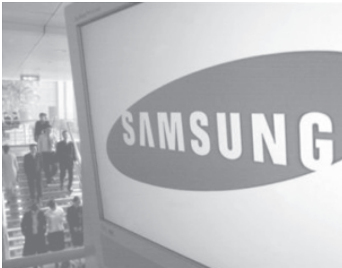
Employees of Samsung Electronics Co walk by their company logo at the headquarters of Samsung Electronics Co in Seoul Friday, on 14 Jan, 2005.