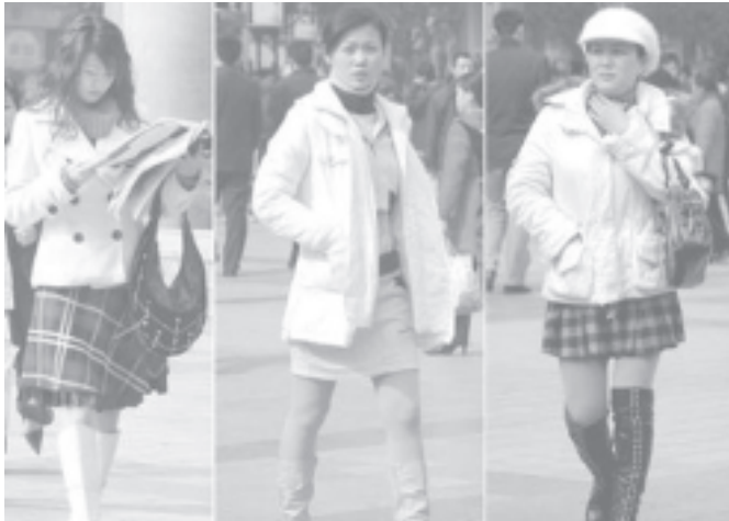
A combination photo shows fashionable Chinese girls walking in the streets of Southwest China's municipality Chongqing, on 13 Jan, 2005. China is the world's largest shoe manufacturer as well as the world's largest shoe exporter, producing at least 5 billion pairs each year. —INTERNET