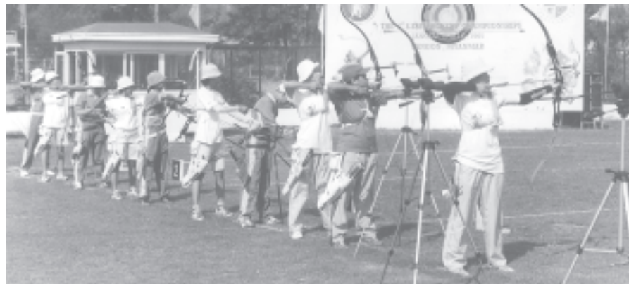
Contestants in action in the women's 70-metre recurve event.

Kosavinta said that he had found Myanmar peaceful and pleasant, adding that said he had no difficulties during the