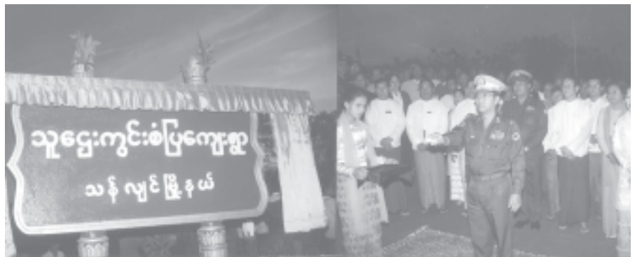
Commander Maj-Gen Myint Swe unveils signboard of Thahtaygwin Model Village in Thanlyin Township. YANGON COMMAND