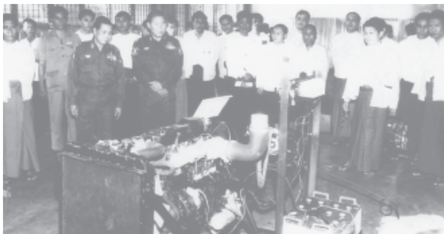
Minister for Industry-2 Maj-Gen Saw Lwin, Minister for Energy Brig-Gen Lun Thi and officials view a CNG-fired engine at No 1 Automobile Factory.