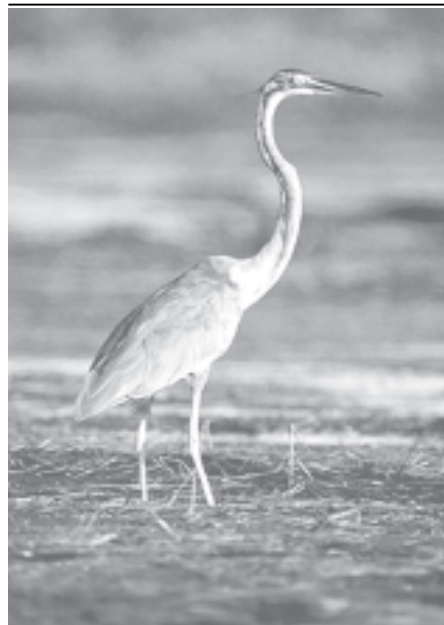
A purple heron in Singapore.

The Russian defence official said on Wednesday the order was for six Sukhoi-30MKs and Sukhoi 27SKs and a number of combat helicopters.—MNA/Reuters