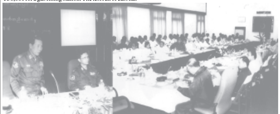
Minister for Industry-2 Maj-Gen Saw Lwin addresses the meeting on CNG substitution of cars and extension of filling stations.