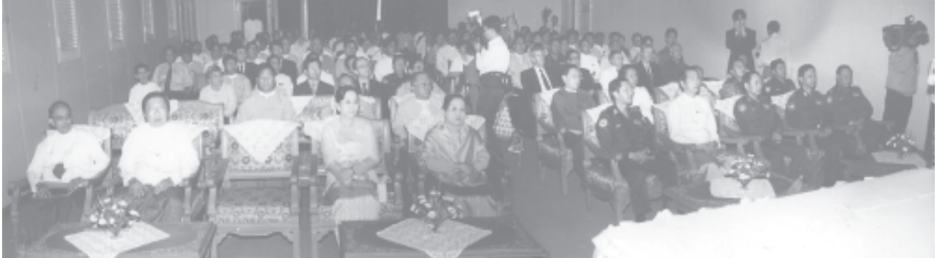
NHC Chairman Secretary-1 Lt-Gen Thein Sein delivers an address at Myanmar Health Research Conference (2004).