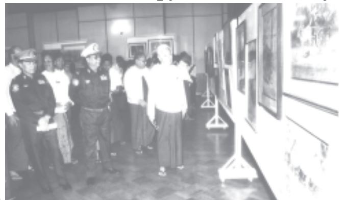
Minister for Culture Maj-Gen Kyi Aung views works of Panpyolatt Arts Gallery.

Next, Minister for Culture Maj-Gen Kyi Aung, Deputy Minister Brig-Gen Soe Win Maung, directors-general under the ministry, patrons of Myanmar Traditional Artists and Artisans Asiayon and