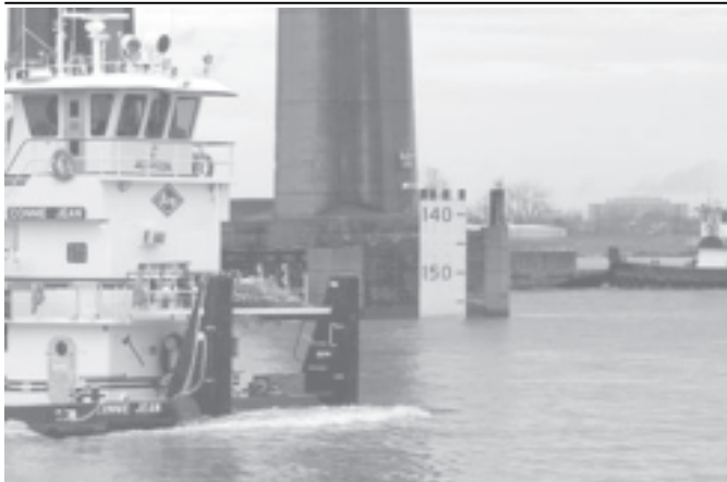
River traffic at the Crescent City Connection bridge which crosses the Mississippi River at New Orleans, approaches an air draft gauge that indicates the clearance from the river to the structure above, on 13 Jan, 2005. With the water running unusually high, large ocean-going vessels must keep a close eye on the clearance gauge.

He cited Shell Petroleum Development Company which, he said, owned 10 refineries in some African countries, and lamented that "the company did not deem it fit to establish even one refinery in Nigeria which is its largest area of operation in Africa."