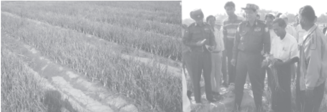
Minister for Agriculture and Irrigation Maj-Gen Htay Oo views thriving onion plantations in Myothit Township.

It is estimated that average per-acre yield will be 8,000 viss of onion. In the region, over 594 acres of land have been put under monsoon onion, and a total of 1,299 acres of onion will be extended in the cold season. —MNA