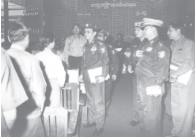
Secretary-1 Lt-Gen Thein Sein cordially converses with departmental officials in Myawady.

He said the government has laid down and im-