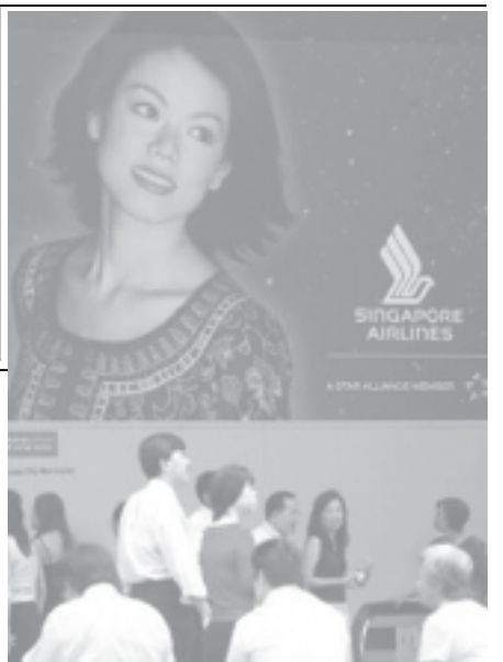
Pedestrians walk past a Singapore Airlines poster in Singapore on 11 Jan, 2005.