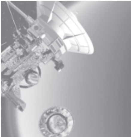
The most ambitious interplanetary mission ever launched reaches a climax on Friday when a clam-shaped probe plunges towards Titan in a suicidal quest to unlock the mystery of Saturn's biggest moon. Artist's impression shows the Huygens probe leaving the Cassini orbiter to enter Titan's atmosphere.