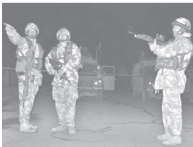
British troops cordon off the area following a car bombing in the centre of the southern city of Basra, 500 kms from Baghdad on 12 Jan, 2005.

his country will adhere to the one-China policy and support China's peaceful reunification. Li is on his four-nation African tour from 6 January to 14 January, which has taken him to Lesotho and Seychelles. He will also visit Mauritius.—MNA/Xinhua