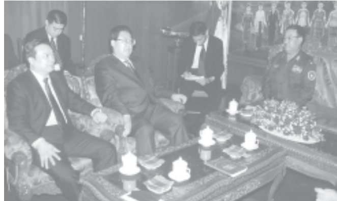
Minister for Home Affairs Maj-Gen Maung Oo receives Chinese Vice Minister of Public Security Mr Zhao Yongji and party. — HOME AFFAIRS

The Chinese Vice Minister briefed Minister Maj-Gen Maung Oo on cooperation in realizing peace and tranquillity between Myanmar and China border areas and combating transnational crimes. — MNA