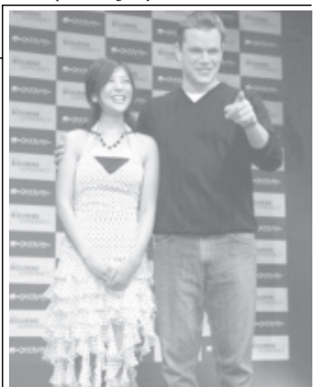
Hollywood star Matt Damon, right, and Japanese actress Miho Shiraishi pose for photographers during a news conference to promote one of his latest movies "The Bourne Supremacy" at a Tokyo hotel on 12 Jan, 2005.