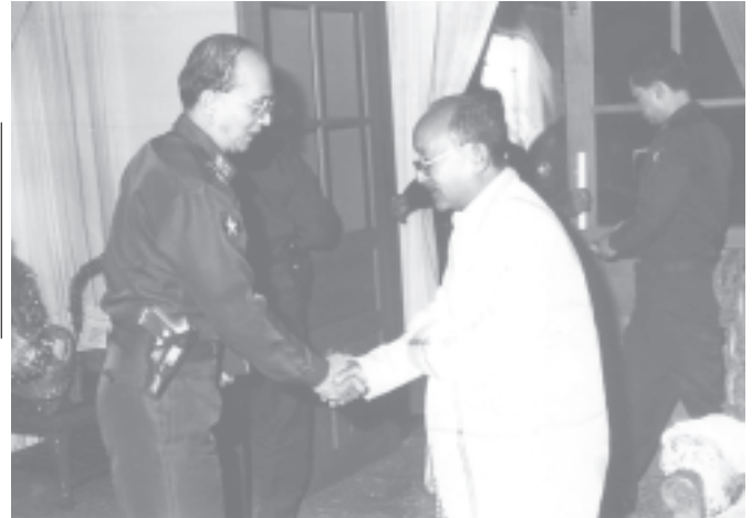
Secretary-1 Lt-Gen Thein Sein cordially greets Pado Aung San.