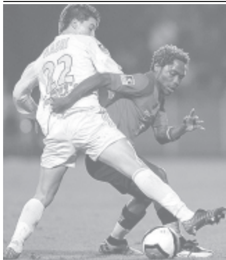
Lille's Cameroonian midfielder Jean Makoun (R) and Marseille's French midfielder Samir Nasri fight for the ball during their French L1 football match at stadium Nord in Villeneuve d'Ascq.

Chelsea play Manchester United at Stamford Bridge in the first leg of the second semi-final on Wednesday. The final is at Cardiff's Millennium Stadium on 27 February. —MNA/Reuters