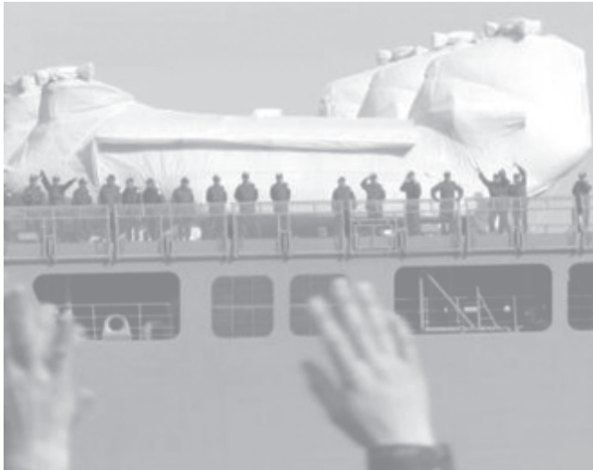
Japan Ground Self-Defence Force's (JGSDF) members wave to bid farewell to Japanese Maritime Self-Defence Force's transport ship Kunisaki departing to Indonesia at a naval base in Yokosuka, south of Tokyo on 12 January, 2005.