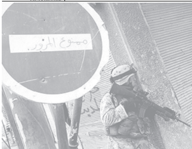
A US Marine from Lima Company takes cover as they patrol devastated city of Fallujah, some 50 kilometres west of capital Baghdad on 10 Jan, 2005.