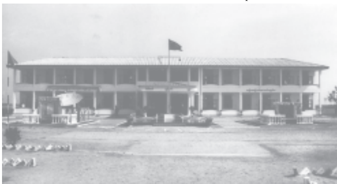
Newly-opened Kyonku BEHS (Branch) in Ngaputaw Township.