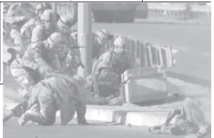
Iraqi and US troops help Iraqi military wounded in a roadside bomb blast in the northern city of Mosul on 11 Jan, 2005. INTERNET

In late December, they fired mortars at the Dura refinery in southwestern Baghdad, which feeds the capital’s main power plant.— Internet