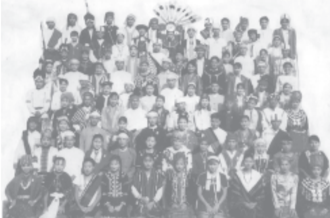
The photo shows trainees of University for Development of National Races.

Translation: TMT Myanma Alin+Kyemon: 12.1.2005 *****