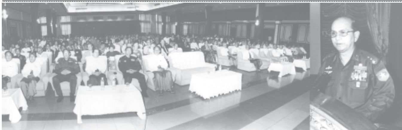
Secretary-1 Lt-Gen Thein Sein addresses Myanmar Historical Commission Golden Jubilee International Conference.

YANGON, 12 Jan — The Myanmar Historical Commission held its Golden Jubilee International Conference at Diamond Jubilee Hall here this morning, with an address by Chairman of Myanmar Edu-