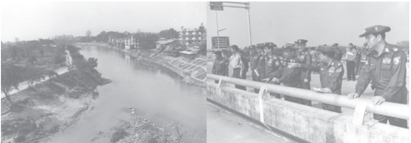
Secretary-1 Lt-Gen Thein Sein views flow of water in Thuangyin River from Myanmar-Thai Friendship Bridge in Myawady.