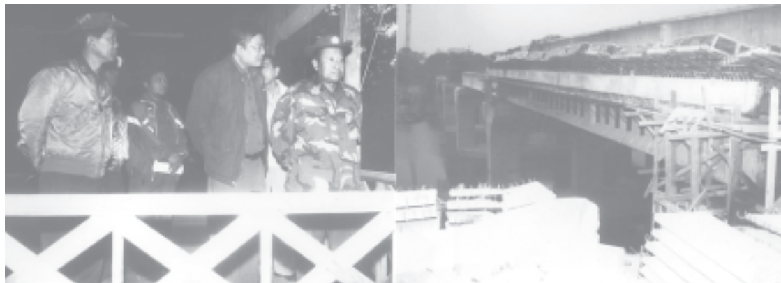
Lt-Gen Ye Myint inspects construction of Myitnge Bridge in progress on Yangon-Mandalay Highway.

way in Meiktila, Lt-Gen Ye Myint heard a report (See page 10)