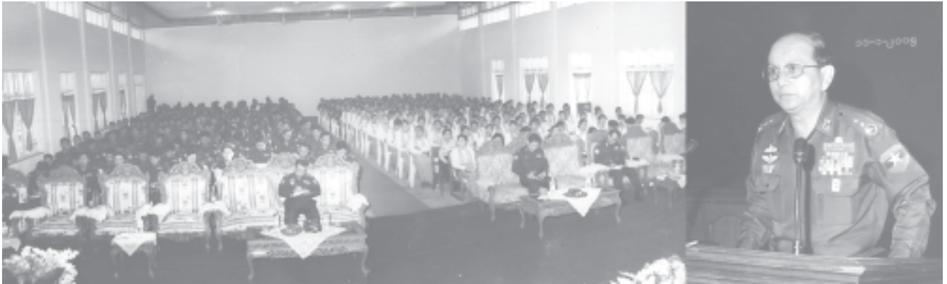
Secretary-1 Lt-Gen Thein Sein meets officers, other ranks and families of regiments and units of Hpa-an Station at the hall of No 22 LID in Hpa-an.