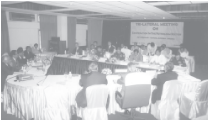
The Tri-Lateral Meeting on Mutual Cooperation in Petroleum Sector among Myanmar, Bangladesh and India in progress. — ENERGY

They discussed bilateral cooperation in petroleum sector on common interest among Myanmar, Bangladesh and India, efficient use of natural gas