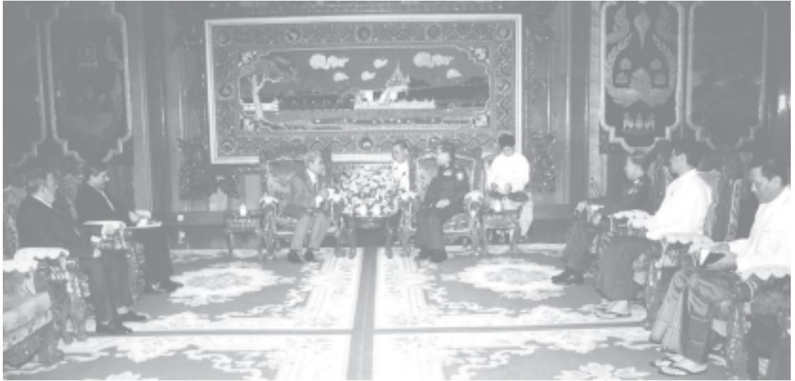
Prime Minister Lt-Gen Soe Win receives Bangladeshi State Minister for Energy and Mineral Resources Mr AKM Mosharraf Hossain and party at Zeyathiri Beikman Hall.

Also present at the call were Minister for Energy Brig-Gen Lun Thi, Deputy Ministers for Foreign Affairs U Kyaw Thu and U Maung Myint, Director-General at the Prime Minister's Office U Soe Tint and Director-General of