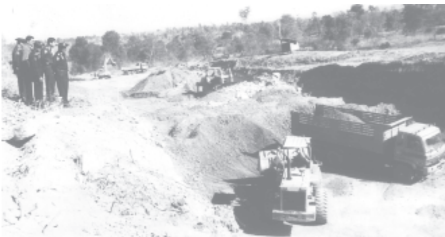
Lt-Gen Ye Myint inspects the construction of dams in Kyaukpadaung Township.