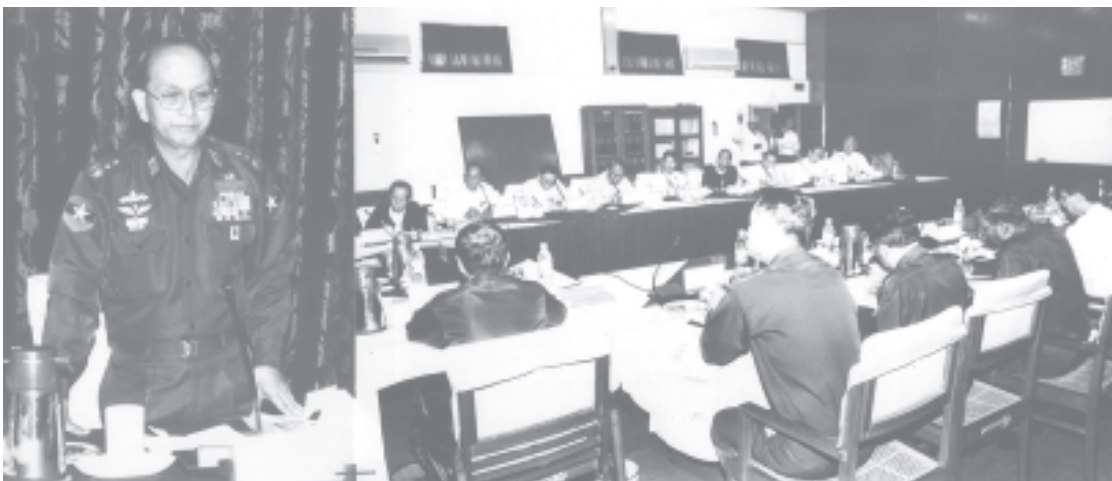
Chairman of NCCC Secretary-1 Lt-Gen Thein Sein addresses coordination meeting of the National Convention Convening Commission, the Work Committee and the Management Committee.

In his address, Chairman of NCCC Secretary-1 of the State Peace and Development Council Lt-Gen Thein Sein said that the meeting of the NCCC held on 23 November 2004 had already announced that the National Convention (See page 16)