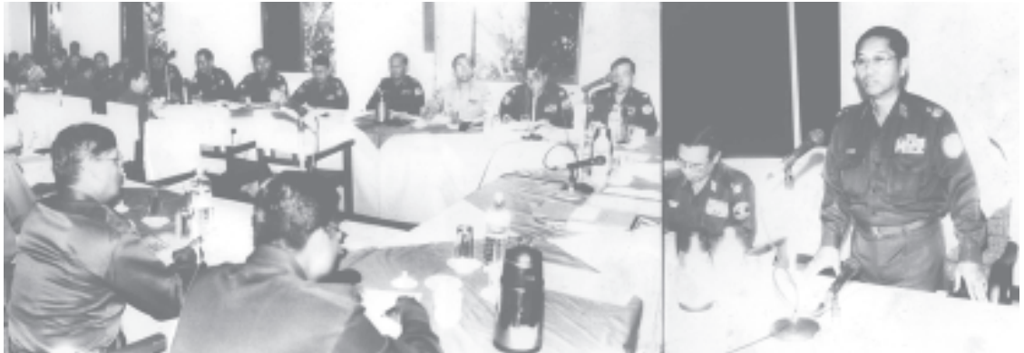
Commander Maj-Gen Myint Swe gives a speech at the second meeting of the Management Committee for Observance of the 60th Armed Forces Day (2005).

Maj-Gen Myint Swe delivered a speech, saying that the Management Committee has to carry out ongoing tasks to achieve the resolutions