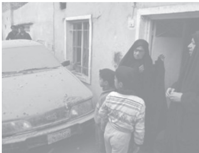
Iraqis walk out of their houses following a Katyusha rocket attack, which damaged a nearby civilian house in Baghdad, on 10 Jan, 2005.—INTERENT