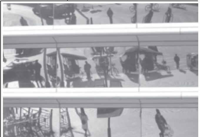
A street scene is reflected off the glass surface of a modern office building in Beijing, China, Tuesday, on 11 Jan, 2005.