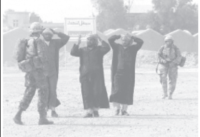
Members of the Royal Fusiliers guard Iraqis in Basra recently.