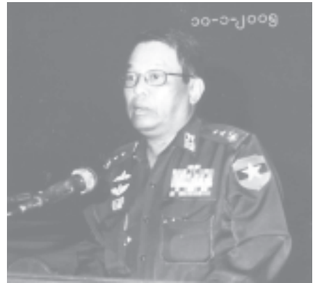
Lt-Gen Maung Bo delivers an address.

pendence for perpetual existence of the sovereign power and the right to self-determination in their hands. Thus, “Our Three Main National Causes” is the perpetual national duty for all. Since its assumption of the State duties, the Tatmadaw Government has been materializing the national policy and the four political objectives, the four economic objectives, and the four social objectives.