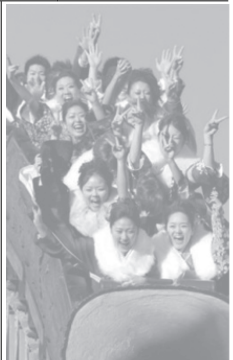
A group of 20-year-olds all in traditional kimono react as they ride on a roller coaster following their Coming-of-Age ceremony at Tokyo's Toshimaen amusement park on 10 Jan, 2005.