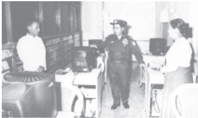
Minister Brig-Gen Kyaw Hsan inspects the e-Library of Hpa-an District IPRD in Kayin State. (News on page 16)—MNA

As sound foundations have been achieved in ensuring stability of State, community peace and stability and prevalence of law and order; and national re-consolidation, the seven-point future policy programme has been laid down and implemented to draft an enduring constitution for emergence of a modern and developed democratic state. The convening of the National Convention, the first and the most important stage of the policy programme is