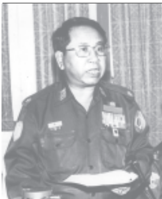
Minister for Information Brig-Gen Kyaw Hsan.