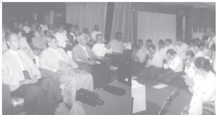
RESPECTS PAID: The respect-paying ceremony of Institute of Medicine-2 (Yangon) was held at Myanmar Medical Association on 8-1-2005. Old students (1980-1985) paying respects to the retired teachers.

A total of 62 trainees are attending the 14-week course. — MNA