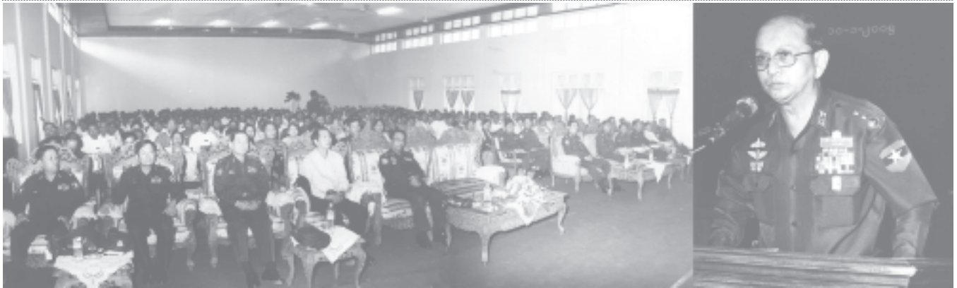
Secretary-1 Lt-Gen Thein Sein meets Kayin State, district and township level departmental officials.

YANGON, 11 Jan — Secretary-1 of the State Peace and Development Council Lt-Gen Thein Sein met departmental heads in Hpa-an, members of social organizations and officials at the hall of No 22 LID yesterday.