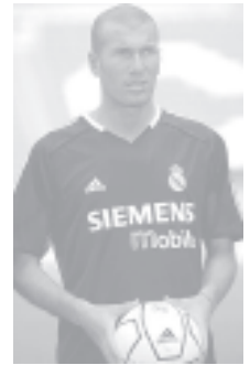
Champion footballer Zinedine Zidane was chosen as the most popular Frenchman in a newspaper survey, despite his decision last year to leave the national side.