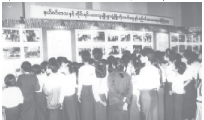
Schoolgirls and schoolboys observe the booth of Ministry for Progress of Border Areas and National Races and Development Affairs at the 57th Anniversary Independence Day commemorative exhibition. — MNA

A total of 3,900 people visited the exhibition and bought books on various subjects, journals and magazines from News and Periodicals Enterprise Book Shop, Sarpay Beikman Book Shop and other private book shops. —MNA