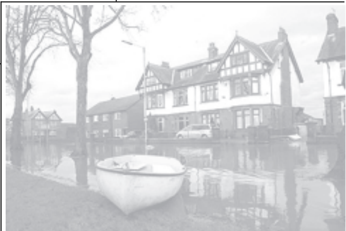
A view of a flooded street in Carlisle on 9 Jan, 2005. At least 14 people died, more than 1,000 homes were flooded and many more left without power after violent storms battered northern Europe over the weekend, bringing hurricane force winds and heavy rain.