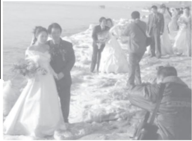
Wedding photographers take pictures of Chinese couples after a mass wedding in the city of Qinhuangdao, North China's Hebei Province, on 10 Jan, 2005.