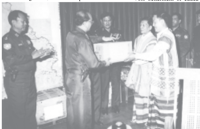
Secretary-1 Li-Gen Thein Sein presents gifts to U Tha Htoo Kyaw and party.

Minister Maj-Gen Hla Tun also met with staff of Myanmar Economic Bank, Customs Department, Internal Revenue Department, Myanmar Insurance, and Myanmar Small Loans Enterprise in Hpa-an.