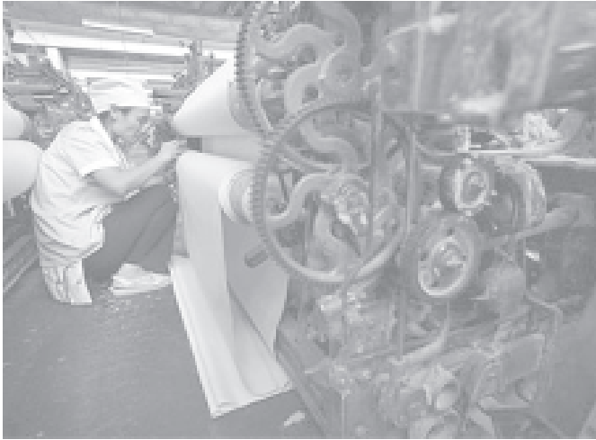
A worker at the Shijiazhuang Changshan Textile factory inspects thread for export quality cotton fabric between heavy machinery on the workfloor recently.