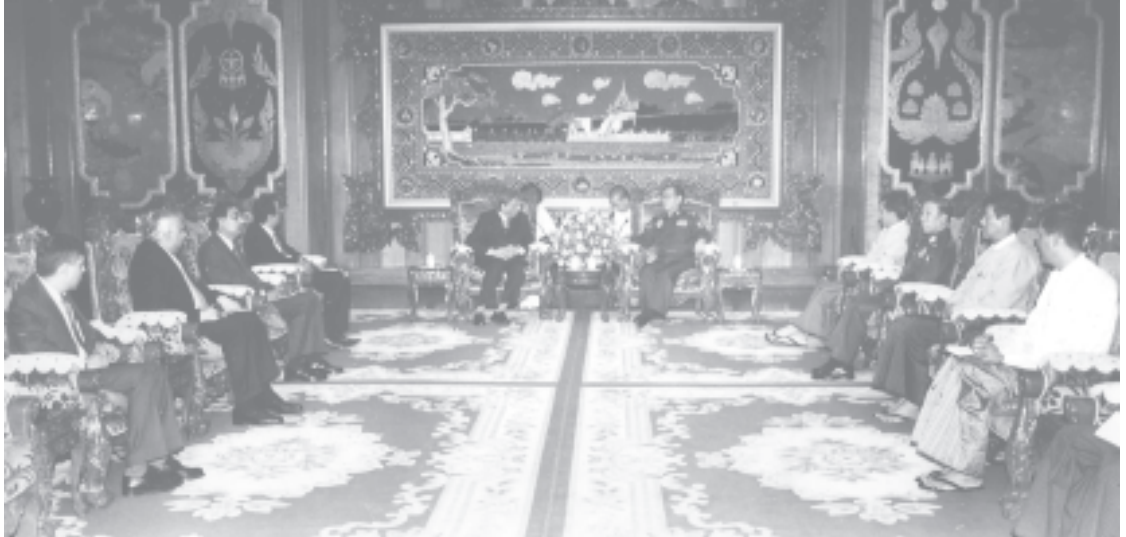
Prime Minister Lt-Gen Soe Win receives Minister of Petroleum and Natural Gas of the Republic of India Mr Mani Shankar Aiyar and party at Zeyathiri Beikman on Konmyinttha.

Also present on the occasion were Minister for Foreign Affairs U Nyan Win, Minister for Energy Brig-Gen Lun Thi, Deputy Ministers for Foreign Affairs U Kyaw Thu and U Maung Myint, Myanmar Ambassador to the Republic of India U Kyi Thein, Direc-