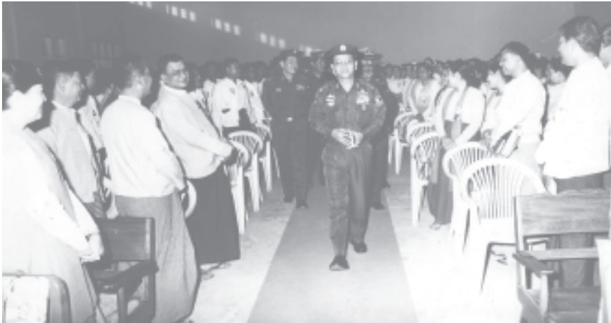
Secretary-1 Lt-Gen Thein Sein cordially greets service personnel after the meeting.

service personnel. Chairman of Kayin State Peace and Development Council Col Khin Kyu reported on the area of Kayin State, economic progress, land use, sufficiency of rice, target for cultivation of 500,000 acres of monsoon and 120,000 acres of summer paddy, production of major crops, arrangements for extended cultivation of oil crops and rubber, breeding of fish and prawn, raising of pigs and fowls, construction of roads and bridges, education,