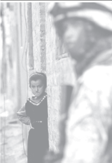
An Iraqi girl watches angrily as US Marines from Lima Company patrol the devastated city of Fallujah on 10 Jan, 2005.