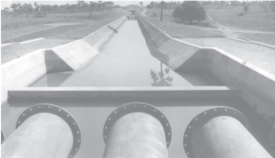
Kyawzi River Water Pumping Project.