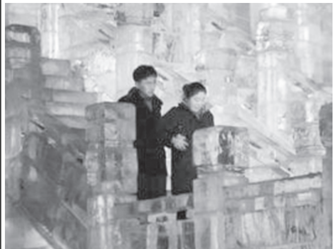
A Chinese couple walk down a stairway in palace made from ice blocks in a park during the annual ice festival in Harbin, capital of Heilongjiang Province, on 6 Jan, 2005.