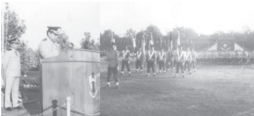
Director-General Brig-Gen Khin Yi of Myanmar Police Force speaking at concluding ceremony of Course No 50 for sub-inspectors of police.

The Central Training School of the Myanmar Police Force conducted the course attended by a total of 204 trainees. — MNA