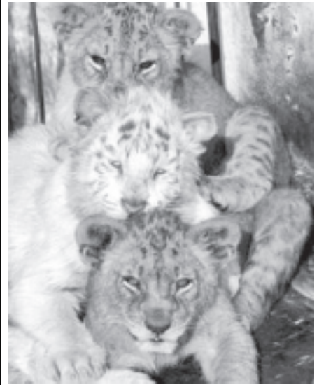
Two lion cubs play with a tiger cub in the Jinan Wildlife World, Jinan, capital of east China's Shandong Province, on 6 Jan, 2005. Three lion cubs have been put in the same cage with four tiger cubs with an aim of fostering intimacy among them.

For example, HIV-negative black adults had an average of four copies of CCL3L1, while HIV-negative European-Americans averaged two copies each and uninfected Hispanic-Americans had an average of three copies. The more copies a person had, the less likely he or she was to be infected with HIV.— MNA/Reuters