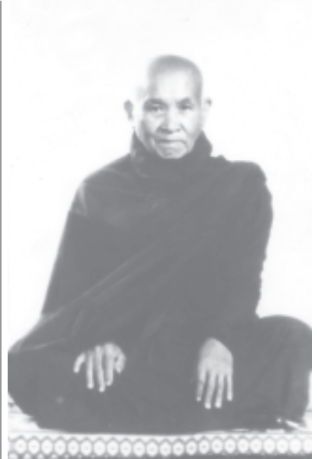
Pahtama Taungkyauingyi Sayadaw.