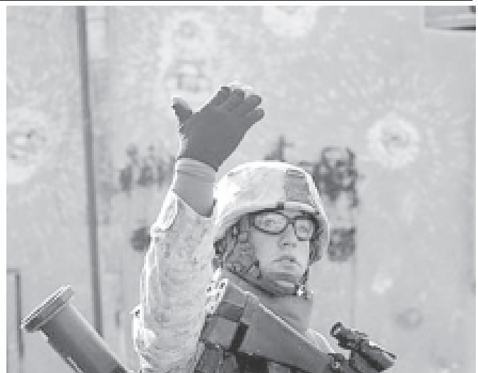
A US Marine from Lima Company gives a sign to the others as they patrol the devastated city of Fallujah on 7 Jan, 2005.

Peru is the second largest cocaine producer in the world after Colombia, with an output of nearly 300 tons per year.