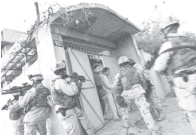
US soldiers ask Iraqis before entry into their home as troops from the 1st Battalion 24th Regiment are conducting a house-to-house search during a raid in Mosul on 7 Jan, 2005.