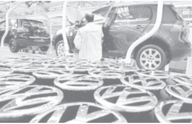
A Volkswagen assembly plant in Germany. Europe's leading carmakers are facing a profit margin squeeze in the coming year as soaring raw materials costs look set to outstrip any price rises the companies can force through in what remains a consumer-led market.