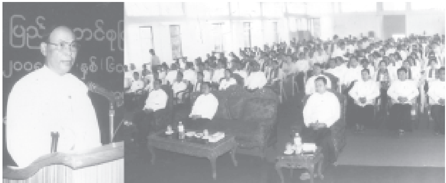
USDA CEC member Mayor Brig-Gen Aung Thein Lin addresses 60th Anniversary Armed Forces Day commemorative extempore talks.