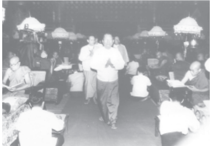
Minister Brig-Gen Thura Myint Maung visits members of the Sangha who are sitting for the 57th oral examination for Tipitakadhara Tipitaka Kovida Title.

Wellwishers are invited to donate cash to the funds set up for the members of the Sangha at the cave.