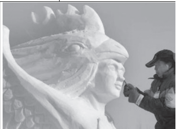
A Chinese artist makes final touches to a snow sculpture during a competition in a park during the annual ice and snow festival in Harbin, capital of Heilongjing Province.