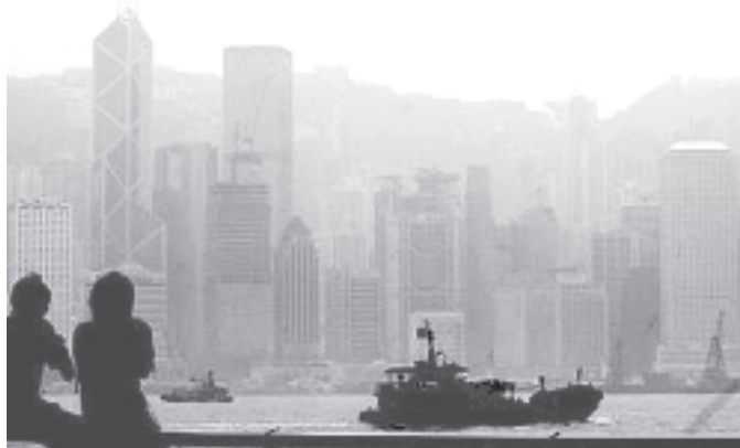
People look at smog covering the skyline of Hong Kong recently.

The fight against rotavirus was set back in 1999, when a vaccine sold in the United States by Wyeth was pulled for fears it could cause a sometimes deadly bowel obstruction.—MNA/Reuters