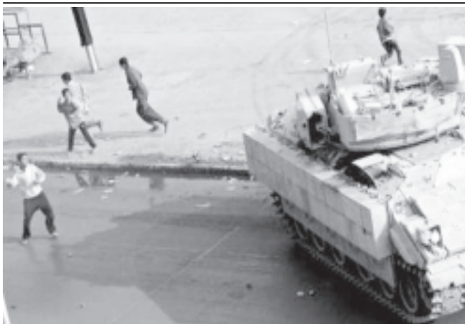
Iraqi boys throw stones at a US Bradley armoured vehicle in the Shiite suburb of al-Sadr city in Baghdad, on 7 Jan, 2005.