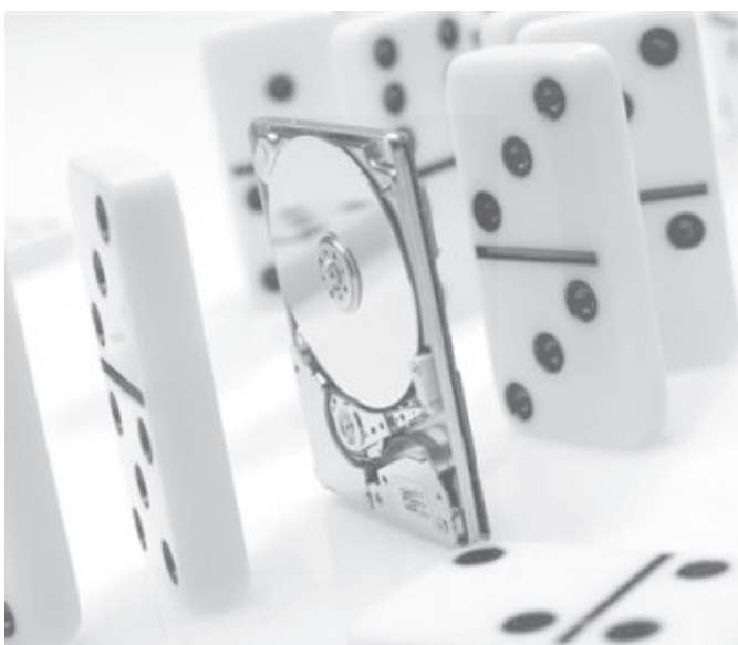
Hitachi, Ltd’s new 8GB Mikey drive is shown with dominoes to demonstrate its smaller profile. Mikey is a new miniature hard drive from Hitachi that can store several thousand songs or pictures in 8 GB of storage.