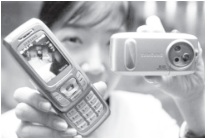
An employee of Samsung holds Samsung's new SPH-A800 mobile phone with a 2-megapixel camera and a speech-to-text conversion capability which it claims is the world's first, enabling users to send text message using their voice in Seoul on 6 Jan, 2005.

While answering questions about the proposed oil pipeline project linking the two countries, Kong said energy cooperation constituted an important part of China-Russia strategic partnership and the mutually beneficial economic cooperation between the two countries. State leaders, governments and relevant departments attach great importance to the project, and have discussed different plans and proposals, he said. There is no official information yet on the plan to lay the pipeline, Kong said. —MNA/Xinhua