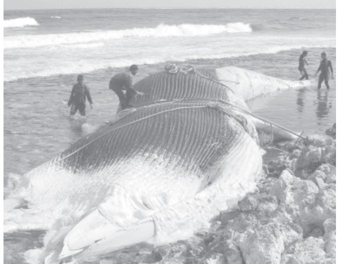
Maldivian National Security Service personnel attempt to clear the carcass of a blue whale which washed ashore at the Full Moon Resort. The whale added to the huge problem of cleaning up the pristine Maldivian beaches.