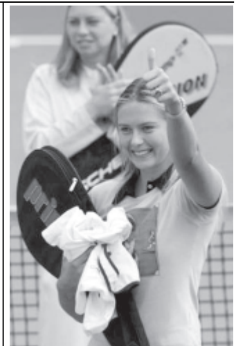
Russian tennis star Maria Sharapova (front) gives a thumbs up sign, while compatriot Vera Zvonareva claps, after her racket and a T-shirt were sold for HK$520,000 ($66,700) during an auction in Hong Kong on 8 Jan, 2005.