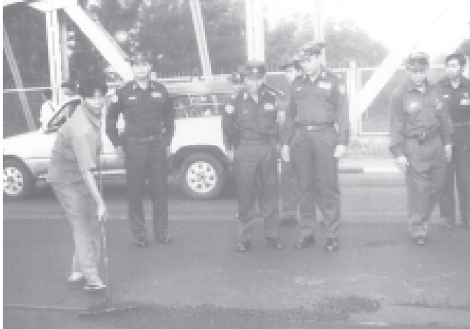
Commander Maj-Gen Myint Swe and Mayor Brig-Gen Aung Thein Lin inspect upgrading of the road of the overpass on Sule Pagoda Road. — YANGON COMMAND

The commander and the mayor told the officials to finish the upgrading of roads and pavements in time and to supervise the work. —MNA