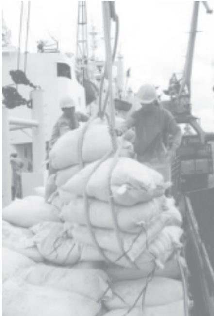
Vietnamese workers load sacks of rice onto a ship at a port in Hai Phong city, 92 km east of the capital Hanoi, on 5 Jan, 2005. — INTERNET

Hu Jintao is also the general secretary of the CPC Central Committee and chairman of the CPC Central Military Commission. — MNA/Xinhua