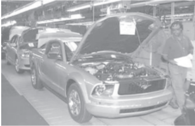
Ford Motor Co on 4 Jan, 2005 capped 2004 with its seventh straight month of weaker sales, despite a crop of new vehicles and hefty incentives while Japan's Nissan Motor Co Ltd posted another sales gain. Ford, which proclaimed 2004 the 'year of the car' when it hoped new models like the Mustang sports car would boost results, reported a 3.6 percent drop in sale for December.