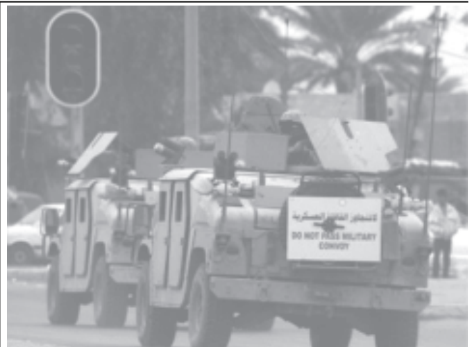
A US military convoy arrives at the scene of a car bomb in Baghdad on 6 Jan, 2005.