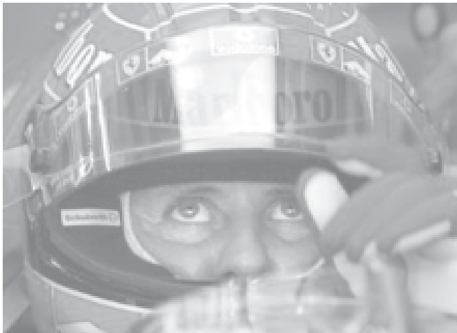
Ferrari's seven-times Formula One champion Michael Schumacher gives instructions to his crew during the first practice session at Shanghai Circuit in this 24 September, 2004 file photo.