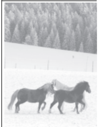
Horses frolic on a snowy pasture at the Schauinsland in the Black Forest in southern Germany, on 3 Jan, 2005.

Mallorca are 19th in the 20-strong Primera Liga, one point above bottom club Numancia. They host Deportivo Coruna in their first league match of the year on Sunday.