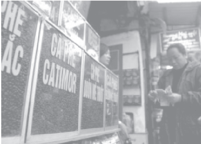
A Vietnamese woman counts money while buying coffee in Hanoi on 4 Jan, 2005. Coffee sellers in Vietnam, the world's top robusta exporter, were reluctant to offer prices on Tuesday, waiting for the London market to reopen after the year-end holidays in order to assess trends, traders said.