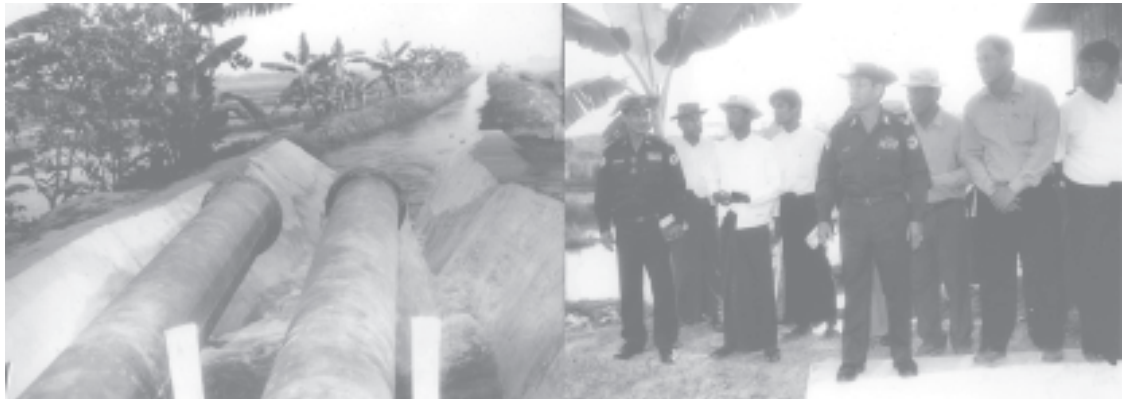
Commander Maj-Gen Myint Swe inspects Kyunngu river water pumping station in Htantabin Township.

The commander inspected the 25-acre paddy field of farmer U Chit Sein on Yangon-Pathein Highway near Hnggethaik Village, Htantabin Township. Of-