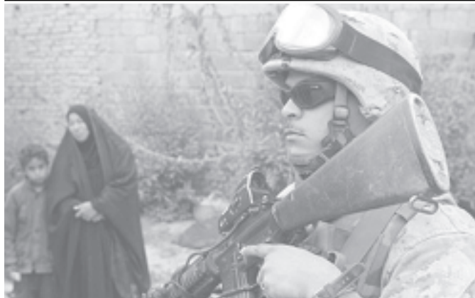
US Marine from Lima Company passes by Iraqis as he patrols the devastated city of Fallujah recently.