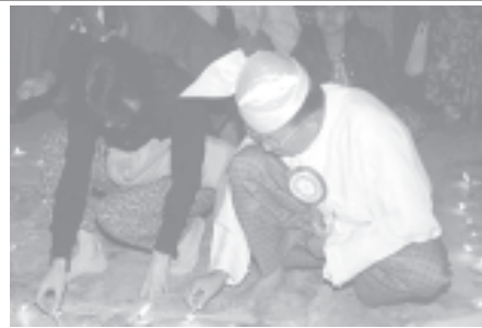
The 9,900 oil lights offering ceremony in progress at Shwezigon Pagoda in NyaungU.