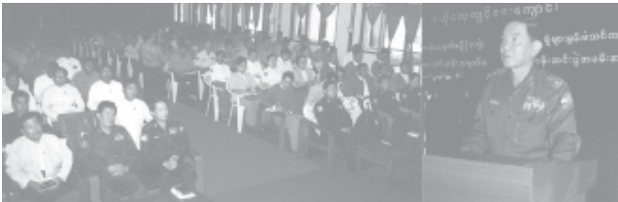
Minister for PBANRDA Col Thein Nyunt addresses concluding ceremony of training courses. °