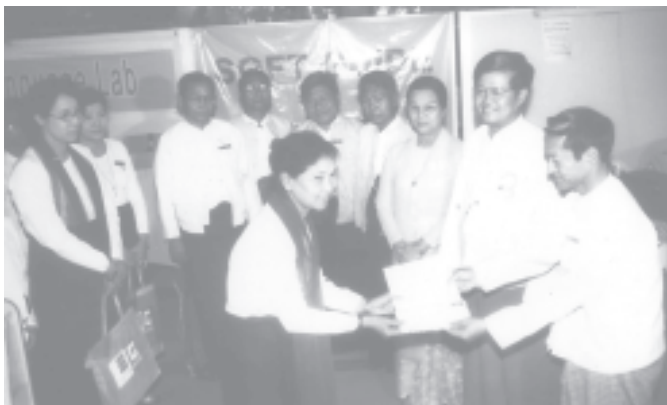
An official presents prize to a teacher of Hline Township BEHS 2 in Computer Quiz of YUCS and Teaching Contest.

YANGON, 5 Jan — The 57th Anniversary Independence Day Exhibition organized by the 57th Anniversary Independence Day Information Organizing Sub-committee and the Exhibition Staging Sub-committee continued for the fourth day at the Tatmadaw Convention Hall on U Wisara Road in Dagon Township from morning to this evening.