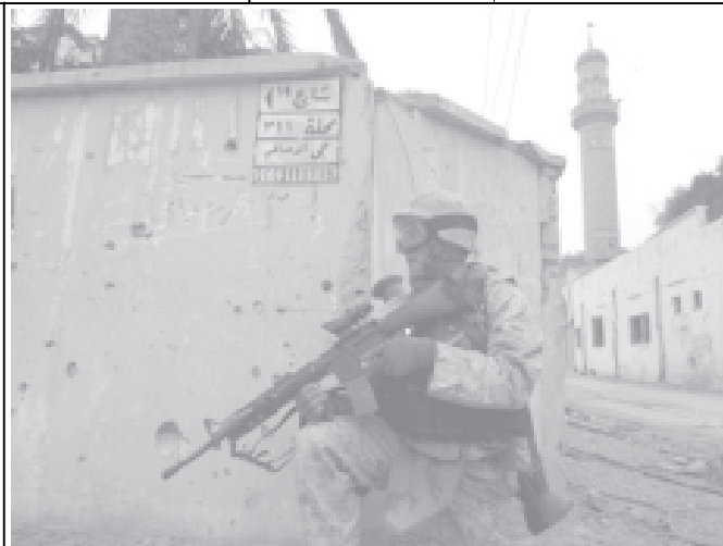
US Marine takes cover during a patrol of the devastated city of Fallujah, 50 kms west of Baghdad on 5 Jan, 2005.