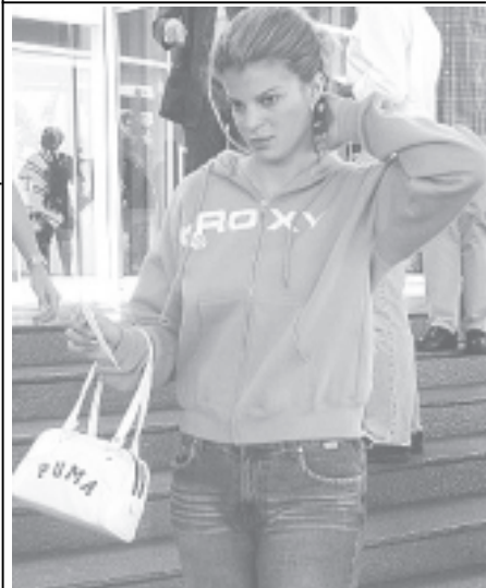
Athina Roussel Onassis, seen here in 2003, the granddaughter of late shipping billionaire Aristotle Onassis, is set to make a bid to ride for the Greek equestrian team for the 2008 Olympics in Beijing.