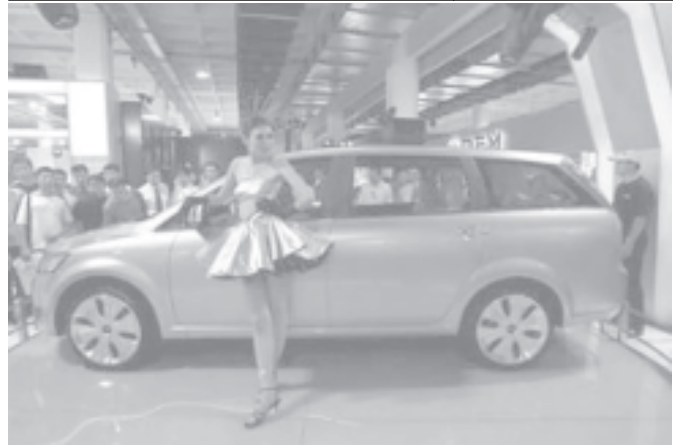
Visionary Vehicles LLC, started by the man who brought the Yugo car to America in the 1980s, plans to sell a million vehicles from China on the US market at bargain-basement prices by 2011, the company said on 3 Jan, 2005.