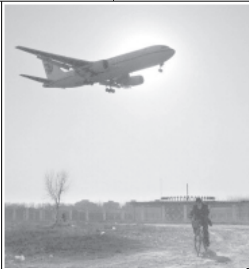
A China Southern Airlines (CSA) plane. China's top domestic carrier, could be set to place a 2.4 billion dollar order for 20 of Boeing's new 7E7 jets.