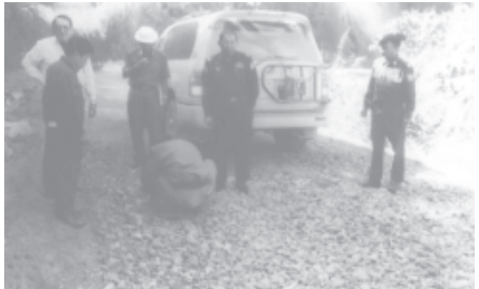
Minister Maj-Gen Saw Tun inspects the repairing of Tarkaw-Hsinmaung-Mongpyin-Kengtung Road. — CONSTRUCTION