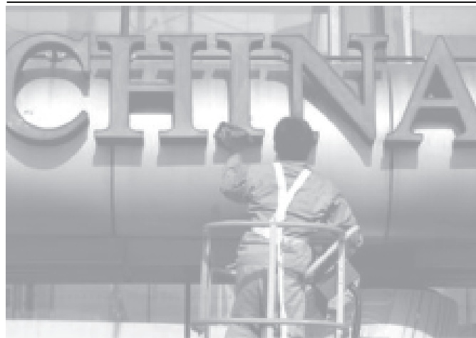
A worker cleans a neon-sign at a commercial centre in Beijing on 2 Jan, 2005. China's central bank governor pledged to speed up financial reforms and promote fast and sustainable economic growth in the New Year.