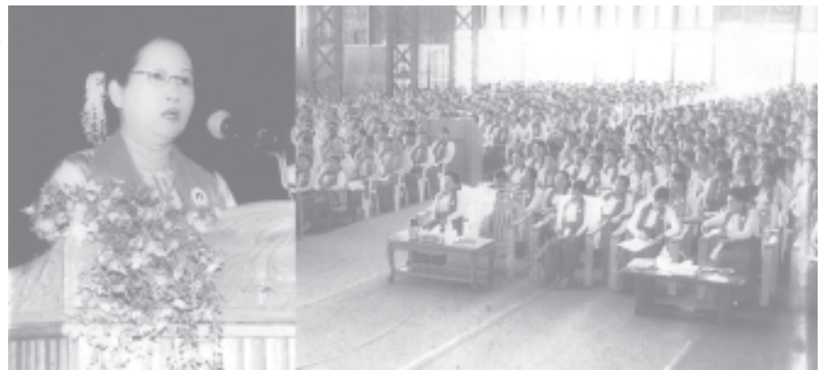
President of MWAF Daw Than Than Nwe meets with members of Taninthayi Division Organization for Women's Affairs in Myeik.

As is known to all, the government, upholding our three main national causes, is putting the twelve objectives into practice day and night for national progress. The members are to be fully aware of a wide variety of fabrications manufactured by internal and external destructive elements with the intention of tarnishing the prestige of the Tatmadaw (See page 10)