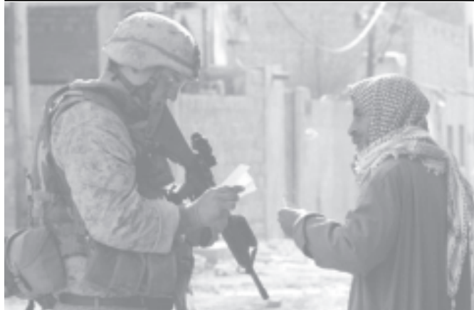
An elderly Iraqi shows his ID papers to a US Marine on patrol in the destroyed city of Fallujah, 50 kilometres west of the capital Baghdad on 2 Jan, 2005.—INTERNET

In 2004, new markets for aquatic products are emerging as China’s export to the Association of the South-East Asian Nations (ASEAN) nations, Australia, Russia and Hong Kong region has grown rapidly.—MNA/Xinhua