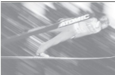
Super Ahonen : Janne Ahonen flies to another victory during the Four Hills competition, part of the FIS World Cup in Ski-Jumping, in Innsbruck.