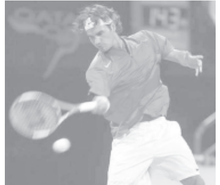
Roger Federer of Switzerland returns a shot to his Spanish opponent David Ferrer during their Qatar Open tennis tournament, in Doha, January 3, 2005. World number one and top seed Federer posted a fluent 6-1 6-1 victory over Spaniard Ferrer in the first round of the ATP $1 million Qatar Open.