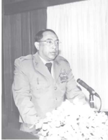
Deputy Minister Brig-Gen Aung Myo Min speaks at the prize-presentation ceremony.

flourishing democratic nation is the national solidarity. In all seriousness, I would like to assert that the Government will further strengthen the national solidarity to become stronger in the interest of the State and the entire