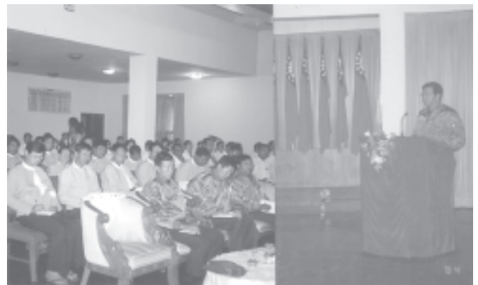
Minister Maj-Gen Hla Tun meets service personnel of F & R Ministry.

The minister inspected the Internal Revenue Department, Myanmar Economic Bank, the Customs Department and the Myanmar