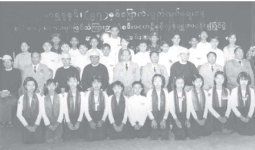
Secretary-1 Lt-Gen Thein Sein and party pose for a documentary photo together with prize winners.

mayor, the deputy ministers, officials of the SPDC office, departmental heads, officials and guests.