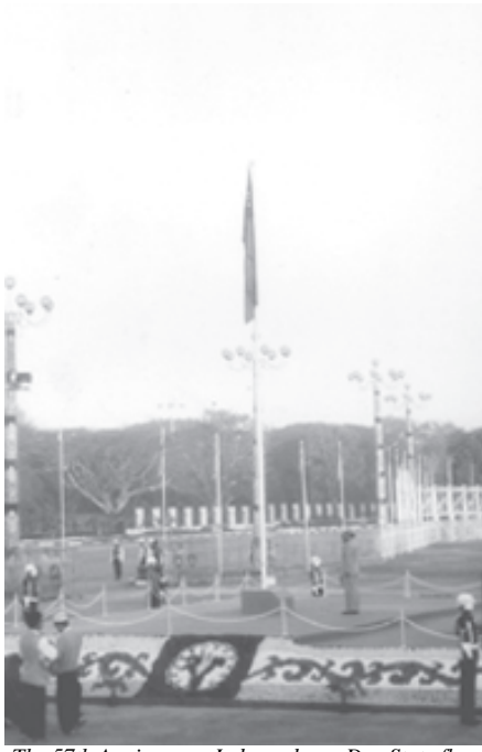
The 57th Anniversary Independence Day State flag hoisting ceremony in progress.

Later, the guard of honour saluted the fallen heroes and recited the four oaths. Afterwards, Chairman of Sub-committee for organizing the ceremony Chairman of Yangon Division Peace and Devel-