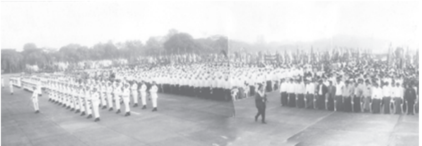
The 57th Anniversary Independence Day State flag saluting ceremony in progress.