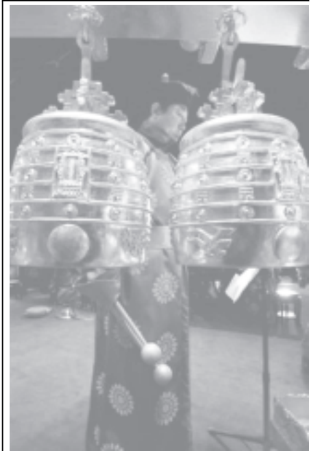
A Chinese musician waits for his turn to perform with ancient bell instruments during a performance at an ancient music ministry newly opened to the public in Beijing, China, on 31 Dec, 2004.

continuous arrangement and adopts a building-block approach which provides a mechanism for further liberalization measures. Starting from January 1, the TID will accept applications from local manufacturers wishing to include their goods in the next phase of zero tariffs under CEPA, the spokesman added.—MNA/Xinhua