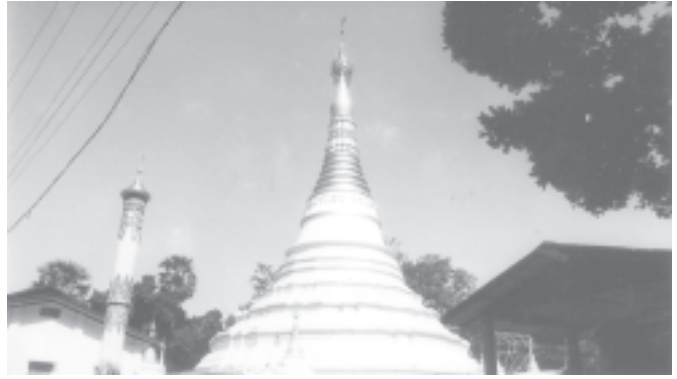
The Kyaikbodhi Pagoda seen after being renovated.

The religious buildings were renovated with the cash donations and services contributed by the wellwishers.