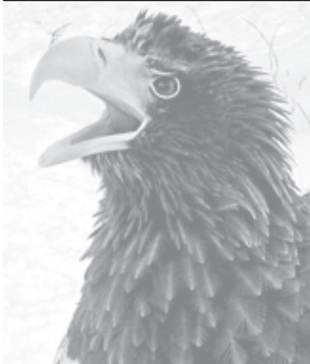
At the zoo: An eagle squawks in his cage in Moscow's Zoo during the zoo's traditional free of charge day.