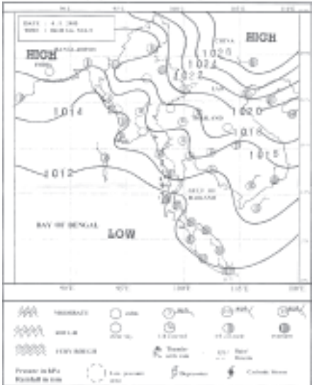
Weather Map of Myanmar and Neighbouring Areas