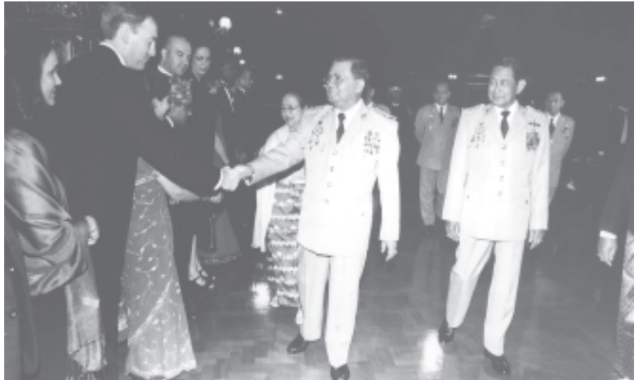
Senior General Than Shwe cordially greets diplomats at the 57th Anniversary Independence Day reception and dinner.