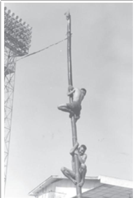
Independence Day commemorative greasy pole climbing contest held by families of Yangon Command at Aung San Stadium on 4 January.

After the ceremony, Secretary-1 Lt-Gen Thein Sein and party posed for a documentary photo together with the prize winners.