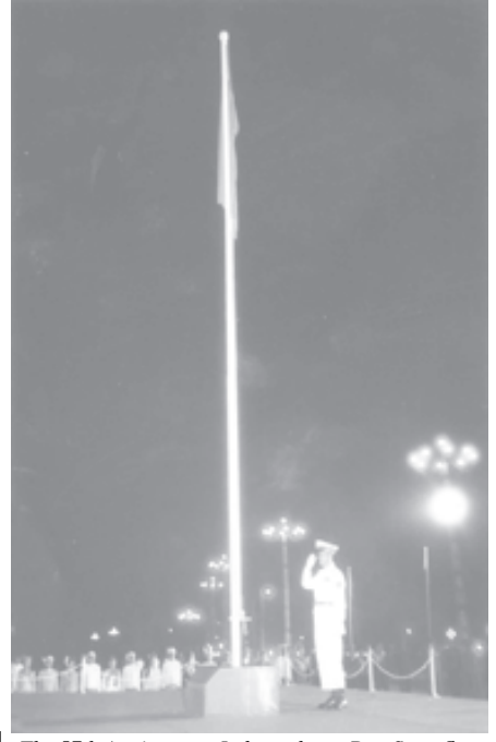
The 57th Anniversary Independence Day State flag hoisting ceremony in progress. — MNA