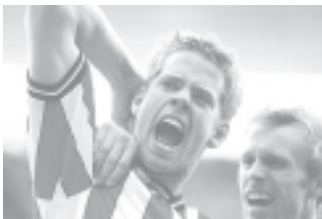
Southampton striker James Beattie, seen here in 2002, will join fellow Premiership side Everton for six million pounds (8.4 million euros) after the England international agreed personal terms with the Goodison Park club.

LONDON, 4 Jan— Southampton striker James Beattie has agreed personal terms with Everton on a club record high switching fee, the England Premier League soccer club announced on their official web site late on Sunday.