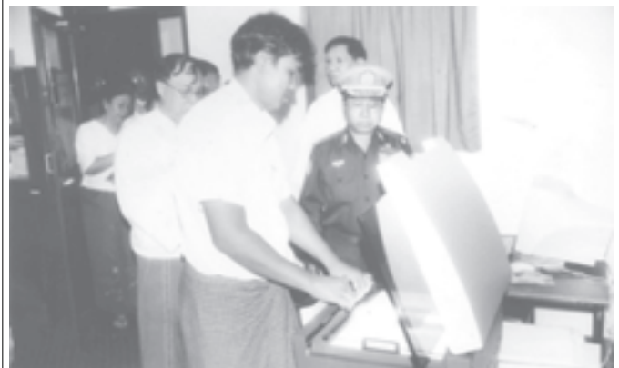
Minister Brig-Gen Kyaw Hsan inspects GTC Press in Insein Township.