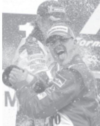
Second placed British Honda driver Jenson Button and winner, German Ferrari driver Michael Schumacher, front, spray champagne during the winner's ceremony of the Formula One German Grand Prix.

LONDON, 3 Jan— Ferrari's Michael Schumacher is preparing for another season of success, this time as the oldest driver in Formula One.