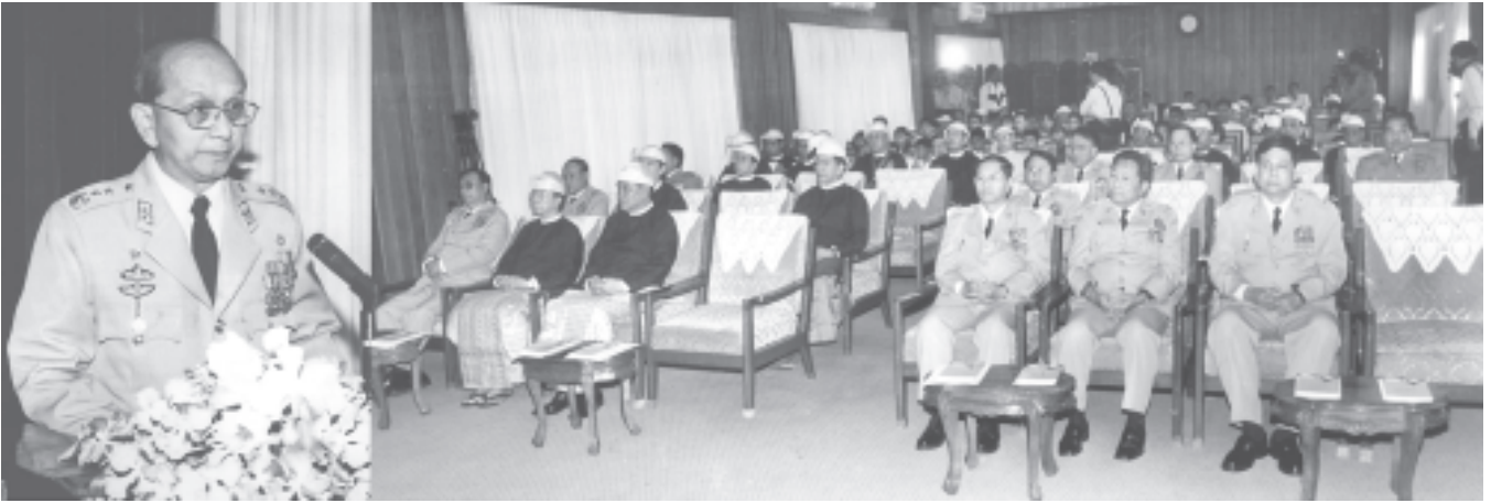
Secretary-1 Lt-Gen Thein Sein addresses the 57th Anniversary Independence Day commemorative prize-presentation ceremony.