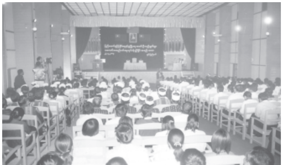
Chin State USDA holds meeting to implement seven objectives and nine future tasks adopted by the USDA AGM (2004), and to carry out plans. — MNA