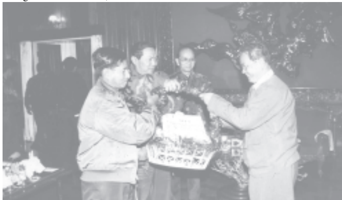
Lt-Gen Aung Htwe presents souvenirs to national race leaders of the peace groups in Taunggyi, Shan State (South). — MNA

After the lunch, Lt-Gen Thein Sein, Lt-Gen Aung Htwe and Commander Maj-Gen Khin Maung Myint posed for a documentary photo together with leaders of the peace organizations. — MNA