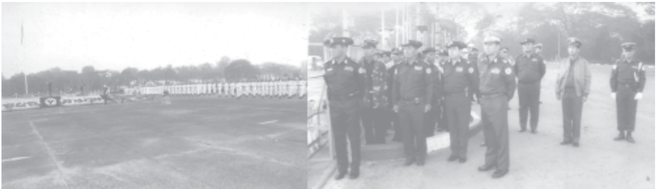
Commander Maj-Gen Myint Swe inspects dress rehearsal for State Flag Hoisting and Saluting Ceremony.

YANGON, 2 Jan — The full-dress rehearsal for the 57th Anniversary Independence Day State Flag Hoisting and Saluting ceremony took place at the People's Square on Pyay Road here this morning.