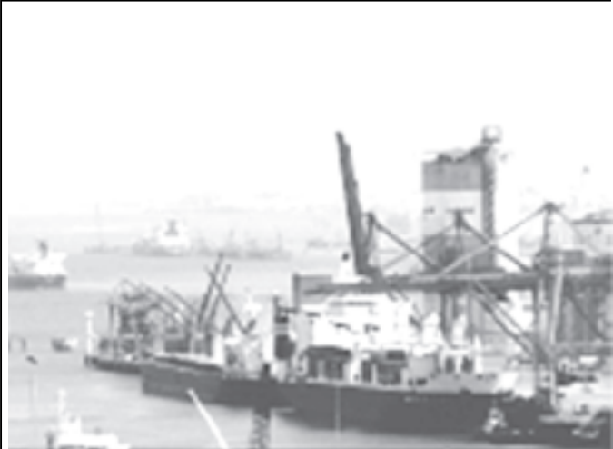
Ships berth at the wharf of Singapore's bustling Jurong Port on 2 Jan, 2005.