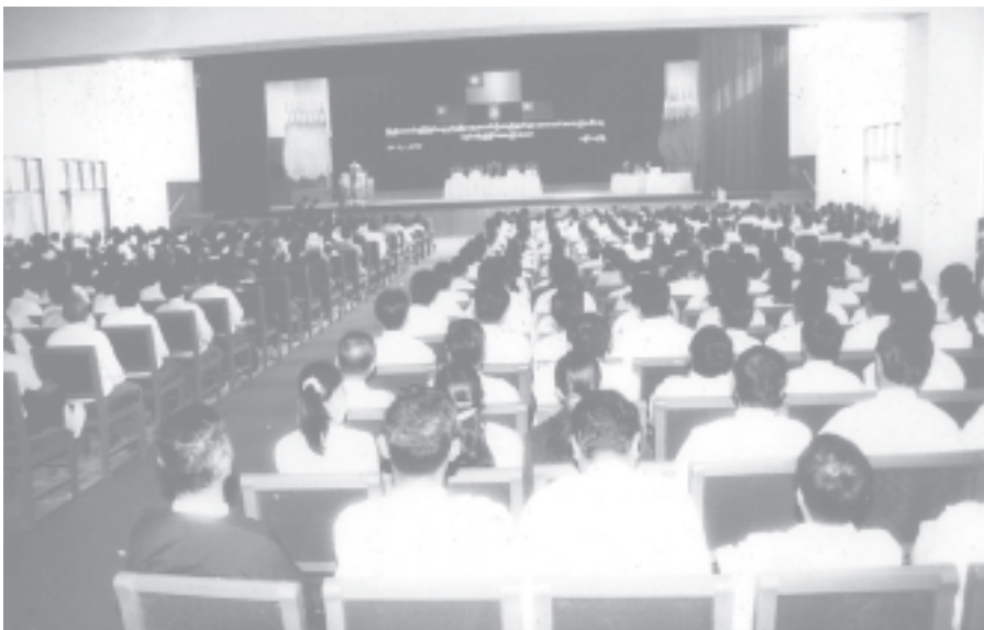
Shan State (East) USDA holds meeting to implement seven objectives and nine future tasks and plans to be carried out in Shan State (East).— MNA

accomplishments of the association at different (See page 6)