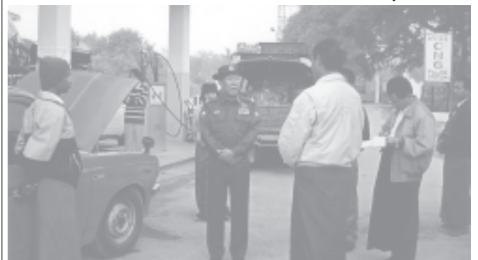
Minister for Energy Brig-Gen Lun Thi inspects CNG Filling Station in Paleik.— ENERGY

drivers and travellers. The station sells natural gas from 3 am to midnight daily at reasonable prices. Thanks to the natural gas-used vehicles, bus fares are reduced by 50%. —