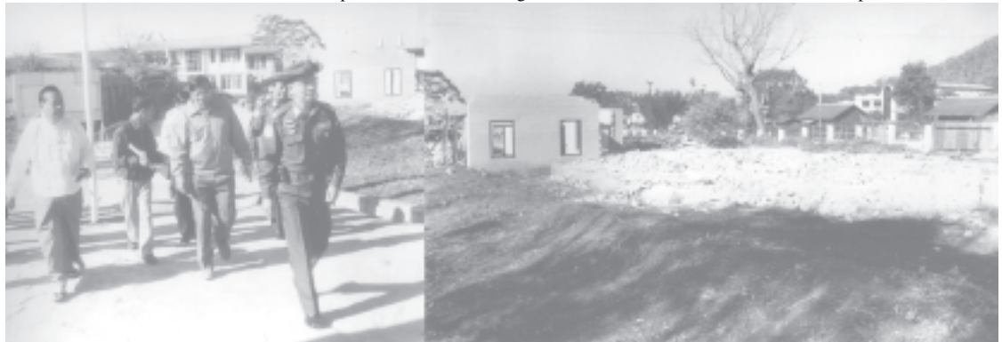
Secretary-1 Lt-Gen Thein Sein inspects the construction site of the three-storey annexe to Women's and Children's Specialist Hospital in Taunggyi.

Lt-Gen Thein Sein gave instructions on timely completion of the tasks and inspected construction