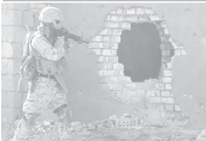
US Marine with Bravo Company, conducts a house-to-house search in the Iraqi city of Fallujah on 29 Dec, 2004.

In the town of Youssifiya, just south of Baghdad, another bomb exploded early Saturday, wounding two guardsmen who were on patrol, police said.