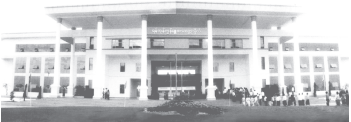
The new main building of University of Computer Studies, Yangon.

Hailing the 57 th Anniversary Independence Day