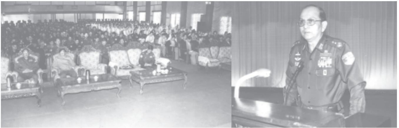
Secretary-1 of SPDC Lt-Gen Thein Sein meets officers, other ranks and families of regiments and units of Eastern Command in Taunggyi.— MNA

YANGON, 2 Jan — Secretary-1 of the State Peace and Development Council Lt-Gen Thein Sein inspected agriculture, livestock breeding, education and health matters in Nyaungshwe and Taunggyi Townships this morning.