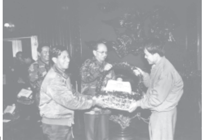
Secretary-1 of the State Peace and Development Council Lt-Gen Thein Sein presents souvenirs to national race leaders in Taunggyi, Shan State (South)