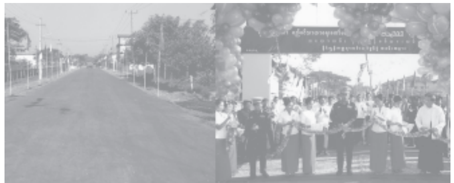
The opening ceremony of Amaya Road and Kyansittha Road in progress in North Okkalapa Township on Saturday.—MNA

Sangha and a day's meal to nuns of Maha Bodi Kyaungtaik. Sayadaw Bhattanta Tikka delivered a sermon, followed by sharing of merits.—MNA