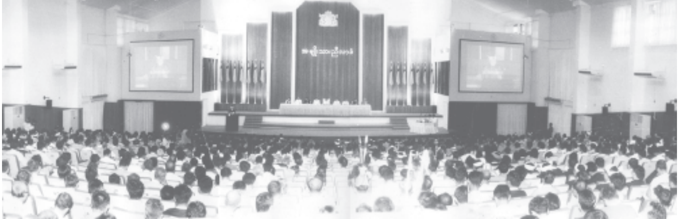
The Plenary Session of National Convention in progress at Pyidaungsu Hall of Nyaungnapin Camp in Hmawby Township.

The 57th Anniversary Independence Day falls on 4 January 2005. This year's Objectives of the Independence Day are as follows: