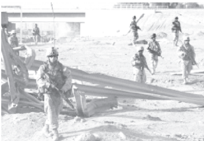
US Marines patrol Fallujah, some 50 kilometers east of Baghdad on 1 Jan, 2005.