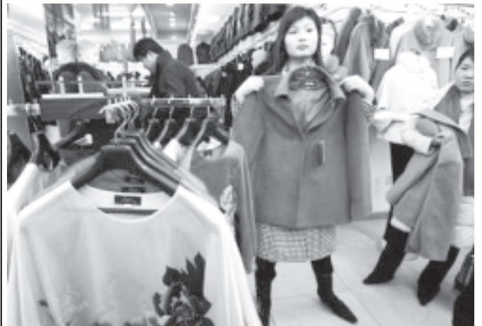
A Chinese woman checks out a jacket on sale at a shop in Beijing, China, on 1 Jan, 2005.