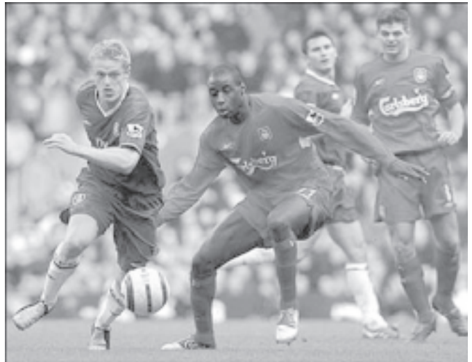
Chelsea's Damien Duff (L) and Liverpool's Djimi Traore race for the ball during their Premiership football match at Anfield in Liverpool.