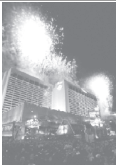
Fireworks explode over the Flamingo hotel marking the arrival of the New Year in Las Vegas on 1 Jan, 2005.