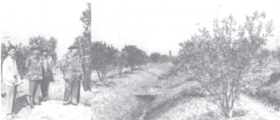
Secretary-1 Lt-Gen Thein Sein inspects the agricultural farm of Eikhsitan Co in Nyaungshwe Township.— MNA.