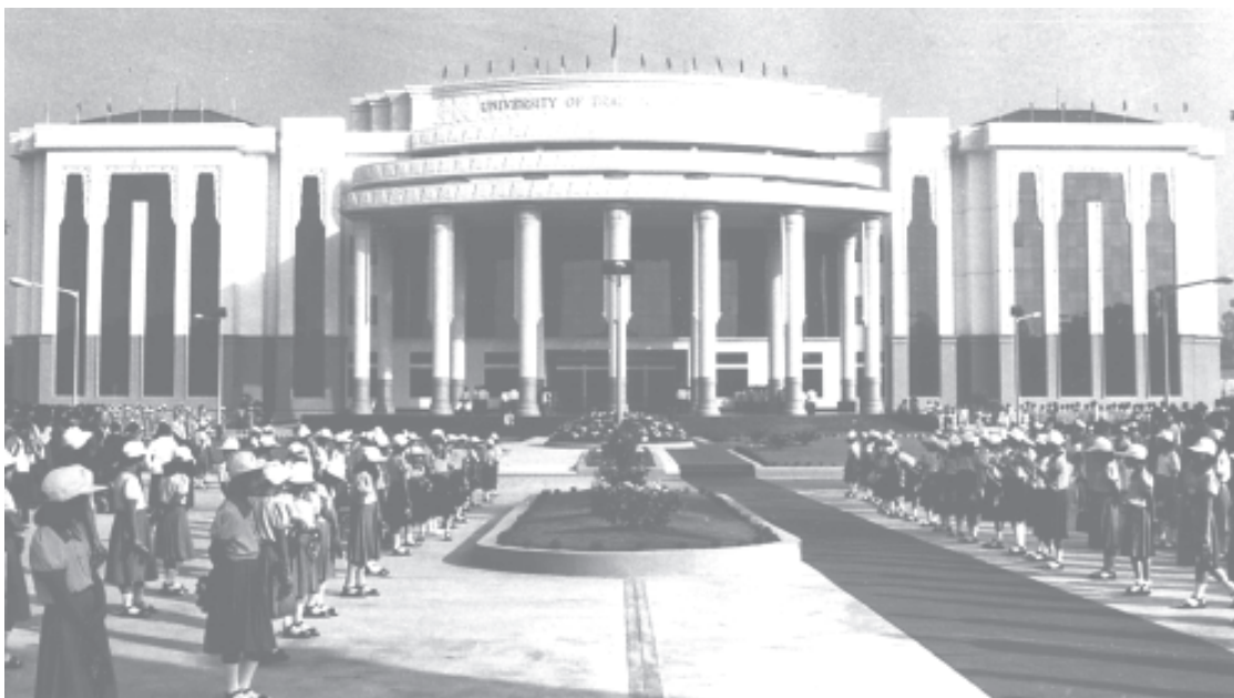
The newly-built University of Traditional Medicine in Mandalay.