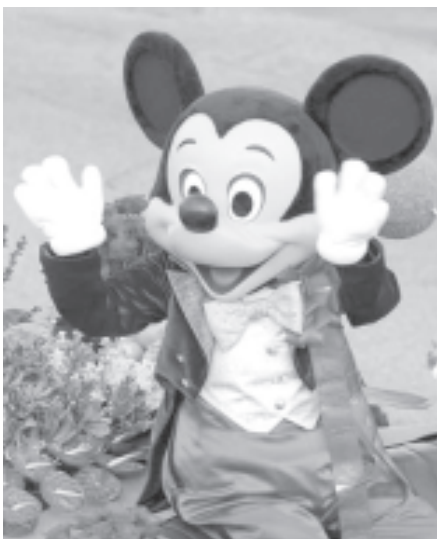
Tournament of Roses Parade Grand Marshal Mickey Mouse greets spectators during the annual parade through the streets of Pasadena, California on 1 Jan, 2005.