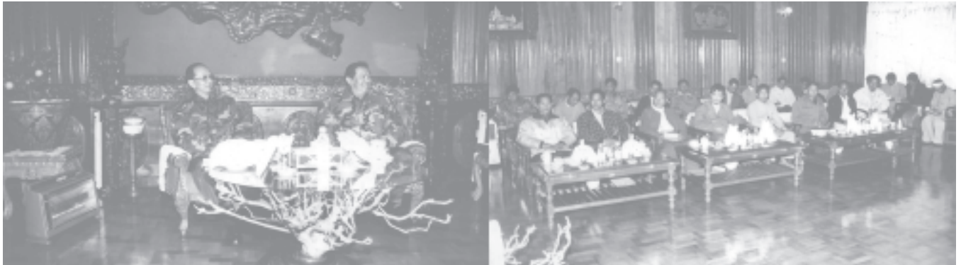
Secretary-1 of the State Peace and Development Council Lt-Gen Thein Sein holds discussions on regional development affairs with national race leaders of the peace groups in Taunggyi, Shan State (South).

colonialists, and for development of education, health, human resources and transport of the regions and the people.