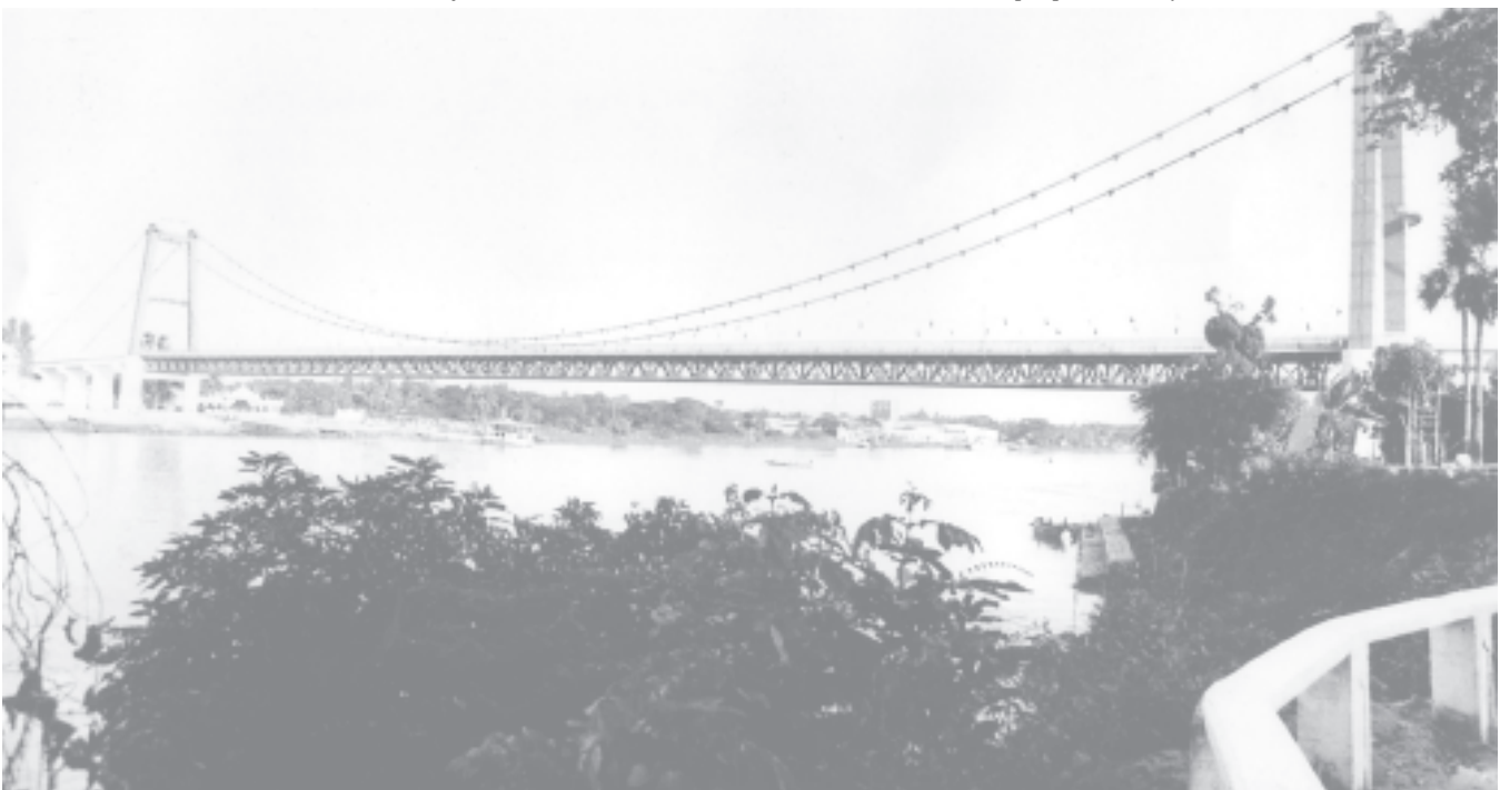
Pathein Bridge, a suspension one, across Ngawun River in Pathein, Ayeyawady Division.