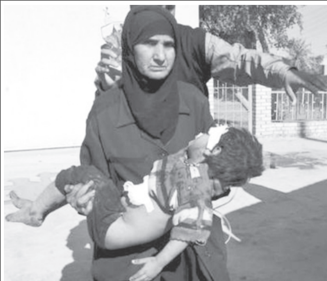
A nurse carries a wounded Iraqi boy who was injured in a car bomb attack, outside a hospital in Khan Bani Saad on 22 Nov, 2003.—INTERNET

flying by helicopter to Teesside Airport to board Air Force One backing to America. The protesters in Sedgefield shouted "Bush out", waving banners and posters bearing words describing Bush as "the world's No 1 terrorist".—MNA/Xinhua