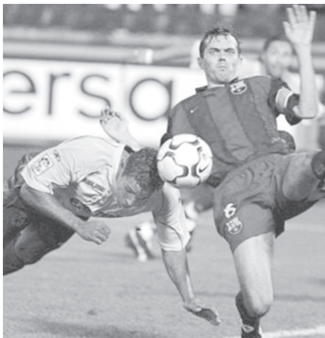
Villareal's Brazilian player Sonny Anderson, left, heads the ball beside Barcelona's Dutch player Phillip Cocu during a Spanish league soccer match in Villarreal's Madrigal stadium in Villarreal, Spain, on 22 Nov, 2003.