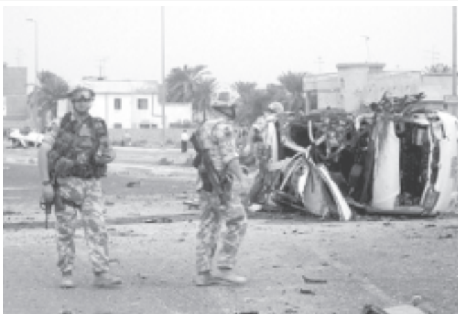
British soldiers patrol following a blast in Basra Saturday on 23 November.