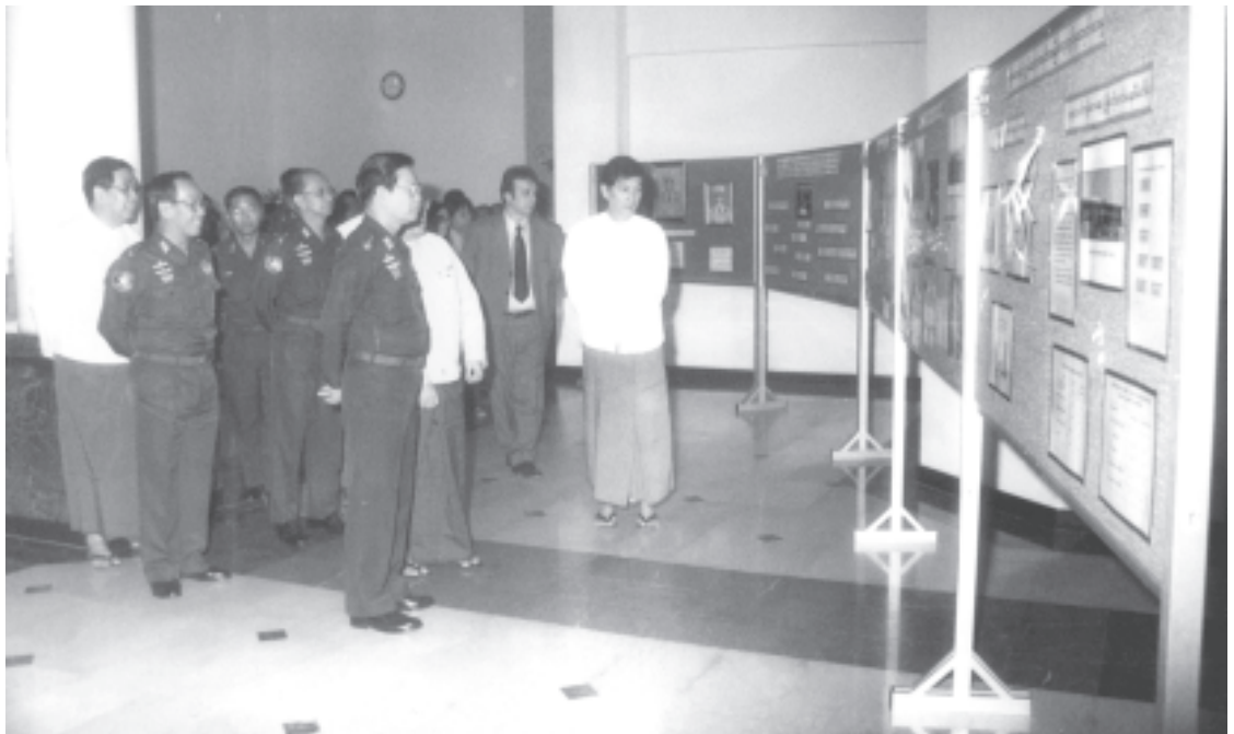
Chairman of the National Health Committee Prime Minister General Khin Nyunt views booths at the Sixth Seminar on Medical Studies held by Medical Science Department of the Ministry of Health.—MNA

In 2000, Myanmar orthopaedic surgeons could write a success story in the replantation of a left arm which was traumatically crushed at waist with the aid of modern microscopic lens. In a similar operation conducted in Novem-