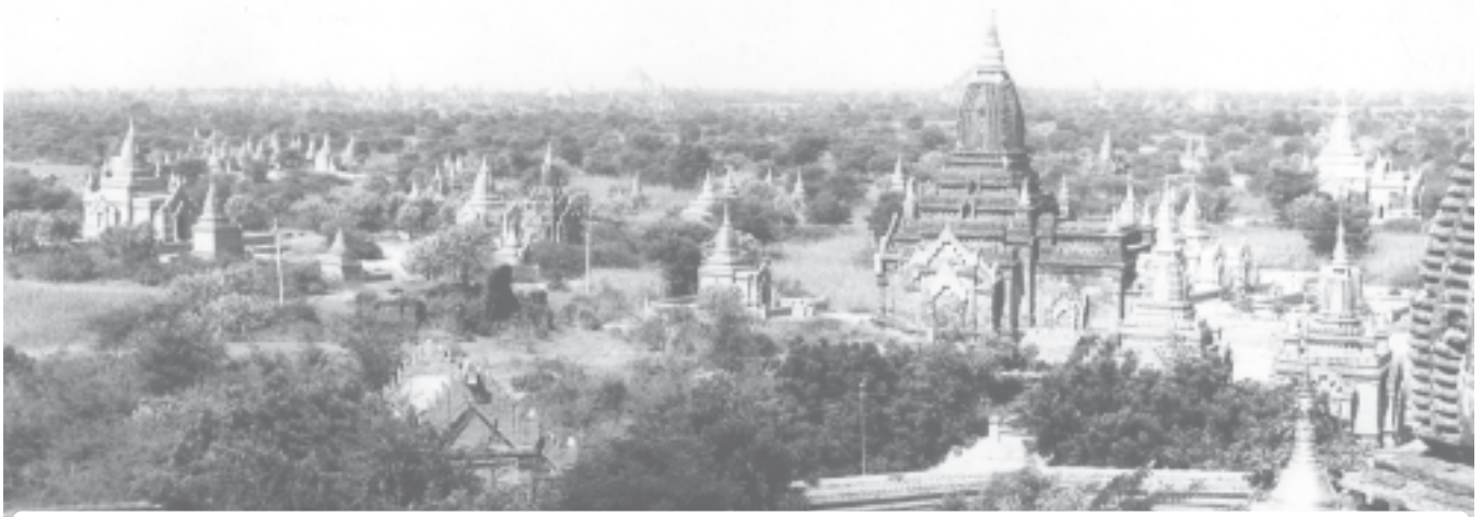
Bagan captures the heart of the entire national people and it is also the glory of the country. The government has taken all possible measures for the convenience of visitors at home and from abroad. The photo shows the scenic beauty of ancient Bagan.

Human resource development plays a key role in building a nation to become a modern one. With this concept, the government is building new universities and colleges across the country. The photo taken on 16 November 2003 shows the four-storey school building at Pyay University in Bago Division (West).