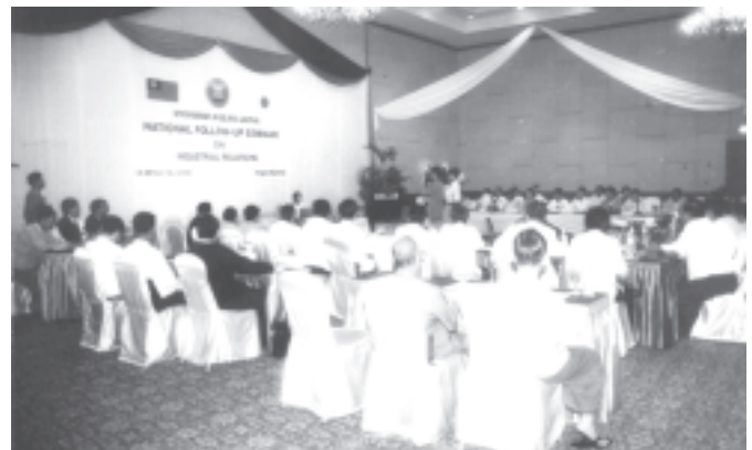
Myanmar/ASEAN/Japan Follow-up Seminar on Industrial Relations in progress. —

Present on the occasion were Deputy Minister for Labour Brig-Gen Win Sein, Deputy Minister for Industry-2 Lt-Col Khin Maung Kyaw, Deputy Chief Justice U Thein Soe, heads of department under the Ministry of Labour, officials of Japanese Embassy to Myanmar and the embassies of ASEAN member countries, experts from Japan, the representatives of the Union of Myanmar Federation of Chambers of Commerce and Industry, Myanmar Industrial