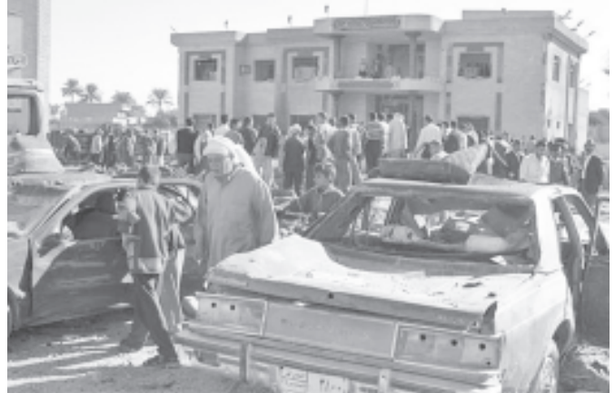
Iraqis inspect the damaged police station after it was attacked by a car bomb in Baqouba, about 40 miles (60 kilometres) northeast of Baghdad, Saturday, on 22 Nov, 2003. Suicide attackers detonated two vehicles Saturday at police stations in towns northeast of Baghdad, and at least 18 people were killed, US and Iraqi officials said.