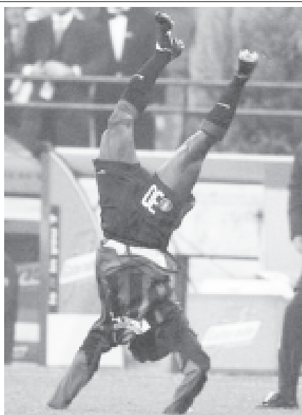
Inter Milan forward Obafemi Martins, of Nigeria, celebrates after scoring against Reggina during Italian Serie A major league soccer match between Inter and Reggina at the San Siro stadium in Milan, Italy, on 22 Nov, 2003.