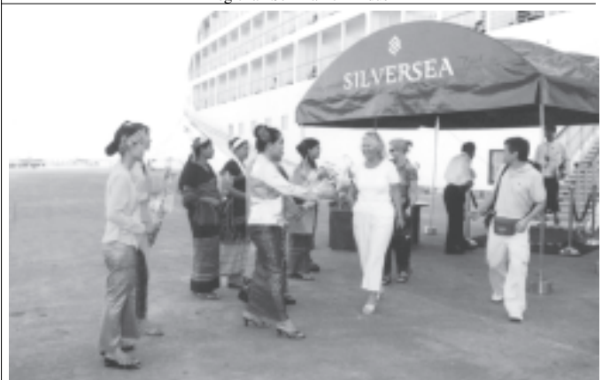
A vessel named Mv Silver Shadow carrying 131 tourists berthed at Myanmar International Thilawa Terminal on 22 November evening under the supervision of the Ministry of Hotels and Tourism, with the assistance of the Ministry of Transport and Myanmar Voyages International Tourism Co Ltd. They visited places of interest in and around Yangon and the vessel left the terminal on 24 November afternoon. —MNA

The first day's session of the seminar ended with the concluding remarks by the meeting chairman. The seminar continues tomorrow at the same venue.—MNA