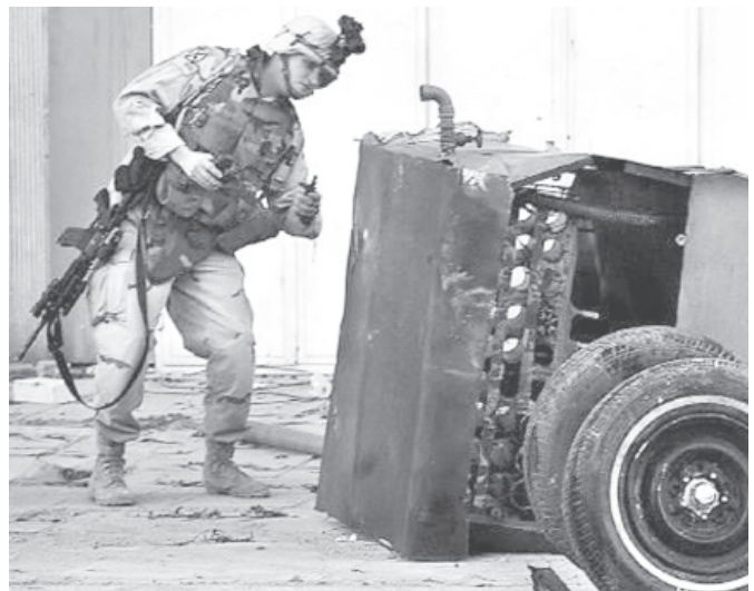
A US soldier inspects a launcher used in morning attacks in Baghdad on 21 November. Rockets slammed into the Iraqi oil ministry and two central Baghdad hotels used by western contractors and journalists, wounding several people.