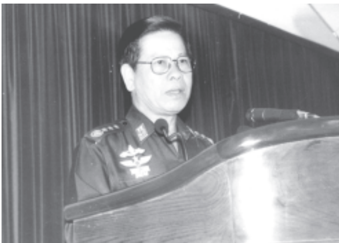
Chairman of the National Health Committee Prime Minister General Khin Nyunt makes an address at the opening ceremony of the Sixth Seminar on Medical Studies.

Four social objectives * Uplift of the morale and morality of the entire nation * Uplift of national prestige and integrity and preservation and safeguarding of cultural heritage and national character * Uplift of dynamism of patriotic spirit * Uplift of health, fitness and education standards of the entire nation