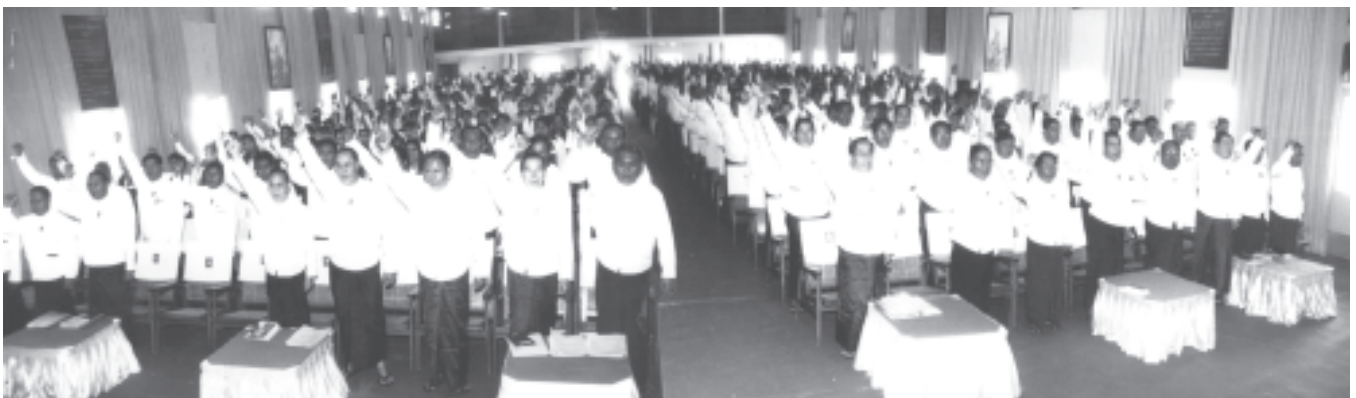
USDA delegates chant slogans at the third and final day of the Annual General Meeting 2003 of USDA.