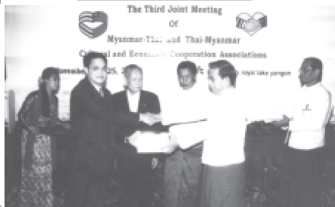
Deputy Minister for Education U Myo Nyunt accepts cash donated by wellwishers to mark Myanmar-Thai and Thai-Myanmar CECA.—MNA