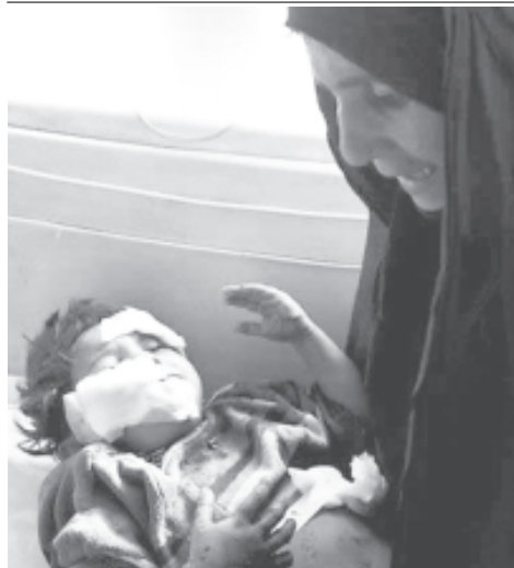
The mother of an Iraqi boy wounded in a car bomb attack cries over her son in Khan Bani Saad on 22 November, 2003. Suicide bombers blew up cars packed with explosives outside two police stations north of Baghdad, killing at least 18 people in the latest deadly strikes on Iraq's US-backed police force.