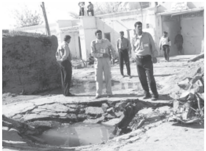
Iraqi police stand next to a crater where a car bomb exploded in Khan Bani Saad, a market town on the northeastern outskirts of Baghdad, Saturday on 22 Nov, 2003.