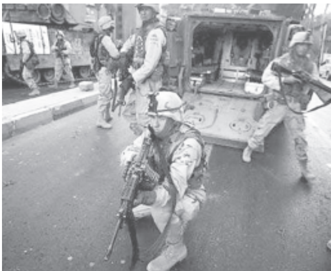
US soldiers at the site of attacks at the centre of Baghdad on 21 November.