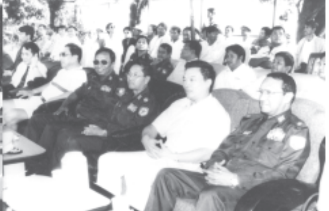
Commander Maj-Gen Myint Swe watches Myanmar-China tennis friendly at Theinbyu tennis court.