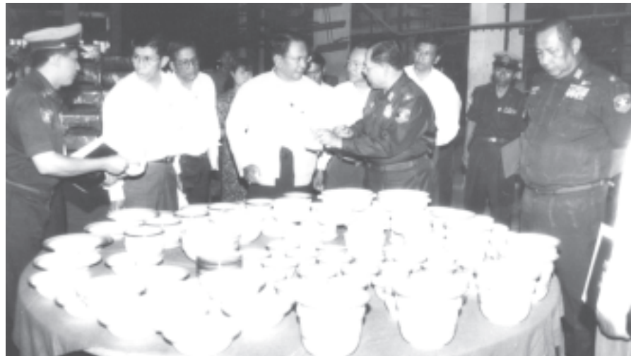
Minister for Industry-1 U Aung Thaung inspects production tasks of No 1 Enamel Ware Factory, Mayangon Township.—MNA

With the assistance of Forever Group, salient points of the show are put on Internet.—MNA