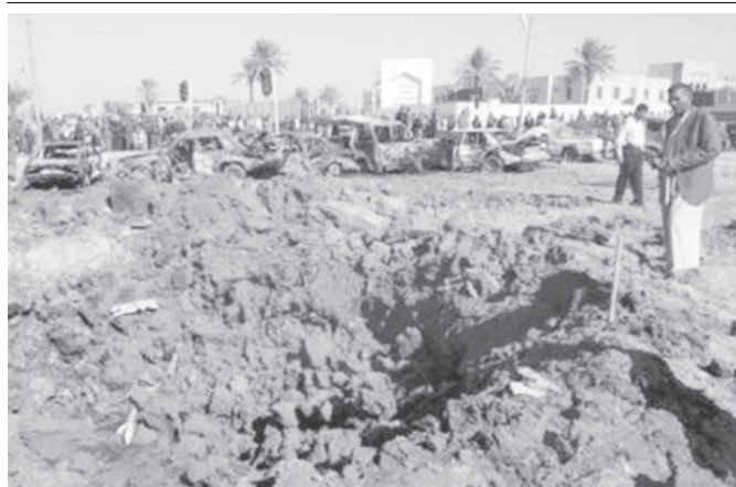
Iraqi man looks at a crater made by a car bomb outside a police station after an attack in Baquba, some 60 km (37 miles) northeast of Baghdad on 22 Nov, 2003. Suicide bombers blew up cars packed with explosives outside two police stations north of Baghdad on Saturday, killing at least 15 people in the latest deadly strikes on Iraq's US-backed police force.