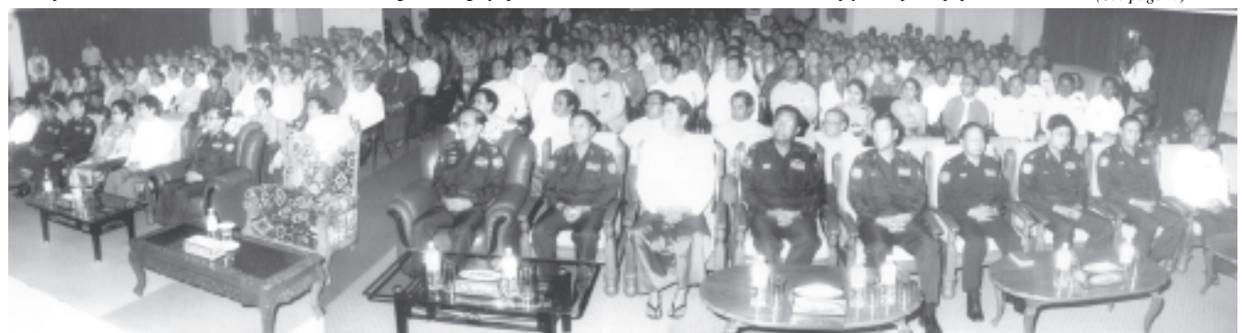
Dignitaries attending the opening ceremony of the Sixth Seminar on Medical Studies.

He said holding of the seminar together with medical scientists and teaching