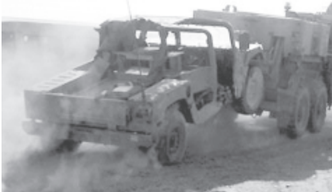
Three US soldiers killed in Iraq and civilian flights banned.