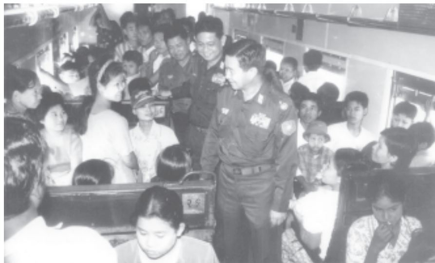
Minister for Rail Transportation Maj-Gen Aung Min and members have a cordial conversation with local people on the first trip.

We, staff of Myanmar Alin daily, interviewed some travellers on the train on the opening day of the railroad. An elderly woman of about 50 of Ahmuhtan Ward in Thanlyin