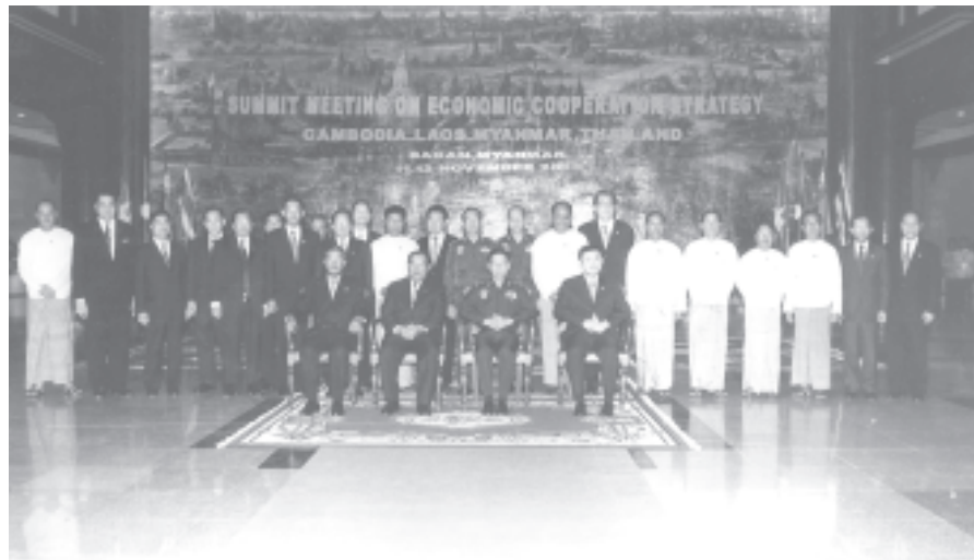
Prime Ministers of Cambodia, Laos, Myanmar and Thailand and members pose for documentary photo at the Summit Meeting on Economic Cooperation Strategy on 12 November.

We believe that the friendly discussions at the summit were very fruitful and they will contribute a lot to the regional cooperation for economic growth of the region.