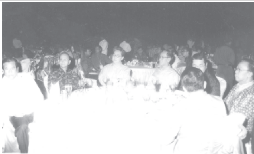
Secretary-1 Lt-Gen Soe Win and Secretary-2 Lt-Gen Thein Sein attend the dinner hosted in honour of Cambodian Prime Minister Mr Samdech Hun Sen, Lao Prime Minister Mr Boungnang Vorachith and Thai Prime Minister Dr Thaksin Shinawatra and delegates to the Summit by Prime Minister General Khin Nyunt.