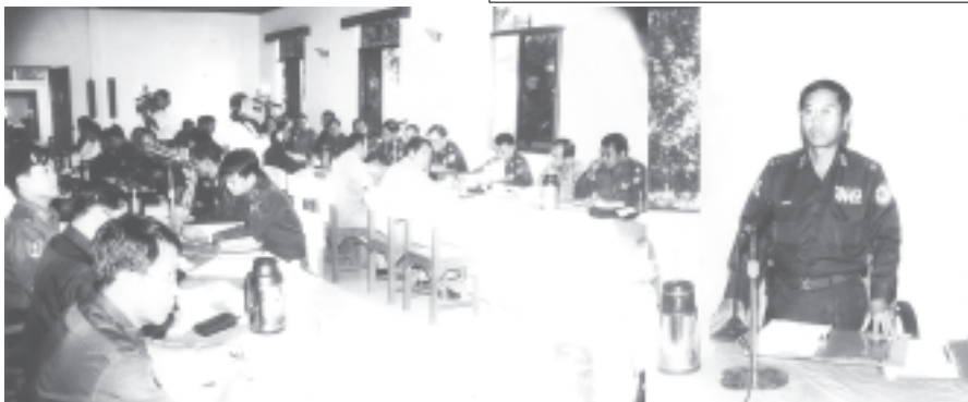
Commander Maj-Gen Myint Swe addresses the first meeting of the Management Committee for observing the 59th Anniversary Armed Forces Day (2004). — MNA

On 7 November, he awarded prizes to the winner artists of Kayah State who participated in the 11th Myanmar Traditional Cultural Performing Arts Competitions. — MNA