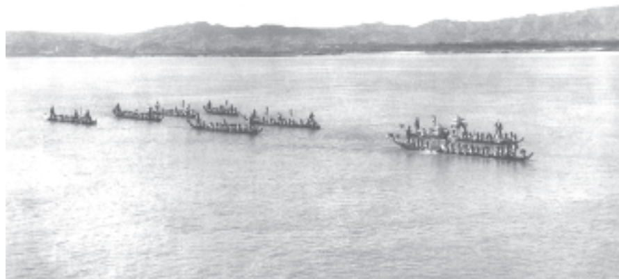
Royal barge procession of Bagan era displayed at luncheon hosted in honour of Cambodian Prime Minister Mr Samdech Hun Sen, Laotian Prime Minister Mr Boungnang Vorachith and Thai Prime Minister Dr Thaksin Shinawatra and delegates to the summit by Prime Minister General Khin Nyunt.