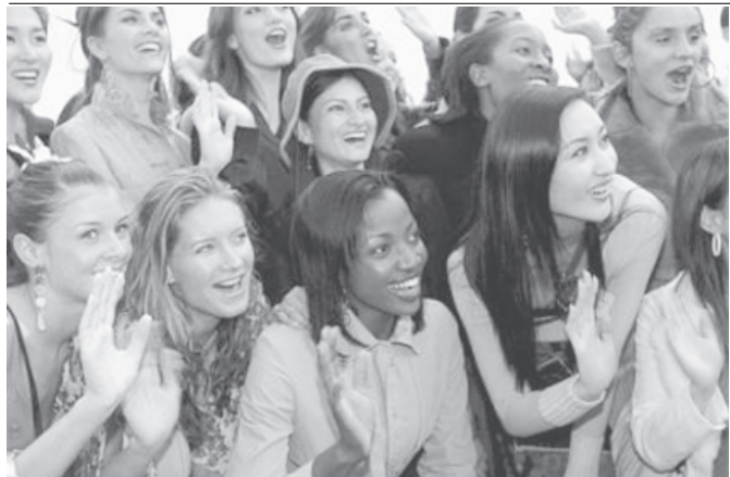
Miss World contestants pose for a picture at Hong Kong's Victoria Peak observation point over the city on Monday, 10 Nov, 2003. Some 110 contestants have kicked off the first leg of the 53rd Miss World Beauty Pageant, which will be held in different parts of China with the finals scheduled to take place on 6 Dec, in the southern Chinese resort city of Sanya.

"Great Yang Liwei", "Hero Yang Liwei", the crowd yelled and pushed forward after having been waiting in the chilly wind for two hours. Every move Yang made at the airport brought the planned welcoming dance squad to change accordingly. —MNA/Xinhua