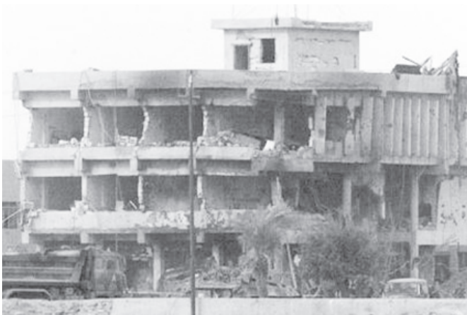
The Italian Carabinieri base in the southern Iraqi town of Nassiriya lies destroyed by a car bomb on 12 Nov, 2003. —INTERNET

Hakim said militants were taking advantage of the lack of proper controls on Iraq's vast borders with its neighbours, including Saudi Arabia. — MNA/Reuters