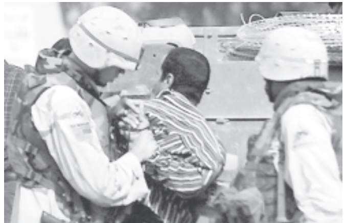
A US soldier arrests an Iraqi man in an area that was sealed off in Baghdad, as US troops searched for improvised explosive devices. The reason of the arrest was unknown.

Arab countries have refrained from sending troops to Iraq, fearing that such a move would amount to the recognition of the US occupation of Iraq.