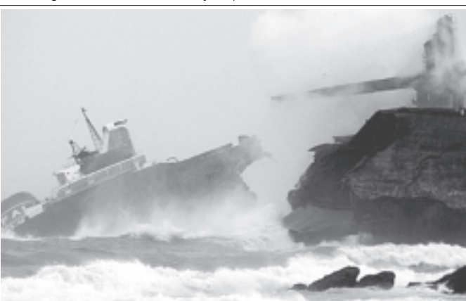
A Georgian freighter ran aground in bad weather and split into two off the coast of Anadolujeneri in Istanbul, Turkey, on Tuesday. The 25 personnel on board were rescued before the freighter began sinking. Some of the freighter’s fuel leaked into the sea but did not pose any serious danger to the environment. —INTERNET