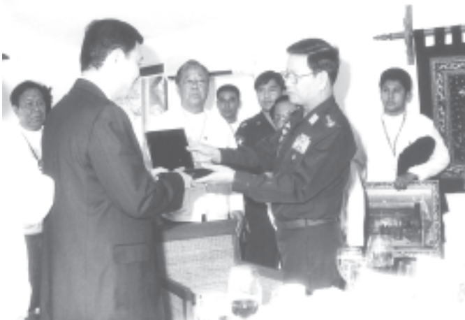
Prime Minister General Khin Nyunt presents photo albums and VCDs to Thai Prime Minister Dr Thaksin Shinawatra.