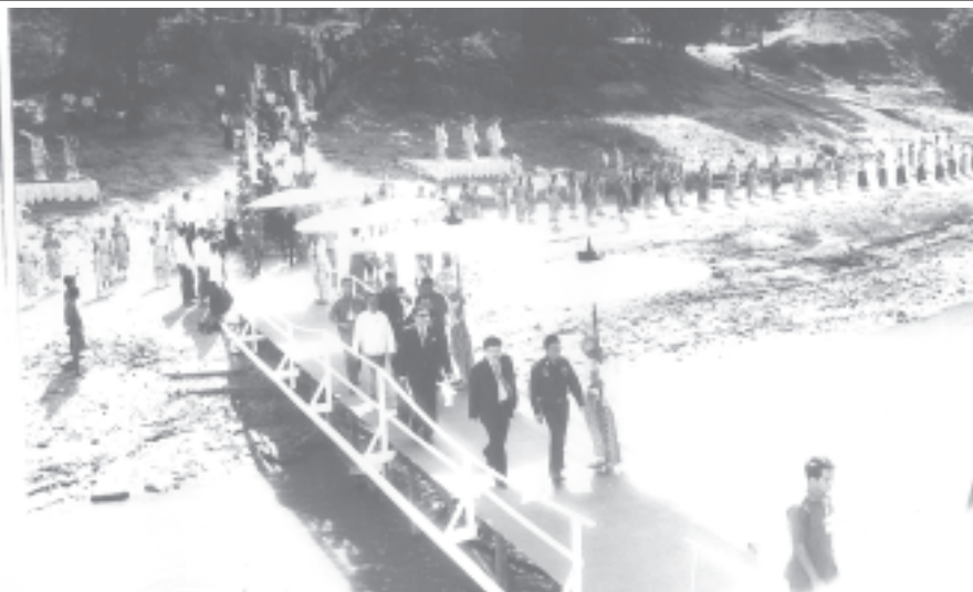
Cambodian Prime Minister Mr Samdech Hun Sen, Laotian Prime Minister Mr Boungnang Vorachith and Thai Prime Minister Dr Thaksin Shinawatra and delegates to the Summit Meeting on Economic Cooperation Strategy being welcomed by local people in Bagan era attires at the luncheon hosted in their honour by Prime Minister General Khin Nyunt. (News page 1)