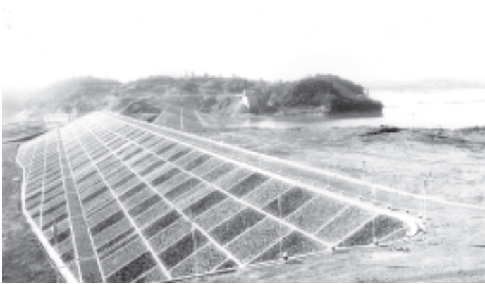
Prime Minister General Khin Nyunt inspects construction of Mone Creek Multi-purpose Dam Project in Sedoktara Township, Magway Division.