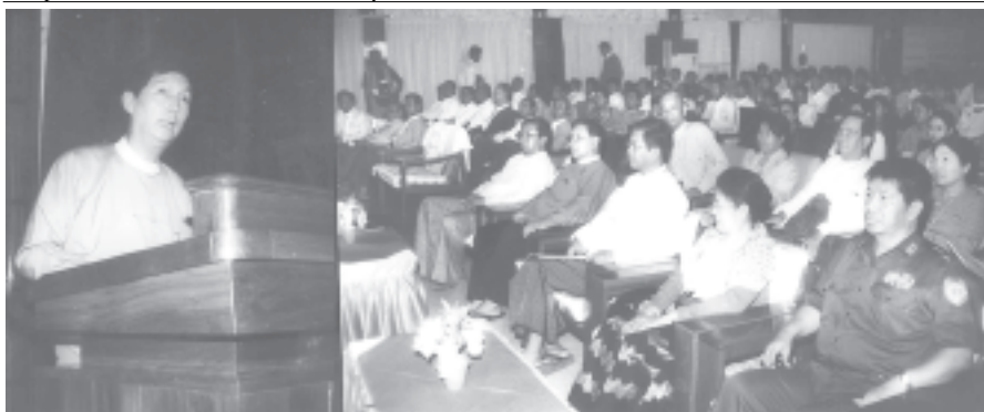
Minister for Health Dr Kyaw Myint addresses the opening ceremony of 15th Eye Surgeons' Conference. — MNA

north of Yangon Seismological Observatory was recorded at 08 hrs 29 min 22 sec MST today. — MNA