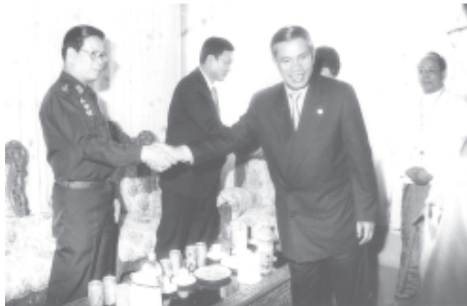
Prime Minister General Khin Nyunt bids farewell to Cambodian Prime Minister Mr Samdech Hun Sen at Bagan-Nyaung U Airport before his departure home on 12 November.