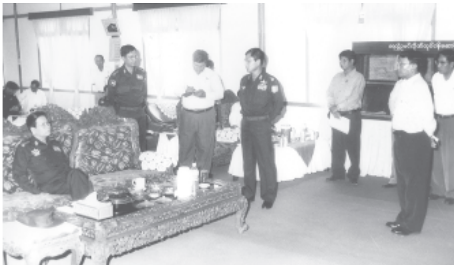
Prime Minister General Khin Nyunt gives instructions to officials of Mone Creek Multi-purpose Dam Project and hydel power project at the briefing hall of the project in Sedoktara Township. (News on page 16)