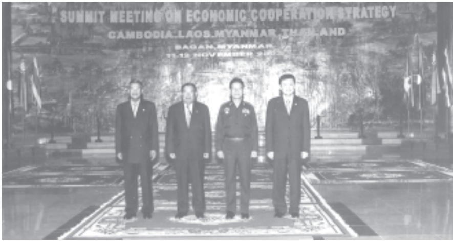
Cambodian Prime Minister Mr Samdech Hun Sen, Laotian Prime Minister Mr Boungnang Vorachith, Prime Minister of Myanmar General Khin Nyunt and Thai Prime Minister Dr Thaksin Shinawatra pose for a documentary photo.