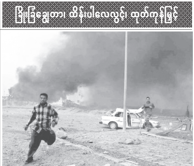
People run away from the site of a bomb blast in Nassiriya, about 290kms (180 miles) south of Baghdad on Wednesday. A car bomb ripped through an Italian military police base in the town.