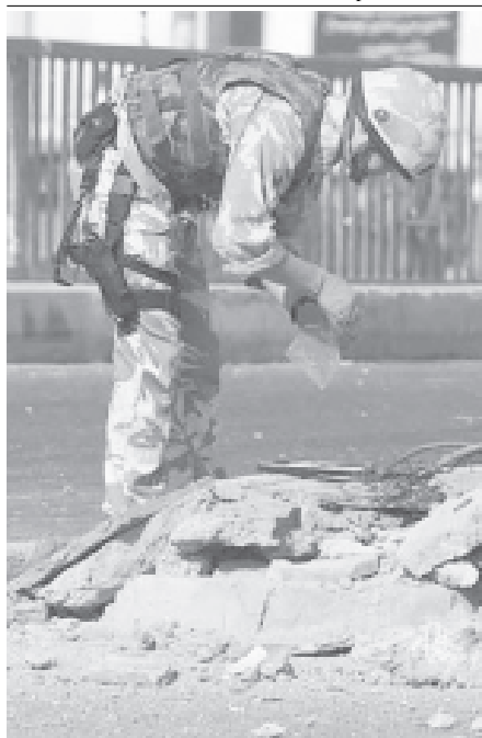
A file photo shows a British soldier collecting pieces of forensics evidence at the site of a roadside bombing in the southern Iraqi city of Basra on Sunday.

Officers also say foreign Islamic militants have been involved. Sanchez said the military had detained up to 20 people they suspected were members of al-Qaeda but had not yet been able to prove they belonged to Osama bin Laden’s group. —MNA/Reuters