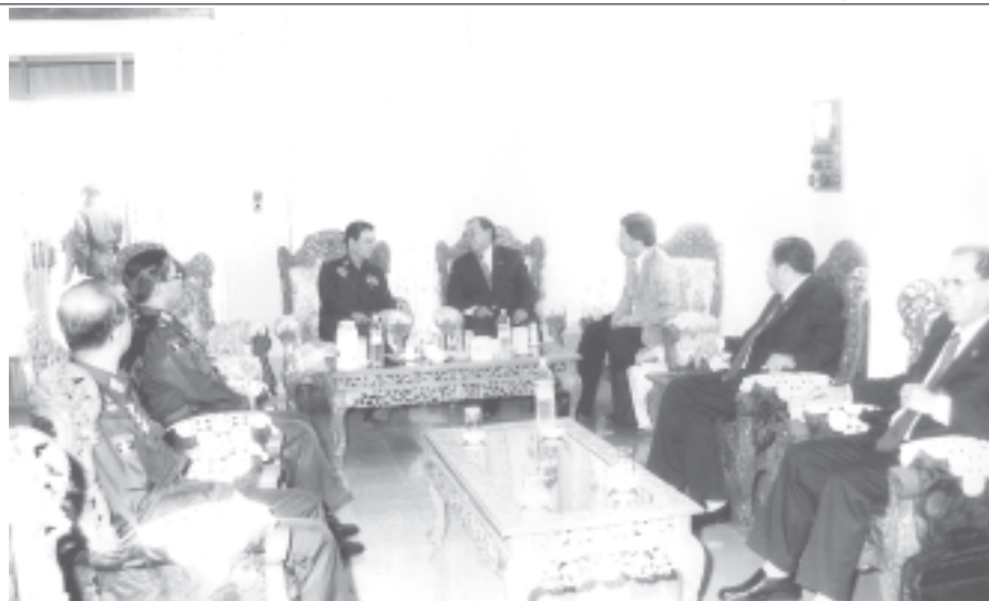
Prime Minister General Khin Nyunt meets Laotian Prime Minister Mr Boungnang Vorachith at Bagan-Nyaung U Airport before his departure home.