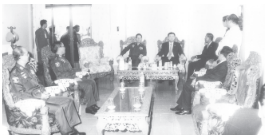
Prime Minister General Khin Nyunt meets Prime Minister of Thailand Dr Thaksin Shinawatra before his departure for Thailand on 12 November.