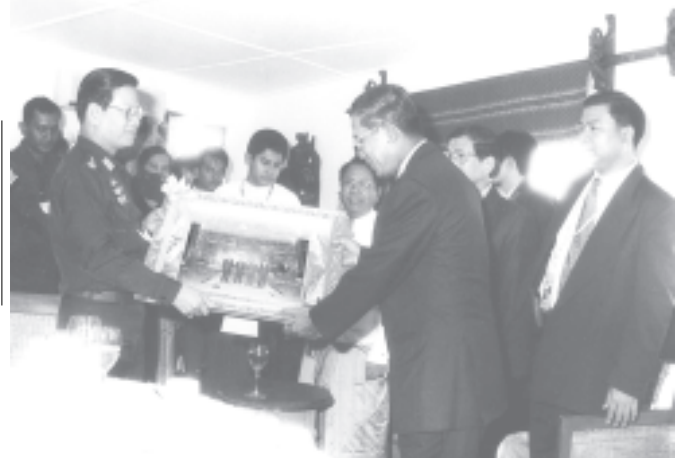
Prime Minister General Khin Nyunt presents photo albums and VCDs to Cambodian Prime Minister Mr Samdech Hun Sen.

Myat Yadana, Shwe Keinnari-2 and Pandaw-2 watercrafts in River Ayeyawady in honour of Cambodian Prime Minister Mr Samdech Hun Sen, Laotian Prime Minister Mr Boungnang Vorachith and Thai Prime Minister Dr Thaksin Shinawatra and their entourage who attended the Summit Meeting on Economic Cooperation Strategy of Cambodia-Laos-Myanmar-Thailand held in Bagan Archaeological Region in Mandalay Division.