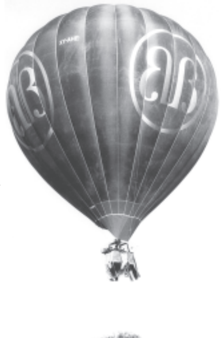
Balloons commemorating Summit Meeting on Economic Cooperation Strategy decorated with the flags of Cambodia, Laos, Myanmar and Thailand on 12 November.