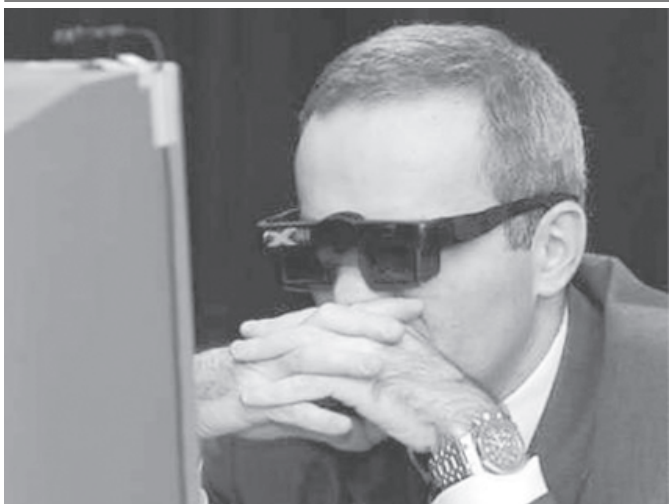
Chess champion Garry Kasparov looks at a computer monitor through 3D early in the first game of his match—the X3D Fritz computer—on 11 November, 2003 in New York. The World No 1 chess player was held to a draw on Tuesday in the first game of his latest match against a computer and admitted having difficulty with the programme's virtual reality component. Kasparov and the programmers of 'X3D Fritz' agreed to a draw on the 37th move after three hours and 20 minutes of play in a hard-fought game in which Kasparov won a powerful rook in exchange for a bishop and a pawn in the middlegame, but could not convert that slight material advantage into a victory.