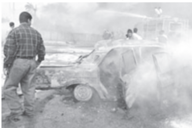
A burned out car is seen near Italy's paramilitary headquarters after an explosion in Nassiriya, southern Iraq. —INTERNET

The Italian deaths were the first among non-British members of the southern multinational force in hostile fire. — Internet