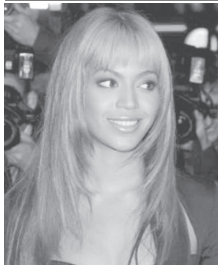
US R&B singer Beyonce Knowles (news) arrives at the UK charity premiere of the comedy film, "The Fighting Temptations," in which she stars, at the Empire Leicester Square, London, on 12 November, 2003.