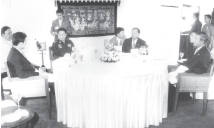
Prime Minister General Khin Nyunt hosts luncheon in honour of foreign counterparts in Bagan.