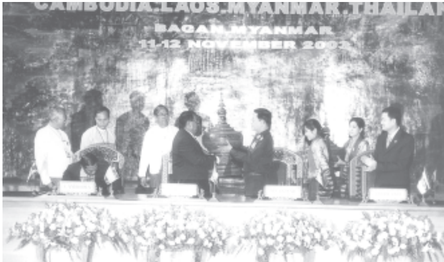
After the Summit Meeting on Economic Cooperation Strategy, Prime Minister General Khin Nyunt presents souvenir to Laotian Prime Minister Mr Boungnang Vorachith on 12 November.