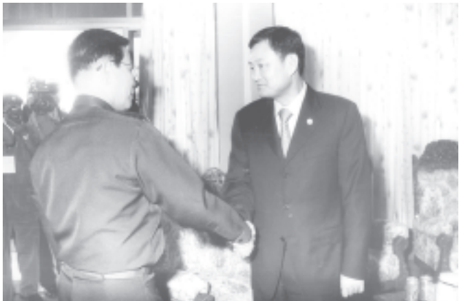
Prime Minister General Khin Nyunt bids farewell to Thai Prime Minister Dr Thaksin Shinawatra at Bagan-Nyaung U Airport before his departure home on 12 November.