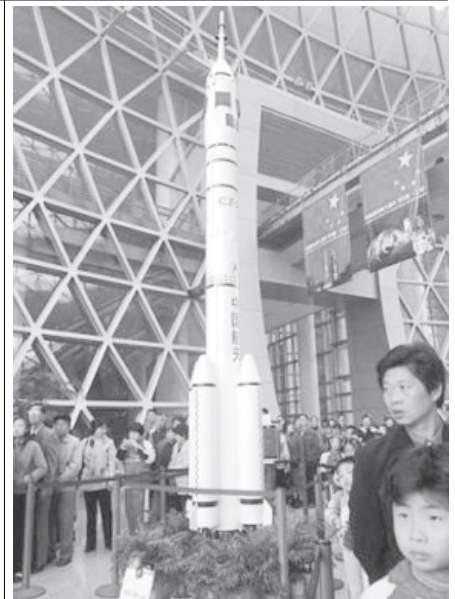
Visitors look at a scale model of the Long March rocket that carried China's first astronaut Yang Liwei into space at Shanghai Science and Technology Museum on Wednesday, 12 Nov, 2003 in Shanghai, China. The exhibition runs for two days and more than 130,000 people visited on the first day, the organizers said.