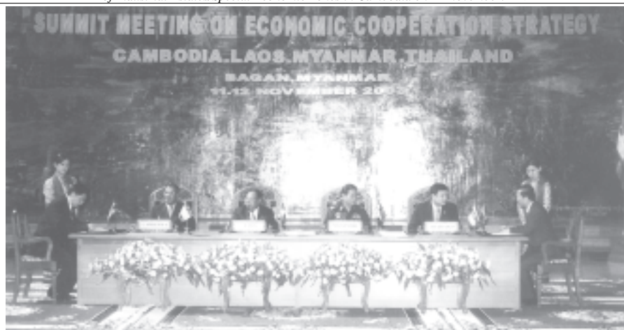
In the presence of Prime Ministers of Cambodia, Laos, Myanmar and Thailand, Deputy Foreign Minister of LPDR Mr Bounkeut Sang Somask and Deputy Foreign Minister of Thailand Dr Sorajak Kasemsuvan sign joint statement on energy cooperation strategy after the summit on 12 November.