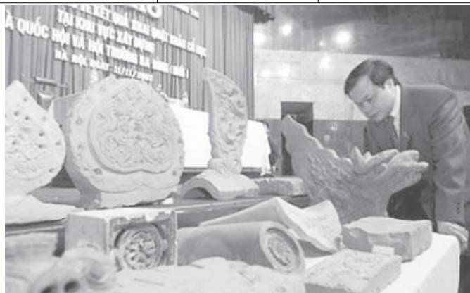
Vietnamese Culture and Information Minister Pham Quang Nghi looks at a selection of artifacts that were found while excavating a site for Vietnam's new parliament building in Hanoi, on 11 November, 2003. Vietnam's ruling Communist Party has delayed the construction of the building after workers unearthed millions of artifacts dating from the seventh century. —INTERNET

Thailand. The airline, expected to start operation at the end of this year or early next year, had won licence to operate flight services to Bangkok, Chiang Mai, Phuket and Nakhon Ratchasima, newspaper The Nation quoted a Transport Ministry source as saying. —MNA/Xinhua