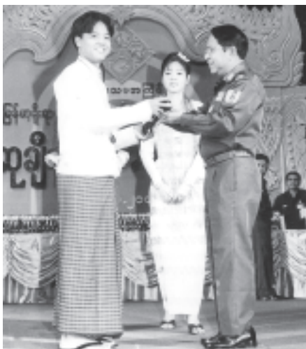
Minister for Information Brig-Gen Kyaw Hsan presents a prize to a winner at the 11th Myanmar Traditional Cultural Performing Arts Competitions.