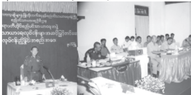
Minister for PBANRDA Col Thein Nyunt delivers a speech at the coordination meeting for upgrading tasks of development tasks.