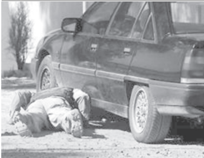
A US soldier searches for explosives under a car during clashes in Baghdad's suburb of Abu Gharib Sunday.

A US military spokesman could not confirm if all the casualties were American soldiers but US officials said they most likely were. The latest deaths brought to 138 the number of US soldiers killed by hostile fire in Iraq since US President George W Bush declared the major combat over on 1 May.