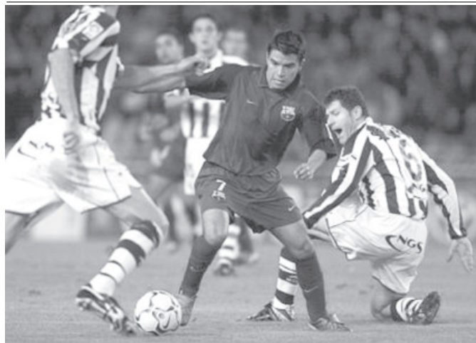
Barcelona's Argentine player Javier Saviola, center, tries to dribble the ball between Real Sociedad's Argentine player Gabriel Schurrer, right, and another unidentified player during the Spanish league soccer match in San Sebastian, Spain, on Sunday, 2 November, 2003. The match ended a 3-3 draw.