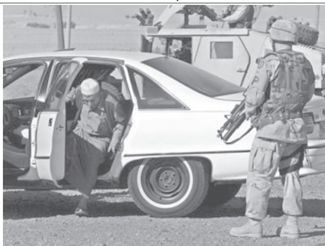
A US Army soldier from the 720th Military Police Battalion, right, waits as an elderly Iraqi man gets out of a car before searching the vehicle on Highway 1 outside of Tikrit, 193 km (120 miles) north of Baghdad, Iraq, on Monday, 3 November, 2003.