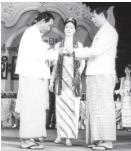
Minister for National Planning and Economic Development U Soe Tha presents a prize to a winner at the 11th Myanmar Traditional Cultural Performing Arts Competitions. —MNA