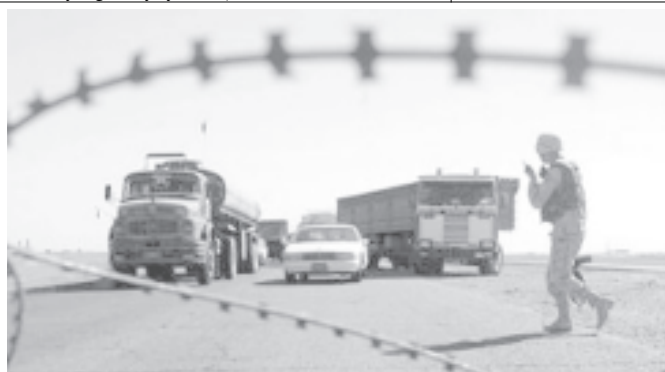
A US Army soldier from the 720th Military Police Battalion blocks Highway 1, Iraq's main north-south thoroughfare, outside of Tikrit, 193 km (120 miles) north of Baghdad, Iraq, on Monday, 3 November, 2003. The battalion, assisted by Iraqi police was searching for contraband weapons that could be used by guerillas, a routine operation that has taken on added urgency since insurgents shot down a Chinook helicopter with a missile, killing 16 soldiers and wounding 21 others.