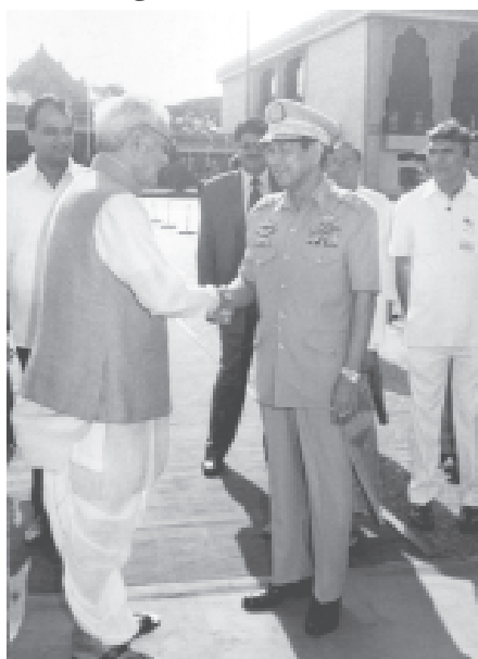
Vice-Chairman of the State Peace and Development Council Vice-Senior General Maung Aye cordially greets visiting Indian Vice-President Mr Bhairon Singh Shekhawat prior to his departure for Bagan-NyaungU by Special Aircraft at Yangon International Airport.