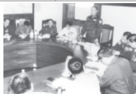
Chairman of Yangon City Development Committee Mayor Brig-Gen Aung Thein Lin gives instructions on future tasks of production department to officials of department at No 1 meeting hall of the City Hall on 4 November.