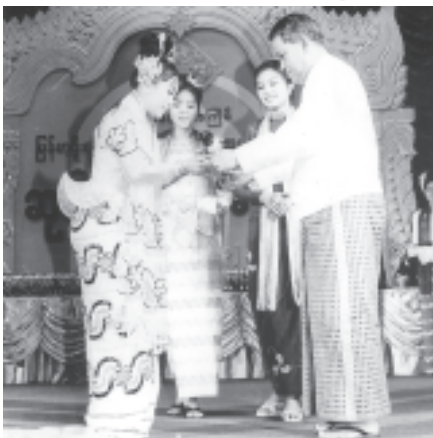
Minister for Education U Than Aung presents a prize to a winner at the 11th Myanmar Traditional Cultural Performing Arts Competitions.