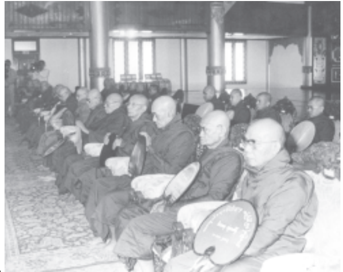
Sayadaws attending the 14th Kathina robes offering ceremony of families of Military Intelligence of Defence Services.