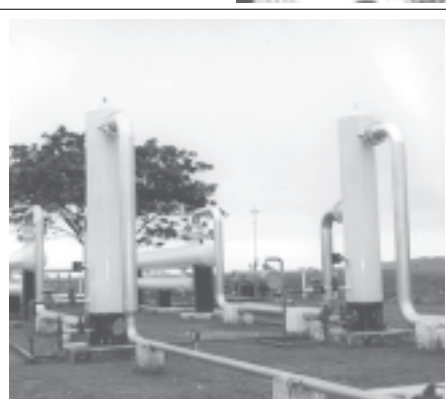
Natural gas and condensate coming out from No 20 well seen at Nyaungdon oil and gas field.