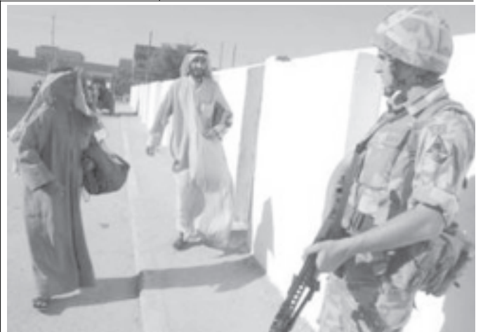
Two Iraqi Shi'ite tribesmen pass a British soldier from the 1st Battalion of the King's Regiment, on patrol in Basra southern Iraq, on 2 November, 2003. Shi'ites, like all Muslims, are observing the holy fasting month of Ramadan.