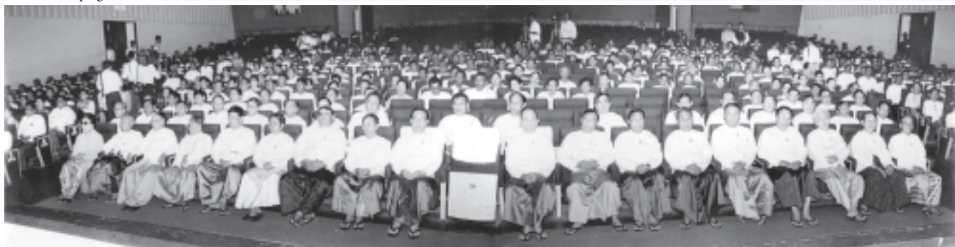
Dignitaries attending the prize presentation ceremony of the 11th Myanmar Traditional Cultural Performing Arts Competitions.