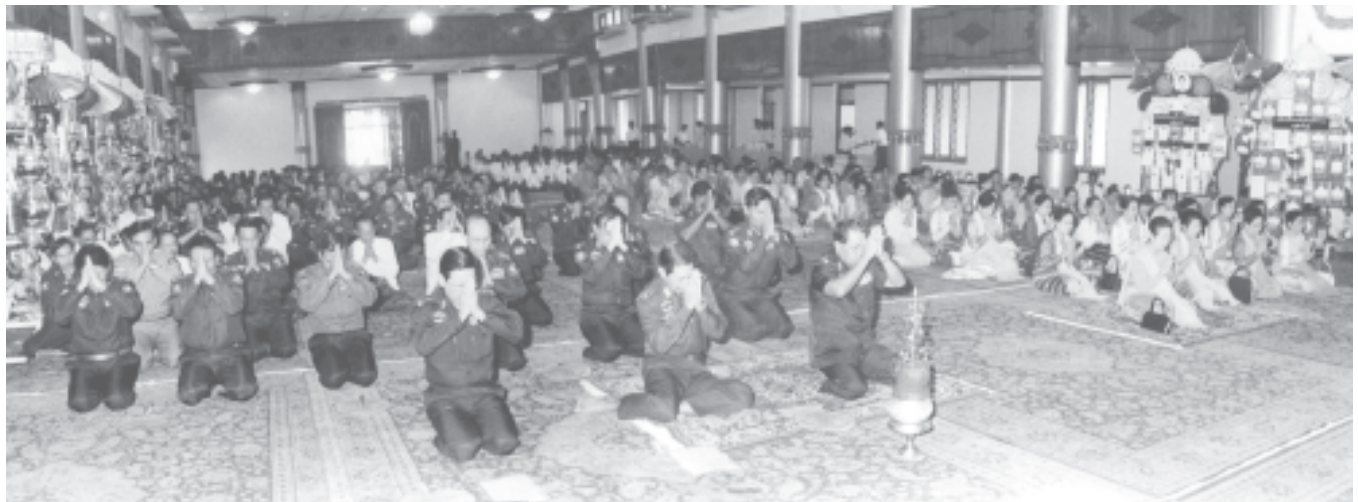
Senior General Than Shwe and wife Daw Kyaing Kyaing and party receive the Five Precepts from Sayadaws at 14th Kathina robes offering ceremony of families of Military Intelligence of Defence Services.