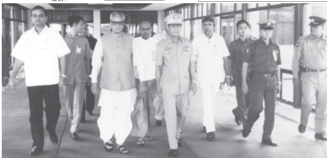
State Peace and Development Council Vice-Chairman Vice-Senior General Maung Aye bids farewell to visiting Indian Vice-President Mr Bhairon Singh Shekhawat on the latter's departure for Bagan-NyaungU by Special Aircraft at Yangon International Airport.