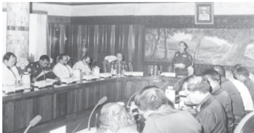
Secretary-1 Lt-Gen Soe Win delivers a speech at the 56th Anniversary Independence Day COC meeting.