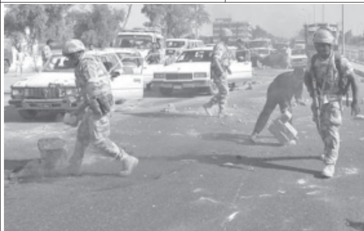
British soldiers remove stones from a street in the centre of Basra, southern Iraq, on Tuesday, 4 Nov, 2003 after Iraqi street cleaners demonstrated, demanding their salaries which were not paid over the past two months. INTERNET