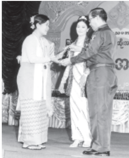
Secretary-1 Lt-Gen Soe Win presents a prize to a winner at the 11th Myanmar Traditional Cultural Performing Arts Competitions.