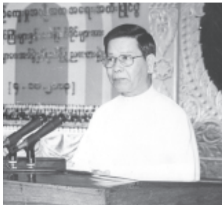
Prime Minister General Khin Nyunt makes a speech at the ceremony to honour doyen artistes and judges.

He said national cultural traditions and customs, national way of thinking, national norms and social values and national cultural arts