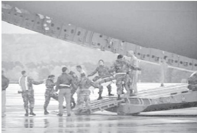
An injured soldier is brought out of a plane on a stretcher at Ramstein Air Base in Germany on Monday 3 November, 2003 in this image from television. About 20 US soldiers wounded in Sunday's Chinook helicopter attack in Iraq arrived at Ramstein where they will be taken to the nearby Landstuhl Medical Centre for treatment.

"Since 'Iraqi Freedom' started the DOD said we are going to enforce the policy. For the past year we haven't done any (media coverage) on remains."