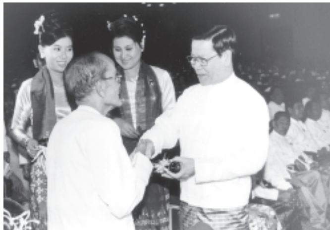
Prime Minister presents a certificate of honour to a doyen artist at the 11th Myanmar Traditional Cultural Performing Arts Competitions.