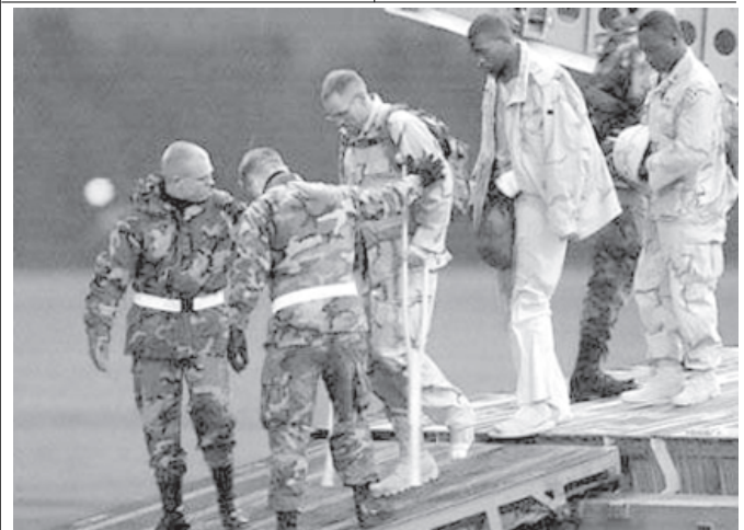
US Air Force medical personnel assist wounded US soldiers walking out of a C-17 transport aircraft at Ramstein air base in southwestern Germany, on 3 November, 2003. The soldiers were injured when a US Chinook helicopter was shot down near Falluja in central Iraq on Sunday, killing 16 and wounding 21 troops.