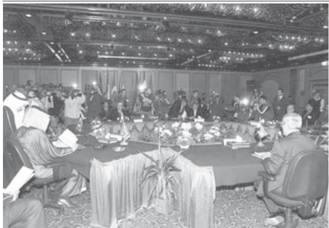
A general view of the meeting room where the foreign ministers of Iraq's neighbours were holding their final meeting in Damascus on Sunday, 2 Nov, 2003. The two-day meeting which started on Saturday aims to discuss the impacts on them of the US-led war on Iraq. — INTERNET

In a related development, the Hong Kong Hospital Authority announced earlier this month that it is prepared to open Chinese medicine clinics in three public hospitals. — MNA/Xinhua