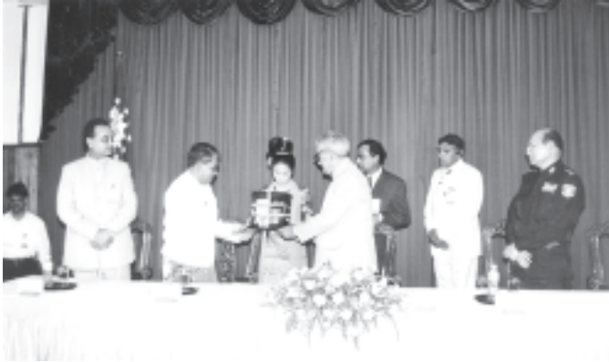
UMFCCI hosts a luncheon in honour of the Vice-President of the Republic of India and party.