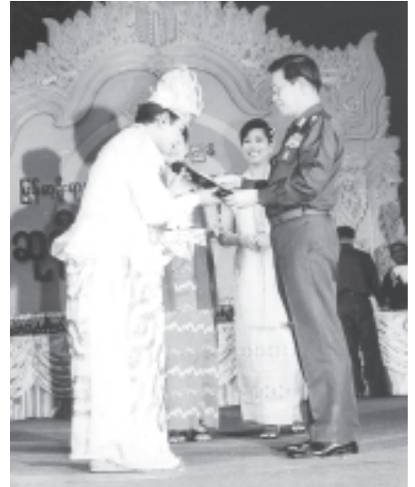
Prime Minister General Khin Nyunt presents a prize to a winner at the 11th Myanmar Traditional Cultural Performing Arts Competitions.

However, as there still exists the danger of penetration and dominations of alien ways that come through political, economic and cultural doors through abuse of advances in science and technology, I would like to urge all maesters and new generation young artistes to keep up efforts for further growth of Myanmar ways, Myanmar styles and