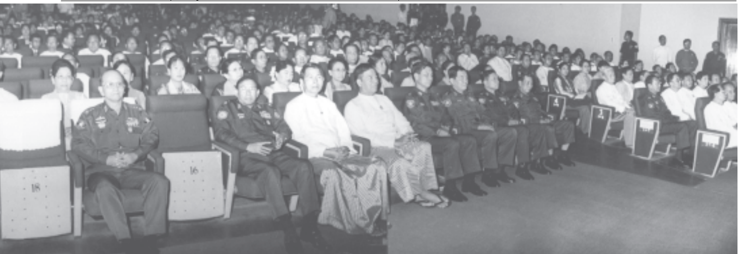
Dignitaries and guests seen attending the ceremony to present prizes to the winners in the 11th Myanmar Traditional Cultural Performing Arts Competitions.