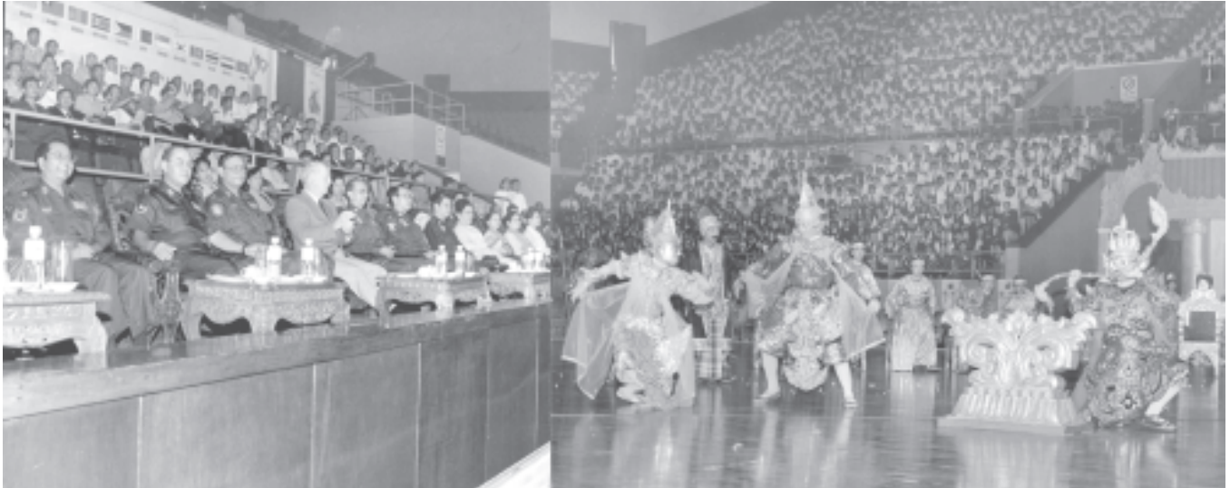
Prime Minister General Khin Nyunt enjoys drama of Yama's bending a bow presented by Ministry of Culture at the opening ceremony of 13th Asian Archery Championships and Continental Qualification for 2004 Athens Olympic held in National Indoor Stadium-1 (Thuwunna).