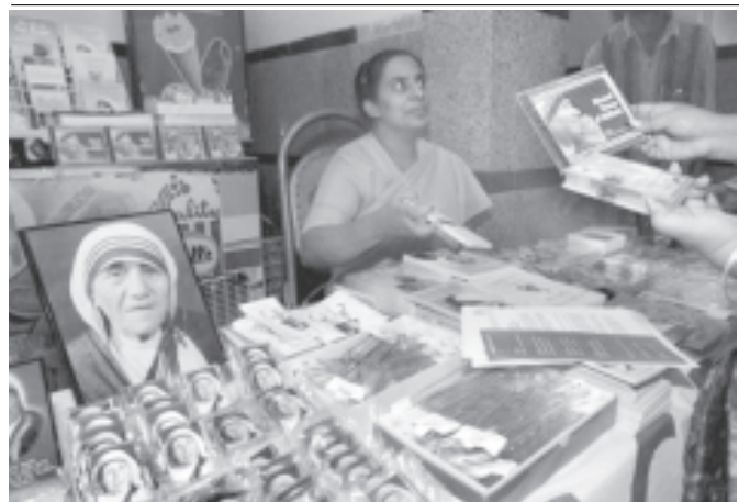
A nun sells products featuring Mother Teresa at a sale counter of the "Mother Teresa International Film Festival" in Calcutta. Ten movies about Mother Teresa will be screened during the nine day-long festival.