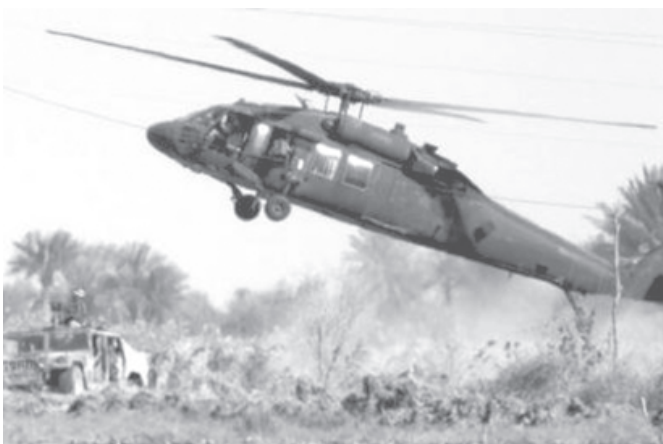
A US Army Blackhawk helicopter lifts off as troops search a crash site where a Chinook helicopter crashed into a field near the restive town of Falluja on 2 November, 2003. At least 15 US personnel were killed and 21 wounded when an American Chinook helicopter crashed in Iraq on Sunday, a US military spokesman said.