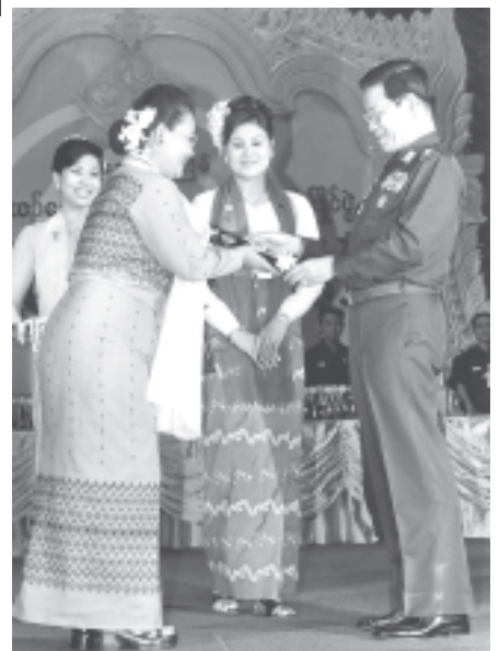
Prime Minister General Khin Nyunt presents a prize to a winner at the 11th Myanmar Traditional Cultural Performing Arts Competitions.