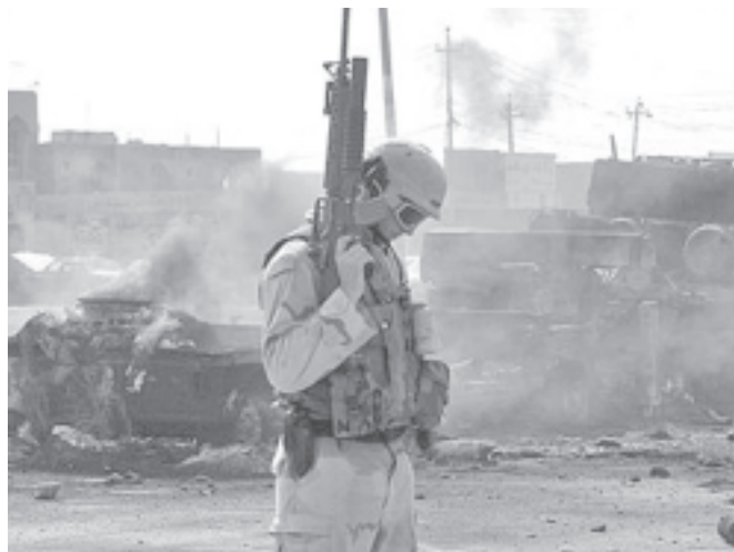
A US Army soldier guards the remains of a burned out military ammunition truck after it was attacked in Fallujah, Iraq, late on October, 2003, 35 miles (60 kms) west of Baghdad.