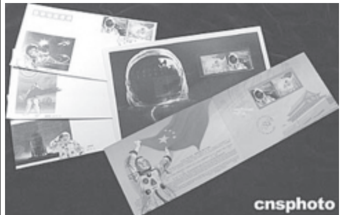
China issues stamps to mark the successful manned space mission.

Ulukalala expressed his belief that the friendly relations and cooperation between China and Tonga would develop even further in the years to come.—MNA/Xinhua