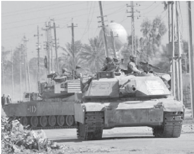
US Army soldiers patrol with M1 Abrams tanks Baghdad's western end of Abu Ghraib, after US troops clashed with Iraqis for the second time in three days.

The average number of attacks, around 12 a day in midsummer, reached 33 a day by late October. In seven weeks of war in March and April, 114 Americans were killed in combat. But even more — some 140 US military personnel — have been killed in action since President Bush declared “major combat” ended on 1 May. —Internet