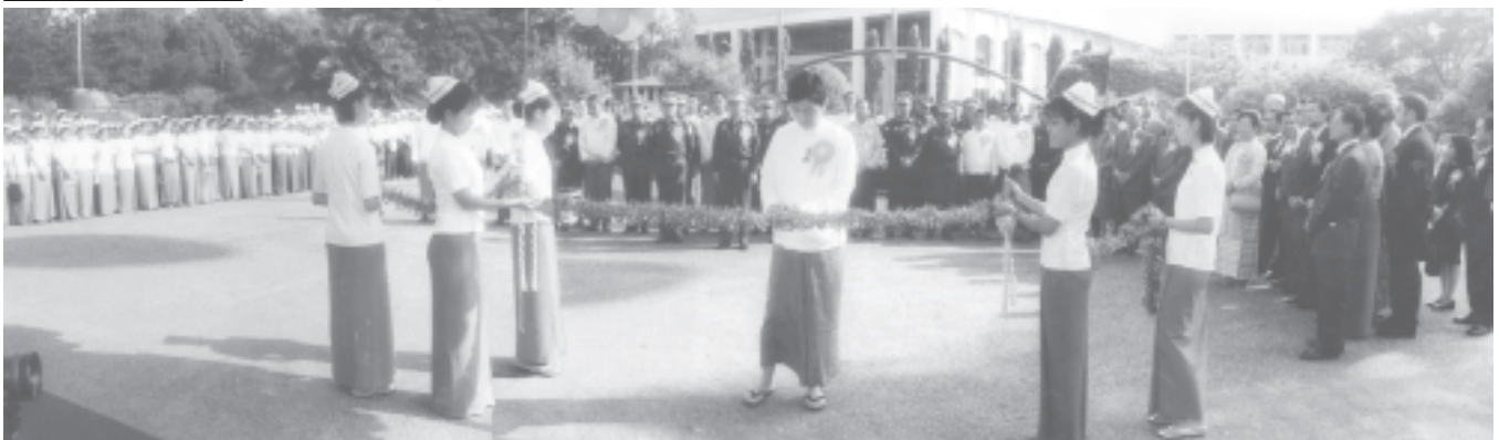
Chairman of National Health Committee Prime Minister General Khin Nyunt attends opening ceremony of the First Anti-AIDS Exhibition. — MNA

The exhibition is kept open from 9 to 6 pm daily till 9 November. — MNA