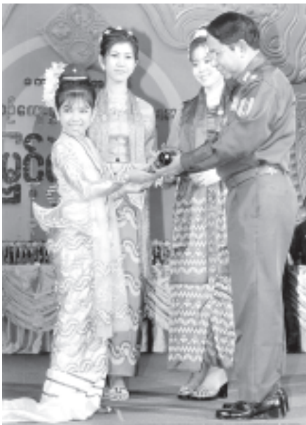
Minister Brig-Gen Kyaw Hsan presents a prize to award-winning girl in the girls's dance contest. (News page 8)

(In honour of all competitions at the 11th Myanmar Traditional Performing Arts Competitions.)