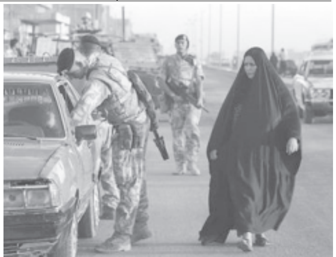
An Iraqi woman walks past as British soldiers check a car at a checkpoint in Basra, in southern Iraq on Saturday, 25 October, 2003. —INTERNET

The latest statistics with the National Computer Virus Emergency Response Centre show that 83 per cent of China's personal computers were infected with viruses for more than three times in 2003, up 25 per cent compared to the previous year. —MNA/Xinhua