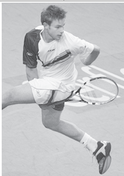
Between the legs: Andy Roddick of the US returns a shot to Tim Henman of Great Britain during their Paris ATP Masters Series semi-finals match at Bercy indoor tournament in Paris.