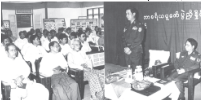
Commander Maj-Gen Tha Aye addresses the coordination meeting for holding respect-paying to teachers and presenting of prizes to outstanding students. — MNA

The minister, next, arrived at the construction project of Upper Myanmar Press of the ministry in Mandalay this morning. Responsible officials reported to the minister on completion of buildings. The minister inspected round the construction site and gave instructions. — MNA