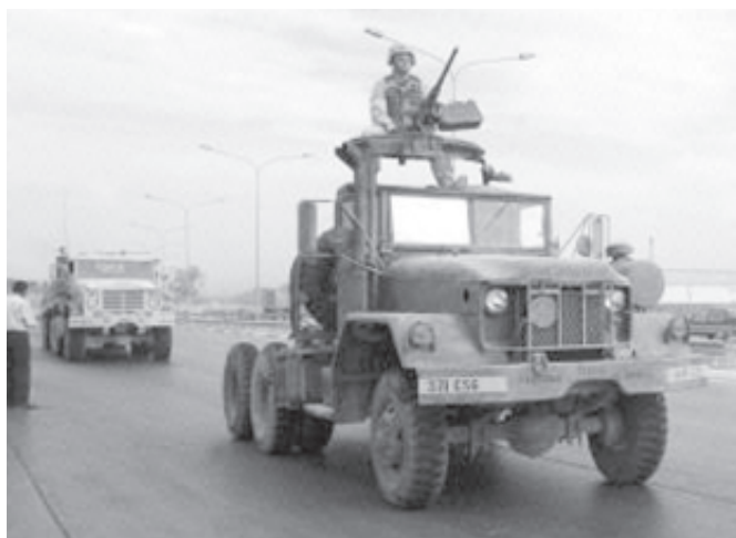
US troops tightened security in Baghdad area on Sunday amid heightened Iraqi resistance.