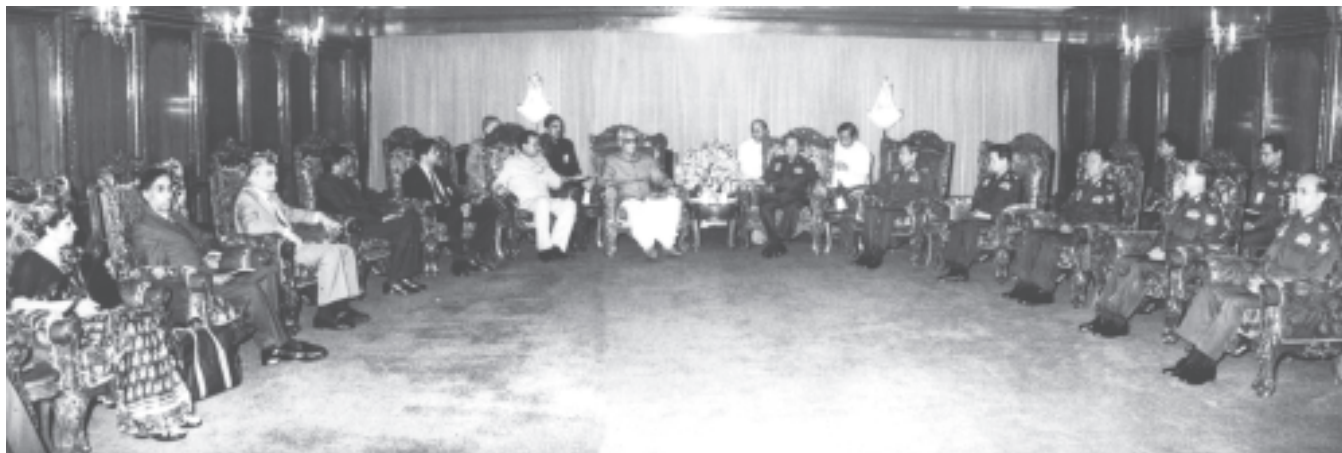
Senior General Than Shwe receives Indian Vice-President Mr Bhairon Singh Shekhawat at Credentials Hall of Pyithu Hluttaw.