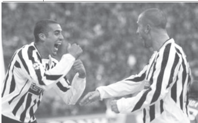
Ventus Marco di Vaio (R) celebrates with his teammate David Trezeguet after scoring against AC Milan during their Serie A soccer match at the San Siro Stadium in Milan, on 1 November, 2003. The match ended in a 1-1 tie.