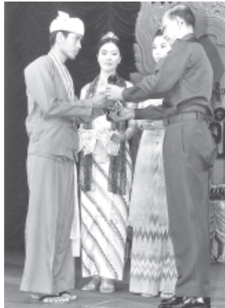
Secretary-2 Lt-Gen Thein Sein presents a prize to a winner at the 11th Myanmar Traditional Cultural Performing Arts Competitions.