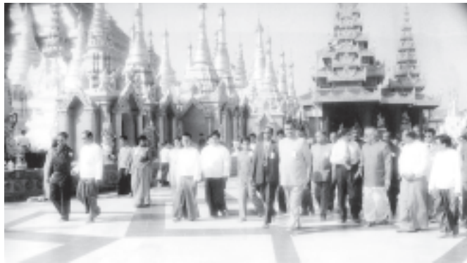
The visiting Indian goodwill delegation led by Vice-President Mr Bhairon Singh Shekhawat visits Shwedagon Pagoda.

After that, the visiting Vice-President and party paid homage to Jade Buddha Image kept at the prayer hall of Punñakusala Bahukara Association and Shwedagon Pagoda and left there at 9.45 am.