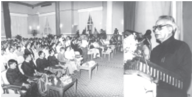
Visiting Indian Vice-President Bhairon Singh Shekhawat makes a speech at the reception of MIBC.