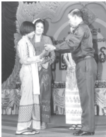
Minister for Energy Brig-Gen Lun Thi presents a prize to a winner at the 11th Myanmar Traditional Cultural Performing Arts Competitions.

Myanmar culture and arts, to overthrow all that, using their artistic talents to keep own nation, own nationality, and their future steadfastly on the road of progress in national interests.