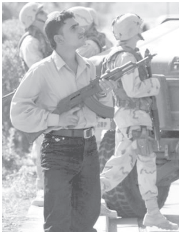
An Iraqi policeman looks up for intruders of the Foreign Ministry in the capital Baghdad on 1 November, 2003.

It was at least the fourth time since the United States declared an end to major hostilities on May 1 that the coalition has reported helicopters being hit by anti-US forces. The previous strikes did not cause any fatalities.— Internet