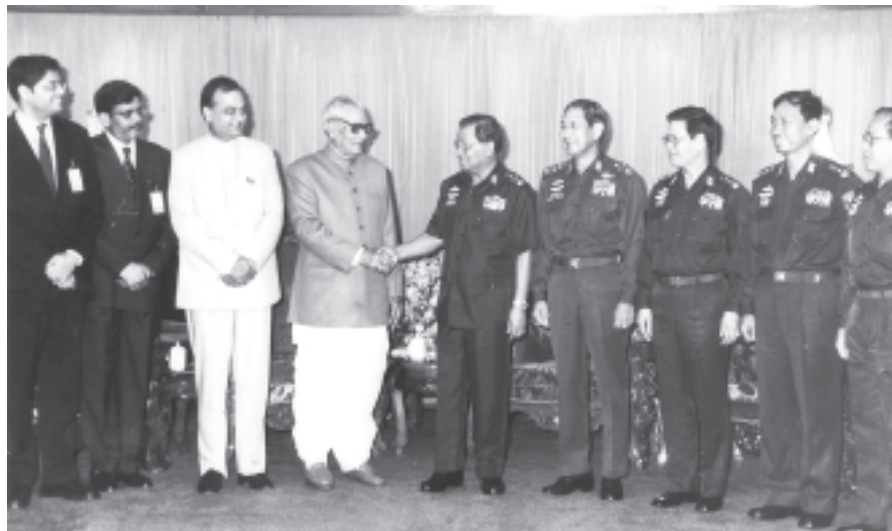
Senior General Than Shwe greets Indian Vice-President Mr Bhairon Singh Shekhawat at Credentials Hall of Pyithu Hluttaw.