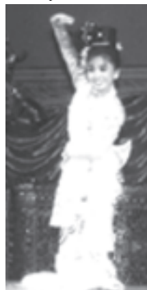
A young woman participating in higher education level women's dance competition. — MNA

The song contest of the competitions continued