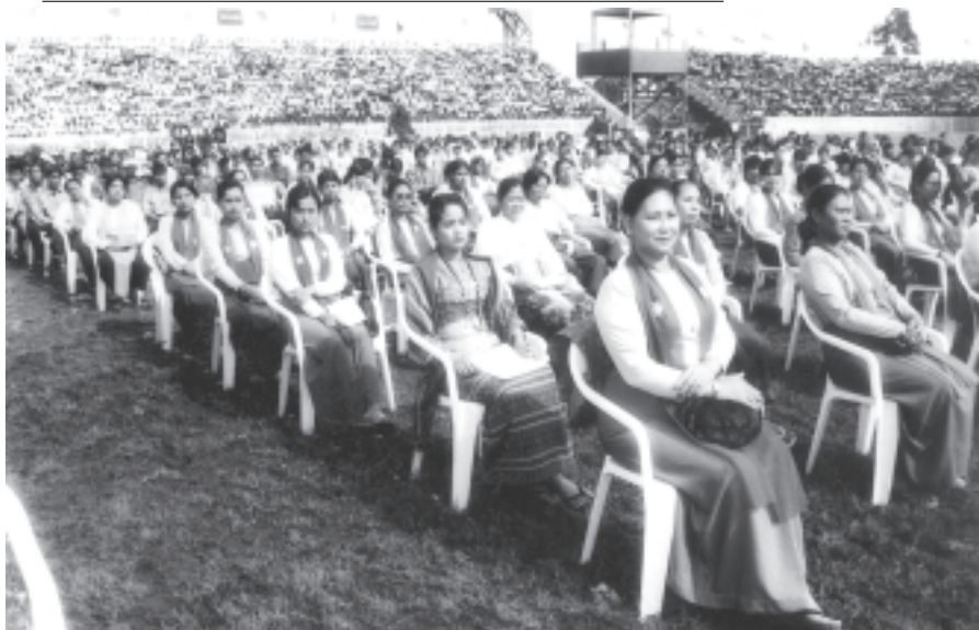
Local women attending the mass rally to support the State's political roadmap. — MNA