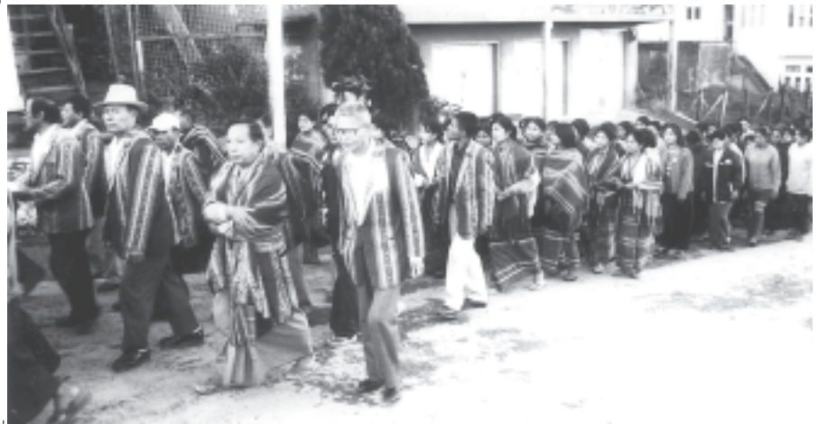
Braving the cold weather Chin nationals march to the mass rally to support the political plan of the State.