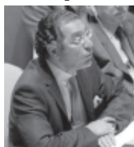
Munir Akram (Pakistan)

Munir Akram (Pakistan) said before and after the war in Iraq, his country's position had been guided by concern for the welfare of the people of Iraq. Unfortunately, the situation in Iraq had evolved in ways that had aroused international concern, in particular with regard to the security situation. The initiation of the present resolution was an opportunity to address those concerns and devise a structure that could lead to early political independence. Despite the contradictions of the text, the main goals — sovereignty, improvement and economic and social reconstruction — had been maintained.