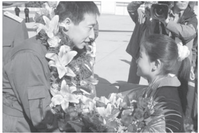
China's first astronaut Yang Liwei, left, is greeted with a bunch of flower by a girl on his arrival in Beijing on 16 October, 2003.