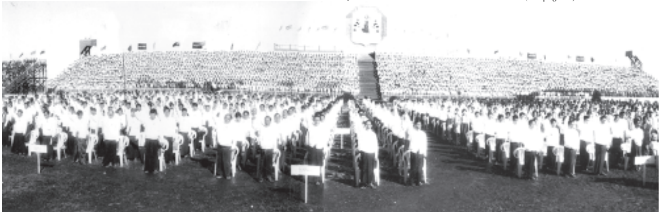
People from all walks of life chanting slogans at the mass rally in support of the State's future political roadmap.

Emergence of the State Constitution is the duty of all citizens of Myanmar Naing-Ngan.