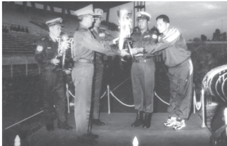
Secretary-2 Lt-Gen Thein Sein presents the trophy to Yangon Command team.