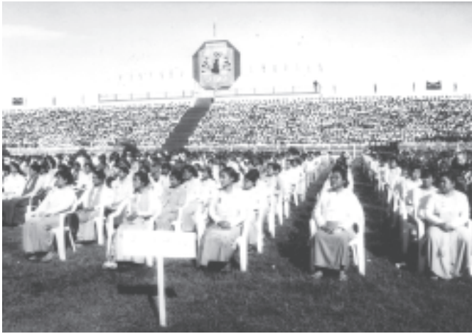
Local women attend the mass rally held in support of the State's future programmes.