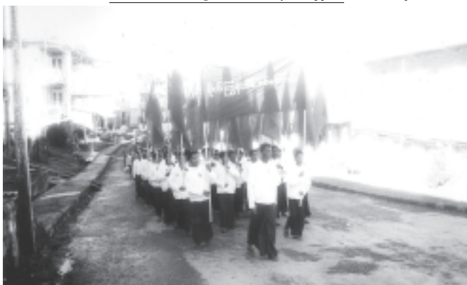
Bo John Bi column marching to the mass rally.