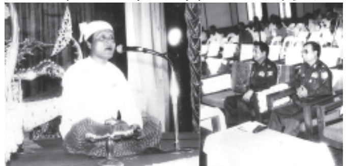
Minister Maj-Gen Kyi Aung and Minister Maj-Gen Sein Htwa attend amateur level men's religious song competition.