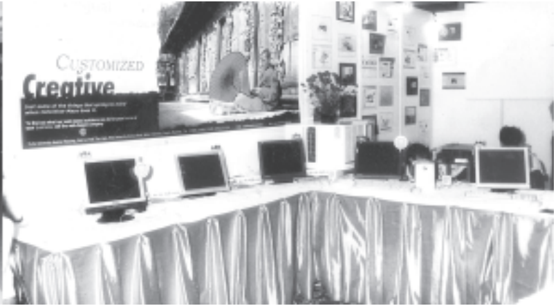
Secretary-1 Lt-Gen Soe Win and Secretary-2 Lt-Gen Thein Sein view a booth at the fifth International ICT Exhibition 2003.