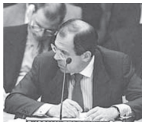
Sergey Lavrov (Russian Federation)

Regarding the multinational force, he said in the final version its primary role was to provide security until the political transition took place. The resolution did not discuss the problem of weapons of mass destruction and other matters which would have to be dealt with, which was to say that the resulting resolution did not solve all problems. But, it was able to create con-