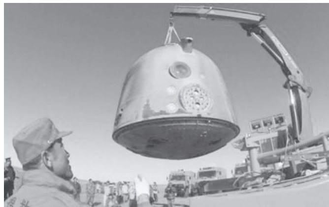
Staff members hoist the re-entry capsule Shenzhou-V, China's first manned spacecraft, in north China's Inner Mongolia Autonomous Region on 16 October, 2003.

"This launch is an important achievement in the history of human exploration. China, after Russia and the United States, is only the third nation to successfully launch humans into space," NASA Administrator Sean O'Keefe said in a statement. —MNA/Reuters