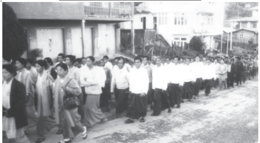
Those from different organizations marching to the mass rally to support the State's political roadmap.