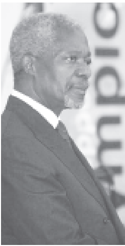
Secretary-General Kofi Annan

The following are excerpts from the speech delivered by UN Secretary General Kofi Annan.