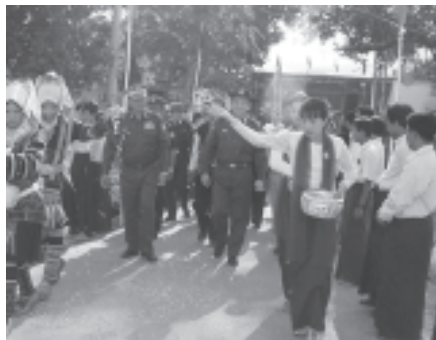
Minister Col Thein Nyunt attends the opening of newly constructed Metta tarred street in Kengtung Township.