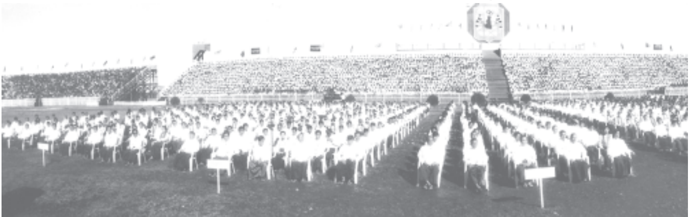
People in attendance at the mass rally to support the Prime Minister's speech on seven future policies and programmes of the State.