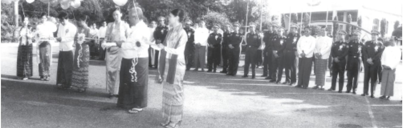
Secretary-1 Lt-Gen Soe Win and Secretary-2 Lt-Gen Thein Sein attend the opening of International ICT Exhibition and U Thauang Tin and U Aung Zaw Myint formally open the exhibition.