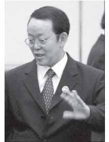
Wang Guangya (China)