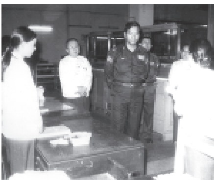
Minister Maj-Gen Hla Tun inspects Myanmar Economic Bank Branch 3.