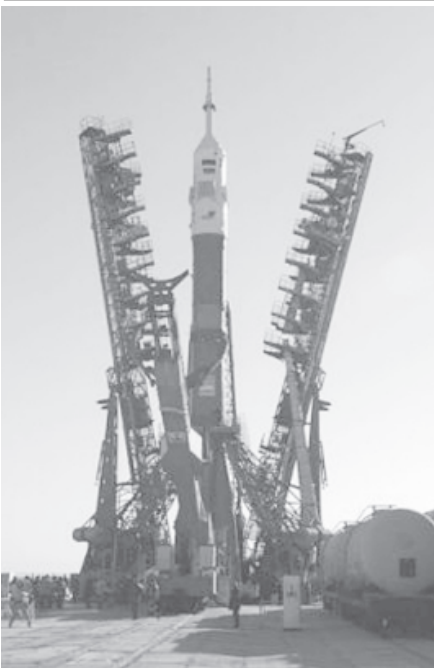
The Soyuz TMA-3 spacecraft and its booster rocket is raised to its vertical launch position at the Baikonur Cosmodrome, in Kazakhstan, on 16 October, 2003, in preparation for liftoff on 18 October, 2003, to carry Mission Commander and NASA Science Officer Mike Foale, Soyuz Commander Alexander Kaleri and European Space Agency astronaut Pedro Duque of Spain to the International Space Station.