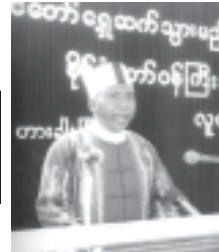
U Ban Htaung seconds the motion. — MNA

Services Senior General Than Shwe cordially greeted the elected representatives at the meeting room of the Presidential Residence on Ahlon Road.