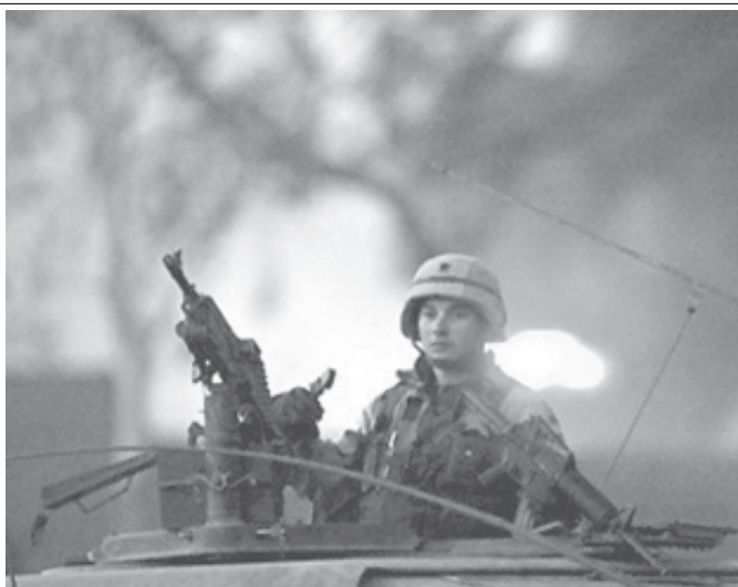
A US soldier guards an area near a burning factory in Baghdad Wednesday.