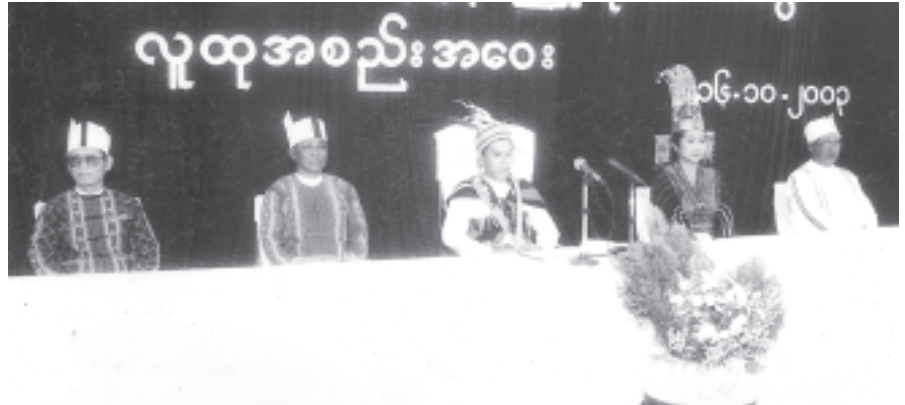
The panel of chairmen preside over the mass rally to support the future policies and programmes of the State.

The Tatmadaw government paid attention to national reconsolidation, regional peace and tranquillity and law enforcement when it took the responsibilities of the State. At the same time various steps of national projects have been laid down and implemented for emergence of economic,