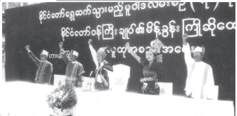
The chairman and members chanting slogans at the mass rally.

social and development infrastructures that will lead to modern and developed nation with a strong economy.