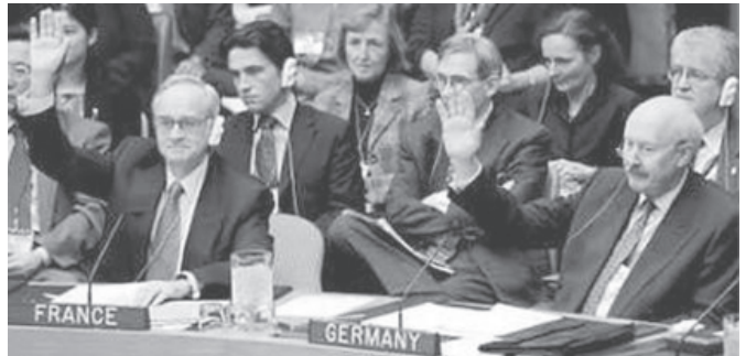
French Ambassador to the United Nations Jean-Marc de La Sabliere (L) and German Ambassador Gunter Pleuger (R) raise their hands as they vote in favor of the Iraq resolution in the Security Council chambers in New York, on 16 October, 2003. The Council voted unanimously to adopt a resolution on postwar Iraq, a victory for the United States which sought approval for its occupation of the country. Until hours before the vote, the support of key council members, Russia, Germany and France was in doubt. All had opposed the US-led invasion of Iraq. —INTERNET

In a fresh attempt to remove discontent of key UN Security Council members in order to make more countries contribute troops and money to rebuild Iraq, the United States offered on Oct 12 further amendments to its draft resolution on Iraq, setting a Dec 15 deadline for fixing a timetable for the return of the Iraqi sovereignty. —Internet