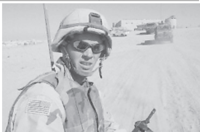
A survey of US troops in Iraq has found that nearly three-quarters of those questioned said unit morale was low or average and that nearly half did not plan to re-enlist.—INTERNET

The US military believes that foreign fighters coming across the porous borders have joined the remnants of the ousted Iraqi regime in conducting the fierce attacks on the US-led occupying forces.—MNA/Xinhua