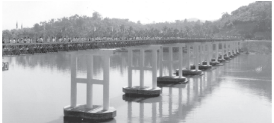
The 1,360 feet long Taninthayi Bridge spanning Tanithayi River was opened on 12-11-2000 in Taninthayi Division.