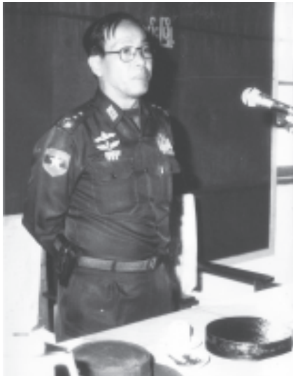
Secretary-2 Lt-Gen Soe Win meets doctors, nurses, MCWA members and officials at Falam District Hospital.