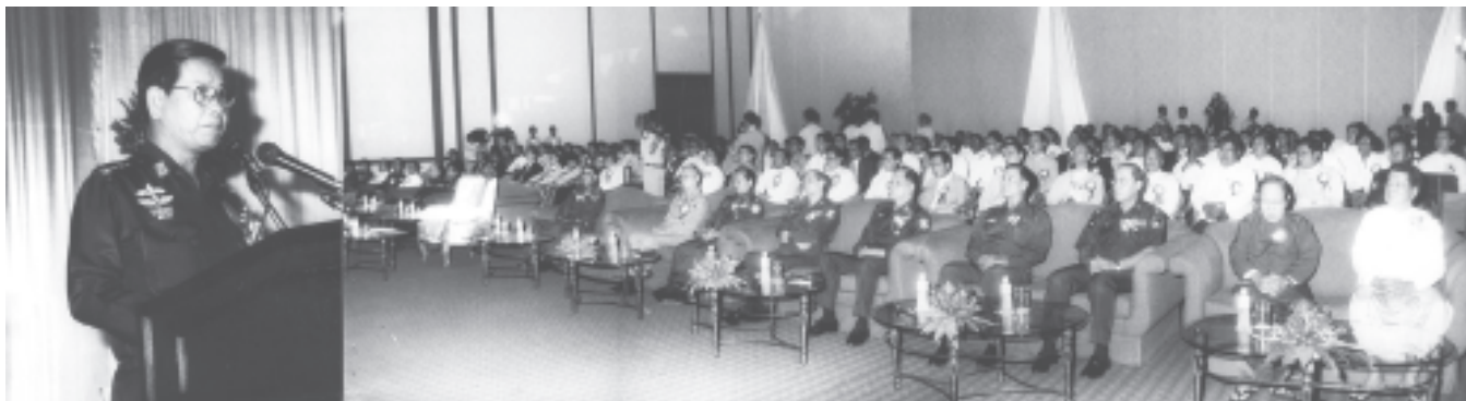
Secretary-1 General Khin Nyunt speaking at the opening ceremony of Myanmar International Freight Forwarders' Association.

Also present at the call were Secretary-1 of the State Peace and Development Council Chief of Military Intelligence General Khin Nyunt, Commander-in-Chief (Navy) Vice-Admiral Kyi Min and Commander-in-Chief (Air) Maj-Gen Myat Hein.