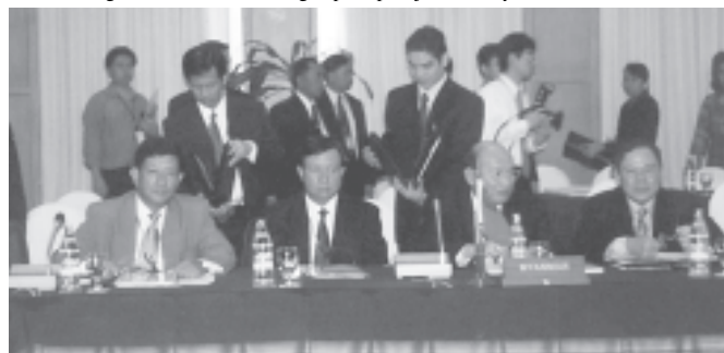
Minister for Home Affairs Col Tin Hlaing attends Five-Nation Narcotic Drugs Elimination Meeting.