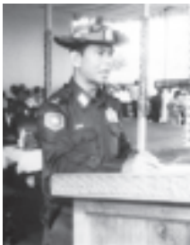
Central Command Commander Maj-Gen Ye Myint.

Present were Chairman of Mandalay Division Peace and Development Council Commander of Central Command Maj-Gen Ye Myint, Minister for Agriculture and Irrigation Maj-Gen Nyunt Tin, military officers of the command, officials of the State Peace and Development Council Office and departments, members of Myingyan District and Ngazun Township Peace and Development Councils and members, officials of the Natthataw Dam Project, social organizations, local people and students numbering 5,300.