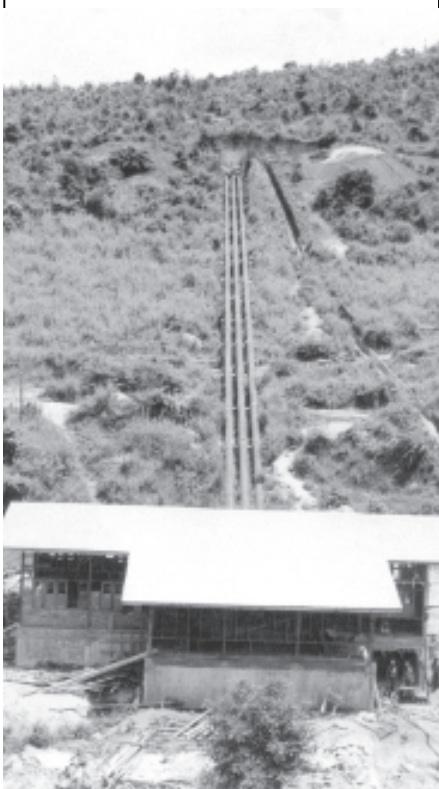
Nantleik Hydel Power Plant built in Kengtung Township in Shan State (East).