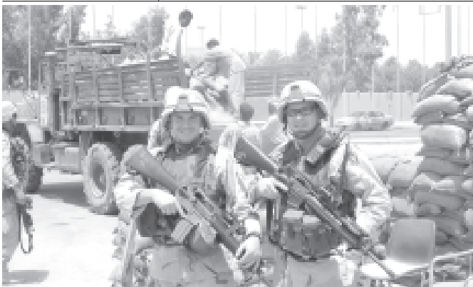
The photo taken on 25 July, 2003 shows Iraqis unloading sandbags from a truck at a United States army post in Baghdad, capital of Iraq. After photos of the bodies of former Iraqi President Saddam Hussein's sons, Uday and Qusay, were released on Thursday, the US army is on high alert against Saddam's loyalists who have vowed to avenge the death of Uday and Qusay.