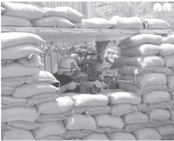
The photo taken on 25 July, 2003 shows a United States soldier on guard outside the US Army Information Centre in Baghdad, capital of Iraq. After photos of the bodies of former Iraqi President Saddam Hussein's sons, Uday and Qusay, were released on Thursday, the US army is on high alert against Saddam's loyalists who have vowed to avenge the death of Uday and Qusay.