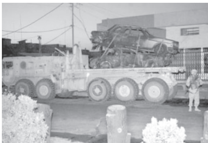
US troops guard a flatbed truck carrying two vehicles that were destroyed during a raid on 27 July, 2003, in Baghdad, Iraq.

“Turkey and the United States are determined to act in partnership in northern Iraq,” he said. —MNA/Reuters