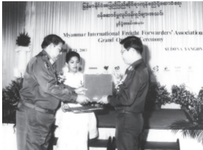
Secretary-1 General Khin Nyunt accepts souvenirs presented by Minister Maj-Gen Hla Myint Swe to mark the grand opening ceremony of Myanmar International Freight Forwarders' Association. — MNA

Next, Maj-Gen Hla Myint Swe also accepted two plane tickets presented by Silk Air; one return ticket each by Malaysia Airlines and Mandarin Airlines; 1000 FECs by Phee Group of Companies; K 500,000 by Asia World Port Management; K 300,000 by Metro Asia Myanmar Co Ltd and 2,365,000 by 22 entrepreneurs of MIFFA. —MNA