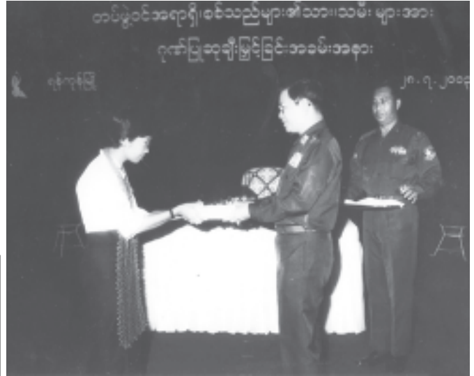
Secretary-1 General Khin Nyunt presents cash award to an outstanding student of the family of Office of Chief of Military Intelligence.

In road transport sector, Asia Highway as well as international highway passing