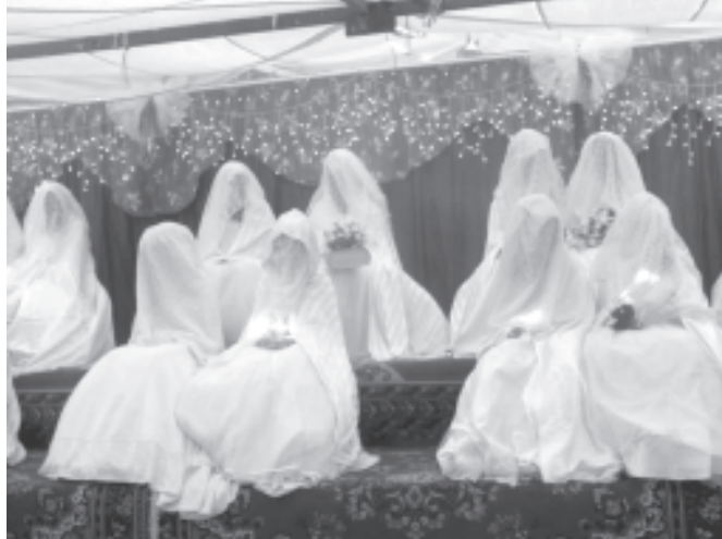
Brides with veil sit during a collective wedding at a middle school in Amman, capital of Jordan, 25 July, 2003. One hundred and four couples from across the kingdom joined the wedding held by a local charitable organization. —XINHUA

Investigations indicate that in some parts of the province, especially in the rural areas, the obsolete idea of valuing boys over girls still remained. — MNA/Xinhua