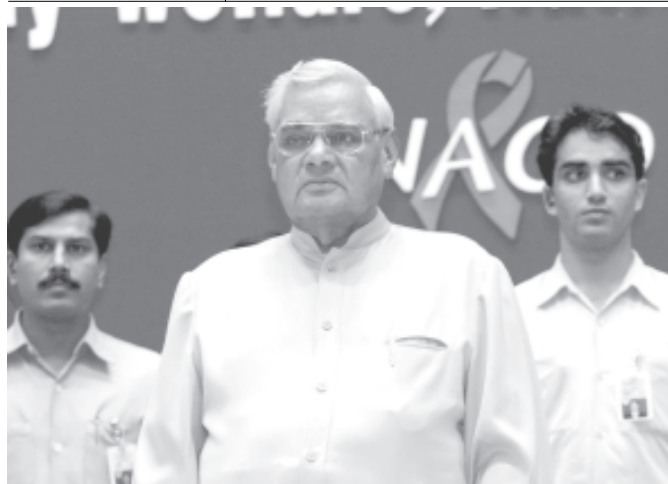
Indian Prime Minister Atal Behari Vajpayee attends the two-day National Parliamentary Convention on HIV/AIDS, which was opened in New Delhi, capital of India, on 26 July, 2003.