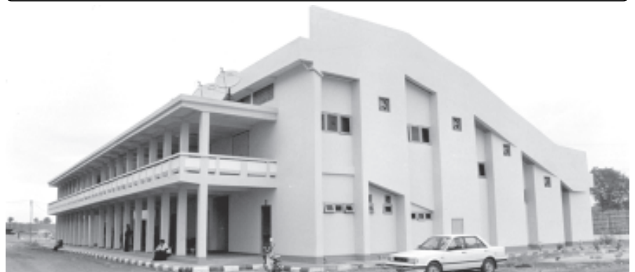
Magway Institute of Medicine where students are learning medical science through Data Broadcasting System.