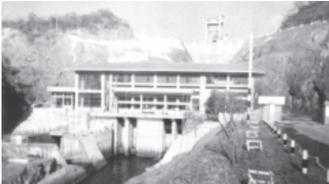
With the aim of supplying electricity to Taunggyi District in Shan State, the Ministry of Electric Power built Hydel Power Plant across Zawgyi River in Yaksauk Township.