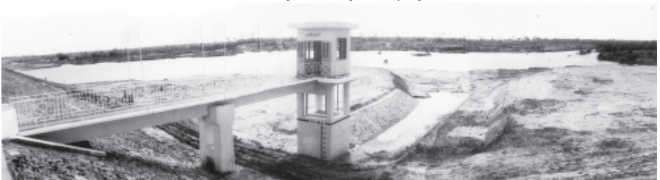
Natthataw Dam seen near Natthataw Village, Ngazun Township.

As the world population is on the increase, there has been a limitation on availability of water resources. In this regard, every nation is paying serious attention to in fresh water resources. With this end in view, the government is making efforts for tapping of water resources to ensure development of socio-economic life of the people as well as development of environmental conservation. In the process, dams and river water pumping projects are being imple-