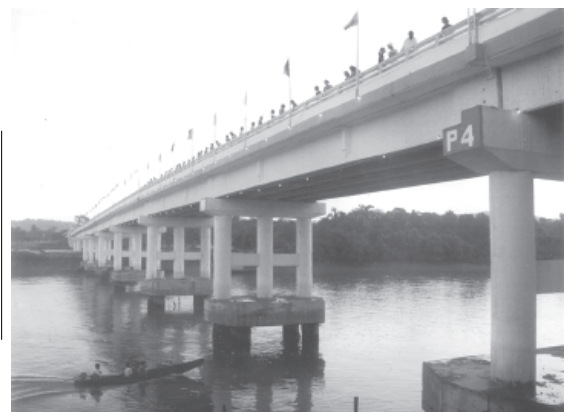
Ma-ei Creek Bridge linking Taungup Township of Thandwe District and An Township of Kyaukpyu District in Rakhine State was opened on 18-11-2001. The 940 feet long and 30 feet wide bridge was built at a cost of K 7,129 million.