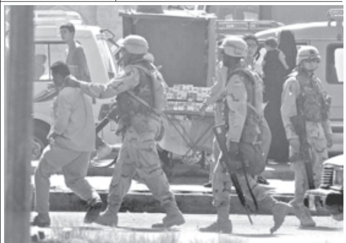
US troops arrest a driver as they enforce a no-parking rule near the main train station Baghdad, Iraq, on 27 July, 2003. —INTERNET

Provincial health officials announced the case Friday but would not identify the individual, saying only the person was from Assiniboia, 130 kilometres southwest of the city of Regina in the province. —MNA/Xinhua