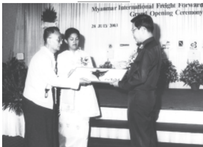
Secretary-1 General Khin Nyunt accepts cash donations for Myanmar International Freight Forwarders' Association from entrepreneurs.