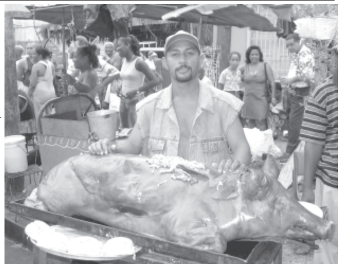
The photo taken on 25 July, 2003 shows a Cuban selling a roasted pig during the Santiago Carnival in Cuba. Rosated pigs are a favorite of the Cubans in the annual carnival, which started on 19 July and will end on 29 July this year.