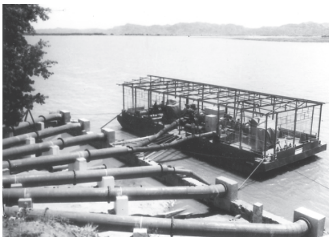
Lawka Nanda river-water pumping project in NyaungU Township, Mandalay Division, benefiting 11,000 acres of land.

Article by Myint Lwin; photos by (MNA) and (The Kyemon)