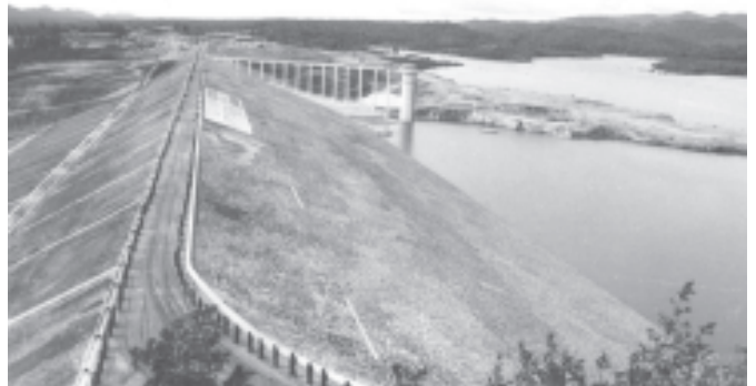
Salin Dam with the length of 2,770 feet and height of 220 feet was opened on 15 August 2001 in Salin Township, Magway Division to irrigate 33,000 acres of farmland.