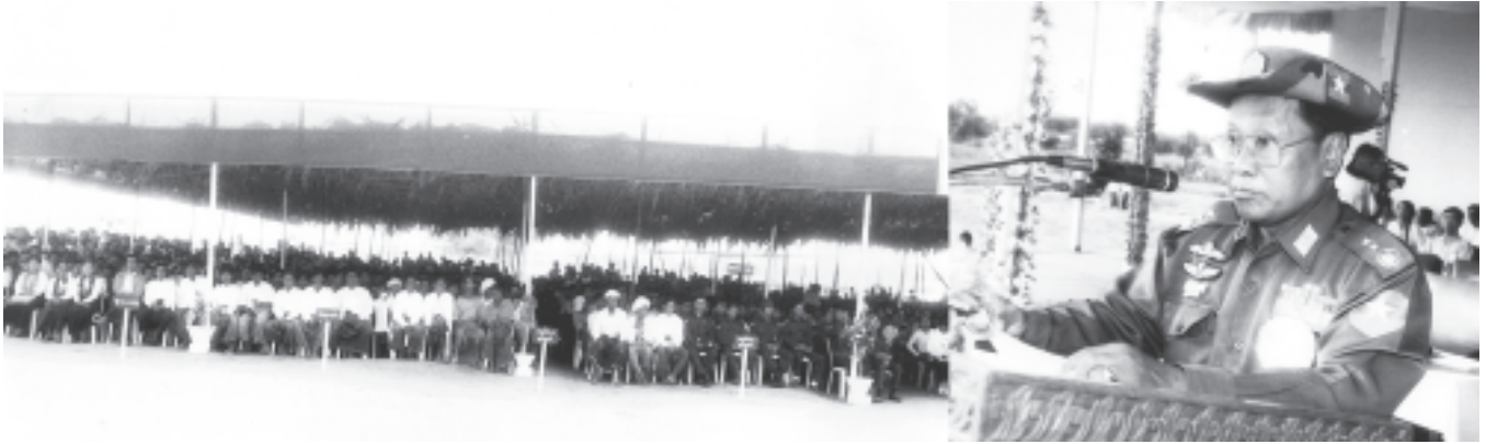
Lt-Gen Ye Myint addresses opening ceremony of Natthataw Dam near Natthataw Village, Ngazun Township.— MNA