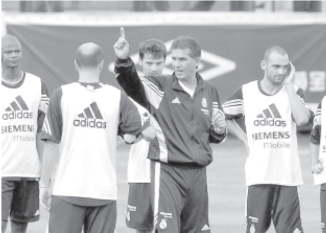
Carlos Queiroz (C), head coach of Spain's football giant Real Madrid, instructs players in a training session in Kunming, capital of southwest China's Yunnan Province, on 27 July, 2003.