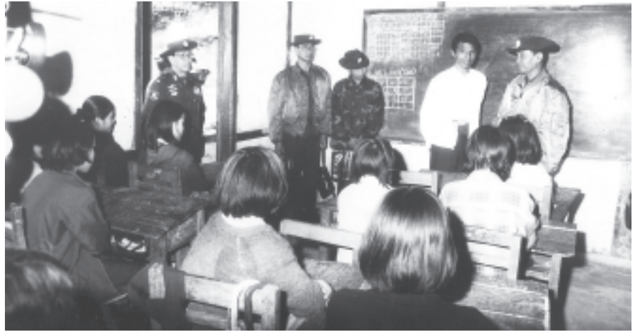
Lt-Gen Thura Shwe Mann, Secretary-2 Lt-Gen Soe Win and party cordially converse with students at Falam BEHS No 1.