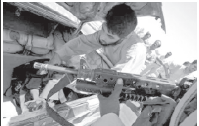
An Iraqi driver has his car searched by a US soldier from the 4th Division at a checkpoint in Saddam Hussein's hometown of Tikrit, some 150 km (90 miles) north of the capital Baghdad, on 26 July, 2003. Explosions and gunfire rang out in Baghdad on Saturday, underlining that remains a dangerous place despite US hopes that the killing of Saddam Hussein's two sons will help end armed resistance.

Kasuri expressed appreciation for commitment of the international community, particularly the efforts made by the United States, Britain, the European Union, Japan,