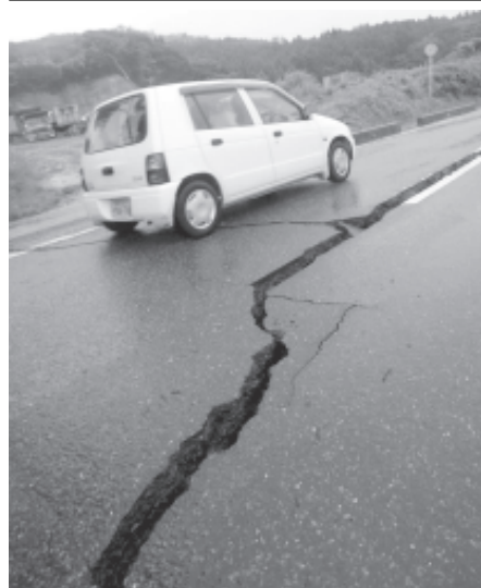
A car runs on a fissured road in Miyagi, northeast Japan, on Tuesday, 2003. Two earthquakes measuring 5.6 and 6.2 on the Richter scale hit northeast Japan in succession early Saturday, leaving more than 200 people injured and destroying hundreds of houses.