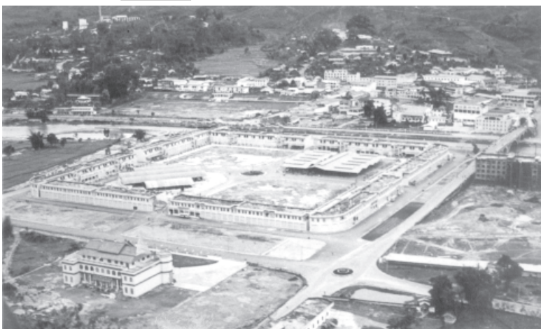
The panoramic view of developing Mongla of Shan State (East) Special Region-4.