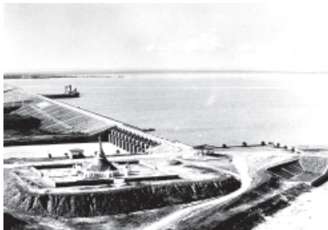
Thaphanseik Dam in Kyunhla Township, Sagaing Division, benefiting over 500,000 acres of land