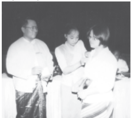
Lt-Gen Thura Shwe Mann meets with officials, social organizations and local people at Chin Shwe Pyi Gymnasium in Tonzang.