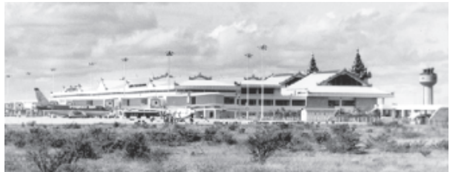
The Mandalay International Airport which is superior to Yangon International Airport in terms of size, runway, services security and splendour.

The Secretary-1 of the State Peace and Development Council, ministers and the commander of the Central Command attended the ground-breaking ceremony on 21 March 1994.