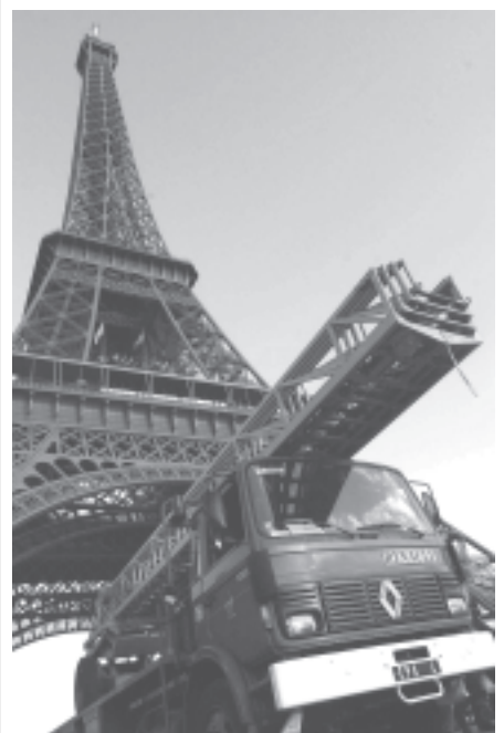
A fire engine leaves after a fire on the Eiffel Tower in central Paris was put out on 22 July, 2003. The fire broke out on the top floor of the Eiffel Tower Tuesday, with no casualties reported. Police said the fire was caused by a short-circuit.

သစ်ပင်စိုက်ပါ။ ပျားမွေးပါ။ နှစ်ခြွှာအကျိုး၊ ဆထမ်းပိုး။