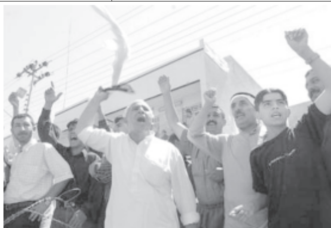
Locals chant slogans in support of Saddam Hussein at the site of Tuesday's shootout that left four Iraqis dead including both Saddam's sons Oday and Qusay on 23 July, 2003, in the town of Mosul, 280 miles, 450 kilometres north of Baghdad, Iraq.