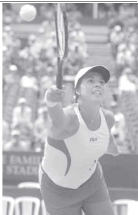
Jennifer Capriati lunges for a ball at the net but misses against Marion Bartoli of France during the Bank of the West Classic on 23 July, 2003, at the Taube Tennis Center in Stanford, Calif. Capriati won, 6-2, 4-6, 6-1.