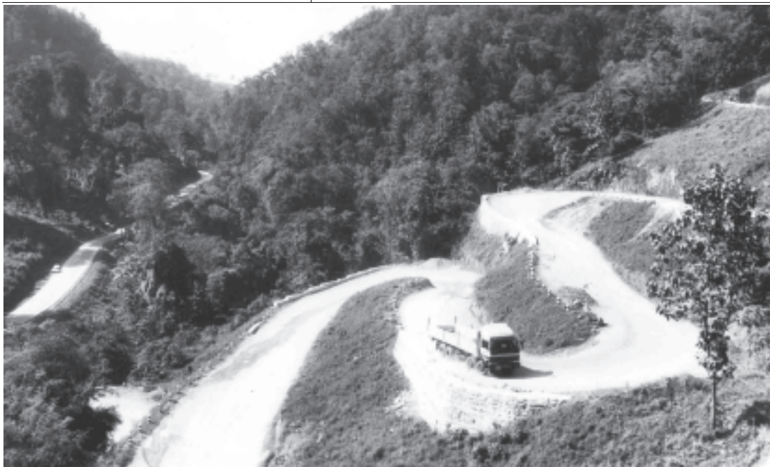
A heavy truck rolling on the mountain road section of the Mandalay-Lashio-Muse Road, an important facility helping promote Myanmar's border trade with the People's Republic of China, and develop a large region covering the northern Shan State especially the border areas, with Muse, a border town, at the centre.