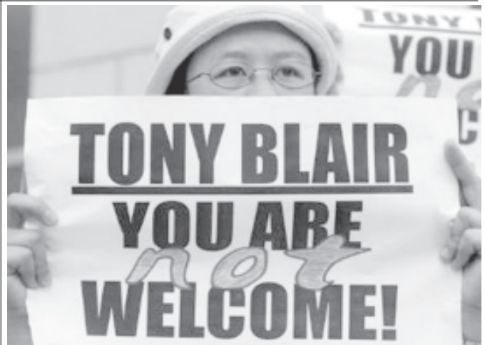
A protester carries a placard denouncing visiting British Prime Minister Tony Blair during a demonstration in Hong Kong, on 23 July, 2003. Blair is in a political storm over Iraq after failure to find any chemical, biological or nuclear weapons in the country.