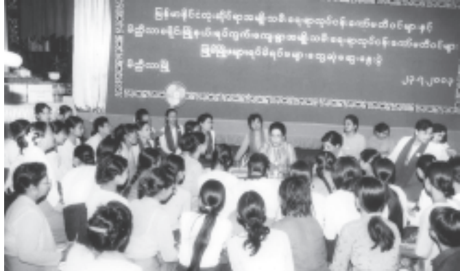
Dr Daw Khin Win Shwe and party meets with local women at the round table discussion in Meiktila.