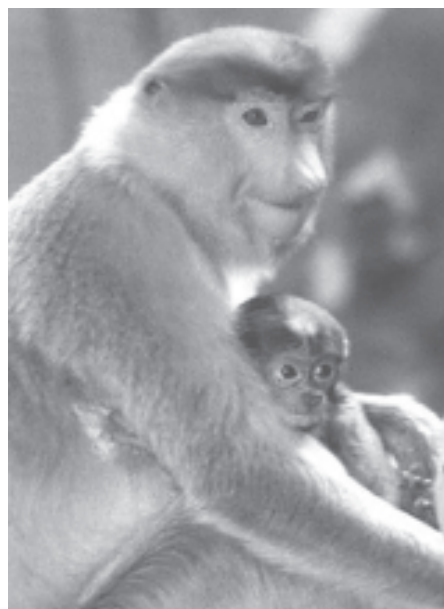
A Proboscis monkey and her baby at Singapore Zoo. The monkey is native to Borneo but may be headed for extinction. As much as a fifth of south-east Asia's wildlife may go the way of the dodo by the end of the century, experts predict.