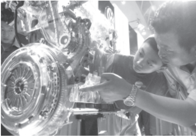
A boy looks at the engine of a car with his father at the Third Changchun International Automobile Fair in Changchun, northeast China's Jilin Province, on 22 July, 2003. Many manufacturers make full use of the fair to popularize the knowledge of the automobiles.

For example, Liu said, US scientists shared only 16 moderate-resolution imaging spectroradiometer (MODIS) receivers, a kind of equipment for receiving data from remote sensing satellite, but China already had 17 and ordered another 80, which is a typical waste. —MNA/Xinhua