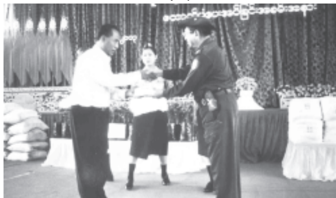
Deputy Minister for Home Affairs Brig-Gen Thura Myint Maung hands 600 bags of rice and 30 bags of salt to Mangpan local people's militia leader U Sai Mon.

The amount and value of the supplies did not matter. Fulfilling their much-needed requirements at the right time was a strength for the Kokang region in their endeavour to eradicate the cultivation of poppy. On 30 June, Kokang national race leaders distributed the rice and salt provided by the Central Committee for Drug Abuse Control (CCDAC) to five village-tracts that were faced with