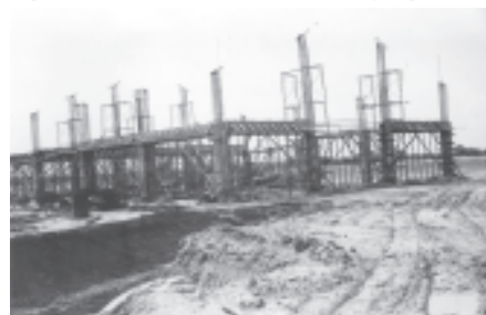
The building to house the boiler.

Since 1999, measures have been taken for providing enough raw materials to already-built textile and garment factories and the ones under construction. In conformity with the guidance of the Head of State, cotton is cultivated in the Cotton Belt stretching 648,000 acres stretching from Thayet in Magway Division on the west bank of Ayeyawady River to Salingyi in Sagaing Division on the west bank of Chindwin River. It is expected to produce some 179,000 metric tons of long staple cotton