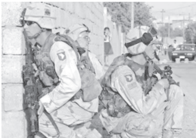
US soldiers from the 101st Airborne take cover as they secure the area around a house in the northern Iraqi city of Mosul, on 23 July, 2003. The Defence Department announced a plan on Wednesday to replace weary US military personnel in Iraq with fresh American and international troops, with stints of up to a year for some American units.