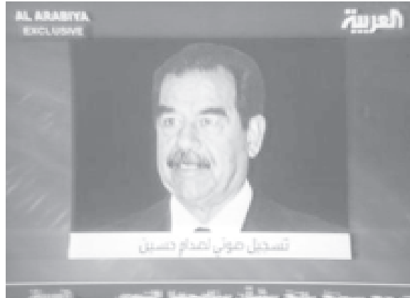
An Arab satellite channel, Al Arabiya, broadcast of audiotape purportedly made by Saddam Hussein on 20 July ordering Iraqi soldiers to rise up against Americans is seen in Baghdad, Iraq on 23 July, 2003.