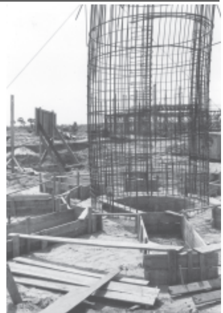
The water tank is under construction.

a year. The produce will be provided to the factories being built in Pakokku, Salingyi and Pwintbyu and the ones to be constructed in Aunglan, Myingyan and Shwebo.