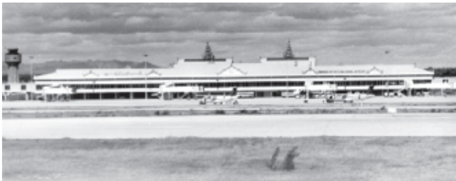
The Mandalay International Airport, decorated with Myanmar handicraft has emerged in TadaU Township, Mandalay Division.