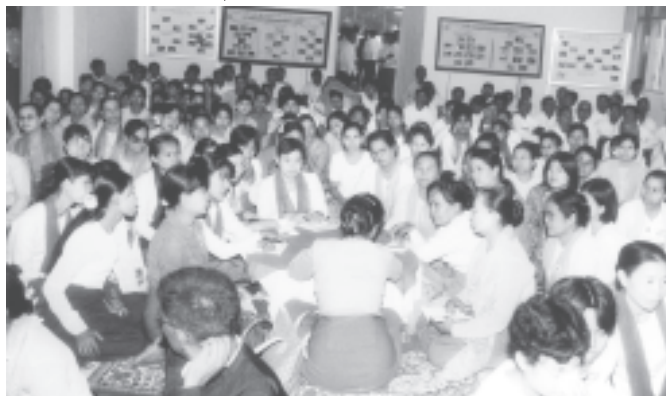
Dr Daw Khin Win Shwe and party meets with local women at the round table discussion in Kyaukse.