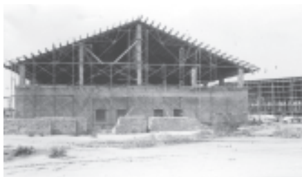
The warehouse for finished goods.

Article by Sein Shwe Hlaing (Industry-1)