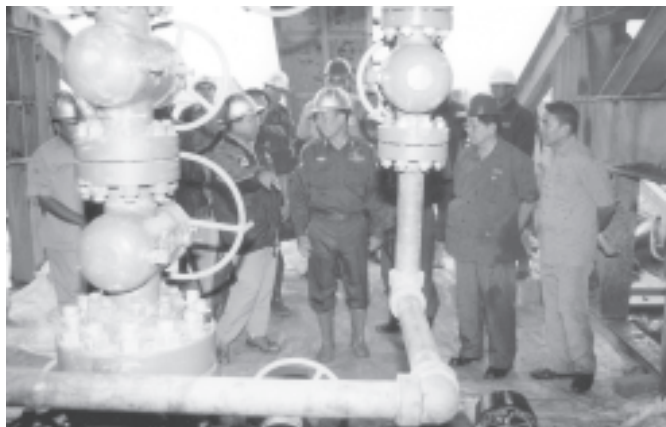
Minister for Energy Brig-Gen Lun Thi inspects Well No 17 in Nyaungdon Oil and Gas Field.—ENERGY