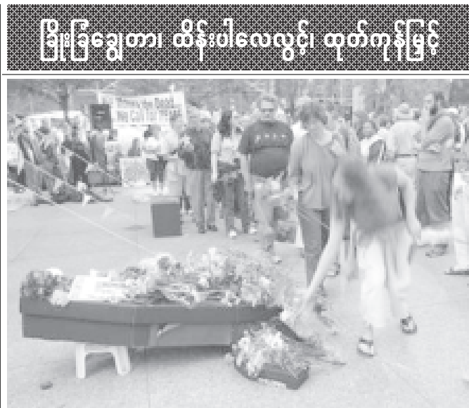
People line up to place flowers on a symbolic coffin during an anti-Iraq war protest in Federal Plaza in Chicago on 23 July, 2003. — INTERNET

With other intelligence claims about an Iraq nuclear programme under scrutiny, weapons of mass destruction yet to be found and US soldiers dying in Iraq nearly every day, anti-war coalitions are seizing on the public's growing concerns over the war, as recent polls have indicated, to try to re-energize their movement and force an examination of the process and the policies that led to the war. So far, Congress has been split along party lines on the issue of formal reviews and the issue, some in the movement fear, could become a strictly partisan one, diluting its appeal. — MNA/Xinhua