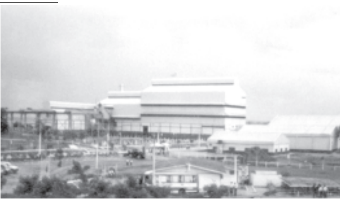
No 12 Sugar Mill (Nawade) in Pyay Township, Bago Division.