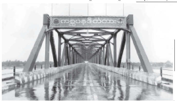
Kissapanadi Bridge on Yangon-Sittway Road in Rakhine State.