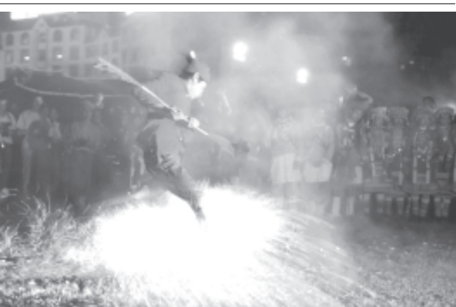
A man of the Lisu ethnic group preforms his stunt Barefoot Walking On A Flame in Tengchong County, southwest China's Yunnan Province on 18, July, 2003. There has been a traditional sport called "Climb A Mountain of Knife and Plunge Into a Sea of Flames" in Tengchong County. The main's performance in only part of the traditional sport.

It said without economic development, it is very hard to maintain political stability, while without political and social stability, economic development could hardly to be achieved.