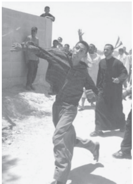
A Shiite boy throws rock at US soldiers in Najaf, Iraq, on 20 July, 2003. Confrontations with the US troops began after over 10,000 Shiite Muslims gathered in Najaf to protest the US military who briefly surrounded a popular Shiite Muslim's home Saturday after his prayer sermon on Friday denouncing the new Iraqi governing council and the US occupation of Iraq.