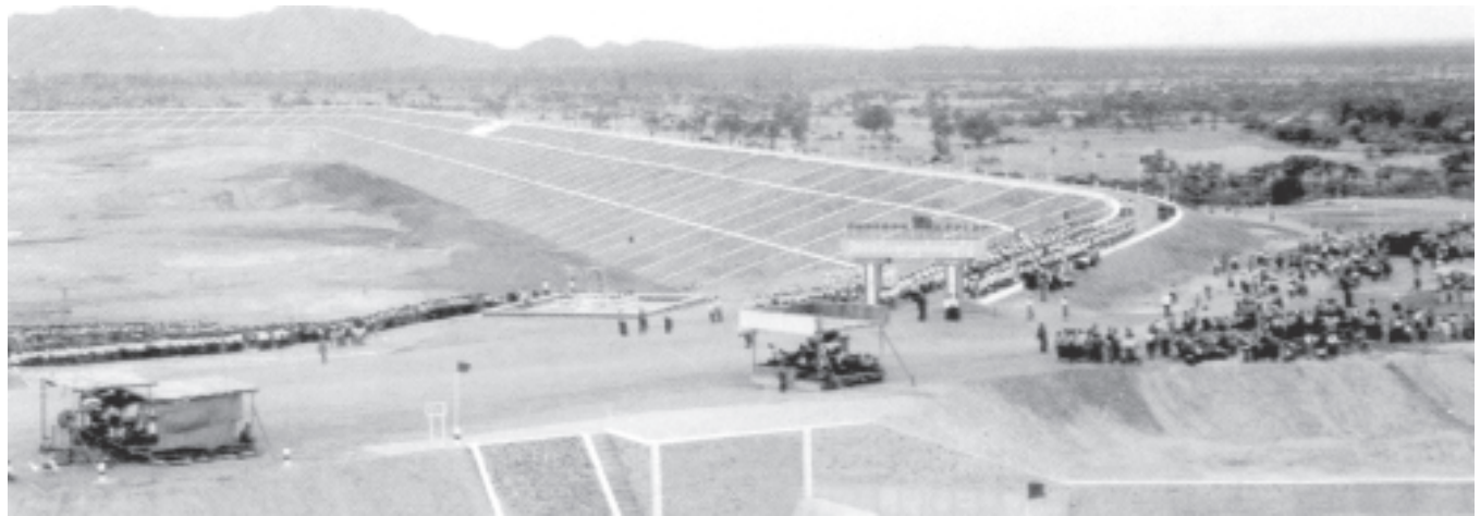
Welaung Dam in Taungtha Township, Mandalay Division. The dam was inaugurated on 13 July 1998.