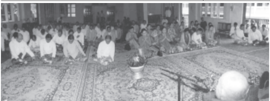
Merits being shared at the Waso robes offering ceremony of Ministry of Energy.

After the ceremony, the commander and party offered "soon" to members of the Sangha.-MNA