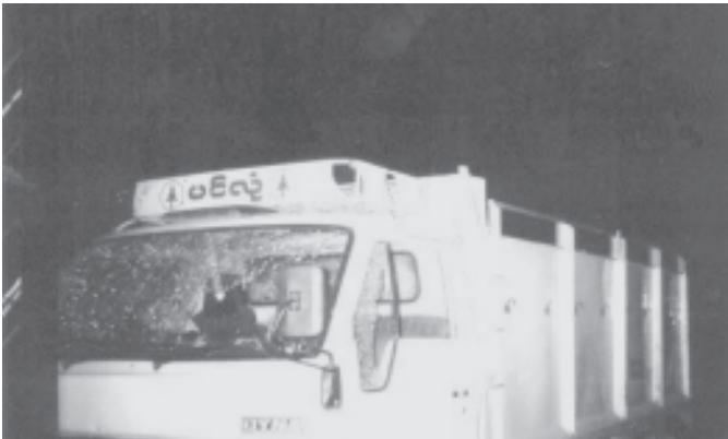
Smashed windshield seen in the car of members of Traffic Police who controlled traffic jam in front of Mandalay Division NLD Office caused by the speech of Daw Suu Kyi on

We put up a notice board in front of the division