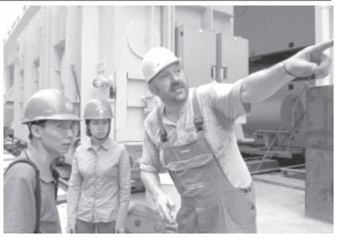
The picture taken on 20 July, 2003 shows a technician from the French ABB company discusses with Chinese staff members on installing a high voltage electric equipment in a power plant on the left side of the Three Gorges Project on the Yangtze River, China's largest water conservancy project.