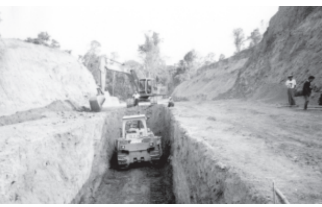
Progress of work in building a spillway at Paunglin Dam-Irrigation

regions along Yangon-Thanlyin Bridge-2 through the concrete canal.