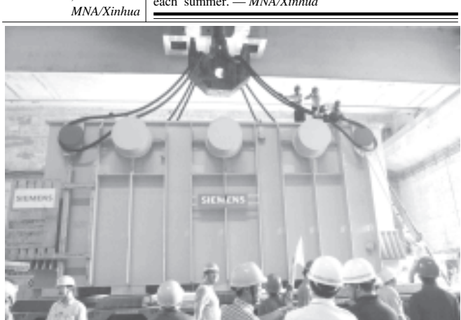
The picture taken on 20 July, 2003 shows a high voltage electric equipment is being installed in a power plant on the left side of the Three Gorges Project on the Yangtze River, China's largest water conservancy project.

Fire devastates forests in the French Riviera backcountry each summer.