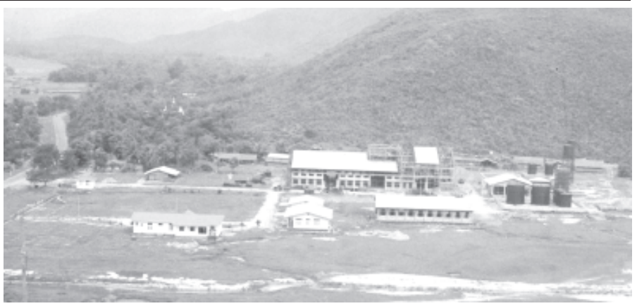
Padonmar Soap Factory of Union of Myanmar Economic Holdings Limited. The factory was built near Thephyugon Village in Paung Township, Mon State.

Photos on this page show tangible results of sustained efforts of the Government for national development.