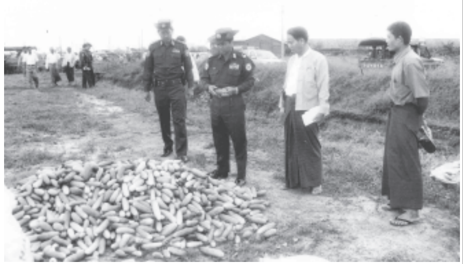
Commander Maj-Gen Myint Swe inspects Vegetables Cultivation and Poultry and Fish Breeding Special Zone in Hmawby Township.