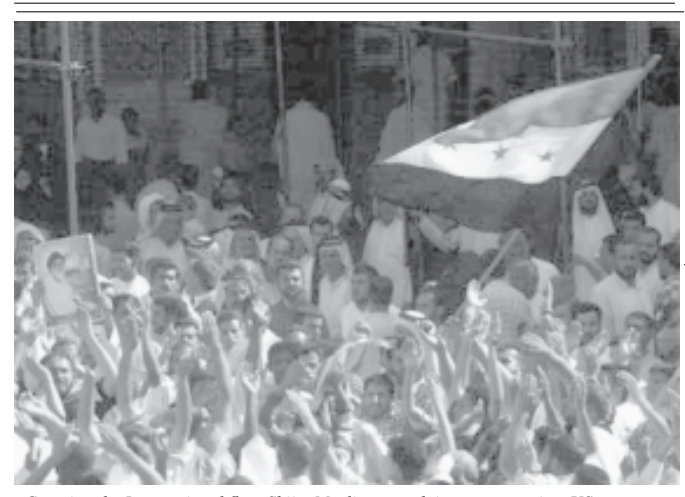
Carrying the Iraq national flag, Shiite Muslims march in protest against US troops on 20 July, 2003, in the Muslim holy city of Najaf, 160 kilometers (100 miles) south of Baghdad, Iraq, Over 10,000 Shiite Muslims gathered in Najaf to protest the US military who briefly surrounded a popular Shiite Muslim's home Saturday after his prayer sermon on Friday denouncing the new Iraqi governing council and the US occupation of Iraq.