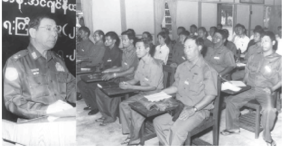
Minister for Construction Maj-Gen Saw Tun speaking at the opening ceremony of JE-2 Sewerage Course and Financial Supervisory-2 Course.— CONSTRUCTION