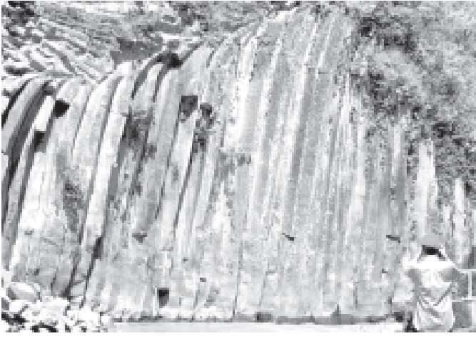
A tourist takes a picture of the column-shaped joints by the effect of volcanic movements in Tengchong County, southwest China's Yunnan Province, on 18 July, 2003. With more than 90 volcanos, the county is known as a "volcanic geology museum," which has attracted scholars and tourists.

The best time to plant a tree was twenty years ago.