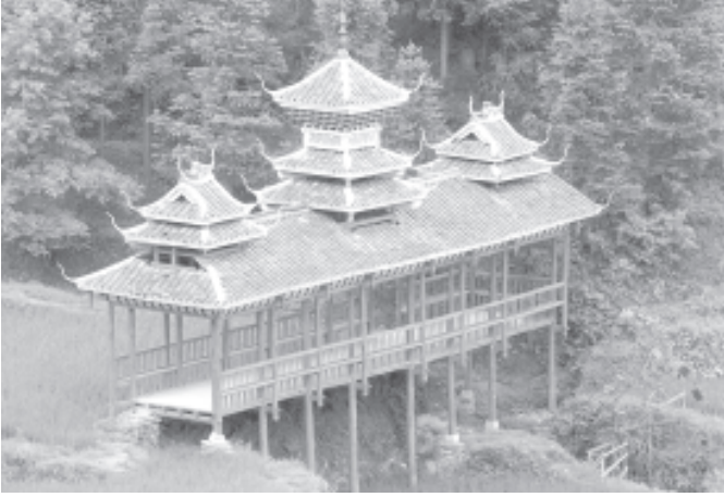
The photo taken on 10, July 2003 shows a corridor bridge in Tang' an village of the Dong Nationality, one of the minority nationalities in southwest China's Guizhou Province. Some 800 people live in the village, which has a history of more than 700 years. The village, which has well preseerved the original custom of the Dong Nationality, was named in December. 1999 as a Dong ecological museum, one of the four built and protected jointly by China and Norway. -XINHUA PHOTO

The agents found 46 rectangular packages in four knapsacks of synthetic canvas and thus arrested van Minen. Meanwhile, at a post office near the airport, 12 four-kilo packages containing high-purity cocaine, valued at 500,000 dollars, were found. —MNA/Xinhua