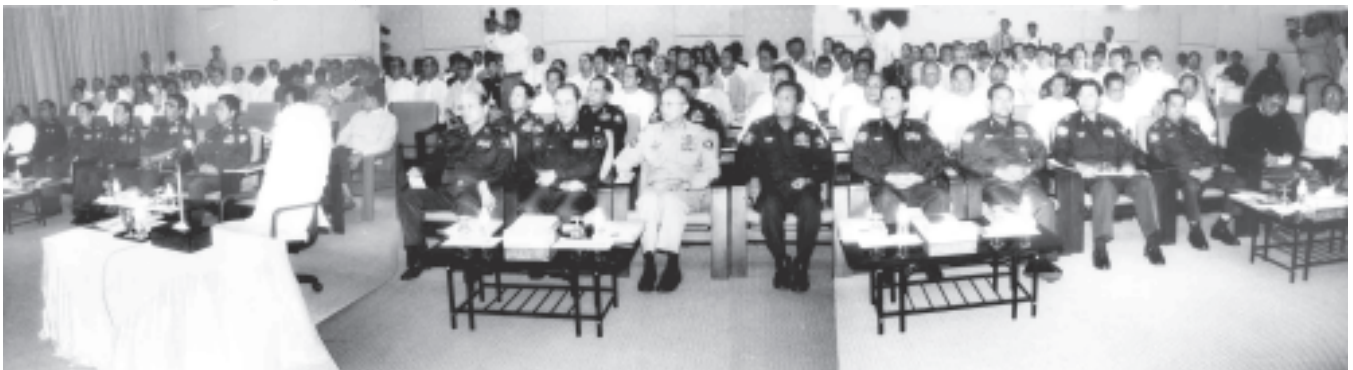
Ministers and officials attending the ceremony to present e-Government tasks of e-National Task Force.

Emergence of the State Constitution is the duty of all citizens of Myanmar Naing-Ngan.