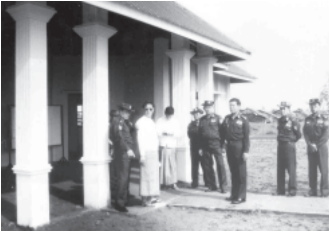
Secretary-1 General Khin Nyunt inspects construction of dispensary in Ward 168, Dagon Myothit (Seikkan) Township (News page 7).—MNA