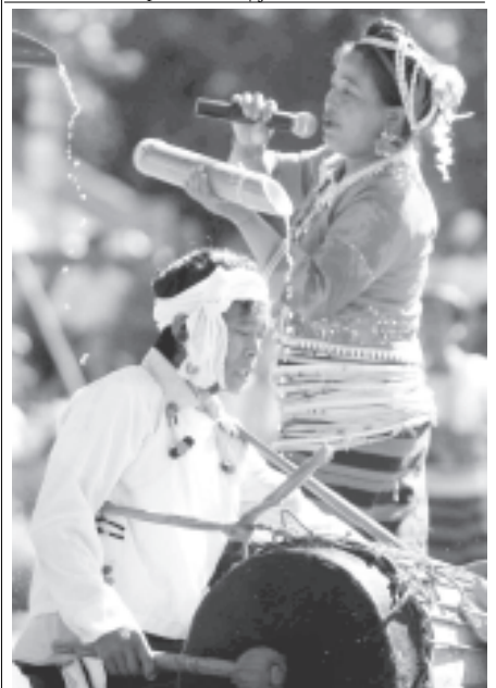
Two people of the De'ang Nationality perform for tourists at a village in the city of Baoshan, southwest China's Yunnan Province, on 17 July, 2003. Tourists worldwide are attracted the area by its beautiful scenery and the typical culture of minority nationalities.—XINHUA PHOTO

— Ju Yijie replaced Wang Zhen as Ambassador to Venezuela.—MNA/Xinhua