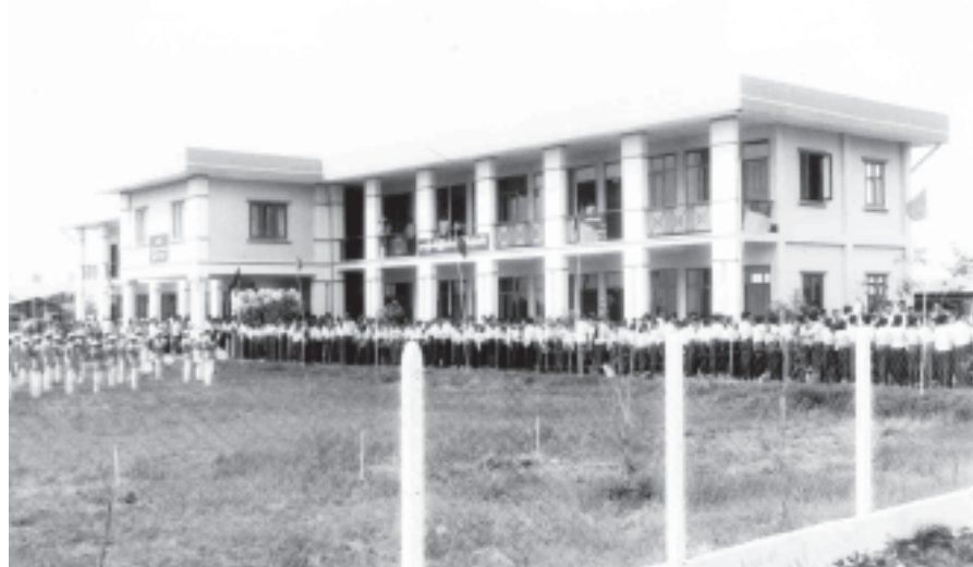
Opening of two-storey school building of BEPS No 6 in progress in Ward 168, Dagon Myothit (Seikkan) Township. (News page 7)—MNA

At a time when efforts are being made for the development of education, health, transportation and social sectors in the division, local people are urged to actively take part in nation-building endeavours.