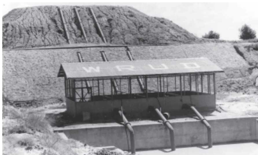
Ngathayauk River Water Pumping Project in NyaungU Township.

Plans are under way for implementation of eight more river water pumping projects which will benefit 97,500 acres of farmlands nation-wide. The government has earmarked K14,500 million plus US$ 23.05 million for the eight projects.