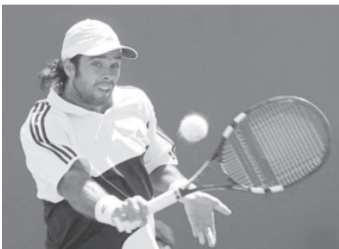
Fernando Gonzalez from Chile returns a backhand to his Spanish opponent Tommy Robredo during their semifinal match of the Mercedes Cup ATP tennis tournament at the Weissenhof in Stuttgart, southern Germany, on 19 July, 2003. Robredo won by 6-2, 4-1 after Gonzalez stepped down due to stomach problems.

This week Chelsea, bought by Russian billionaire Roman Abramovich earlier this month, have signed Cameroon midfielder Geremi and West Ham United defender Glen Johnson, and agreed a fee for Blackburn Rovers winger Damien Duff.