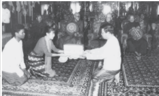
Secretary-1 General Khin Nyunt accepts cash donations from a wellwisher at 52nd Waso robes offering ceremony of Kalewa Tawya Monastery.