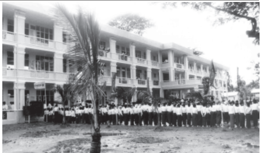
Opening ceremony of Basic Education Primary School No 18 in progress in Ward 10, (North) Thakayta Township.