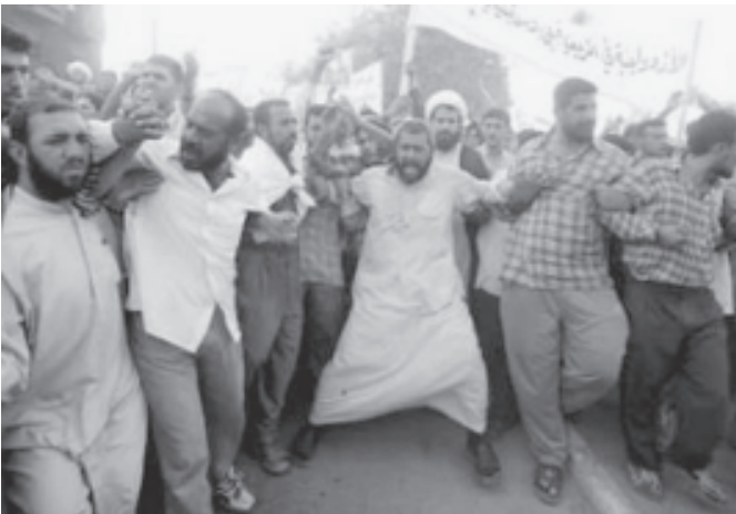
Shi'ite Muslim protesters converge on the headquarters of the US-led administration in the Iraqi capital of Baghdad on 19 July, 2003. At least 10,000 demonstrators marched in support of Shi'ite cleric Moqtada al-Sadr, who on Friday denounced the new US-backed Iraqi Governing Council.