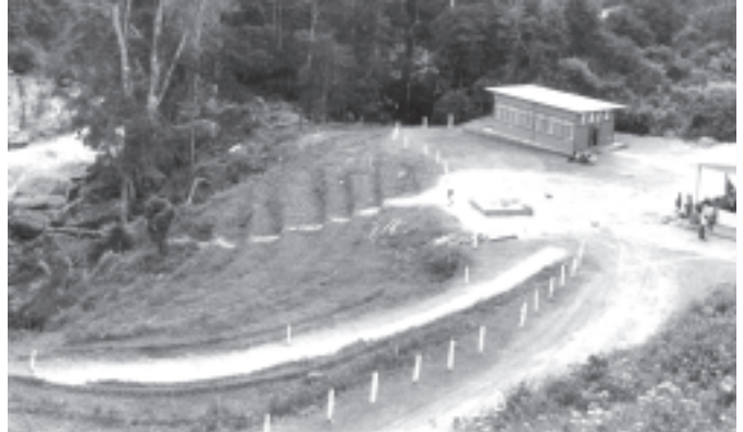
Shweli Hydel Power Project located 17 miles from Namkham in northern Shan State.