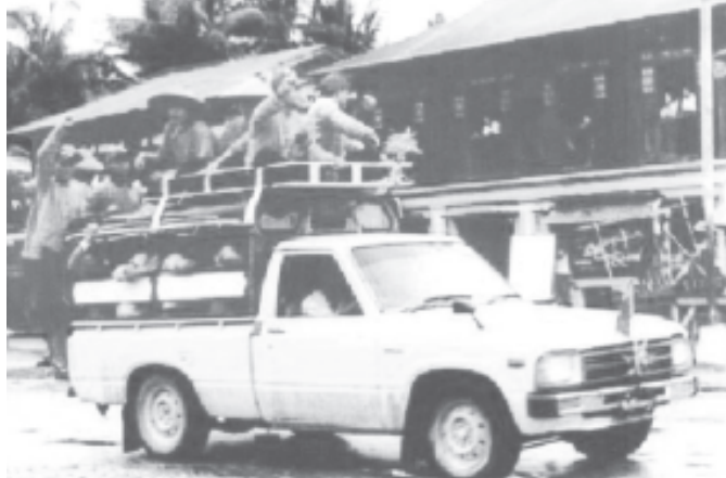
NLD members alarm the public by shouting from the roof of a car of the convoy led by Daw Suu Kyi in Shwegu on 20-5-2003.

some of the assertions she made in her speech that day. She said that 'Metta' (Loving kindness) could be obtained only if fear could be overcome, and that 'Metta' could also generate a lot of courage. I could not grasp Auntie Suu's understanding and interpretation of the Four Buddhist Cardinal Virtues. It may be that my I.Q. is low.