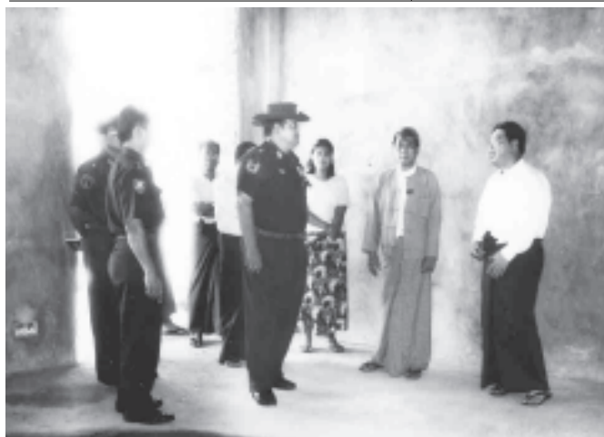
Minister for Transport Maj-Gen Hla Myint Swe inspects completion of lecture halls of Myanmar Maritime University.