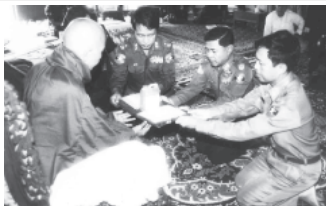
Senior military officers donate provisions to a Sayadaw.