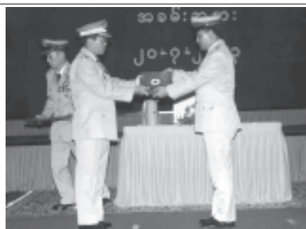
Commander Maj-Gen Myint Swe presents prize to an outstanding officer. (News page 16)—YANGON COMMAND