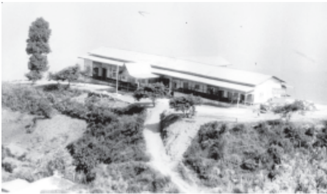
A hospital built in Mongshu region to provide health care service to local people.