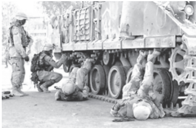
US soldiers repair a fallen tank track in Baghdad. Washington was considering a new United Nations mandate for troops in Iraq amid continuing attacks against US soldiers and UN calls for a timeframe for the restoration of Iraqi sovereignty.

"We had jobs, we didn't have to worry about going out at night. The only thing that is keeping us alive now is what Saddam left for us," he said.