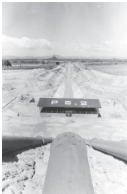
Lawkananda River Water Pumping Project which will benefit 11,000 acres of farmland.

Myokwin (Dhambi) river water pumping project is being implemented in Hinthada Township, Ayeyawady Division. Upon completion, it will benefit some 9,000 acres of farmland.