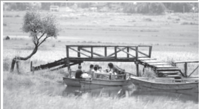
Tourists go sight-seeing by boat in Beihai wetland in tengchong Country, southwest China's Yunnan Province, on 19 July, 2003. It is a well-protected wetland and the only one of its kind in the province.

The OPEC cartel will meet July 31. It is expected to maintain crude production quotas. Slightly diminished production this week from the US Gulf of Mexico caused by precautionary rig evacuations during Hurricane Claudette also underpinned crude by spurring some supply worries among futures traders on the NYMEX and the International Petroleum Exchange in London. —MNA/Reuters