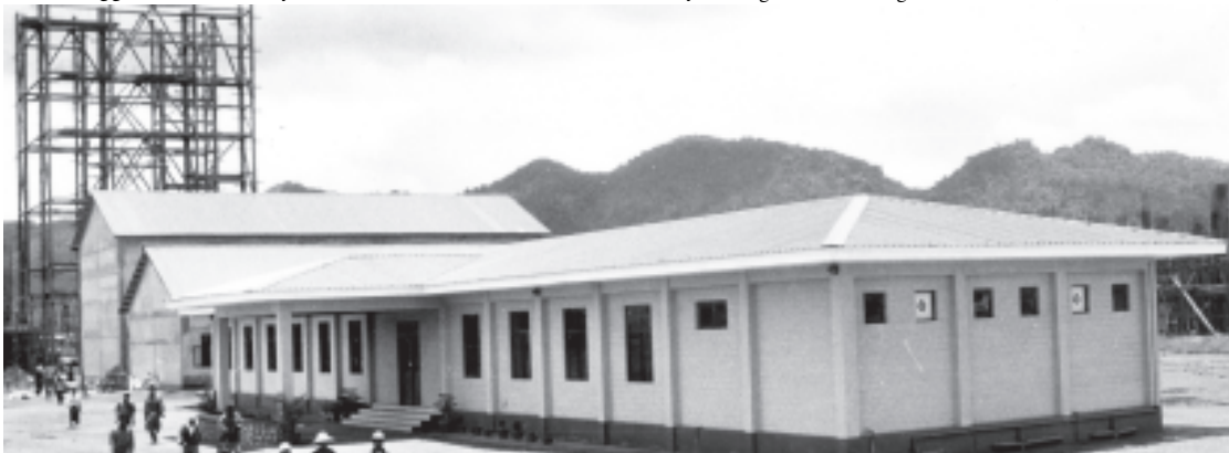
Coal-fired power plant being constructed near Pyntha Village in Pinlaung Township 22 miles away from Kalaw in Shan State (South). The plant will generate 120 megawatt of electricity at the first phase to be distributed to Upper Myanmar and Yangon Division.