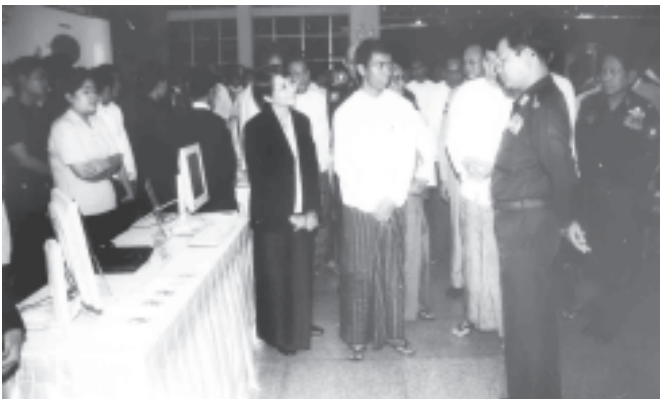
Secretary-1 General Khin Nyunt views computer accessories related to e-Government displayed by companies at MICT Park. (News on page 1)