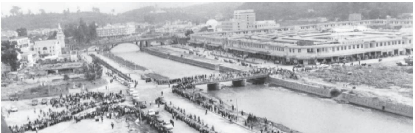
An aerial view of developing Mongla in Shan State (East).