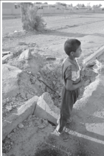
A child stands next to a crater caused by an explosion that according to eyewitnesses was caused by a booby-trapped bomb in Baghdad, on 19 July, 2003. Eyewitnesses said that 4 US servicemen were injured in the blast but the military has not confirmed the incident.