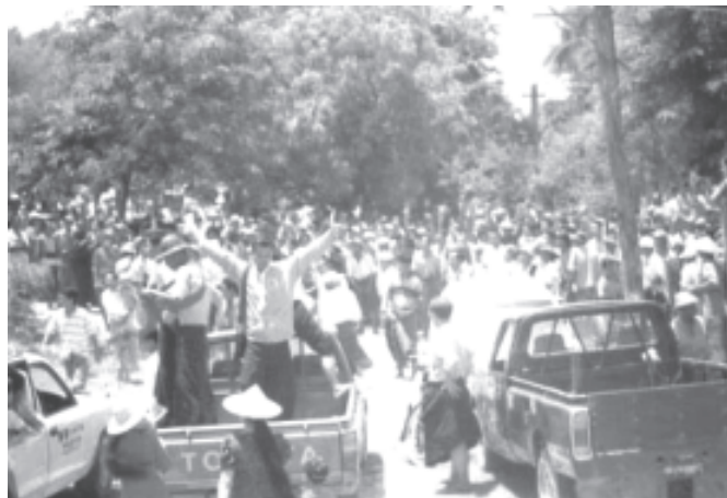
Disorderly scene of NLD members on the road in front of Madaya NLD Office on 26-5-2003.

A little after half past one in the afternoon our group led by Auntie Suu left Momeik for Mogok, escorted