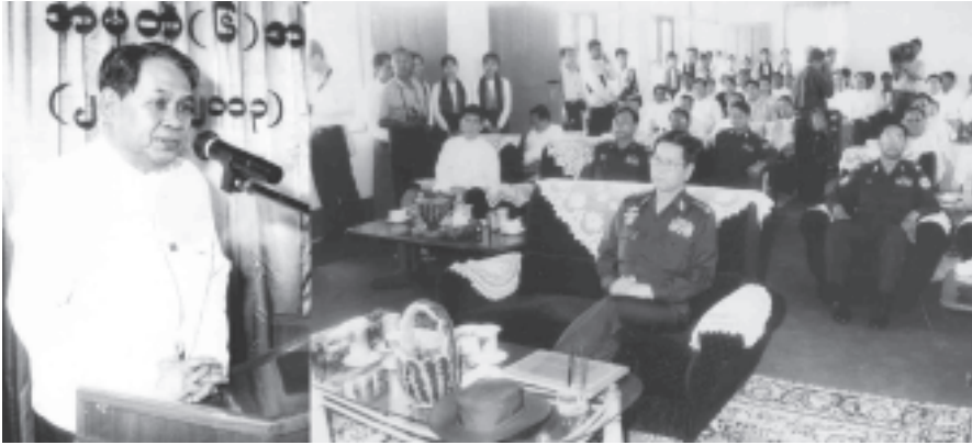
Secretary-1 General Khin Nyunt attends the ceremony and Minister for Education U Than Aung addresses the opening of the building of BEPS No 6 in Ward 168, Dagon Myothit (Seikkan) Township.—MNA