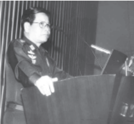
Secretary-1 General Khin Nyunt addresses presentation on e-Government tasks of e-National Task Force.