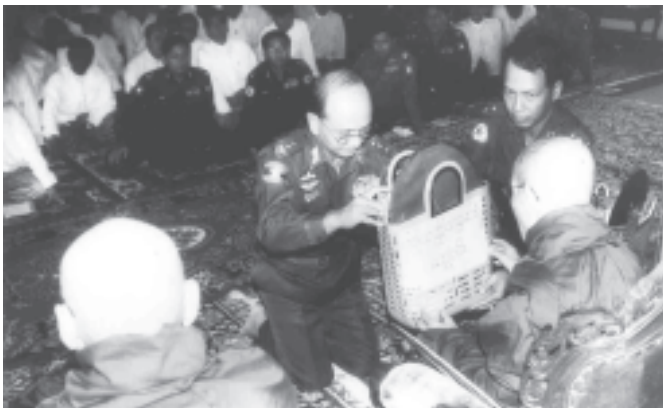
Adjutant-General Lt-Gen Thein Sein offers provisions to a Sayadaw at the ceremony to present offertories to monasteries, nunneries and Hninzigon Home for the Aged.