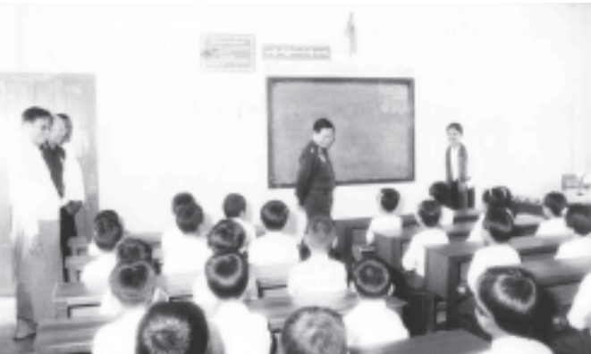
Secretary-1 General Khin Nyunt views students at BEPS No 6 in Ward 168, Dagon Myothit (Seikkan) Township (News page 7).