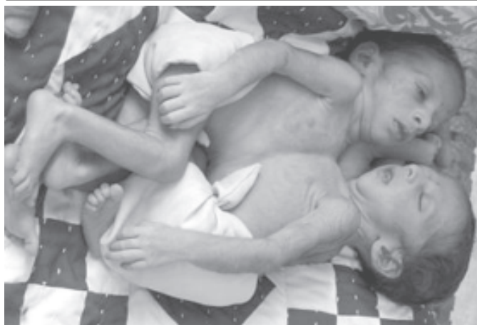
Ten-day-old conjoined twin girls are seen on 19 July, 2003 in Chorhutta, 135 kilometres east of Multan, Pakistan. The twins share a heart and liver, and their weight has fallen from four kilograms (8.8 pounds) to 3.5 kilograms (7.7 pounds).

Vice-Premier Wu Yi, who leads the headquarters, also spoke at the meeting, calling on the staff to sum up the experience, step up research and promote international exchanges in the field of SARS prevention and control, and cooperate with local governments in establishing an effective mechanism to deal with public health emergencies. —MNA/Xinhua