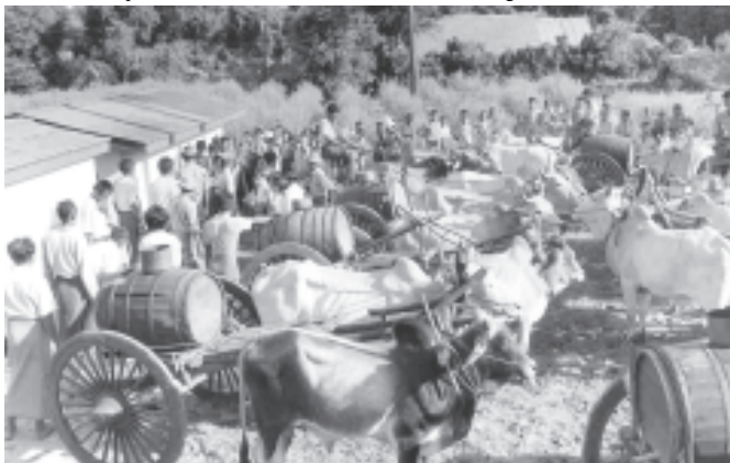
A tube-well at Kaungpinsi Village in NyaungU Township, source of clean water for the local people.