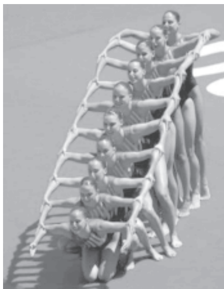
Swiss synchronized swimming team performs during the final of the free combination at the World Swimming Championships in Barcelona, on 16 July, 2003. Japan won the gold medal, and USA and Spain won the silver.