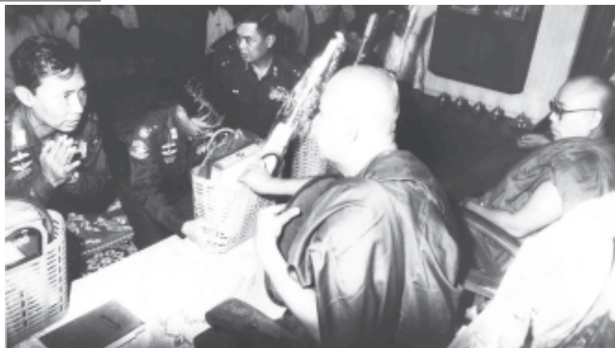
Secretary-2 Lt-Gen Soe Win offers donations to a Sayadaw of Zeyawady Monastery in Dawei. (News reported)