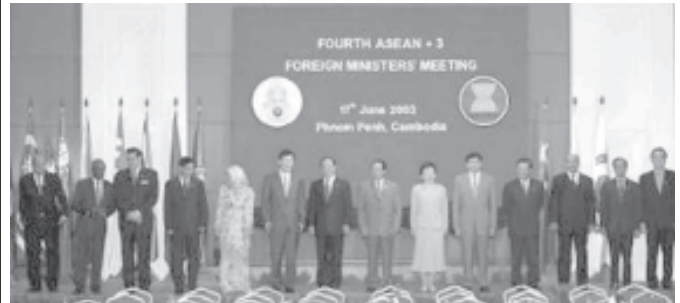
ASEAN Foreign Ministers pose with their counterparts from Japan, China and South Korea before the start of the Fourth ASEAN + 3 Foreign Ministers meeting in Phnom Penh, Cambodia on 17 June, 2003. — INTERNET

The conference is designed as the first preparatory meeting of the Asian-African Summit to commemorate the Golden Jubilee of the Asian-African Conference, which will be held in Bandung, Indonesia, in the year 2005. — MNA/Xinhua