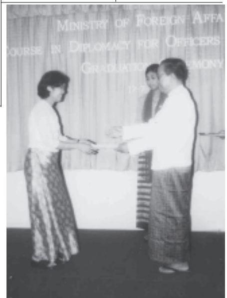
Minister for Foreign Affairs U Win Aung presents completion certificate to a trainee in Course in Diplomacy for Officers.— MNA

Also present were Myanmar Ambassadors, directors-general, rectors, professors, deputy directors-general and departmental officials. — MNA