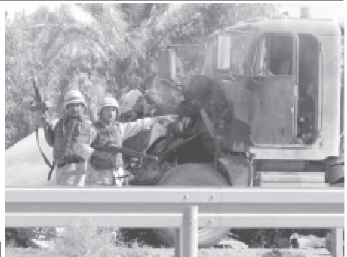
US Army soldiers secure the area near a destroyed transport truck after an attack west of Baghdad on Wednesday. One US soldier was killed and two were wounded.

"A more constructive UN role guided by common sense that will contribute to the organization's success in its mission before mankind," he said.