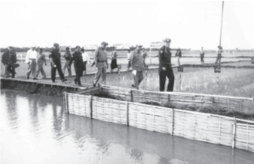
Lt-Gen Khin Maung Than inspects 100-acre model plot of monsoon paddy in Sangalay Village-tract, Nyaunglaybin Township.