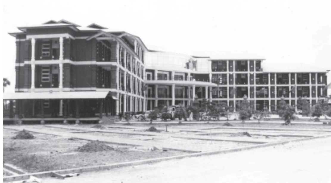
Yadanabon University in Mandalay, one of the new institutions of higher learning the government has built in upper Myanmar to develop human resources.— MNA