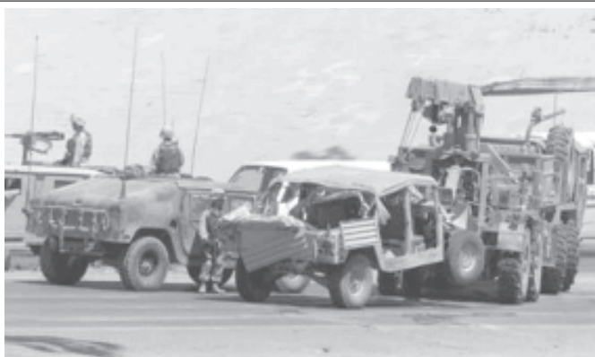
A US Army truck tows away the wreckage of a Humvee after insurgents attacked a patrol injuring three soldiers in southern Baghdad, Iraq on 16 July, 2003.

"We must seek other sources of funding, such as voluntary levies on certain private-sector commercial transactions, in the medium term, recourse to forms of international taxation," said Chirac. He did not give further details.