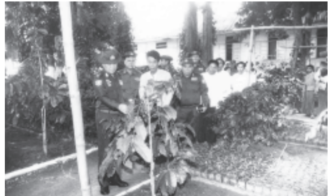
Lt-Gen Khin Maung Than inspects Kyauktaing Coffee Farm in Taungoo.

Lt-Gen Khin Maung Than and party also inspected the coffee plantations of U Saw Ti Tee at Ngwetauntlay Village in Taungoo Township. They arrived at Taungoo in the evening and stopped over there. —MNA