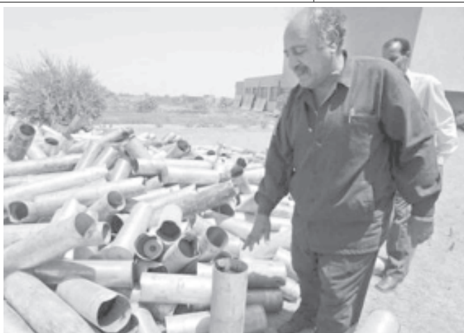
Mayor Mohammed Nayil al-Jurayfi's of Haditha, inspects a pile of confiscated empty shells outside the Haditha town hall, 300 kilometers, 186 miles northwest of Baghdad, Iraq on 1 July, 2003. The pro-American Haditha mayor and his son were killed in an ambush on 16 July, 2003, the US military reported.