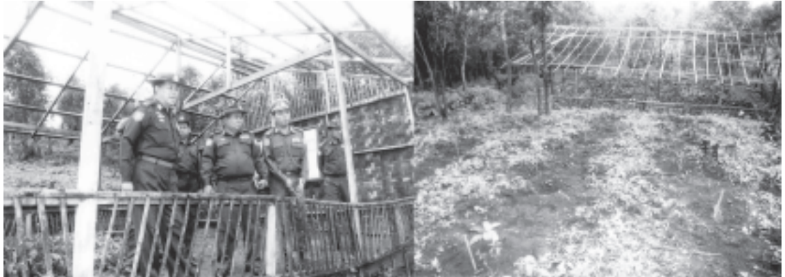
Lt-Gen Khin Maung Than and party inspect coffee farm of regiments and units in Thandaung Station.

It is found that of 439,500 acres of monsoon paddy targeted to be grown in Taungoo District, Bago Division, in 2003-2004, a total of 174,145 acres had been put under cultivation up to 14 July. Therefore, efforts are to be made to meet the target. Moreover, steps are also to be taken to obtain the targeted yield of the ten major crops of State — paddy, long staple cotton,