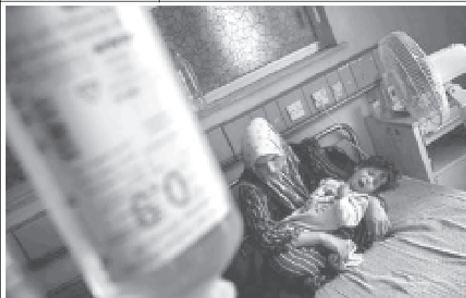
A mother comforts her three-year-old daughter in a children's hospital in Baghdad in this file photo. Baghdad's dilapidated hospitals are on the mend but patchy power supplies, rampant looting and shortages of medicine are slowing their recovery.