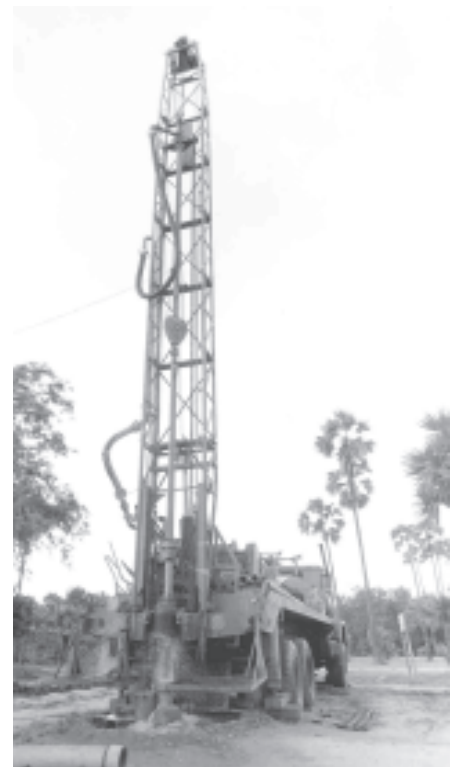
A tube-well drilling truck in action in the Dry Zone.

Up to now, all the 2" x 200' and 4" x 200' tube-wells have been sunk and only the tube-wells 400 feet and above deep are left to be sunk.