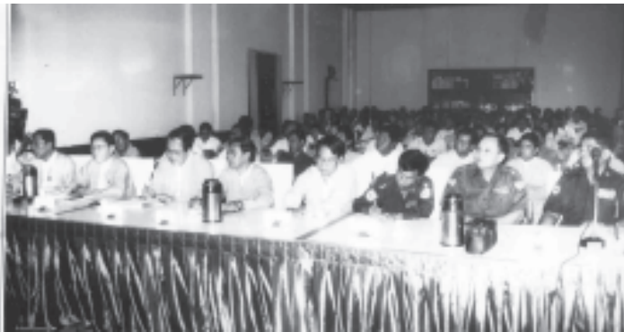
Commander Maj-Gen Myint Swe addresses meeting of Yangon Division Vegetables Cultivation and Livestock Breeding Zone.