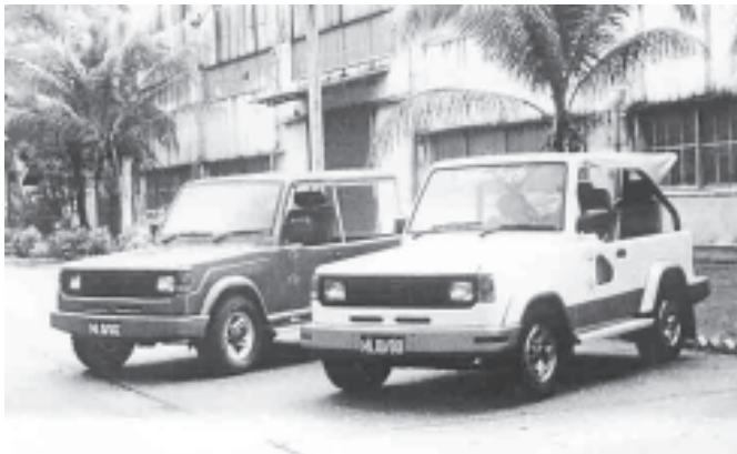
Myay Latt Jeep, a product of Myingyan Industrial Zone.