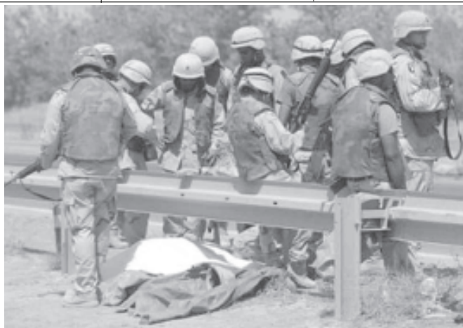
Dejected US soldiers stand next to their colleague after he was killed in another attack on a military convoy, on 16 July, 2003, in Baghdad, Iraq. A US soldier and an Iraqi child were killed and three others wounded in two separate attacks in the capital