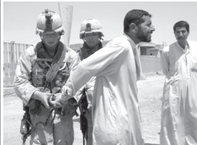
A US soldier uses plastic ties to handcuff one of two Iraqi men, in central Baghdad. US Defence Secretary Donald Rumsfeld and the top civil administrator in Iraq, Paul Bremer, warned that the violence that has shown no sign of letup would carry on through what they expected to be a "rough summer."