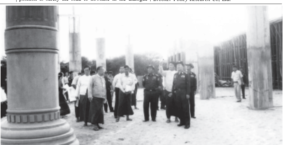
Secretary-1 General Khin Nyunt inspects progress in construction of Traditional Medicine University (Mandalay) on 6 July.