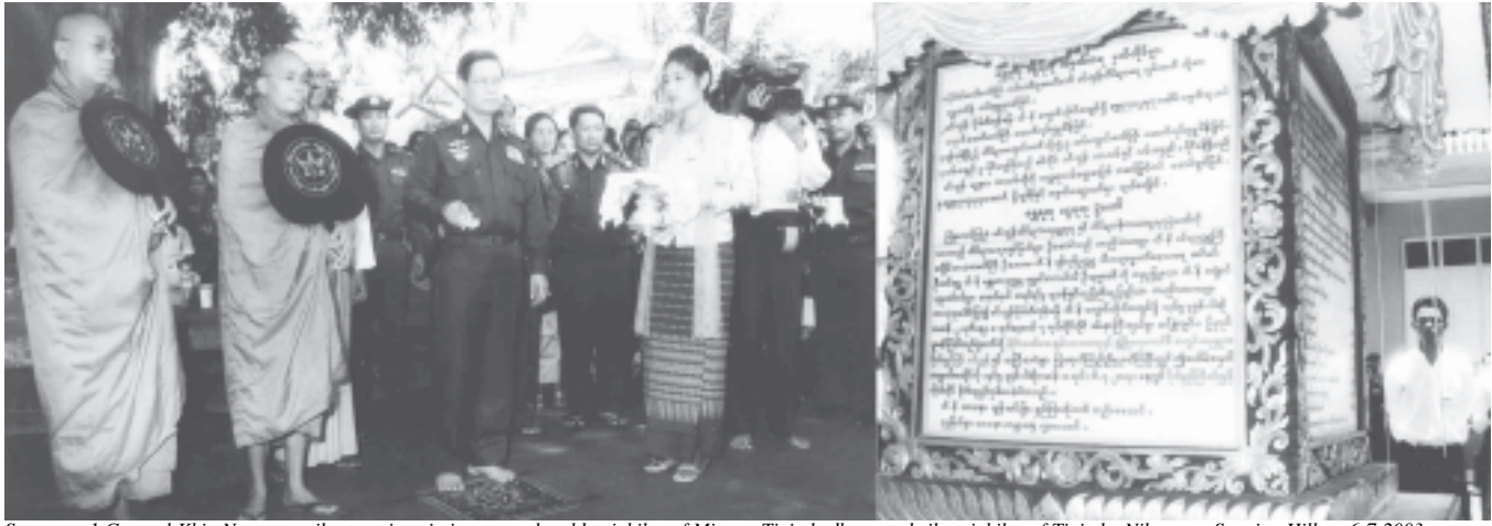
Secretary-1 General Khin Nyunt unveils stone inscription to mark golden jubilee of Mingun Tipitakadhara and silver jubilee of Tipitaka Nikaya on Sagaing Hill on 6-7-2003.