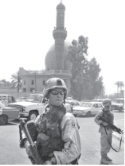
US soldiers guard a traffic circle in Baghdad, Iraq, on 6 July, 2003. US troops have come under near daily attacks from increasingly bold insurgents.