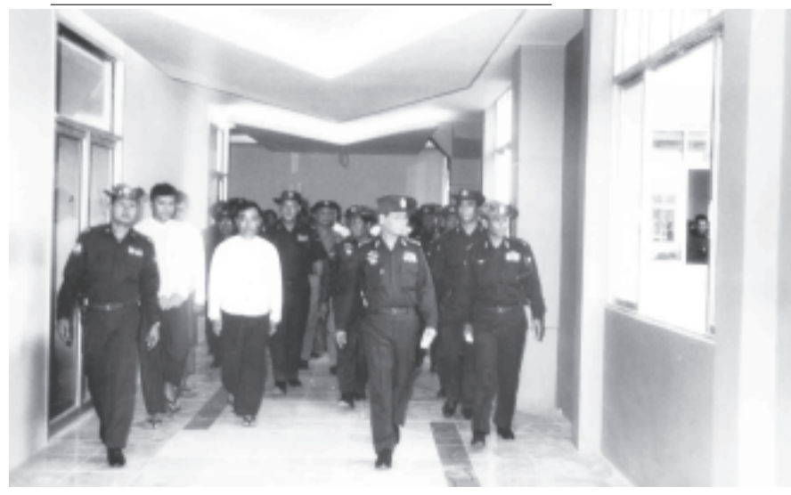
Secretary-1 General Khin Nyunt inspects construction works of MICT Park (Mandalay) at Yadanabon Market in Mandalay