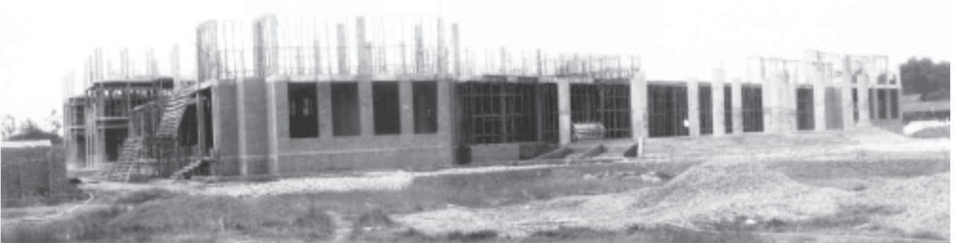
The University of Traditional Medicine (Mandalay) Contruction Project.