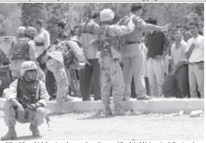
US soldiers frisk Iraqi students and employees of Baghdad University following the shooting of an American soldier on 6 July, 2003, in Baghdad, Iraq. The soldier was shot in the head as he waited in line to buy a soft drink at the university.

That attack came the same day seven US-trained Iraqi police recruits were killed when an "improvised explosive device" detonated in Ramadi, about 75 miles west of Baghdad, according to US authorities. At least 13 people were wounded in the blast, US military sources in Ramadi told CNN. The re cruits\,had\,been\,close\,to\,graduating\,from their training program.