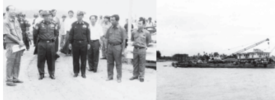
Lt-Gen Ye Myint inspects construction of Ayeyawady River Bridge (Yadanabon).— MNA