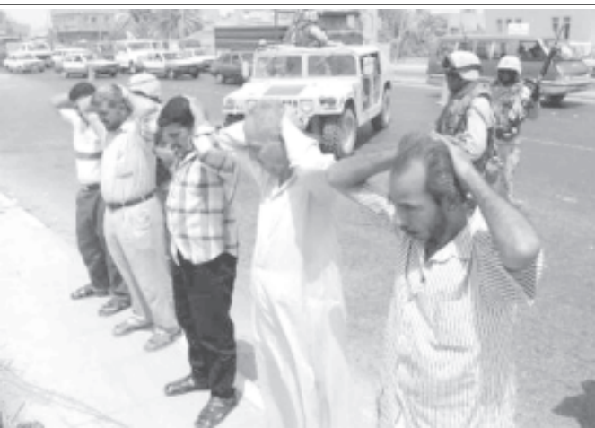
US soldiers frisk Iraqi motorists at a mobile checkpoint in Kadhamiya north of the capital Baghdad, Iraq on 7 July, 2003 where hours earlier a US soldier was killed in an attack on a US convoy. US troops in Iraq have come under near daily attacks from increasingly bold insurgents. — Internet

The sources said the train hit the truck while it was driving over the railway line away from a crossing point. All the dead and injured were travelling on the truck.-MNA/Reuters