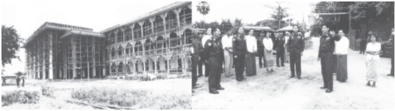
Lt-Gen Thura Shwe Mann and Secretary-2 Lt-Gen Soe Win inspect construction of Government Technological College in Pathein.