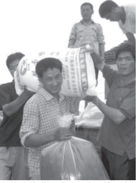
Members of the Chinese Communist Party deliver relief materials to residents in Wangijaha, east China's Anhui Province, on 6 July, 2003. More than 200,000 people have been evacuated from the areas designated for storing or diverting flood from the Huaihe River in the province.

US troops on patrol in Baghdad and other areas have been attacked several times a day, and Iraqi police and civilians perceived to be working with the occupying forces also have been targeted. In the most serious such attack, a bomb blast in the western town of Ramadi killed seven Iraqi police recruits as they graduated from a US-taught training course on Saturday, Dozens more were injured."