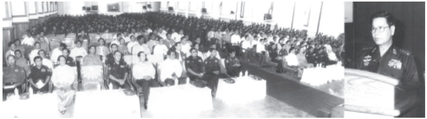
Secretary-1 General Khin Nyunt addresses Special Refresher Course No 18 for Basic Education Teachers at CICS (Upper Myanmar) on 6 July: - MNA