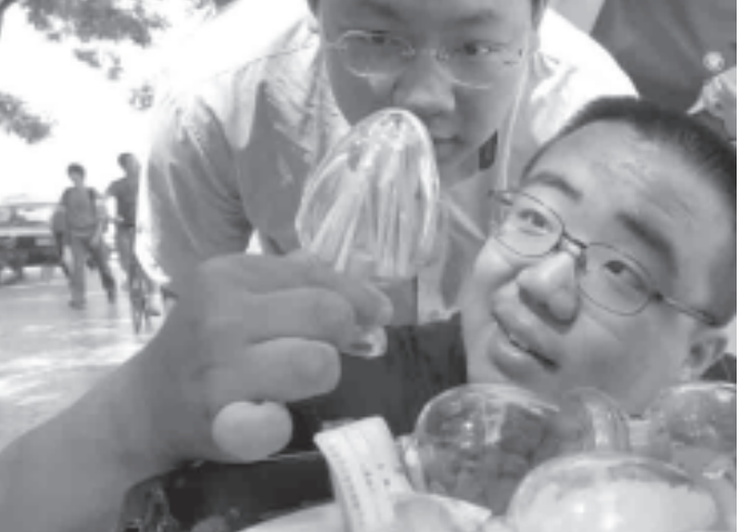
Two young men take a close look at different kinds of drugs during an anti-drug publicity campaign held in Beijing, on 25 June, 2003. The campaign was aimed at informing the residents, especially the youngsters, how harm drug will do to human body and their lives and dissuading people from getting addicted to drugs. —XINHUA PHOTO

Earlier this year, Ukraine's Parliament allowed refineries to import a total of 560,000 tons of raw sugar, including 360,000 tons at a duty of six euros per tons and 200,000 tons with a duty of 60 euros per ton. -MNA/Reuters