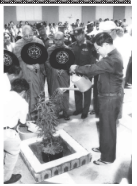
Secretary-1 General Khin Nyunt plants a Eugenia tree on Momeik Hill on 6-7-2003.

The ceremony ended with the three-time recitation of Buddha Sasanam Ciram Tittahtu.—MNA