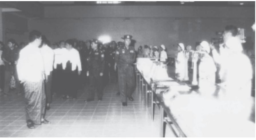
Lt-Gen Thura Shwe Mann and Secretary-2 Lt-Gen Soe Win inspect 750-ton capacity Cold Storage of Yuzana

The local people can send fisheries, rice and paddy, dried coconut and forest products to the market easily. They can go to western