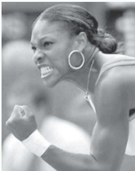
Serena Williams of the US celebrates her win against Belgium's Justine Henin-Hardenne in their semi-final match on center court at the Wimbledon Tennis Championships in London, on 3 July, 2003. Williams won the match 6-1.