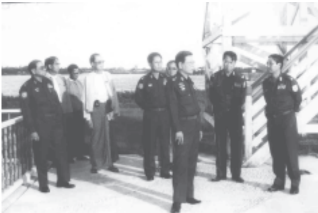
Secretary-1 General Khin Nyunt inspects construction of Yangon-Thanlyin Bridge No-2.