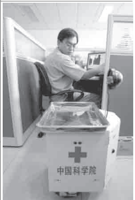
A Chinese scientist watches a newly developed robot that will be used to help in the fight against SARS in hospitals in Beijing on 3 July, 2003. The Chinese Academy of Sciences has developed the robot to assist doctors and nurses in certain aspects of their daily jobs. The remote-controlled robot can also be used to carry information in locations that are not easily accessible, or even dangerous, for humans.

In addition, he said, several countries in Europe were in need of around 30,000 Thai workers, whether traders, nurses, masseurs, or caddies, but stipulations that the workers must be proficient in English currently posed an obstacle for Thai labourers.—MNA/Xinhua