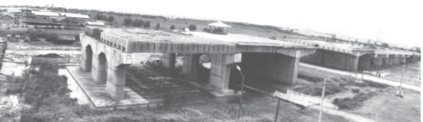
The construction of Yangon-Thanlyin Bridge No 2 in progress. (News on page 1) — MNA

YANGON, 12 June — The Nursery Market Festival continued at Myaypadetha Park in Bahan Township here today with the aim of providing necessary assistance to growers and attracting the public to take interest in agriculture, horticulture, livestock breeding and vegetable farming. Kitchen crops, fruits and saplings of herbal plants are being shown at the festival. — MNA