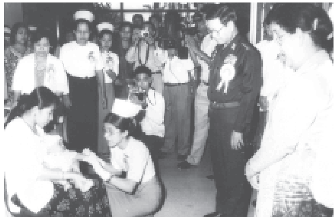
Secretary-1 General Khin Nyunt views vaccination of Hepatitis B to a child under the programme of Hepatitis B Vaccination in the Expanded Programme of Immunization (GAVI).

In implementing the National Health Plan at various levels, the Government of the Union of Myanmar has covered the whole country including the border areas and hard to reach areas. New hospitals have been built and existing hospitals have been expanded and upgraded. In order to enhance the quality of health care, modern diagnostic and therapeutic equipment and necessary medicines have been supplied to all the hospitals. Surgeons, physicians and specialists have been also assigned to the hospitals, including the rural areas to render quality services. In addition, special programmes for vulnerable groups such as women and children have been implemented. Programmes have also been implemented to prevent and control communicable diseases, which pose a threat to the health of the people.