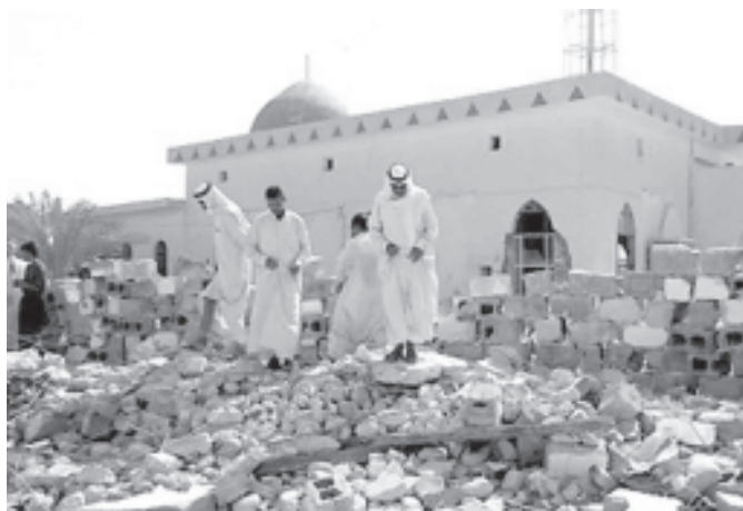
US Army soldiers look at one of their vehicles which was hit by a rocket-propelled grenade in Baghdad on 3 July, 2003. At least one US soldier and two Iraqi passers-by were wounded and in a separate incident other six US soldiers were wounded in western in the latest of a spate of increasingly bold guerrilla-style attacks.