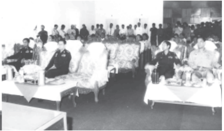
Secretary-1 General Khin Nyunt hears reports on construction of Yangon-Thanlyin Bridge-2 by Minister for Construction Maj-Gen Saw Tun.