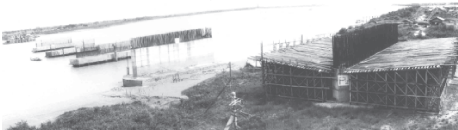
The construction of Yangon-Thanlyin Bridge No 2 in progress. (News on page 1) — MNA

What I wish to say is that for us it is more important for the entire NLD party to be active on a higher political (See page 9)