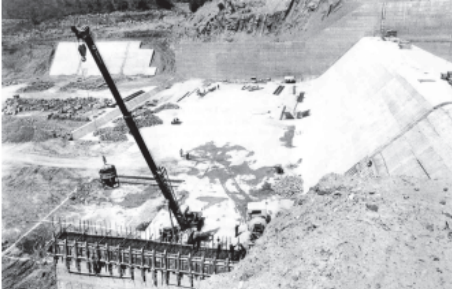
Aerial view of Mone Creek Multi-purpose Dam Project being built in Magway Division.