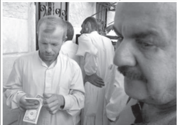
A former Iraqi soldier counts his money after receiving an interim relief of US$ 60 in Baqubah, Iraq on 3 July, 2003. The relief was granted after former soldiers demonstrated for days in different parts of Iraq for their back wages.

UNIKOM was created in April 1991 to deter violations and report on hostile action along the border between Iraq and Kuwait following the Gulf war, which ended Iraq's brief occupation of Kuwait.