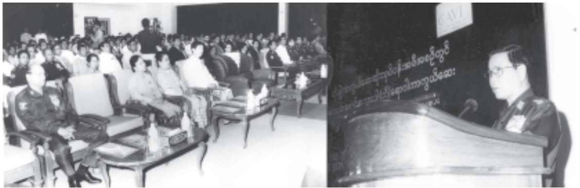
Secretary-1 General Khin Nyunt address Launching of Hepatitis B Vaccination in the Expanded Programme of Immunization .