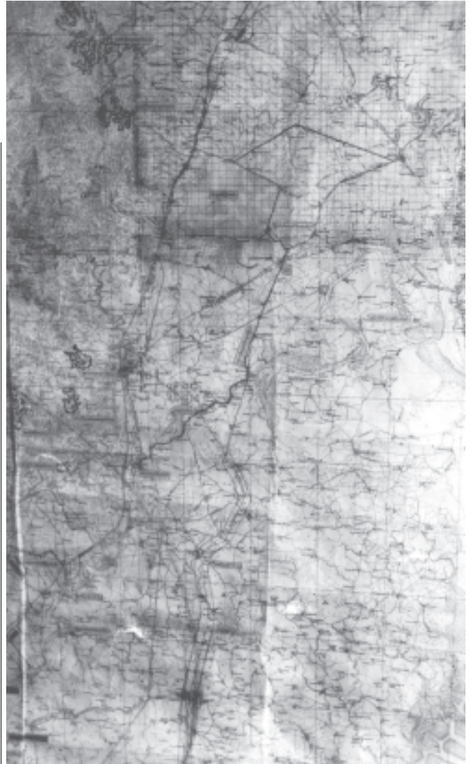
The map showing water supply system to Kayan and Thongwa townships from Moeyungyi Lake through canals.— MNA

The grand stand fee is K 500 per head and stall K 200. — MNA