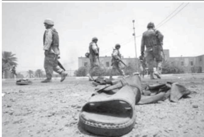
US soldiers walk at the site of explosion of a plastic bag filled with explosives during a demonstration against the US Army's detention of Shiite religious leader Ali Abdul-Kareem Al-Madney in Baqubah, Iraq on 3 July, 2003. One person was killed and at least five injured in the explosion. The slippers and bloodstain mark the site of the explosion.