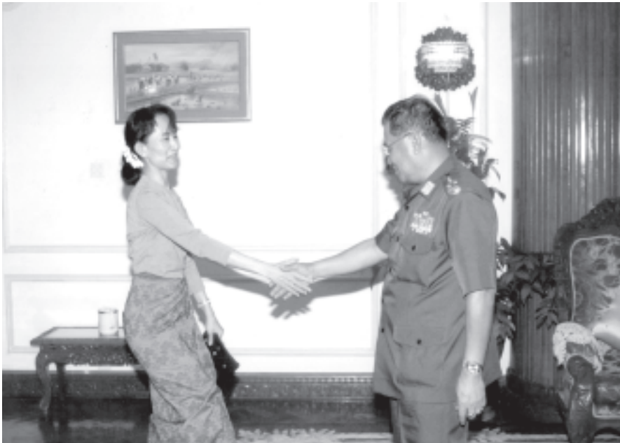
EXCHANGING CLEAR SMILES & SHAKING TRUSTFUL HANDS: Head of State Senior General Than Shwe and Daw Aung San Suu Kyi meet cordially. (Article on pages 8 and 9)