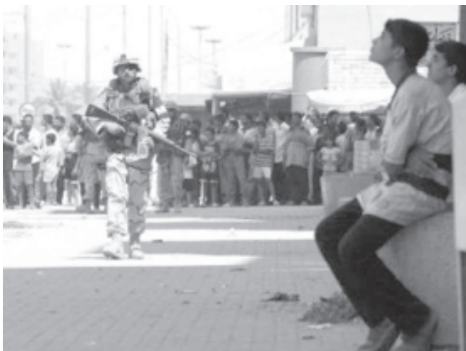
A US soldier keeps Iraqis away from the scene along Haifa street in Baghdad, Iraq after unknown men fired an RPG (Rocket Propelled Grenade) at a passing Humvee, military vehicle on 3 July, 2003. One Iraqi was killed and a US female soldier was injured in the attack.

United Nations agencies predict a food deficit of 60 per cent for 2003, and malnutrition rates in some parts of the state are as high as 35 per cent. "The livestock population has been depleted due to a lack of pastures, and agricultural activities have been seriously limited due to the lack of rain," said Mahmoud Omer Osman, secretary general of the Sudanese Red Crescent Society. "Communities are being torn apart as fathers leave to seek alternative employment and children are forced to abandon their education," he added. —MNA/Reuters