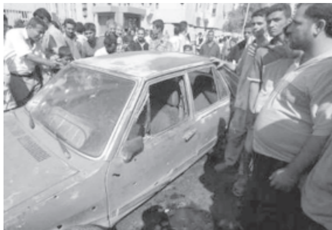
Iraqi men look at a damaged car which was near a US Army vehicle which was hit by a rocket-propelled grenade in Baghdad on 3 July, 2003. At least one US soldier and two Iraqi passers-by were wounded in the attack on Thursday and in a separate incident six US soldiers were wounded in western Iraq in the latest of a spate of increasingly bold guerrilla-style attacks.

မြို့ခြံချွေတာ၊ ထိန်းပါးလေလွင့်၊ ထုတ်ကုန်မြင့်