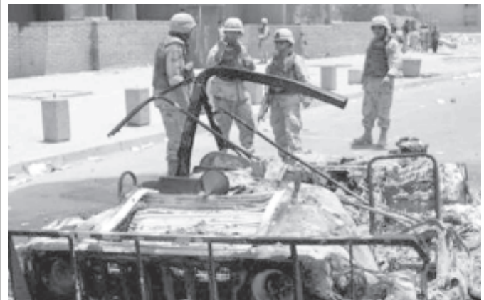
Iraqis walk on the rubble of the destroyed section of the al-Hassan mosque in the town of Fallujah, some 50km west of Baghdad, where an imam and six theology students were killed in an explosion on 30 June.