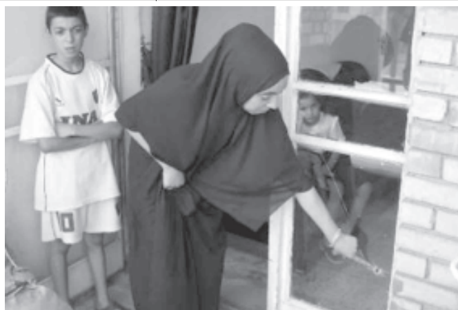
An Iraqi woman points to a bullet hole in the glass door of her home after US soldiers chased unknown assailants who fired an RPG (Rocket Propelled Grenade) at a passing Humvee vehicle on 3 July, 2003, in Baghdad, Iraq. According to witnesses, one soldier was wounded and an Iraqi bystander was killed.

"The ministers have also agreed to enhance the ASEAN Energy Business Forum (AEBF) as an important platform for facilitating business interaction, technology exchange and project financing opportunities between ASEAN energy authorities and the private sector," he said.