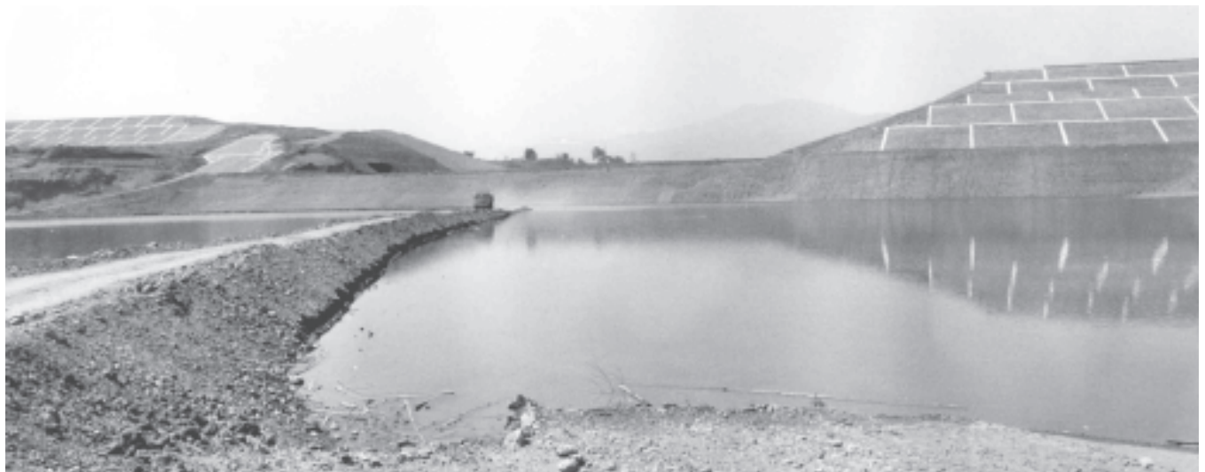
Progress in construction of Mone Creek Dam Hydrel Power Project being implemented in Magway Division.