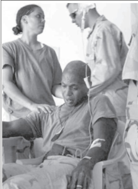
A US Army soldier from the 3rd Infantry Division 2nd Brigade is treated for heat exhaustion in Fallujah, Iraq on 3 July, 2003. With temperatures soaring in Iraq, more and more soldiers are suffering the effects of summer. The unidentified soldier was not in serious condition.