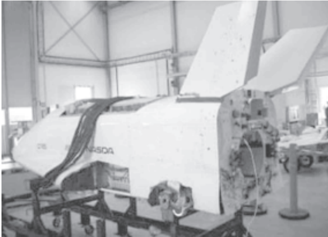
Japan's space shuttle, an unmanned swallow-tailed craft only 3.8-meters (12.5-feet) long, is seen with its left wing seen broken, after the 5-minute flight, at an international test site in Kiruna, northern Sweden on 1 July, 2003. The shuttle took the flight, lifted by a stratospheric balloon to the frigid height of 21 kilometers (13 miles) above the test site. The shuttle was then released and hit speeds up to mach 0.8 during the plunge. But as the shuttle barreled toward earth, two of the craft's three parachutes failed to open properly and the shuttle crashed into a field, breaking its left wing and nose cone.