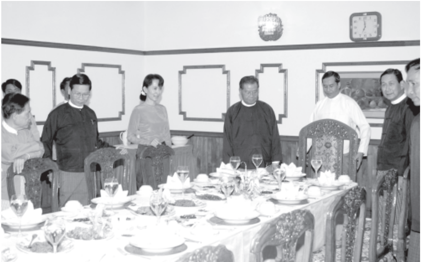
State Peace and Development Council Members headed by Chairman Senior General Than Shwe and NLD Party leadership seen at a family dinner.