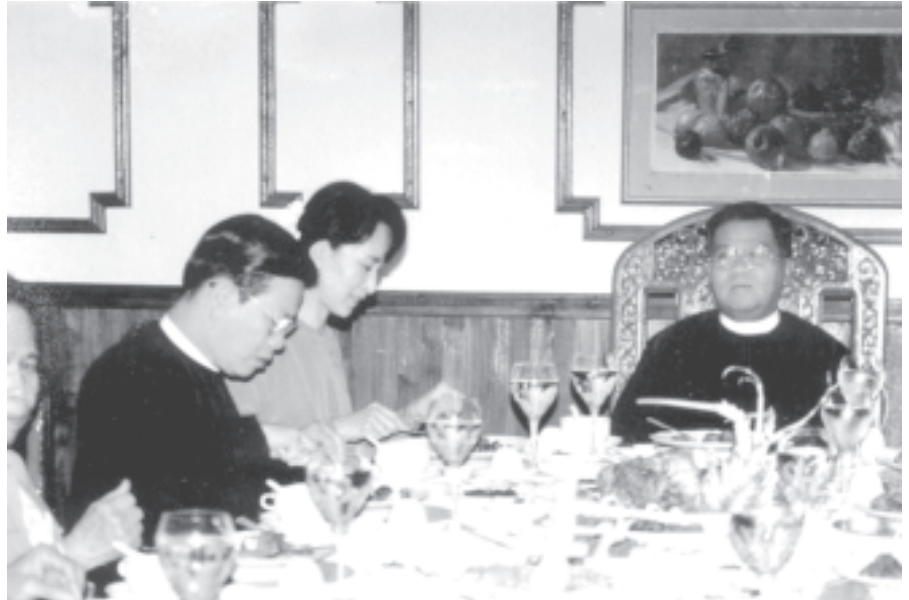
Frank and cordial exchange of views can lead to consolidated national political future of the nation.

Yes! -We had a plan to travel to Shan State (South) and Shan State (East). The original plan was to travel from Taunggyi to Kengtung by car. One of the granduncles who belonged to the party leadership had even given instructions to take along pick-axes and shovels on this journey. Another granduncle, who always spoke with