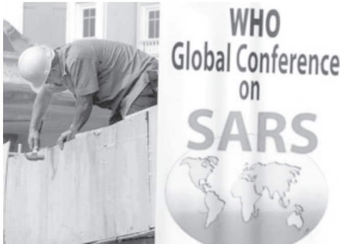
A worker constructs a building next to a banner of World Health Organization Global Conference on SARS on display at a construction site in Kuala Lumpur on 16 June, 2003. Scientists and health officials are gathering in Malaysia for a conference to assess the global response to SARS and consider ways to minimize deaths from future outbreaks.