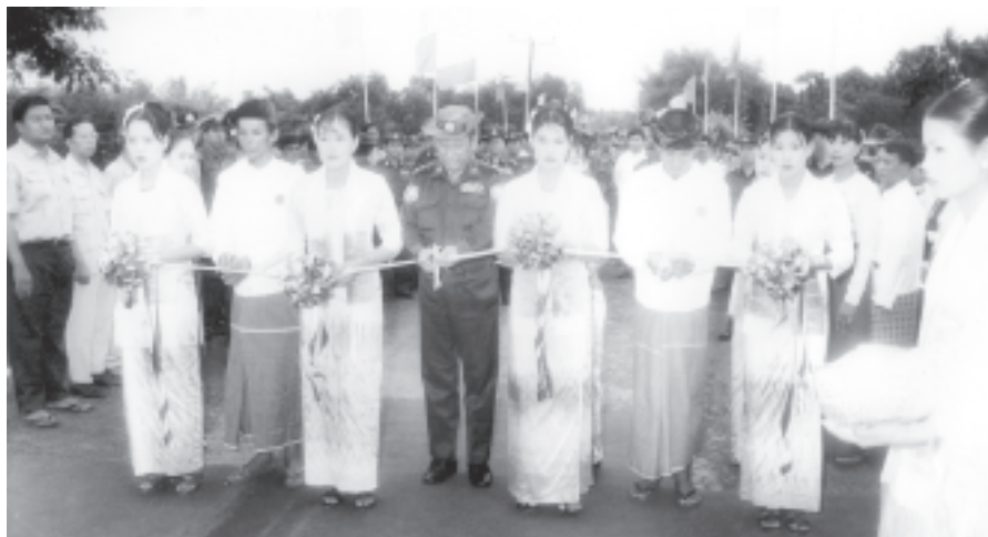
Secretary-1 General Khin Nyunt attends the opening ceremony of Cheinchaung Bridge in Zokthok Village and the bridge in Anaingpon Village in Bilin Township. (News reported)— MNA