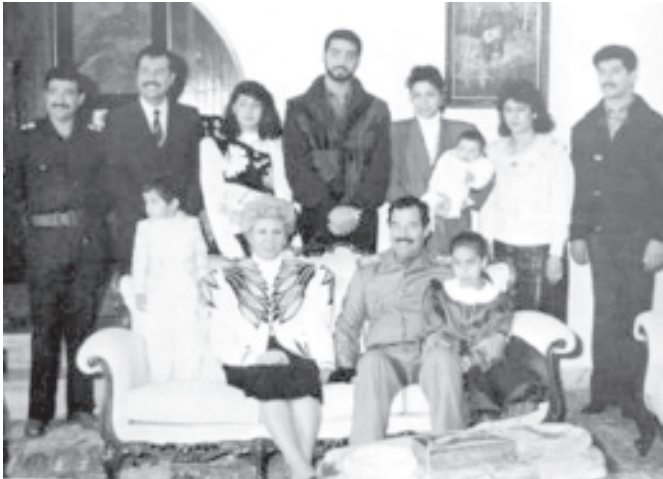
This is a 1990 picture of Iraqi leader Saddam Hussein, centre seated, with his family. At the back row, from left, are Hussein Kamel, Saddam Kamel, his wife and Saddam Hussein's daughter, Rana, Hussein's oldest son Odai, Hussein Kamel's wife and Saddam Hussein's oldest daughter, Raghad. In her arms is her son Ali, the President's first grandson. Others in the photo are unidentified. Raghad has not seen her father since before the US-led war, but believes he is still alive, the British newspaper The Sunday Times reported on 15 June, 2003.