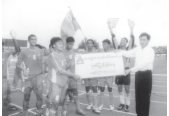
An official of Kanbawza Bank Ltd presents K 5 million to Myanmar youth team.