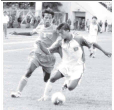
Myanmar and Vietnamese youth players tussle the ball in the first semi-final match. (News on page 16)