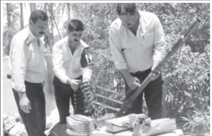
Iraqi police inspect a 50-caliber anti-aircraft gun and bullets turned over by an unidentified Iraqi resident a day after the deadline for the weapons amnesty campaign by the US forces have elapsed on 15 June, 2003 in al-Sulaigh Police Station in Baghdad, Iraq. Few Iraqis turned in their weapons during the first week of a 14-day amnesty programme for illegal guns, US Central Command said Sunday. —INTERNET

Although Bloomberg has tried to forge close ties with minority New Yorkers, the poll did not show that his efforts were paying off. For instance, his approval rating among Whites is 31 per cent, but only 15 per cent among Black respondents and 19 per cent among Hispanic residents. — MNA/Xinhua