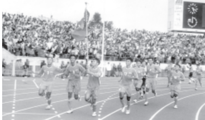
Myanmar youth team who beat Vietnamese youth 2-0 carrying State Flag on the track of Youth Training Centre in Thuwunna.