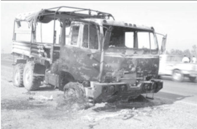
The remains of a US army truck is seen near Balad 40 kilometres, (25 miles) north of Baghdad, Iraq, on 16 June, 2003. The truck was attacked in an ambush on 15 June with a number of soldiers injured. —INTERNET

"The federalist vision of a single EU foreign policy, implemented by a central bureaucracy without the consent of all the governments, is neither realistic nor desirable," the Financial Times quoted the minister, Dennis MacShane, as saying. The EU, soon to span 25 countries from the Atlantic to Russia's borders, on Friday adopted the first draft constitution for an enlarged union. An EU foreign minister was among its proposals. — MNA/Reuters