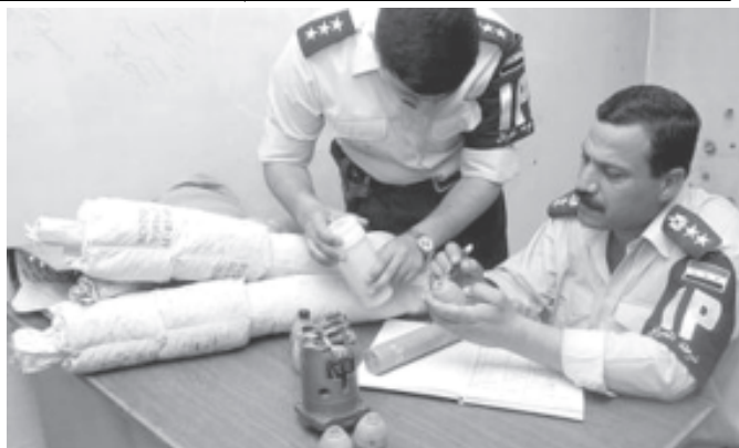
Iraqi police inspect bomb-making materials turned over by an unidentified Iraqi resident a day after the deadline for the weapons amnesty campaign by the US forces has elapsed on 15 June, 2003 in al-Sulaigh Police Station in Baghdad, Iraq. Few Iraqis turned in their weapons during the first week of a 14-day amnesty programme for illegal guns, US Central Command said Sunday. —INTERNET