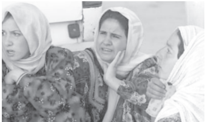
Women cry as US troops raid their house at Khaldiya, 70 kms (40 miles) west of Baghdad, Iraq on 16 June, 2003. Hundreds of US troops backed by tanks and helicopters raided several cities and villages on the second day of 'Operation Desert Scorpion', arresting suspected militia leaders and seizing illegal weapons.

Among previous winners, Roald Dahl, one of the world's leading children's authors, and JK Rowling, creator of boy wizard Harry Potter, are worldwide well-known big stars.