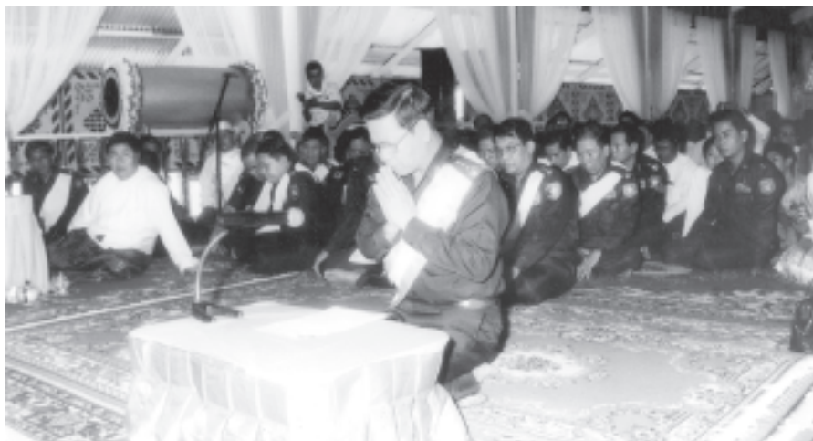
Secretary-1 General Khin Nyunt supplicates religious affairs to Sayadaws at the ceremony to hoist Shwehtidaw atop Kyaikhtisaung Pagoda in Bilin Township. (News reported on 15-6-2003)

They then went to Ayeyawady (Yadanabon) Bridge construction site on Sagaing Bank. Responsible engineers reported on tasks being carried out and progress on both banks. The minister then urged officials to carry out the tasks systematically and gave instructions on timely completion of work and approach road construction.