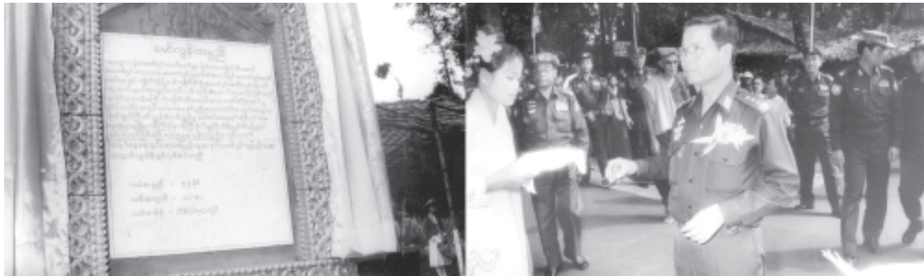
Secretary-1 General Khin Nyunt formally unveils the stone inscription to mark the opening ceremony of Shwewahyaung road section-4 linking Bilin and Kyaikto townships in Mon State. (News reported on 15-6-2003)