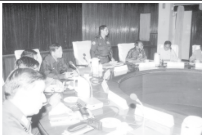
Commander Maj-Gen Myint Swe addresses coordination meeting of work Committees for keeping Yangon City clean and pleasant and upgrading tasks.