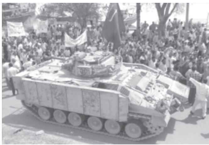
Iraqi protesters gather around a British tank during a rally in the southern Iraqi city of Basra. Some 12,000 Iraqi Shiite Muslims marched in Basra to demand the withdrawal of British occupation forces from Iraq's main southern city.