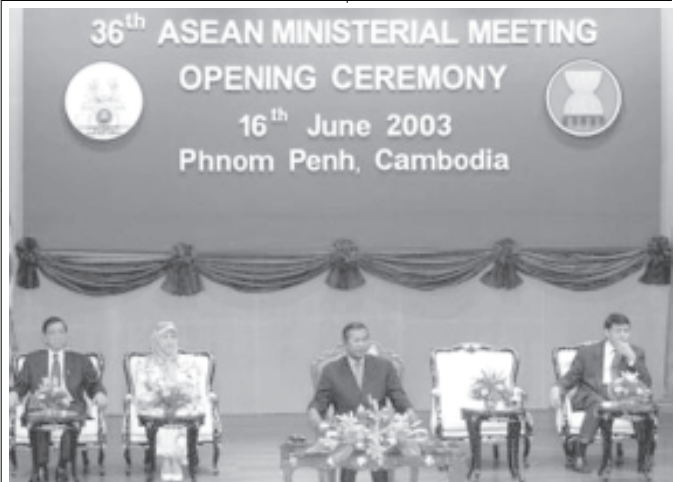
Cambodian Prime Minister Hun Sen, centre, presides over the opening session of ASEAN Foreign Ministers Meeting on 16 June, 2003, in Phnom Penh, Cambodia.

China's position and all the measures it takes provide frameworks for the promotion of mutual confidence among nations and substantially benefit peace and stability of the region, it emphasized. —MNA/Xinhua