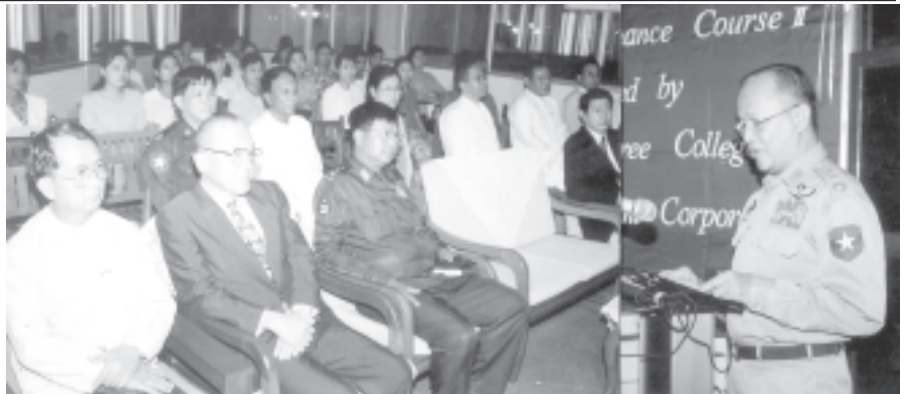
Minister Lt-Gen Tin Ngwe addressing the opening of the Financial Management Course-II.

လယ်ယာစိုက်ပျိုးရေးနှင့်ဆည်မြောင်းဝန်ကြီးဌာန