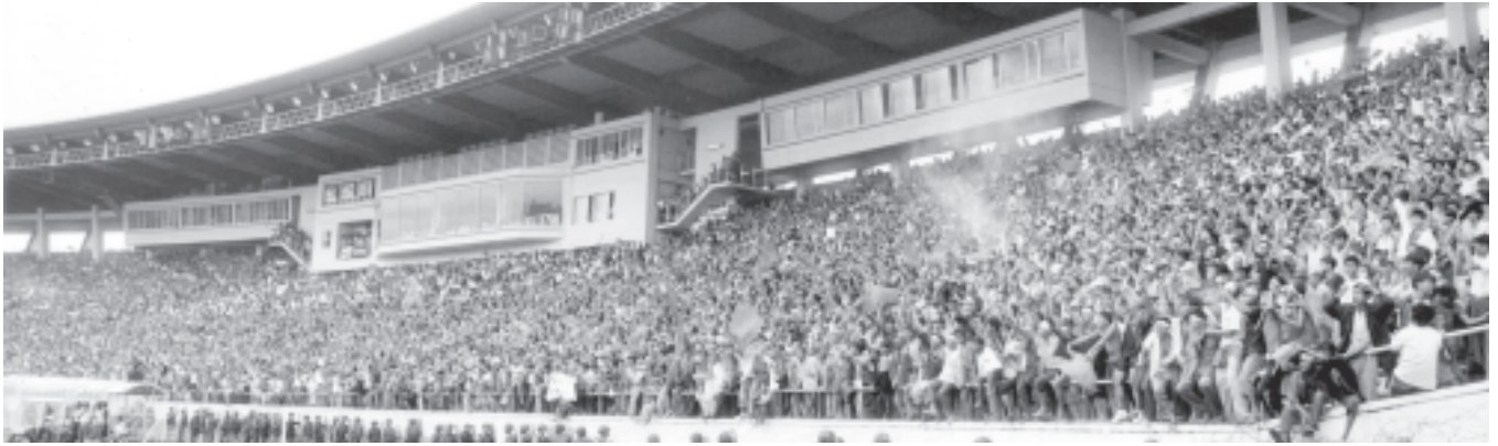
Myanmar soccer fans enjoy the first semi-final match between Myanmar and Vietnamese youths. (News on page 16)— NLM