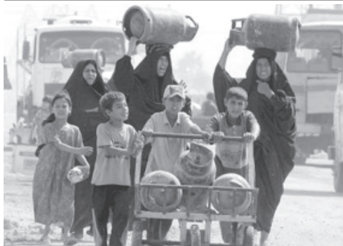
Women carry empty gas canisters to a gas factory in Baghdad, Iraq, on 15 June, 2003.

"This is not a routine inquiry. This goes to the heart of our intelligence. Is it objective, or has it been shaded — has it been stretched by the intelligence community to reach some conclusion?" questioned Senator Carl Levin, the top Democrat on the Senate Intelligence Committee. "The dangers to our future are great if we cannot rely on the intelligence community to give us objective, credible evidence," he told CBS. — Internet