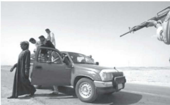
Iraqi motorists disembark from their vehicle at a checkpoint prior to being frisked by US troops near Fallujah, 80 kms west of Baghdad on 15 June, 2003. Hundreds of US troops backed by tanks and helicopters raided the restive town of Fallujah and neighbouring places arresting suspected militia leaders and seizing illegal weapons in a major operation.