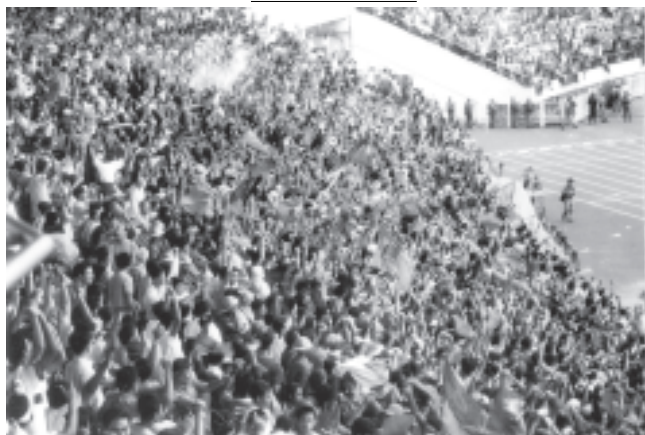
Myanmar soccer fans unanimously enjoy first semi-final match between Myanmar and Vietnamese youths in 1st ASEAN U-18 Soccer Tournament at Youth Training Centre in Thuwunna.