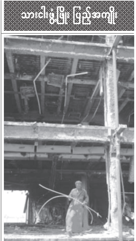
An Iraqi man takes pipes from the bombed Olympic sports building in Baghdad, Iraq, on 15 June, 2003.