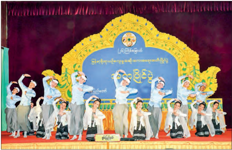
The traditional Dawei dance contest.