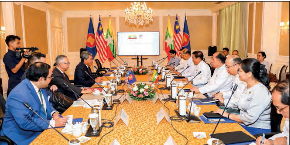
MoFA Union Minister U Than Swe holds talks with the Malaysian Foreign Minister and his delegation yesterday.

During the meeting, Union Minister U Than Swe briefed on the continued efforts of the Government of Myanmar to restore peace and stability in the country, ongoing negotiations with Ethnic Armed Organizations to achieve long-lasting peace, and preparations for holding