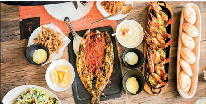
This event brings together a select group of experts, innovators, and industry leaders to address pressing challenges in food, agriculture, and sustainability.

UNDER the patronage of His Highness Sheikh Mansour bin Zayed Al Nahyan, Vice President, Deputy Prime Minister, Chairman of the Presidential Court, and Chairman of the Board of Directors of the Abu