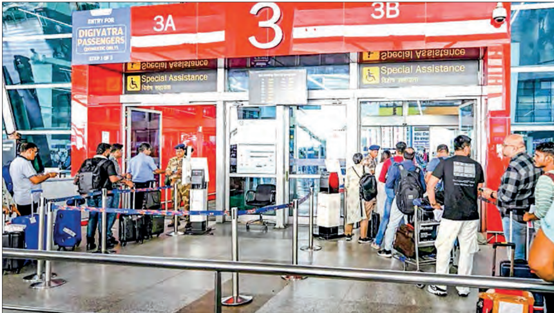
Flight passengers align at security check points in the Indira Gandhi International Airport of New Delhi.

This development stems from the key consensus reached by President Xi Jinping and Prime Minister Narendra Modi during their 31 August meeting in Tianjin.