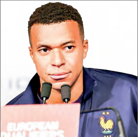
Florian Wirtz celebrates after scoring a goal in Germany's 3-1 win over Northern Ireland in September. PHOTO: AFP

The trial competition will continue until 10 October. — Arkar Linn/KZL