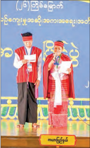
From Kayah State.