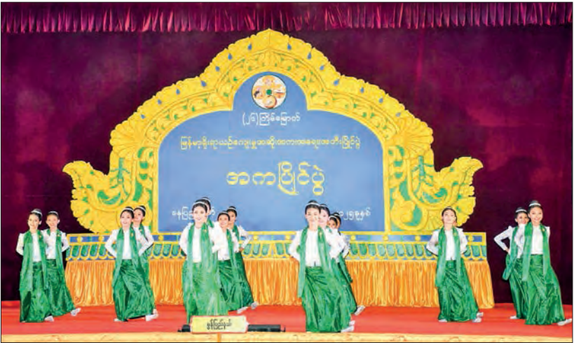
A female dance contest at basic education level (aged 10-15).