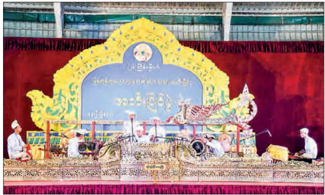
Photos show contestants participating in the traditional Myanmar orchestra contests of the 26 th Performing Arts Competitions (Central Level).

The people are urged to receive vaccination of COVID-19 without fail as full-time vaccination of COVID-19 and receiving booster shots can effectively mitigate infection of the virus, severe suffering from the disease and increase of death rate due to the disease.