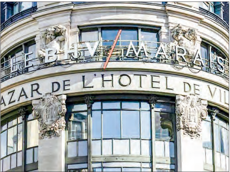
Shein will open its first permanent physical store at the historic BHV Marais department store in front of the Paris city hall.

Founded in China and now based in Singapore, the fast-fashion giant sells a wide variety of products at ultra-competitive prices. — AFP