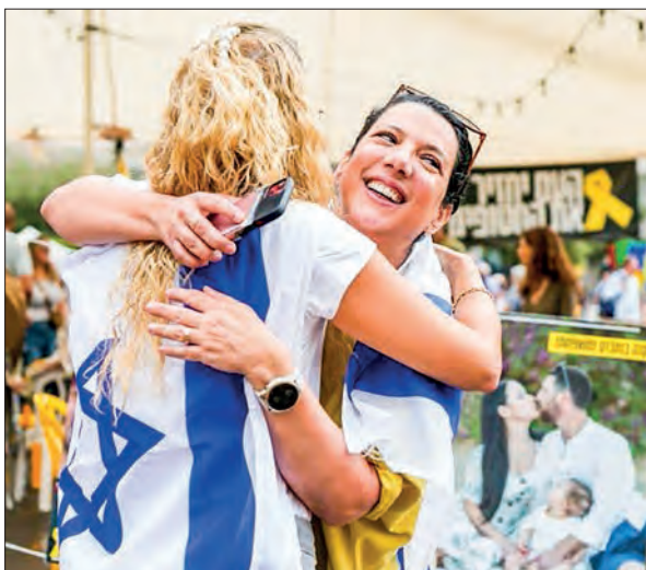
Israelis jumped, clapped and sang in Hostages Square in Tel Aviv following the announcement.

THE ceasefire agreement in the Gaza Strip gives the people of the region hope for a just and stable tomorrow, Egyptian President Abdel Fattah Sisi said on Thursday.