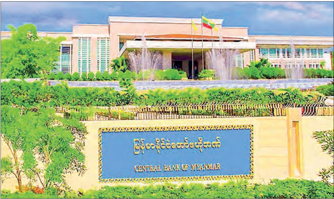
The facade of the Central Bank of Myanmar (CBM) in Nay Pyi Taw.

THE Central Bank of Myanmar (CBM) announced on 8 October that it would sell US$30 million to those engaged in the fuel oil industry. CBM also sold over $1.87 million to edible oil-importing companies and over $530,290 to fuel oil-importing companies on that day, in addition to an injection of over 4.98 million baht and over 21,480 yuan into the market. CBM injected over $2.9 million into edible oil-importing companies on 3 October 2025. CBM sold over $2.6 million to edible oil-importing companies and $656,270 to fuel oil-importing companies on 2 October, in addition to an injection of over 524,200 yuan into the foreign exchange market. CBM announced on 2 October that it would sell $25 million to fuel oil entrepreneurs.