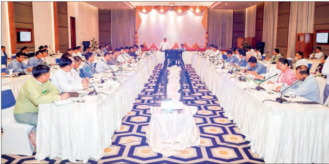
The fourth coordination meeting of the Steering Committee on the NCA 10 th Anniversary Celebration in progress yesterday, addressed by Union Minister Lt-Gen Yar Pyae.

THE Steering Committee on the 10 th Anniversary Celebration of the Nationwide Ceasefire Agreement (NCA) held its fourth coordination meeting yesterday afternoon at M Gallery Hotel in Nay Pyi Taw.