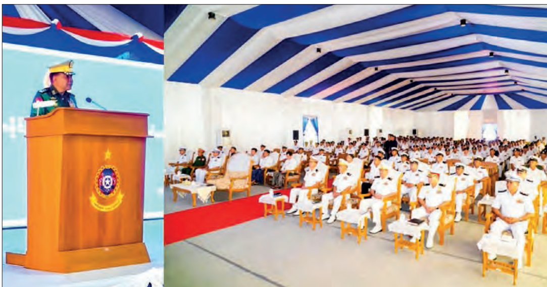
Union Minister General Maung Maung Aye speaks on the fourth anniversary of the founding of the Myanmar Coast Guard yesterday.

UNION Minister for Defence General Maung Maung Aye attended the fourth anniversary of the founding of the Myanmar Coast Guard yesterday.