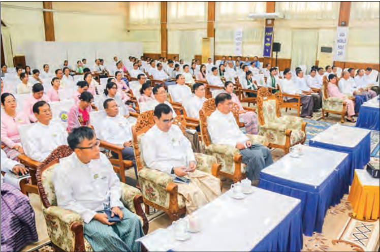
Union Minister U Mya Tun Oo speaks on the 151 st World Post Day held in Nay Pyi Taw yesterday.

A video message from the UPU Director General and a commemorative clip were also screened during the event. Awards were also presented to winners of the 54 th International Letter-Writing Competi-