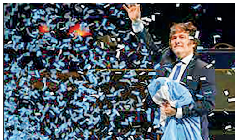
Argentine President Javier Milei presents his book "The Construction of the Miracle" on 6 October 2025, in Buenos Aires.

The president "will name a prime minister within 48 hours", the presidency said in a statement to AFP, adding a "path was possible" to agree a budget by the end of the year. — AFP