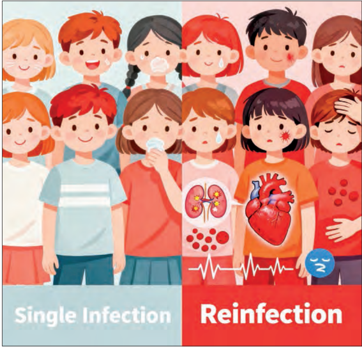
Children and adolescents were twice as likely to experience long COVID after catching COVID for the second time, compared to their peers with a single previous infection.

The study suggests that long COVID may become a persistent pediatric health issue with serious long-term effects.