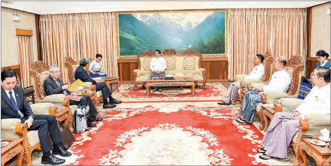
Malaysian Foreign Minister Dato' Seri Utama Haji Mohamad Bin Haji Hasan pays a courtesy call on Prime Minister U Nyo Saw yesterday.

Also, present at the meeting were Union Minister for