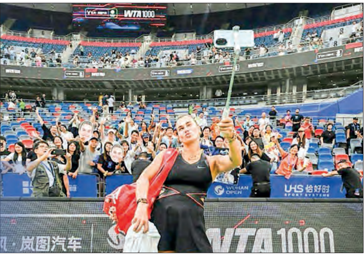
Aryna Sabalenka takes a selfie after beating Liudmila Samsonova in Wuhan.

balenka told reporters. "I hope I was a great hitting partner. So far, he's winning in Shanghai, so I guess I was," she added. Sabalenka did not face a break point against Samsonova and was impressive on her second serve, dropping just three points. — AFP