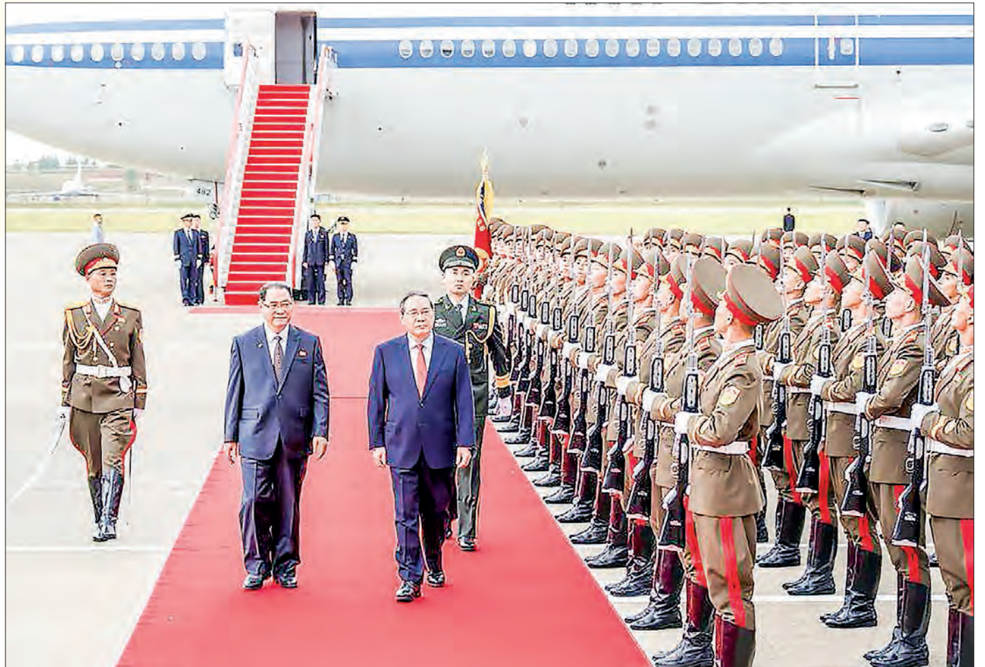
Chinese Premier Li Qiang, also a member of the Standing Committee of the Political Bureau of the Communist Party of China Central Committee, reviews the guard of honour with Pak Thae-song, premier of the cabinet of the Democratic People's Republic of Korea (DPRK) and presidium member of the Political Bureau of the Workers' Party of Korea (WPK) Central Committee, during a welcome ceremony at Pyongyang Sunan International Airport in Pyongyang, DPRK, 9 October 2025.

Upon arrival, Li said that China and the DPRK, as socialist neighbours connected by mountains and rivers, enjoy a profound traditional friendship. In recent years, under the strategic guidance and personal efforts of General Secretary Xi Jinping and General Secretary Kim Jong Un, China-DPRK relations have been brimming with new dynamism and vitality, said Li. — Xinhua