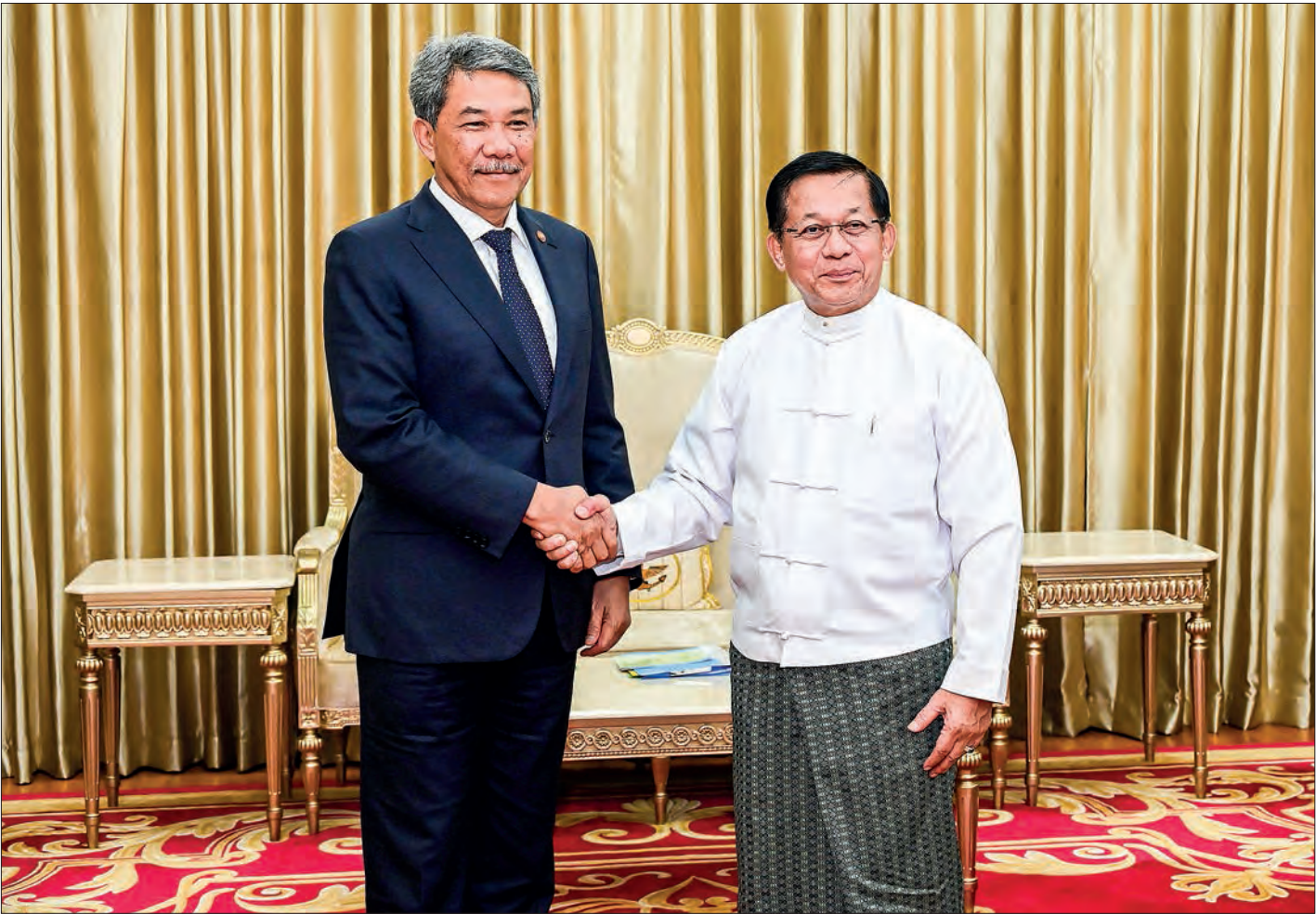
Acting President and State Security and Peace Commission Chairman Senior General Min Aung Hlaing shakes hands with Dato’ Seri Utama Haji Mohamad Bin Haji Hasan Minister of Foreign Affairs of Malaysia during the latter’s courtesy call on the former yesterday.

Fifty-seven political parties that have met all legal requirements are set to contest in the upcoming election, fielding more than 5,000 candidates nationwide.