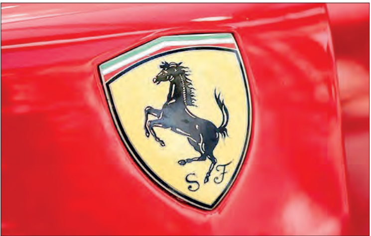
Luxury sports car manufacturer Ferrari will release its first electric vehicle next year.

Ferrari predicted revenue to grow by five per cent per year to reach 9.0 billion euros in 2030, with an adjusted operating profit of 2.75 billion euros. — AFP