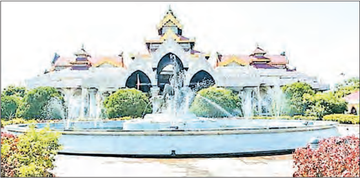
An entrance view to the Bagan Archaeological Museum.

THE archaeological museum in Bagan is planning to open on religious holidays as these days tend to attract many visitors, according to a museum official. Bagan is a popular tourist destination during the religious holidays and festivals, so the museum is arranging to remain open on all major holidays. “Mondays are the usual museum closing days. There are many visitors on religious holidays. It’s now open season, which means there’s an increase in tourist traffic to Bagan and the museum this month. We will submit a proposal for the opening of the Bagan Archaeological Museum on those religious holidays,” a museum official told The Global New Light of Myanmar (GNLM). Last weekend, the number