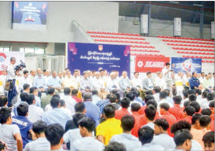
This photo captures the Myanmar football family’s respect-paying ceremony to seniors.

This image displays a promotional poster for the 5 Ladies Show musical concert. Gallery Nay Pyi Taw by Sofitel at 6 pm on 25 October. Melody Marvel Productions announced that tickets are available in three categories – Standing, VIP, and VVIP – and include dinner privileges. — ASH/KZL